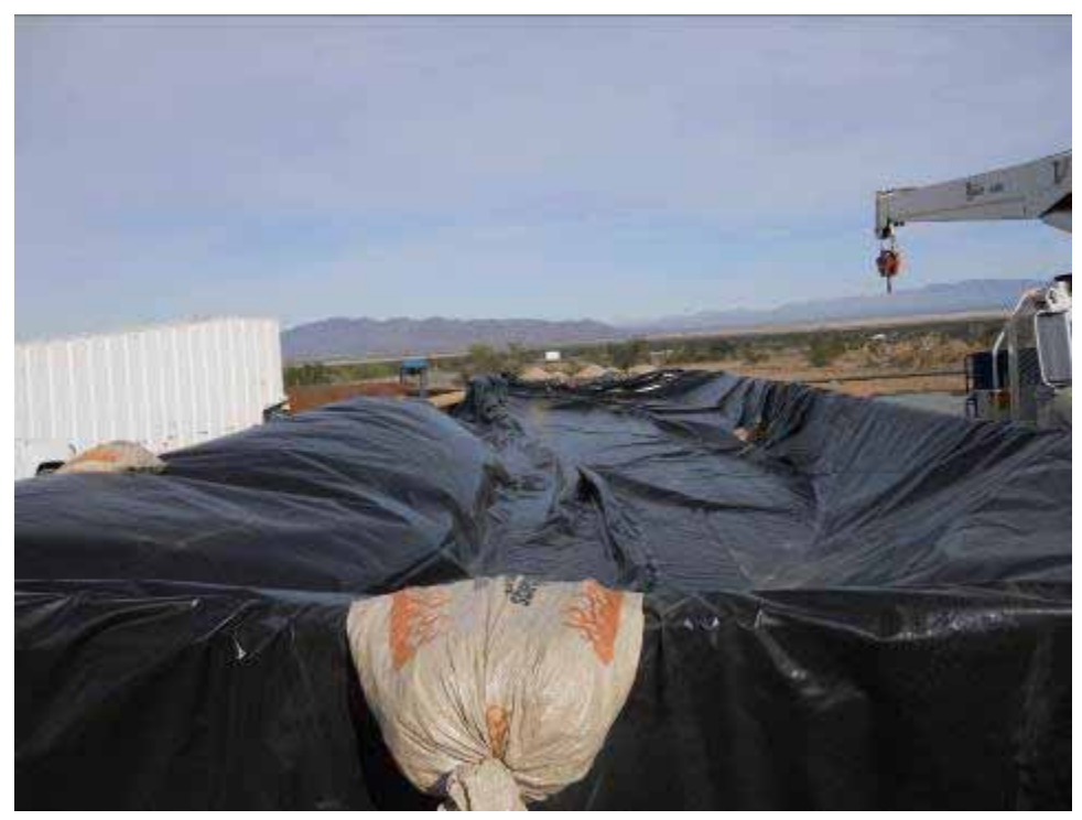
Figure 7: Mud tank that was uncovered at Red Bluff Substation (Figure 6) later covered with plastic sheeting.