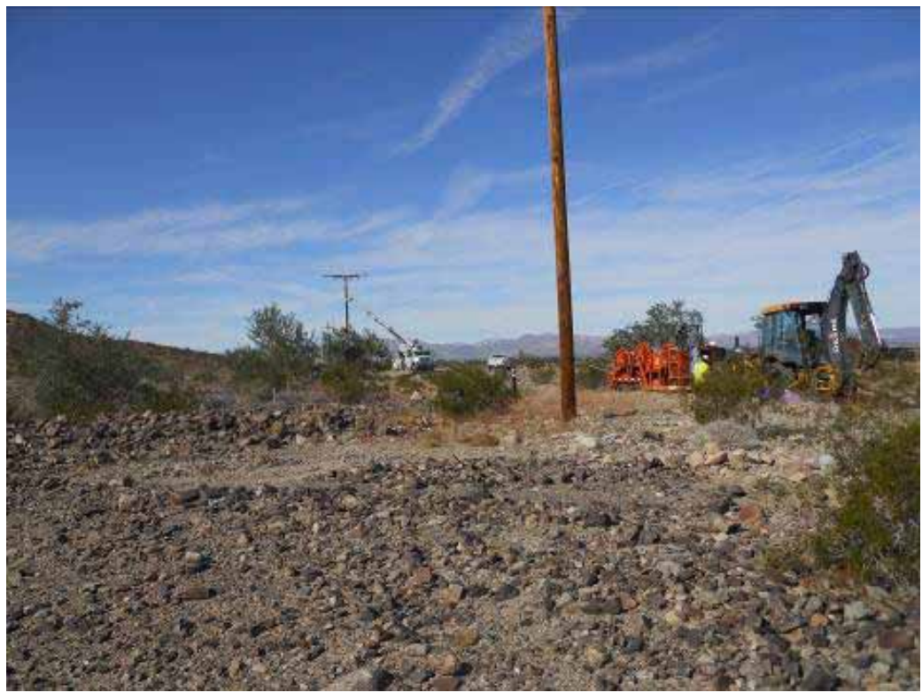
Figure 5: Line crew stringing wire along the Red Bluff distribution line on BLM lands.