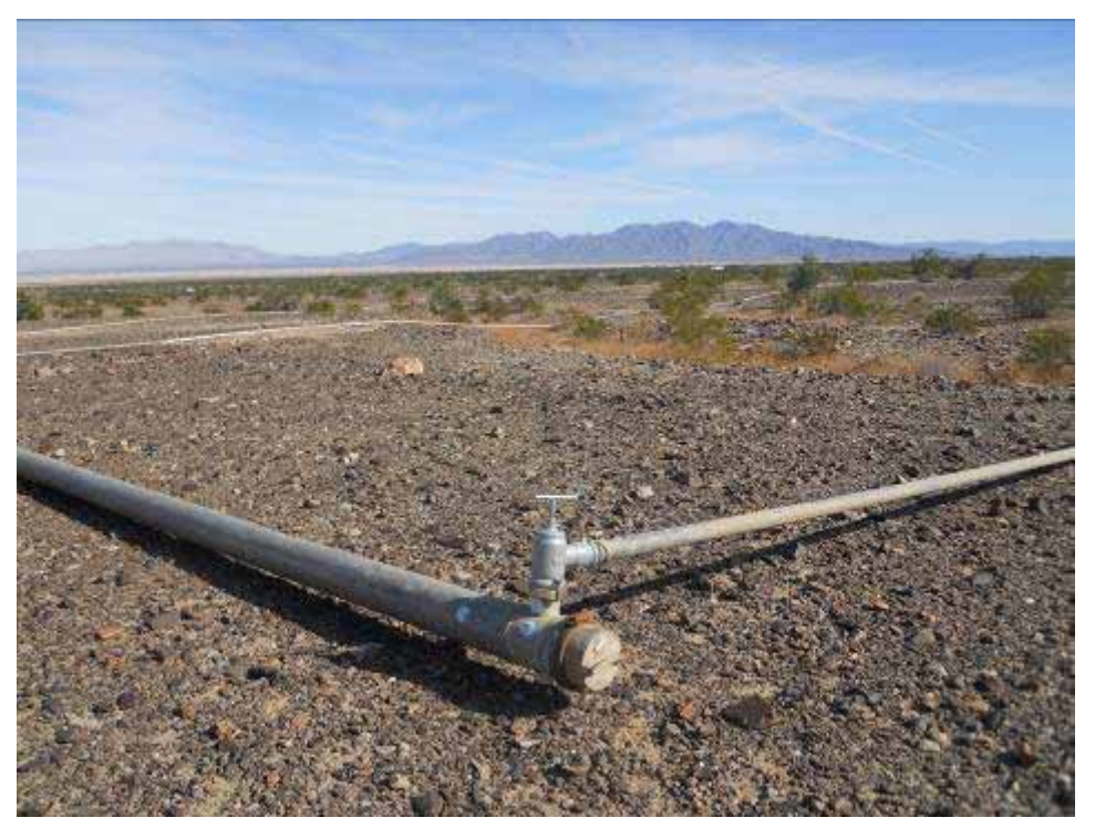
Figure 4: Sprinkler system installed at Red Bluff Substation site to control water well release flows.