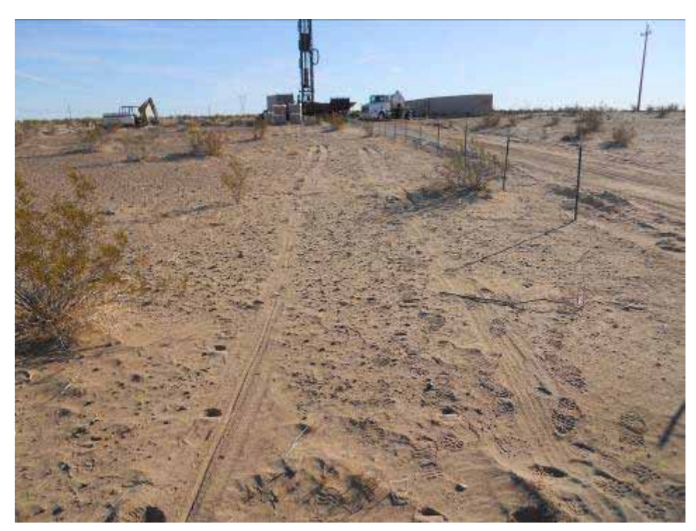
Figure 2: Second location where security guard drove outside of disturbance limits at CRS site. Tracks extend for approximately 500 feet along northern edge of defined access road and exclusionary fencing.