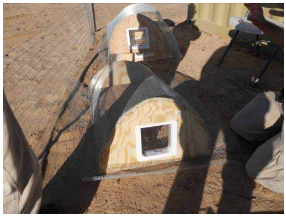
Figure 3: Structures designed by SCE kit fox biologists to exclude kit foxes from active burrows at CRS site.