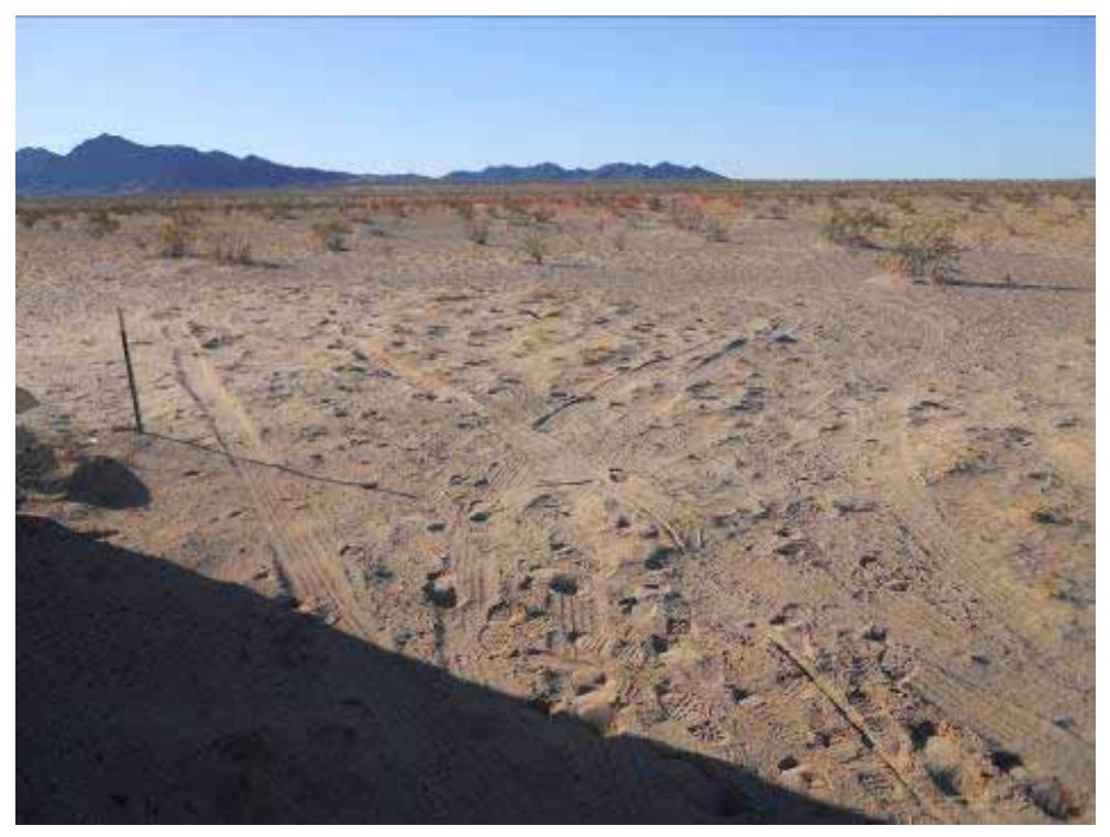
Figure 1: Tire tracks left by security guard outside of disturbance boundaries at CRS. Note direction of tracks as the vehicle made a U-turn approximately 40 feet from access road limits.