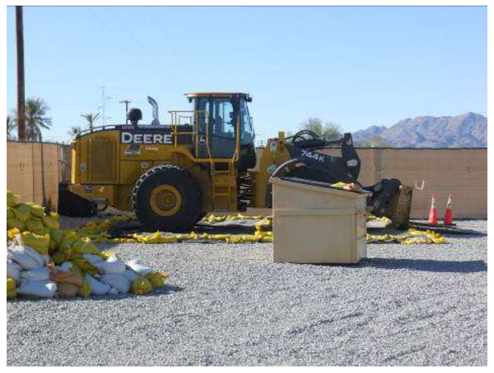
Figure 2: Heavy equipment parked on plastic sheeting and secured trash containers at the Desert Center #1 Construction Yard.