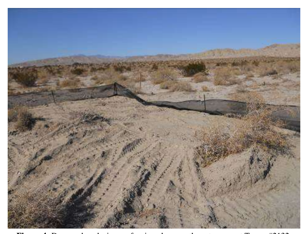
Figure 4: Damaged exclusionary fencing along northwest corner at Tower #2132.