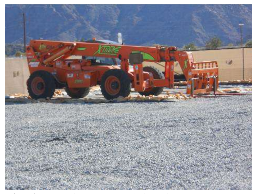
Figure 3: Heavy equipment parked on plastic sheeting at the Desert Center #2 Construction Yard.