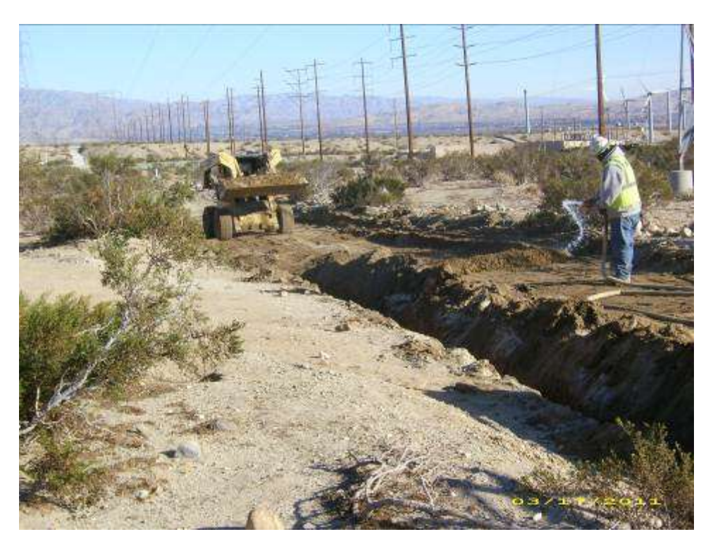
Figure 1: Major construction activities associated with the underground temporary power at the Devers #1 Construction Yard.