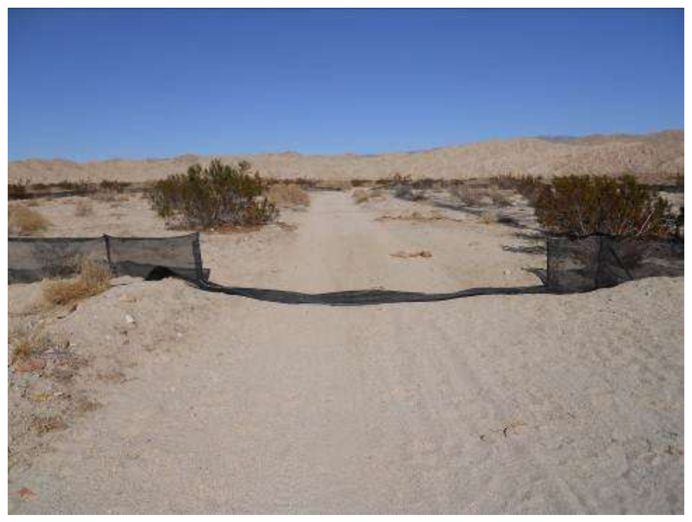
Figure 5: Damaged exclusionary fencing at entrance gate and along back northern boundary at Tower #2133.