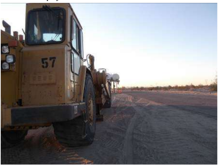
Figure 7. Articulated water truck parked in unapproved area near water tank stand location on Chuckwalla Road. Note the absence of drip pan.