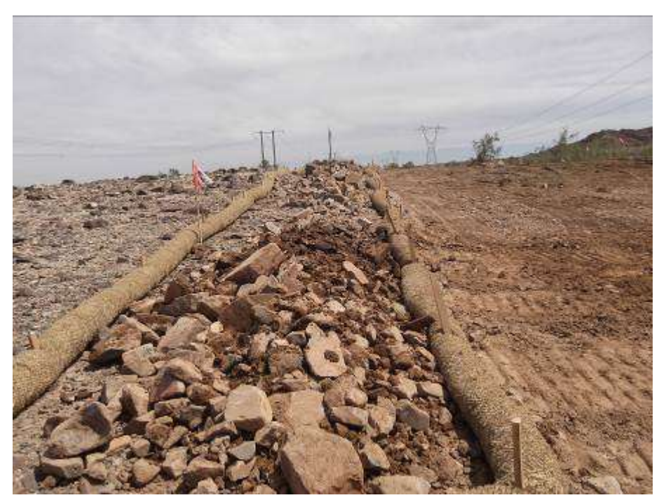
Figure 2. Area defined by BMP boundaries for desert pavement salvage at Tower 2529.