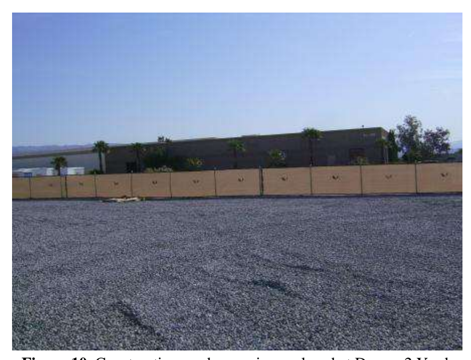
Figure 10. Construction yard screening replaced at Devers 2 Yard.