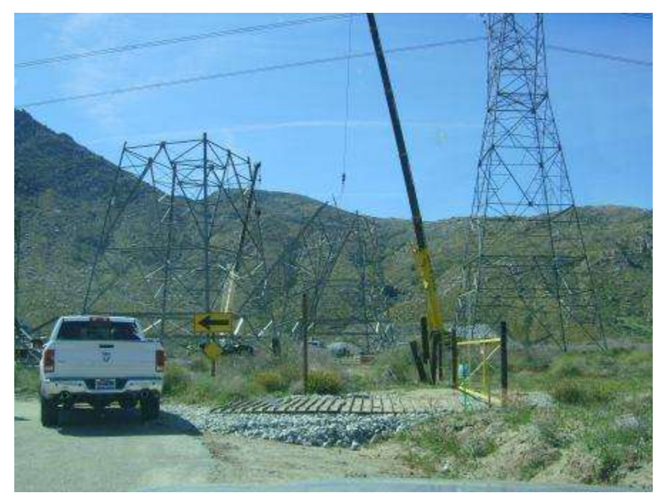
Figure 4. Tower Assembly at Tower 1062 using large crane.