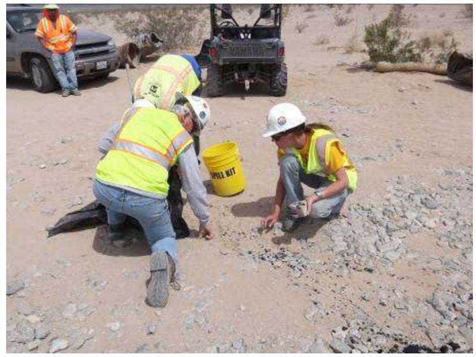
Figure 9. Construction and monitoring personnel removing contaminated soil and rocks from asphalt emulsion spill site along CRS access road.