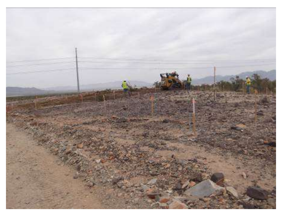
Figure 1 . Initiation of desert pavement removal at Tower 2529.