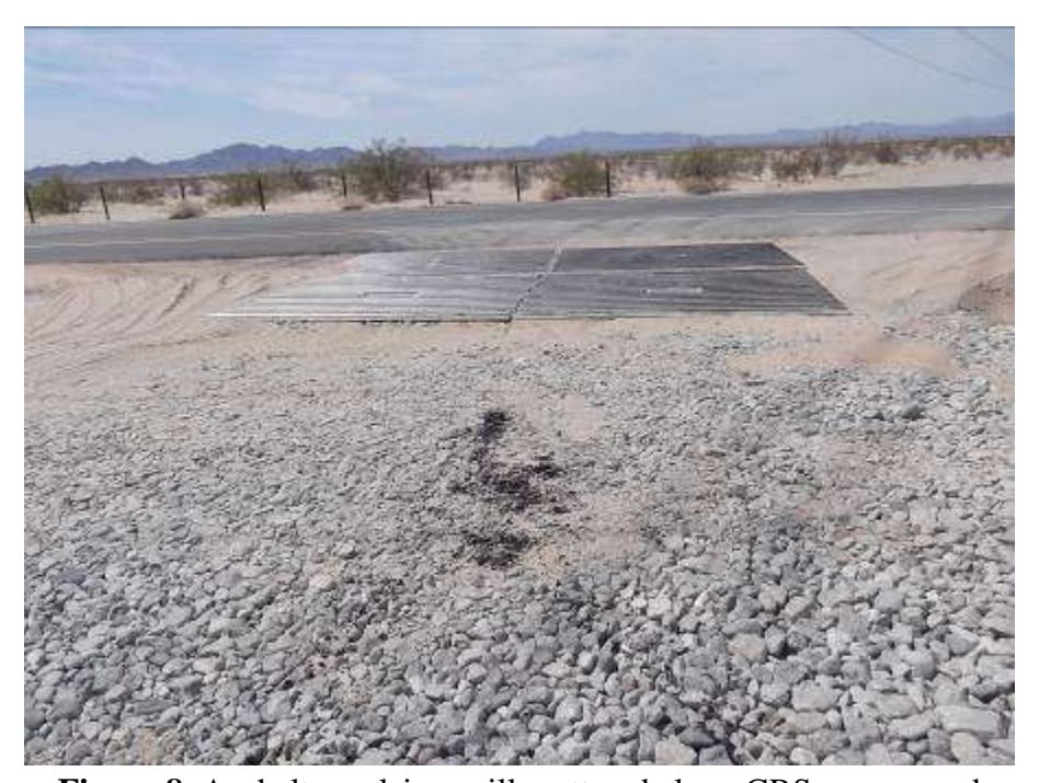
Figure 8. Asphalt emulsion spill scattered along CRS access road near ingress/egress.