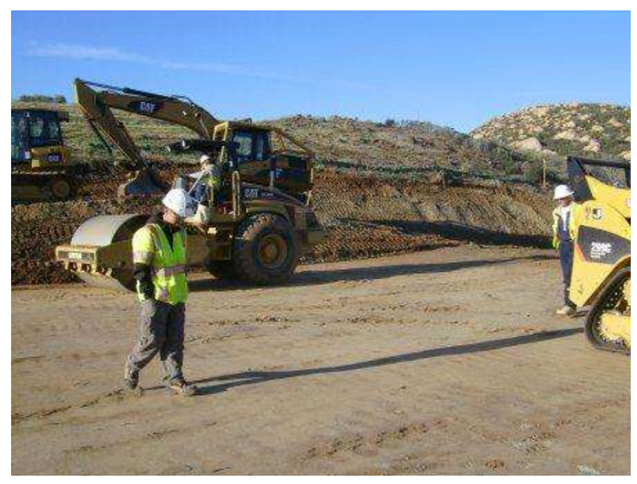
Figure 3. Spur road and crane pad grading at Tower 1091.