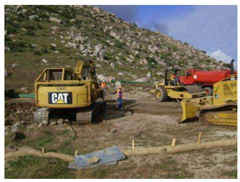
Figure 3. Crane pad grading at Tower 1073.