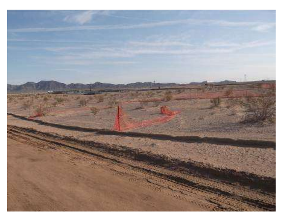
Figure 4. Damaged ESA fencing along CRS Loop-In access road.