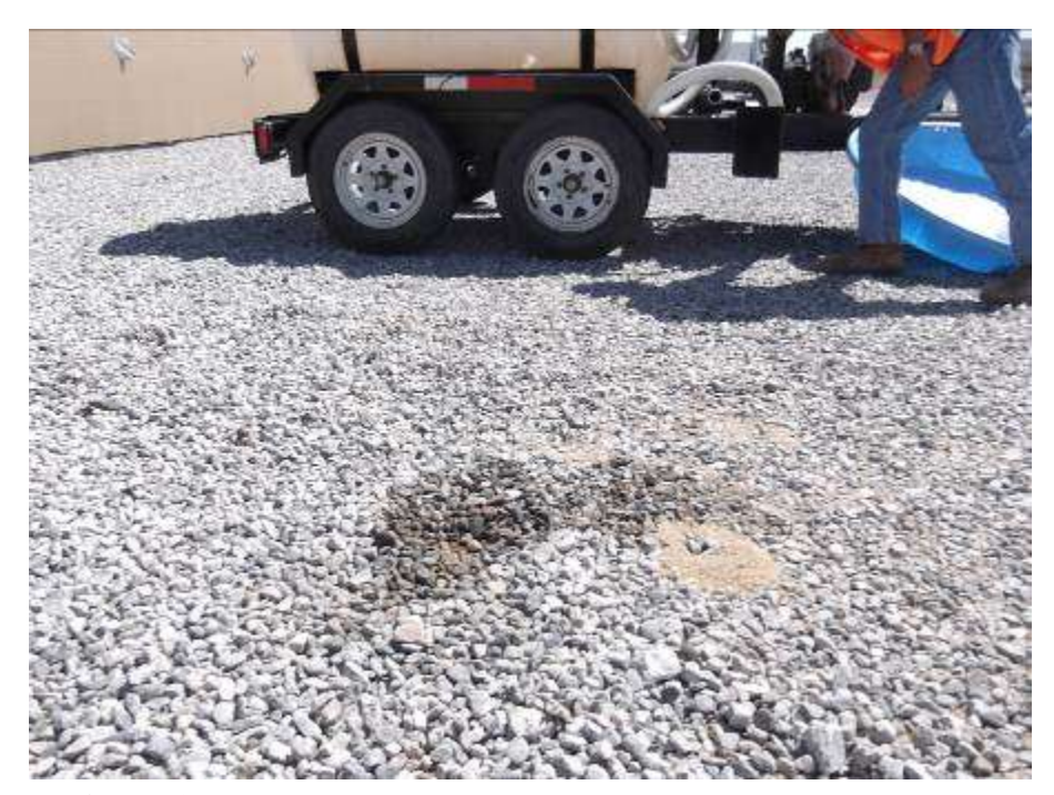
Figure 10. Minor motor oil spill that had not been removed at the Summit Construction Yard.