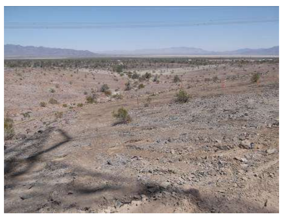
Figure 2. Desert pavement removal nearly completed at Tower 2530. Note areas of desert pavement left onsite for avoidance.