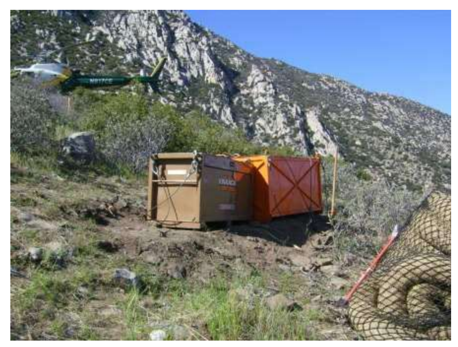
Figure 5. Appropriate fire tools per USFS Fire Plan onsite at Tower 1042 during vegetation clearing activities.