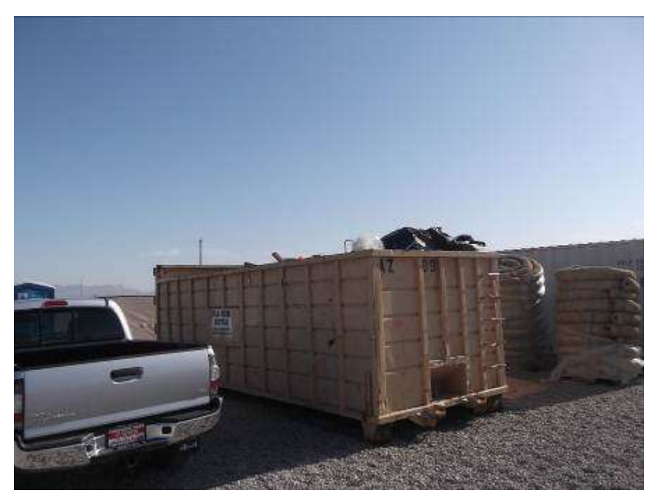
Figure 9. Large trash receptacle with no covering at Blythe Construction Yard.