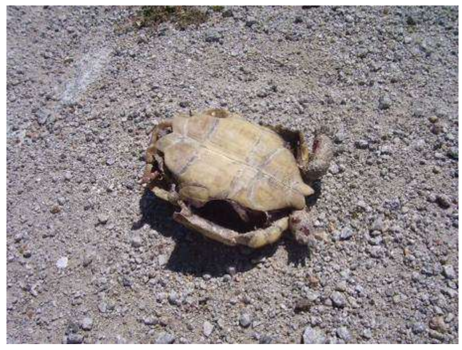
Figure 7. Desert tortoise mortality near Tower 2412 reported by SCE Biological Monitors, determined to be non-project related.