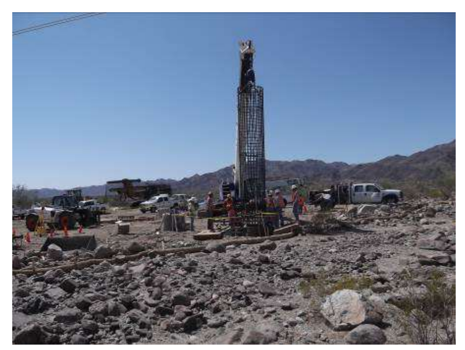
Figure 1. Concrete pouring activities at Tower RB1-5E.