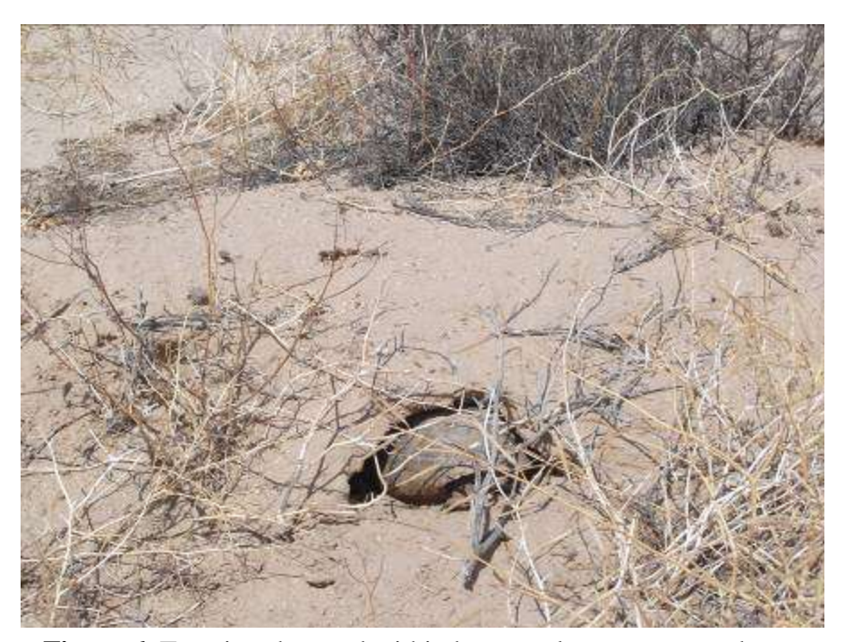
Figure 6. Tortoise observed within burrow along access road near Tower 2441.