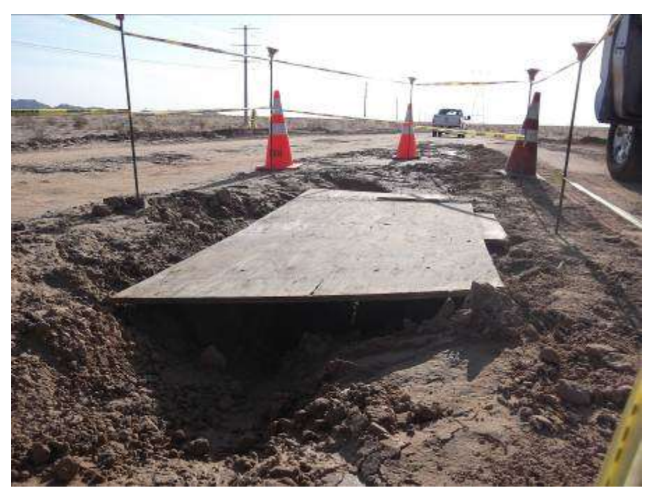
Figure 8. Inadequate trench covering observed by CPUC EM along CRS primary access road.