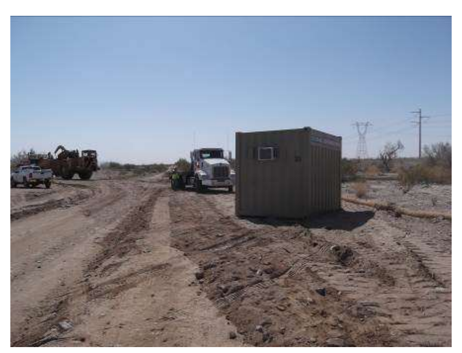
Figure 10. Temporary guard structure installed at intersection of Corn Springs Road and ROW access road.