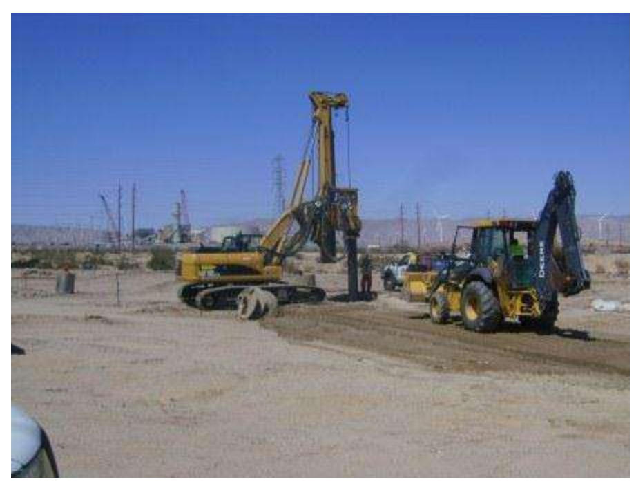
Figure 3. Foundation excavation drilling at Tower 1002.