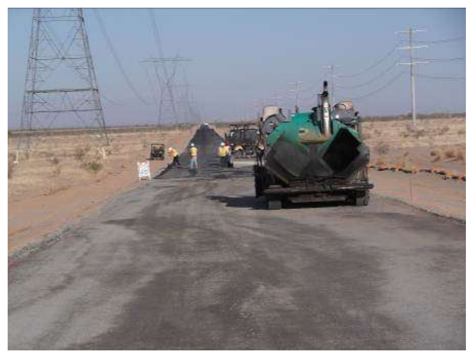
Figure 9. Road paving activities along the primary CRS access road.