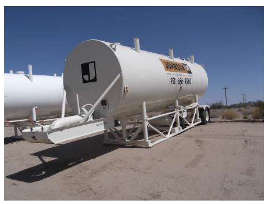
Figure 6 . Water stand tanks staged at Tower 2443ALT with no secondary containment.