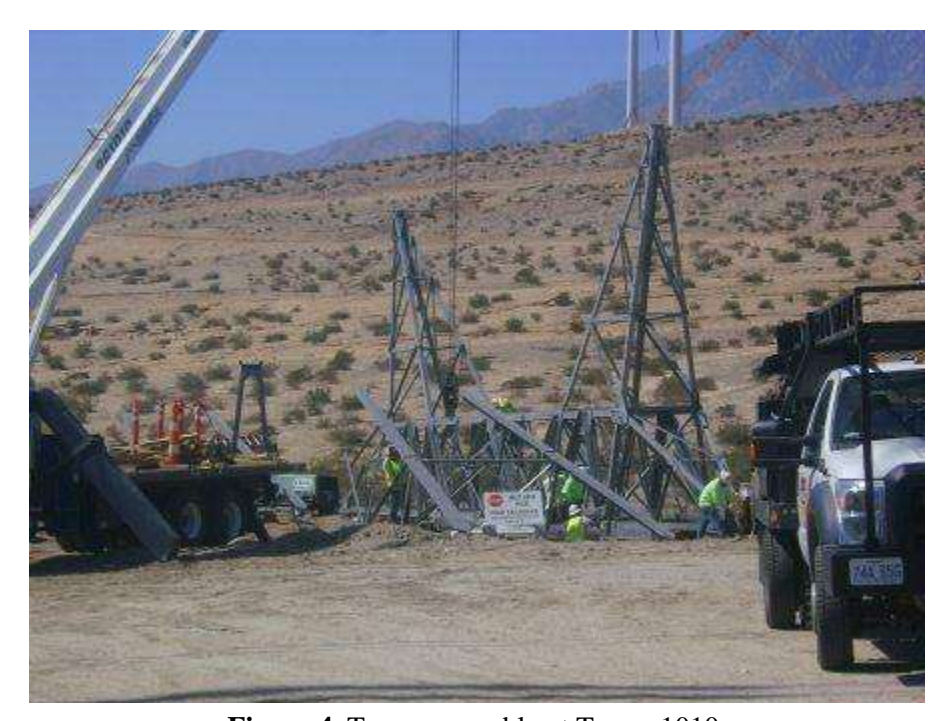
Figure 4. Tower assembly at Tower 1010.