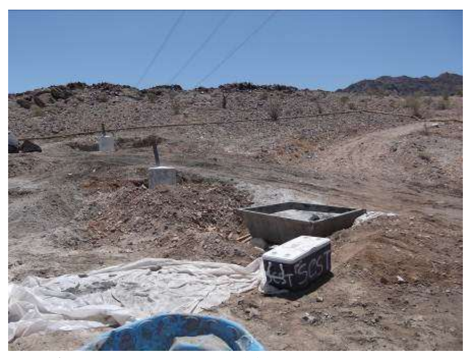
Figure 7. Concrete washout tub left uncovered at Tower 2518.