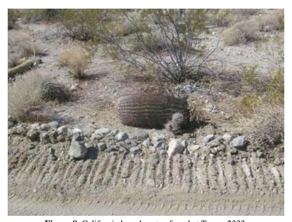
Figure 8. California barrel cactus found at Tower 2333.