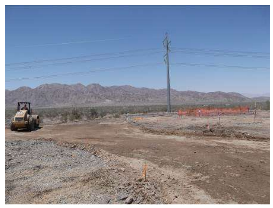
Figure 5. Grading activities occurring while avoiding ESA (right of photo) at Tower 2454.