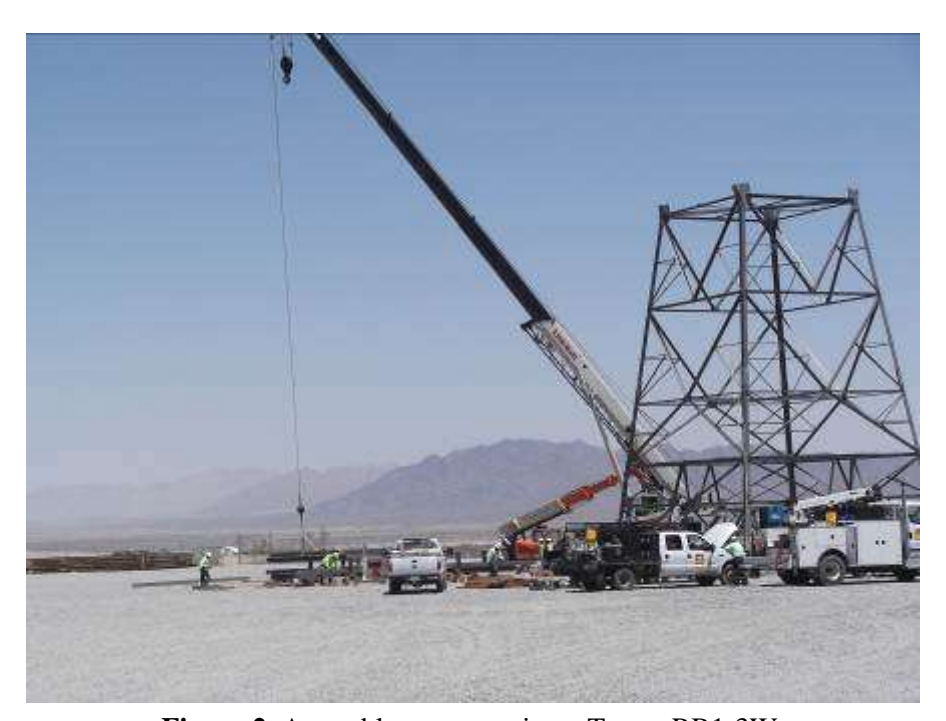
Figure 2 . Assembly crews onsite at Tower RB1-3W.