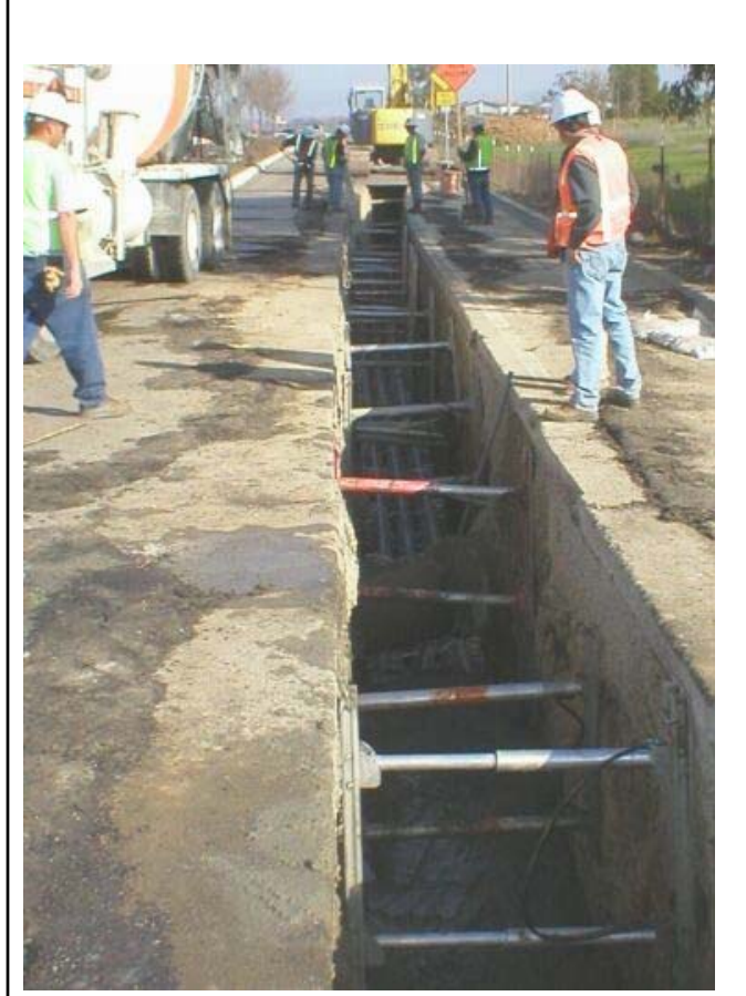
Trench in street. Conduit for individual transmission cables visible in center of photo.