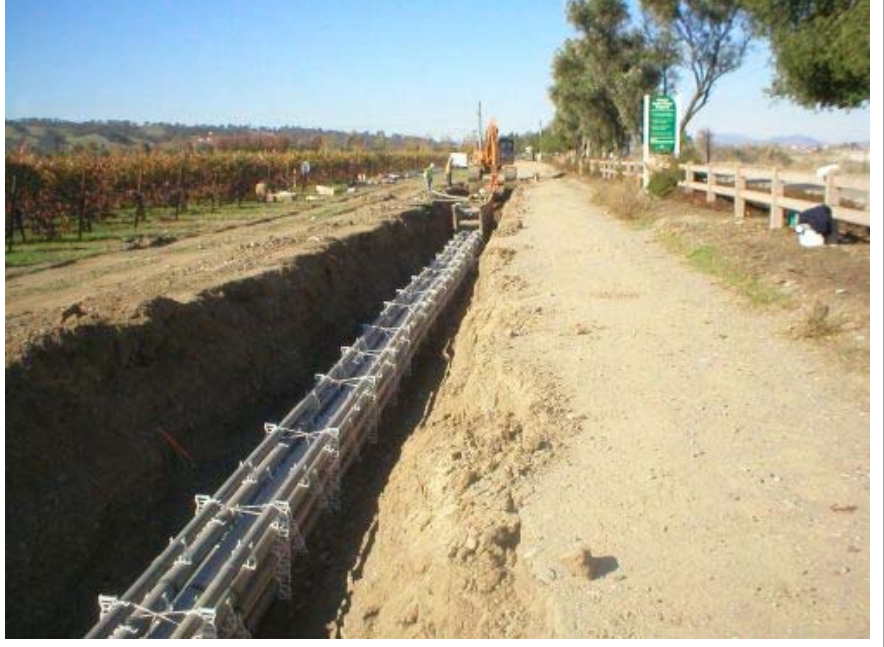
Double-circuit 230 kV underground cable conduit with spacers prior to pouring of concrete duct bank.