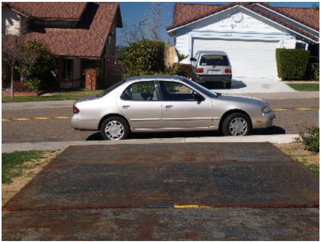
Figure 4 – The access to Pole Site 481 continues to be blocked by local residents. The CPUC EM has requested protection be added to the edge of the steel plating.