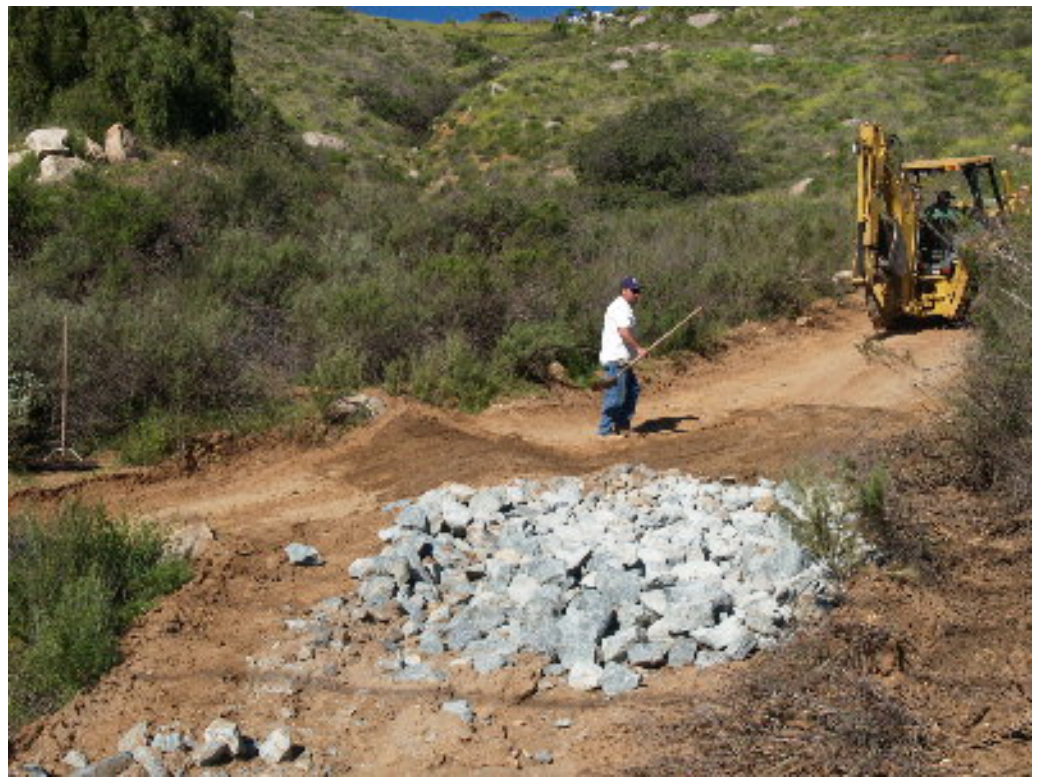
Figure 5 – DMX worked to improve BMPs at Pole Site 440. The maintenance of the rock sediment traps is a concern.