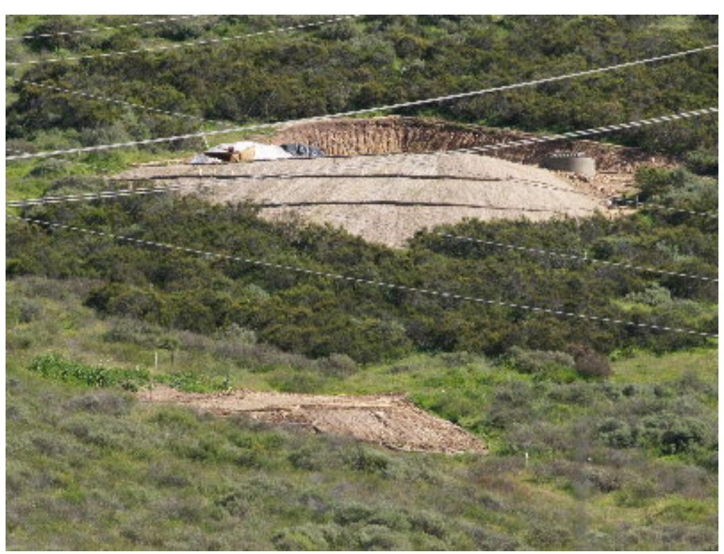
Figure 6 – DMX improved the BMPs at Pole Site 10. Additional work may be required at the pad for Poles 5 and 7.