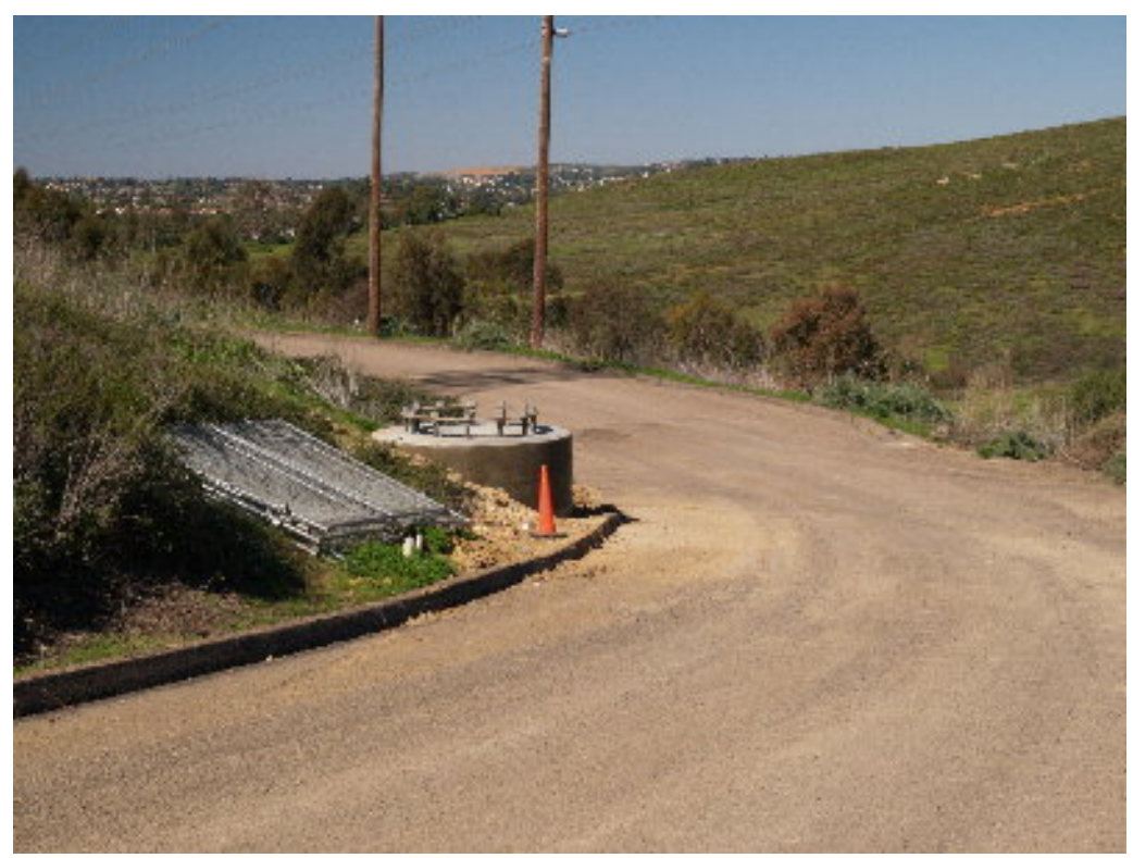
Figure 7 – The majority of the mud from the drilling operation has been cleaned from the asphalt access road at Miguel Substation.