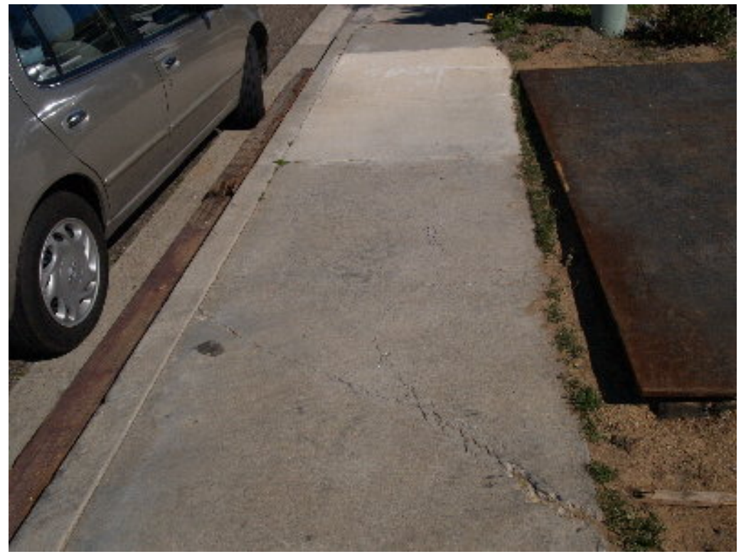
Figure 3 – The sidewalk at the SDG&E access to Pole Site 481 along with any impacts outside the access easement, will be repaired at the end of the project.