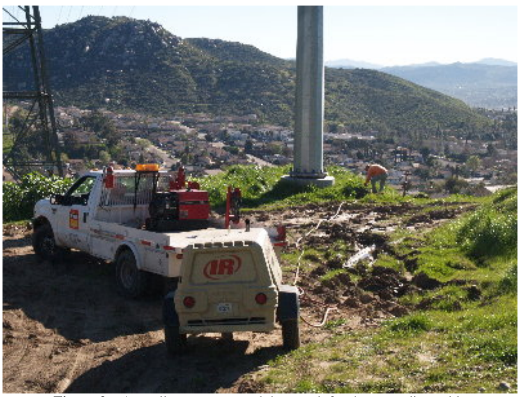
Figure 2 – A small crew excavated the trench for the grounding cable above the Summit Road yard.