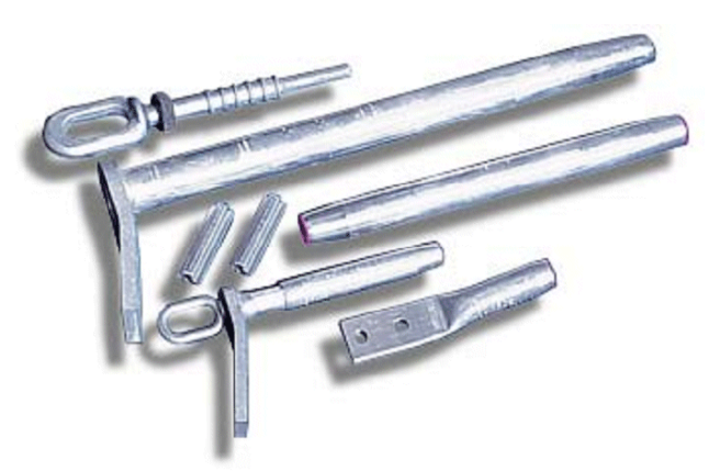
Figure 2: ACA Compression-Type Hardware

The compression-type hardware from ACA uses a modified two-part approach for separate gripping of the core and then an outer sleeve to grip the aluminum strands, as shown in Figure 2. This approach is similar to the approach used in ACSS, although modified to prevent crushing, notching, or bending of the core wires. The gripping method ensures the core remains straight, to evenly load the wires, and also ensures that the outer aluminum strands suffer no lag in loading relative to the core.