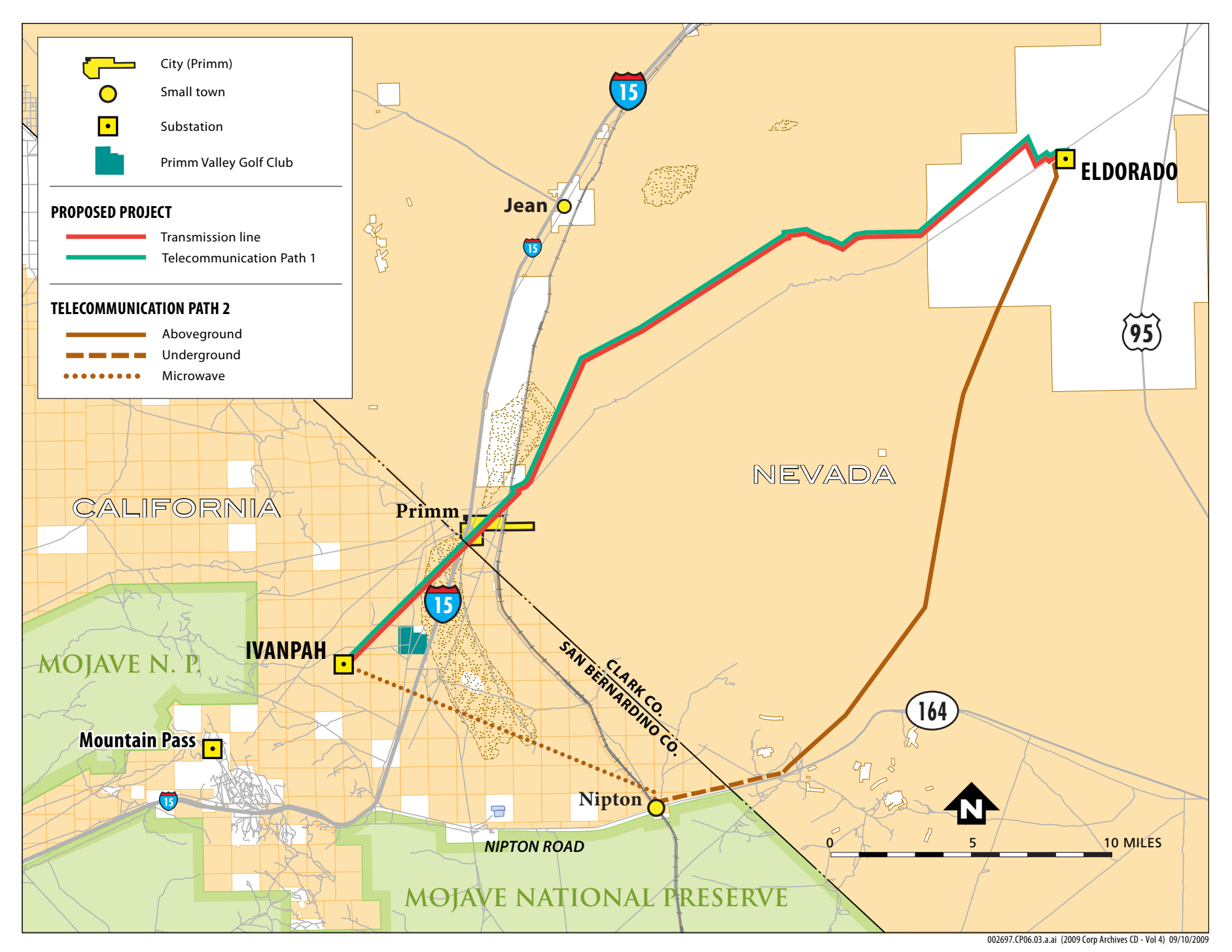
Figure 1 PROPOSED PROJECT