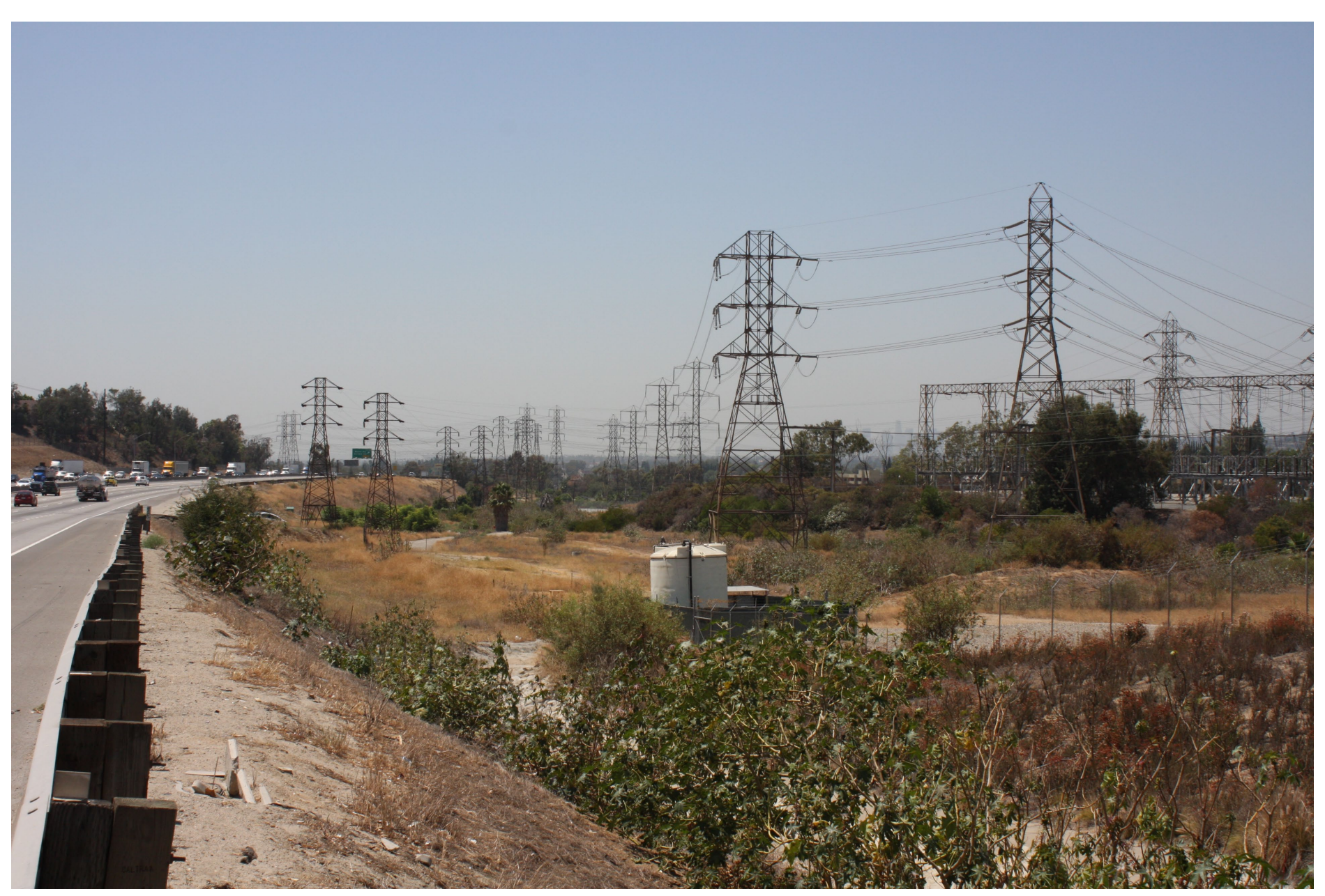
KOP 6 – Existing view from westbound State Route 60 near Greenwood Avenue