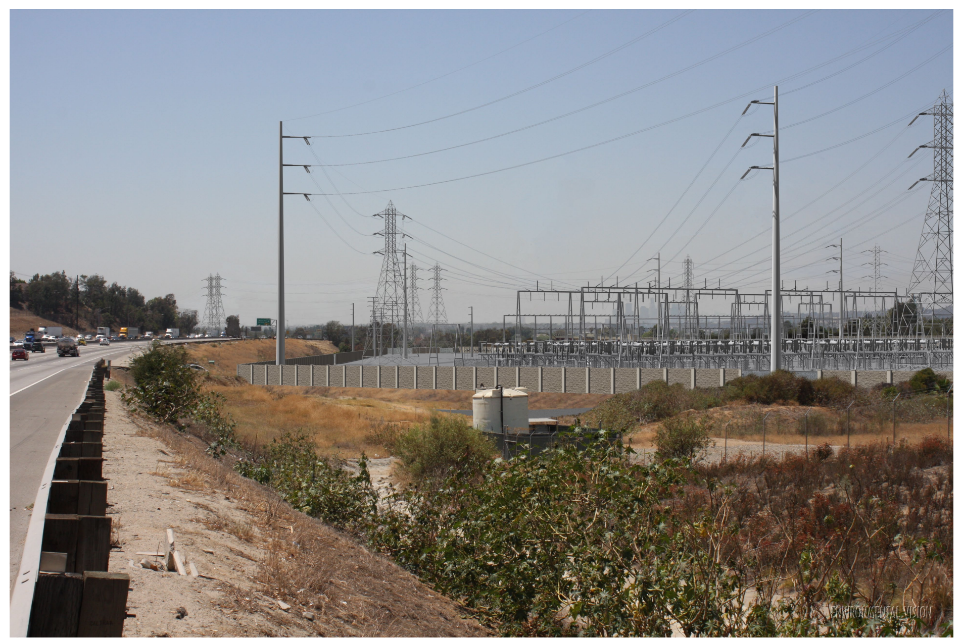
KOP 6 – Visual simulation of the Proposed Project

Note: Visual simulation revised June 2016 with updated project data