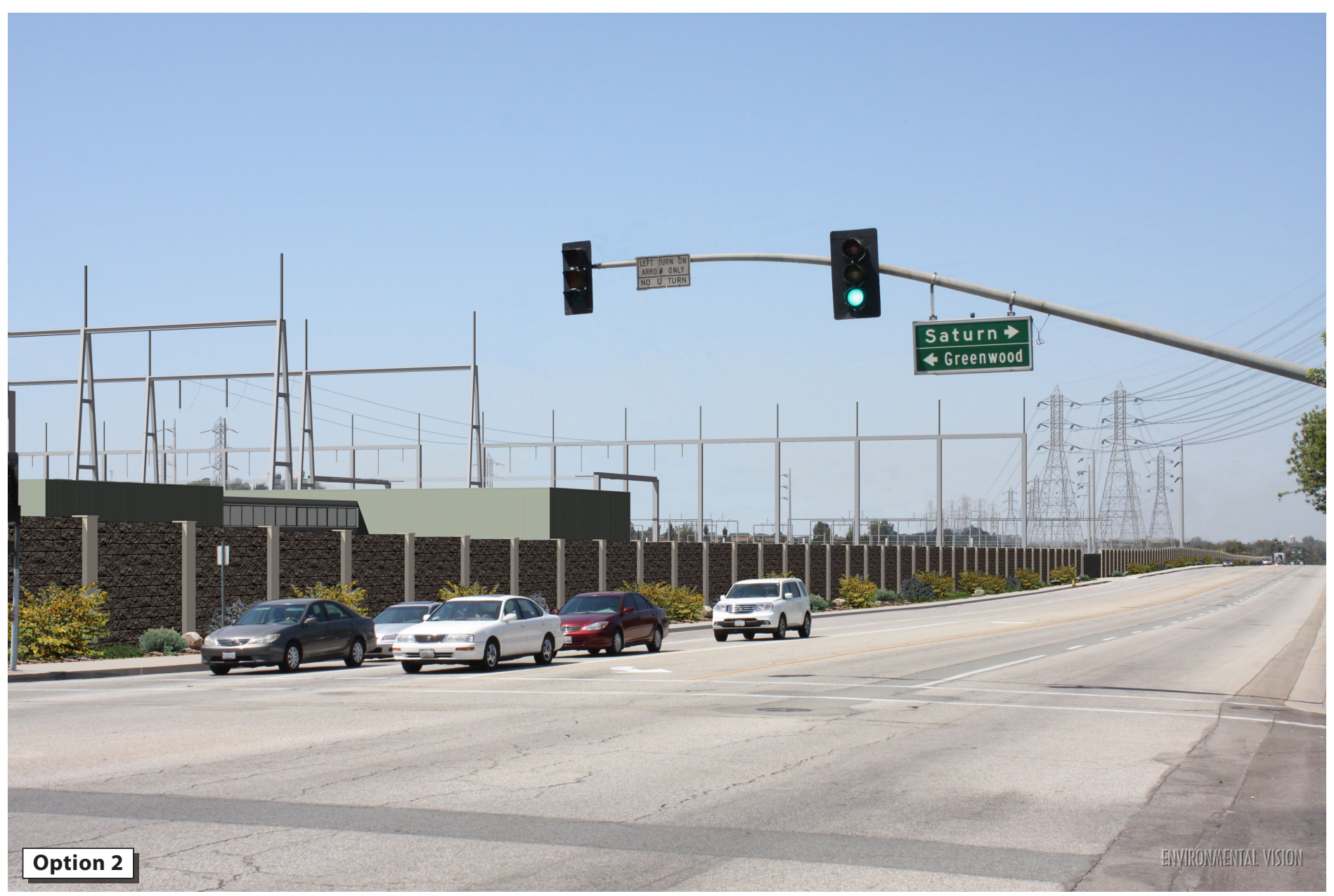
KOP 3 – Visual simulation of the Proposed Project with shrub and groundcover landscaping

Note: Visual simulation revised June 2016 with updated project data