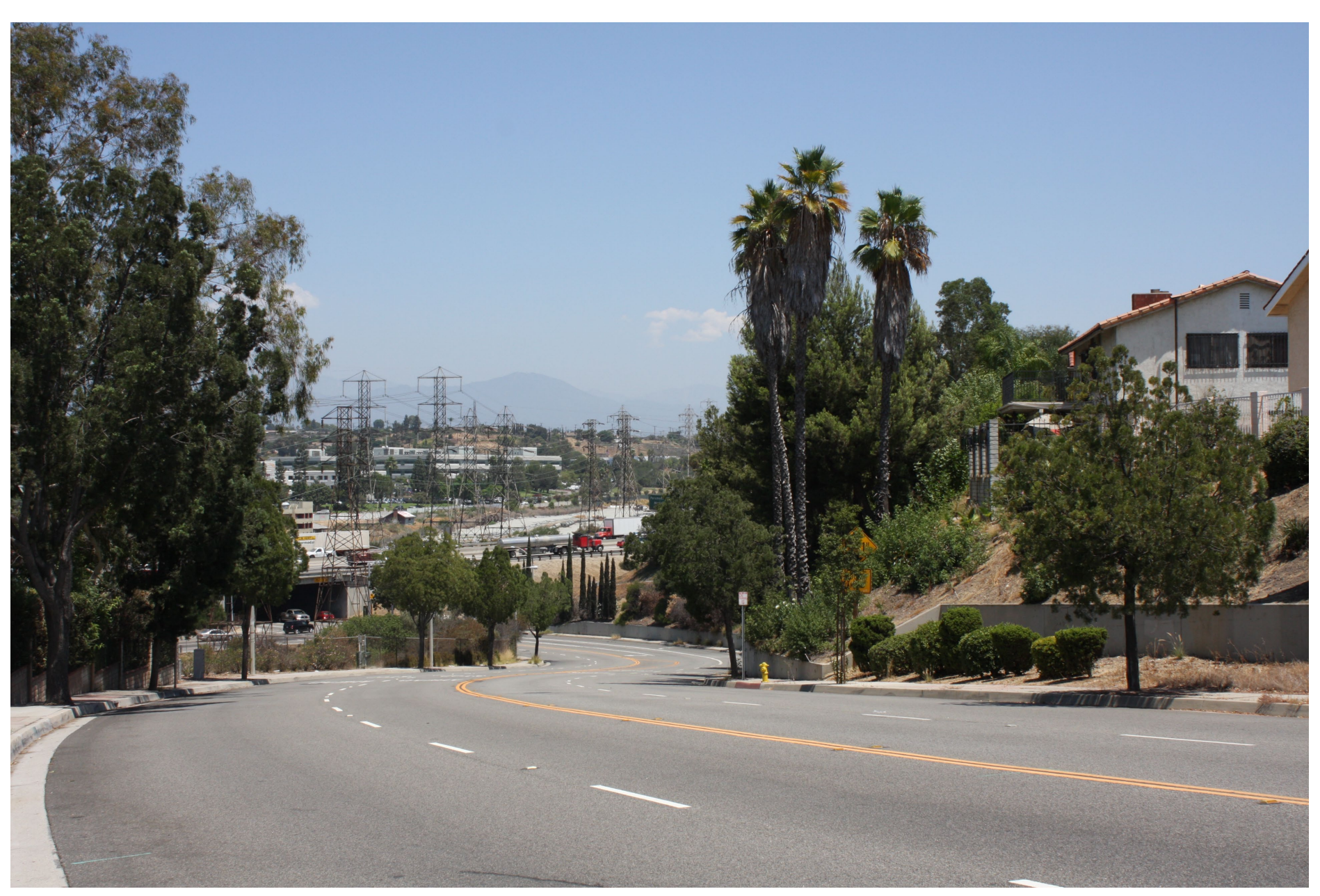
KOP 7 – Existing view from North Vail Avenue near Appian Way looking northeast