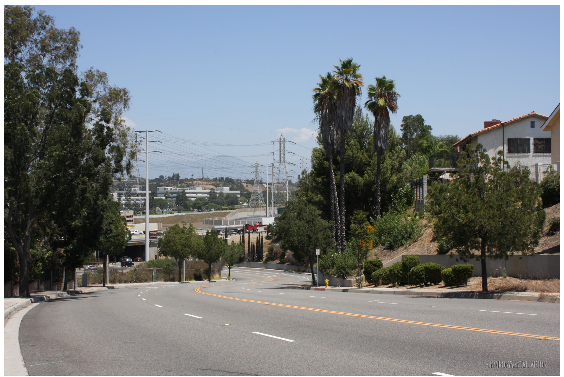
KOP 7 – Visual simulation of the Proposed Project

Note: Visual simulation revised June 2016 with updated project data