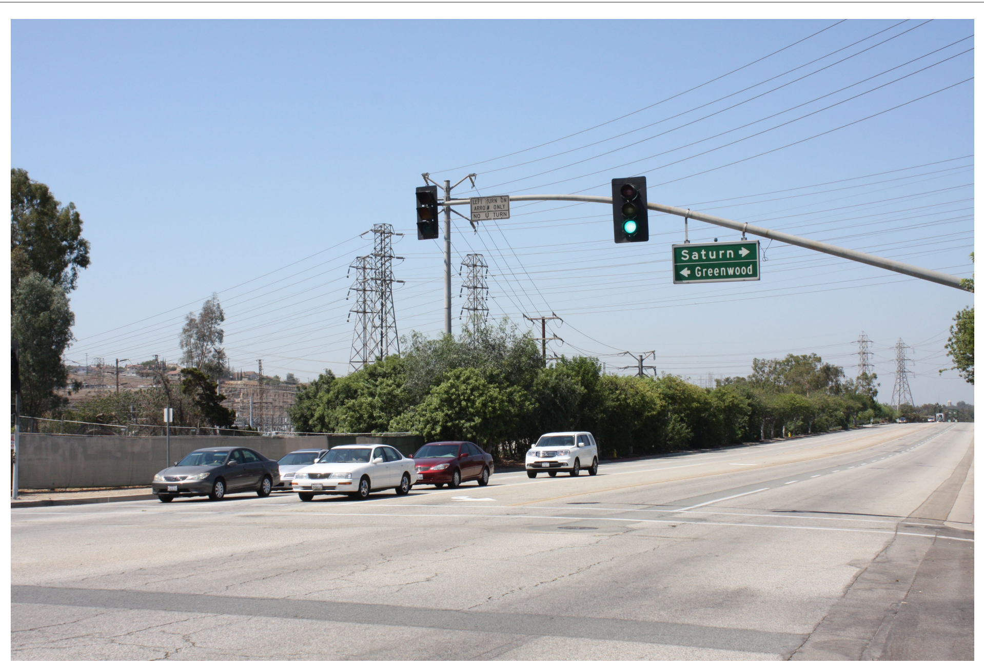
KOP 3 – Existing view from Potrero Grande Drive at Saturn Street looking southwest