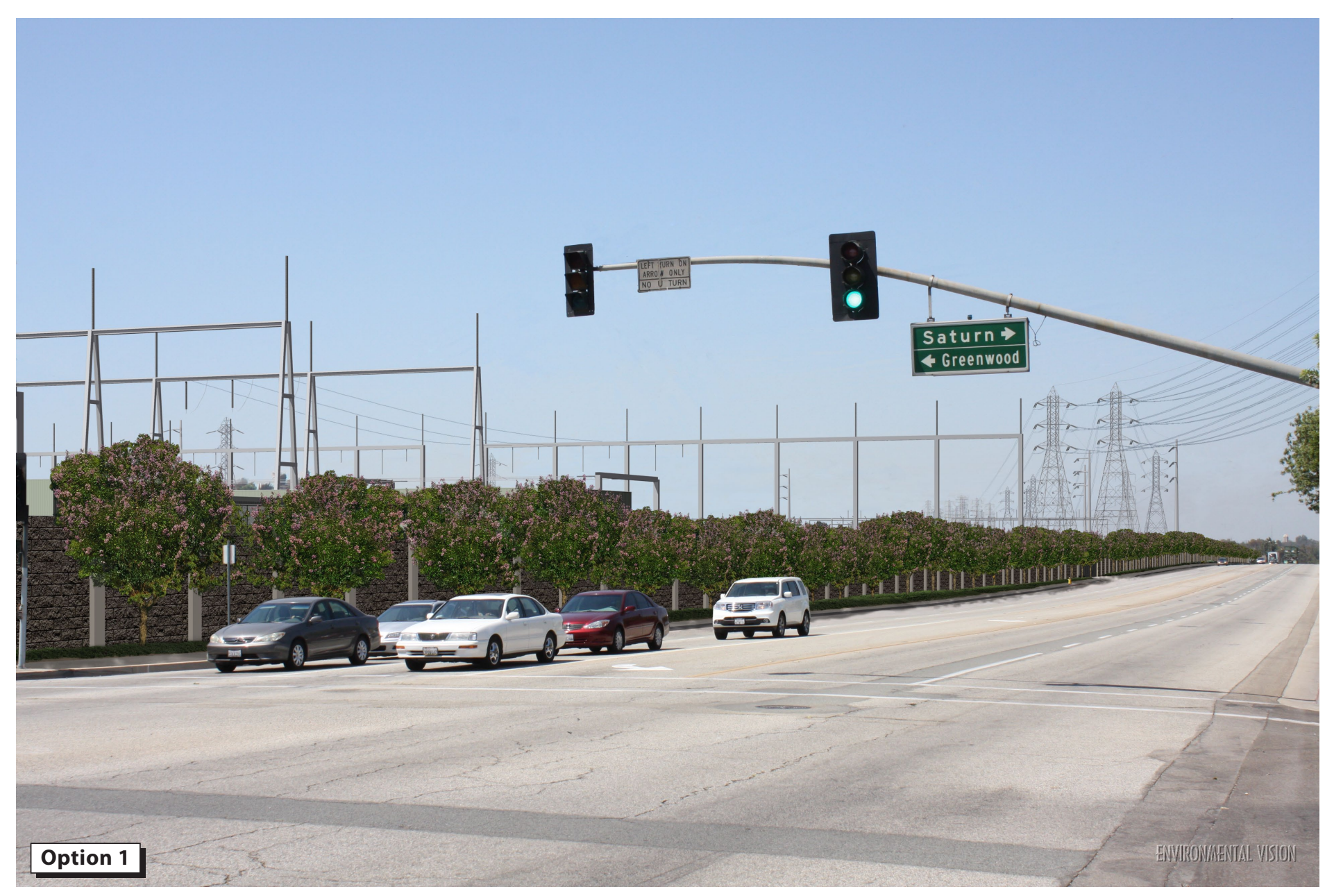
KOP 3 – Visual Simulation of the Proposed Project Note: Visual simulation revised June 2016 with updated project data