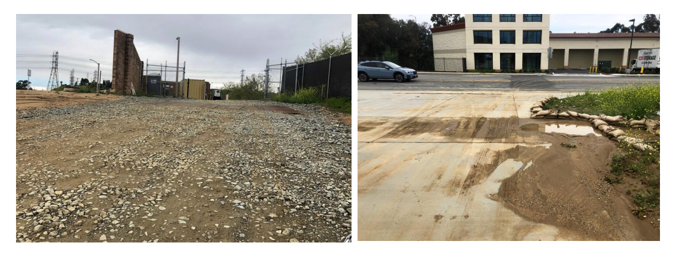
Photo 1: Rock portion of the exit/entry BMP at the eastern entrance to the project site on April 7, 2020. Photo facing north.

Photo 2: Muddy track out at the western project entrance on April 7, 2020. Photo facing west.