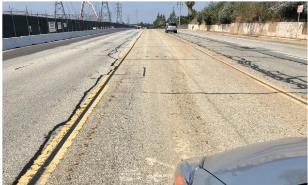
Photo 6: Muddy track out on Potrero Grande Road on July 21, 2020. Photo facing west.