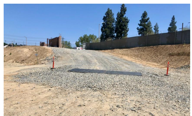
Photo 8: Additional BMPs added to the eastern project entrance, July 21, 2020. Photo facing west.