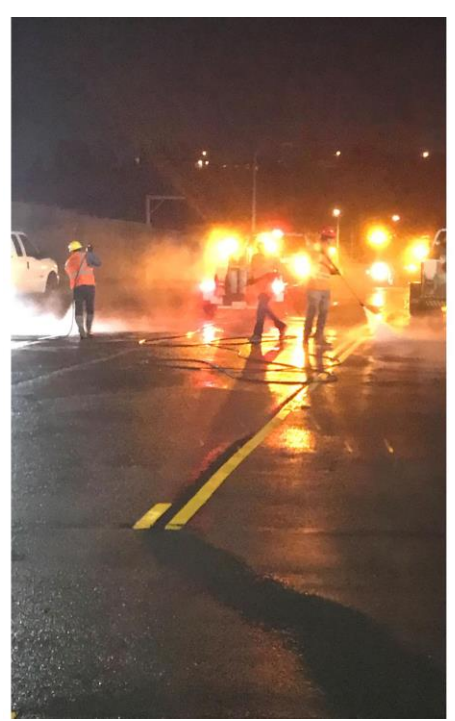
Photo 4: Market Place Drive being power washed from top (by Costco) down to Potrero Grande, July 20, 2020.