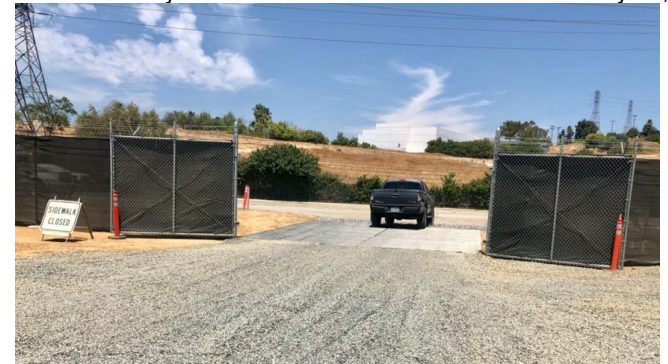
Photo 7: Northern entrance with exit/entry BMPs in place, July 21, 2020. Photo facing north.

Mesa Substation Expansion Project NCR-005 Page 11 of 13