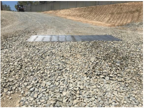
Photo 11: Market Place Drive entrance after rock was redistributed and leveled with additional plate placed over top, July 23, 2020.