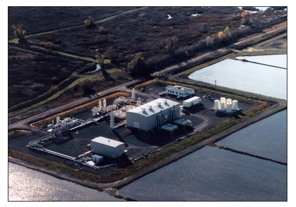
Figure 1.2-1: Remote Facility Site