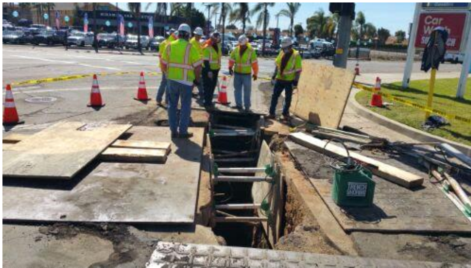
Caption Shoring trench at Kearney Mesa Road.

Photo Attributes Capture Date/Time: Tue Mar 06 2018 12:56:43 GMT-0800 (PST) Coordinates: 32.894054, -117.11846 View Direction: South