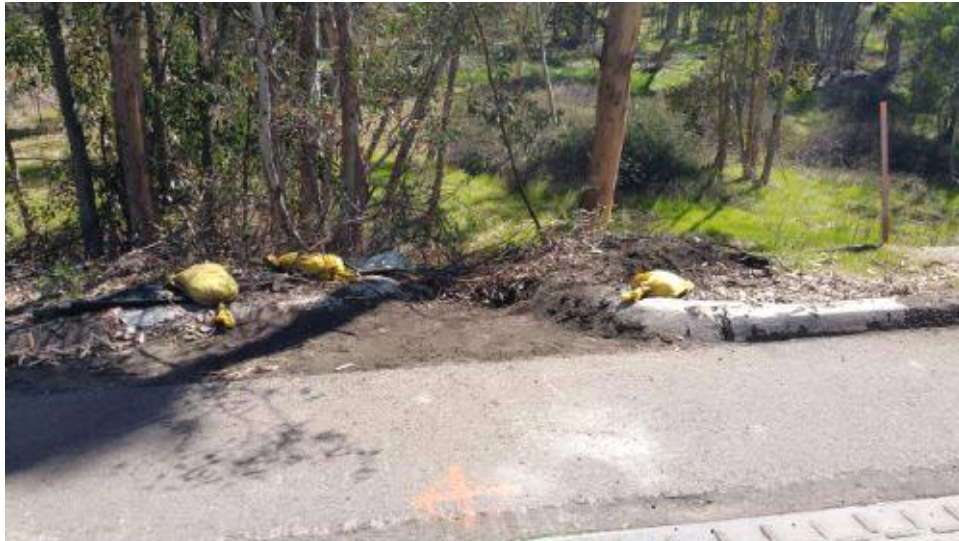
Caption Erosion control BMPs not in place at Station 435+00 on Pomerado Road.

Photo Attributes Capture Date/Time: Tue Mar 06 2018 12:12:24 GMT-0800 (PST) Coordinates: 32.895358, -117.107843 View Direction: South