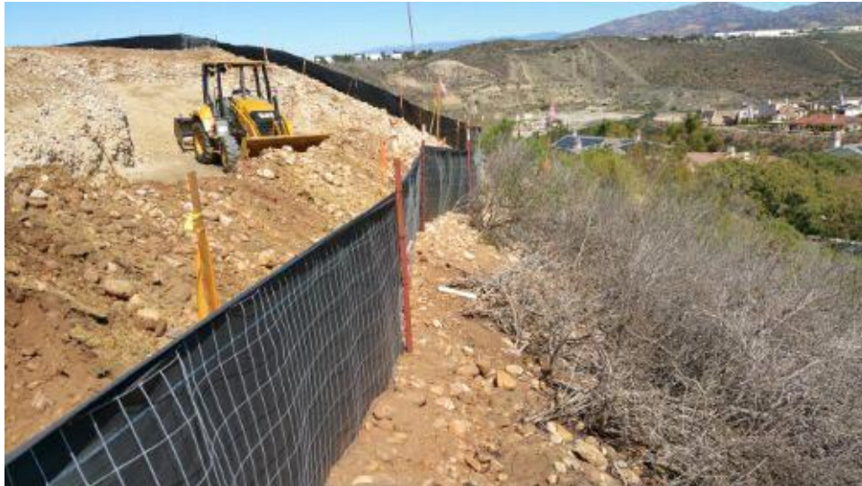
Caption Silt fencing intact at PO5.

Photo Attributes Capture Date/Time: Tue Mar 06 2018 11:40:59 GMT-0800 (PST) Coordinates: 32.922517, -117.042375 View Direction: North