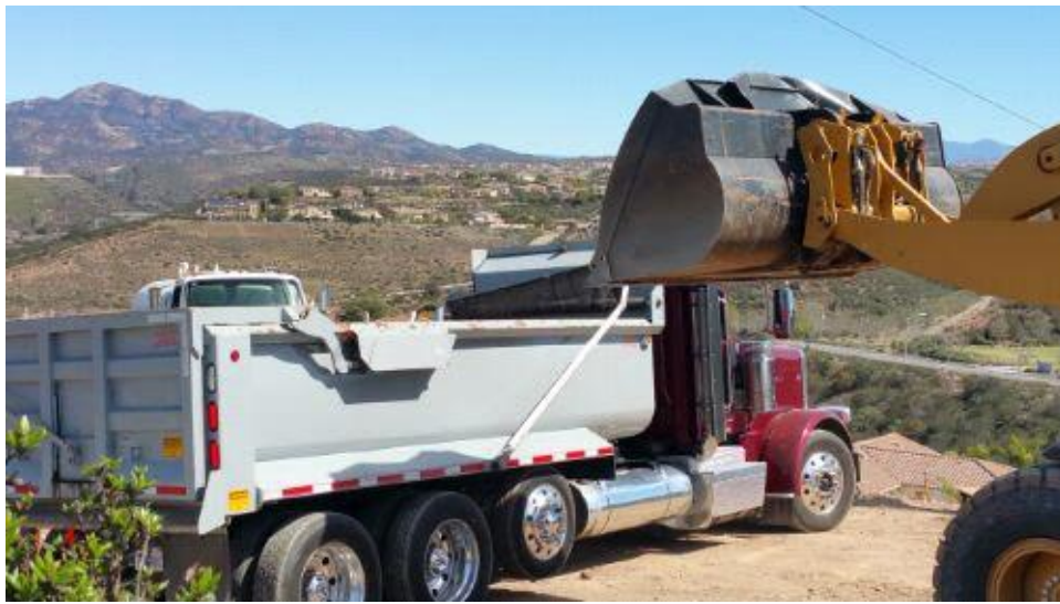
Caption Soil transport trucks with moveable cover.

Photo Attributes Capture Date/Time: Tue Mar 06 2018 11:38:20 GMT-0800 (PST) Coordinates: 32.922701, -117.042612 View Direction: Northeast