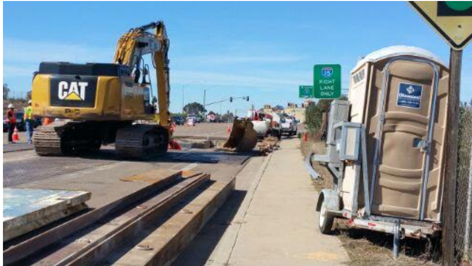
Caption Vault work on Pomerado Road.

Photo Attributes Capture Date/Time: Tue Mar 06 2018 10:08:40 GMT-0800 (PST) Coordinates: 32.894025, -117.111357 View Direction: West