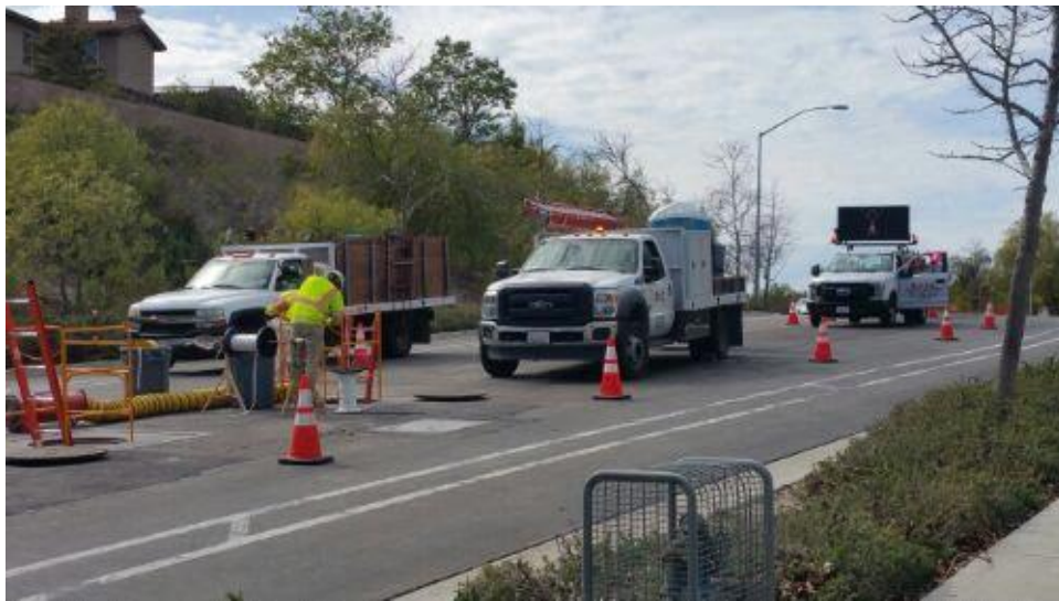
Caption Mandreling site on Stonebridge Parkway.

Photo Attributes Capture Date/Time: Thu Mar 08 2018 14:03:20 GMT-0800 (PST) Coordinates: 32.921569, -117.049745 View Direction: Southwest