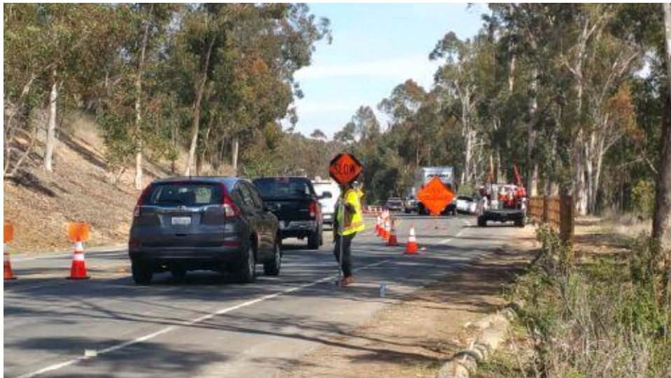
Caption Traffic control approaching splicing site on Pomerado Road.

Photo Attributes Capture Date/Time: Thu Mar 08 2018 13:16:55 GMT-0800 (PST)