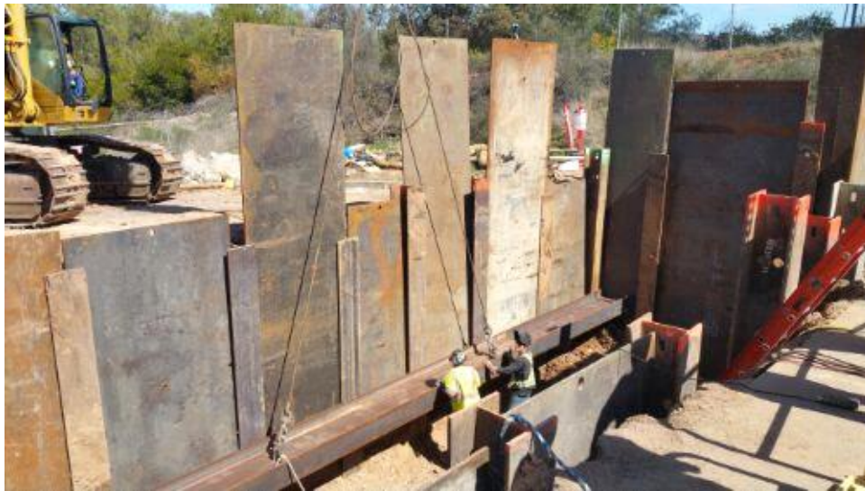
Caption Placing beam for vault at Kearney Mesa Road.

Photo Attributes Capture Date/Time: Tue Mar 06 2018 12:50:05 GMT-0800 (PST) Coordinates: 32.894725, -117.117434 View Direction: Northeast