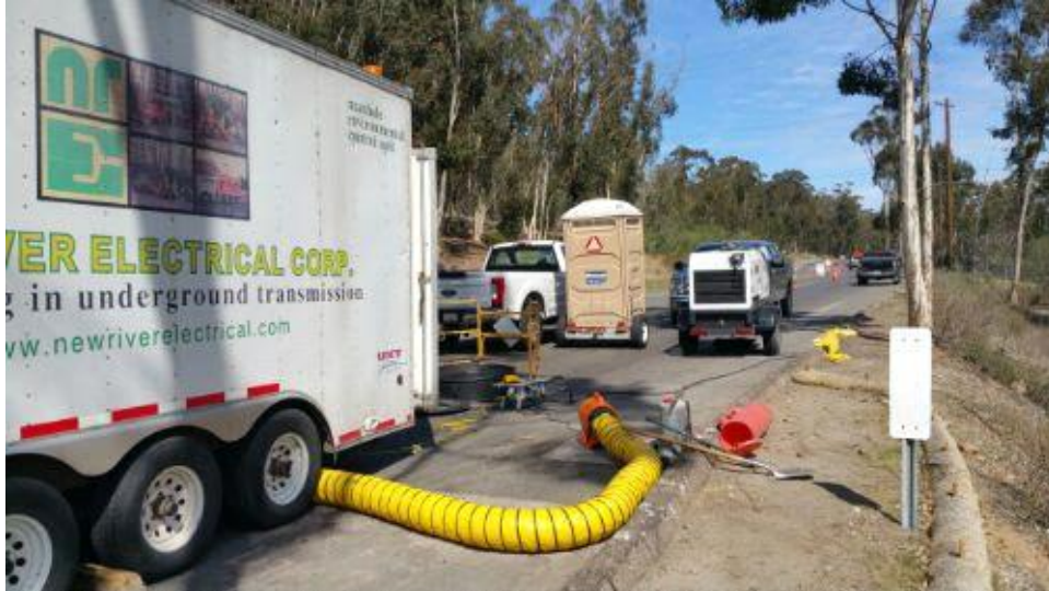
Cable splicing site on Pomerado Road.

Photo Attributes Capture Date/Time: Thu Mar 08 2018 13:08:25 GMT-0800 (PST) Coordinates: 32.900007, -117.097591 View Direction: Northeast