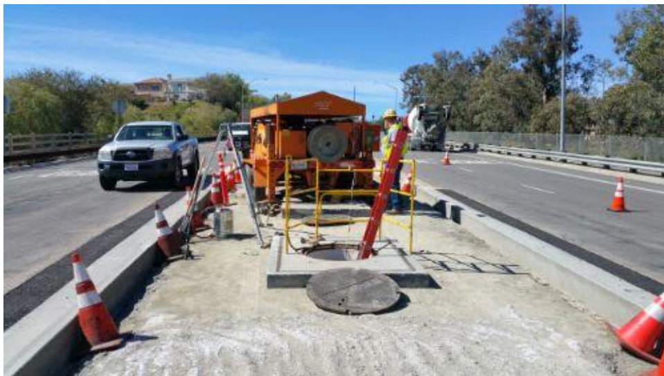
Caption Vault work on upper Pomerado Road.

Photo Attributes Capture Date/Time: Tue Mar 06 2018 10:56:25 GMT-0800 (PST)