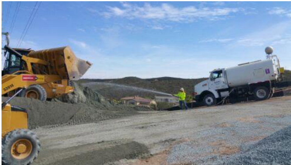
Caption Wetting and mixing fill material for PO5 foundation wall.

Photo Attributes Capture Date/Time: Thu Mar 08 2018 13:52:19 GMT-0800 (PST) Coordinates: 32.922563, -117.042684 View Direction: Southeast