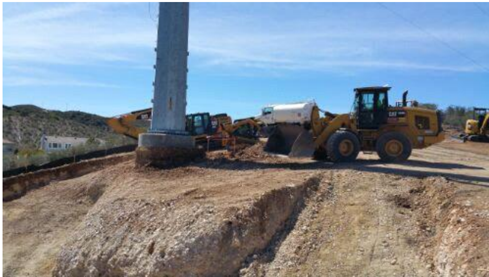
Caption Preparing for support wall construction at PO5.

Photo Attributes Capture Date/Time: Tue Mar 06 2018 11:34:11 GMT-0800 (PST) Coordinates: 32.922768, -117.042379 View Direction: South