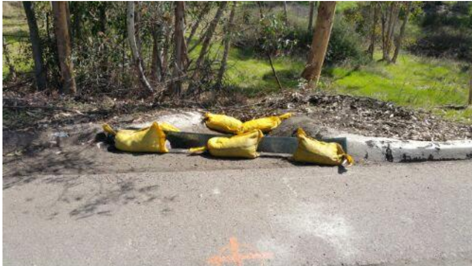
Erosion control BMPs in place at Station 435+00 on Pomerado Road.

Photo Attributes Capture Date/Time: Thu Mar 08 2018 12:36:41 GMT-0800 (PST) Coordinates: 32.895388, -117.107848 View Direction: South