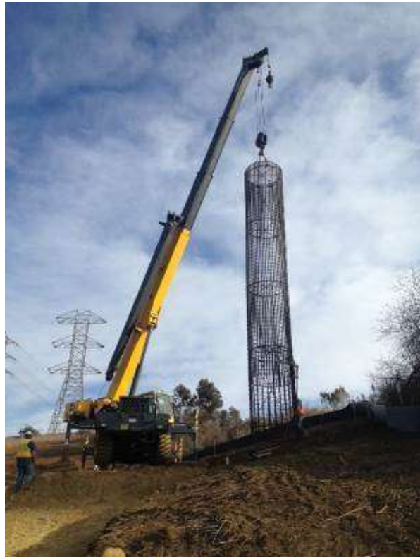
Figure 9: Setting a cage at Tower M43-T3, Segment 8, Phase 4.