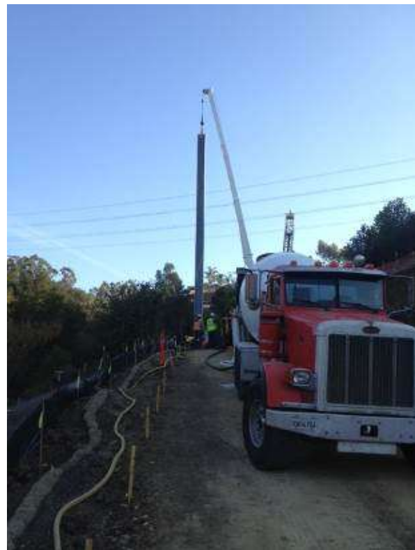
Figure 10: Installing soldier wall supports at Tower M49-T1, Segment 8, Phase 4.