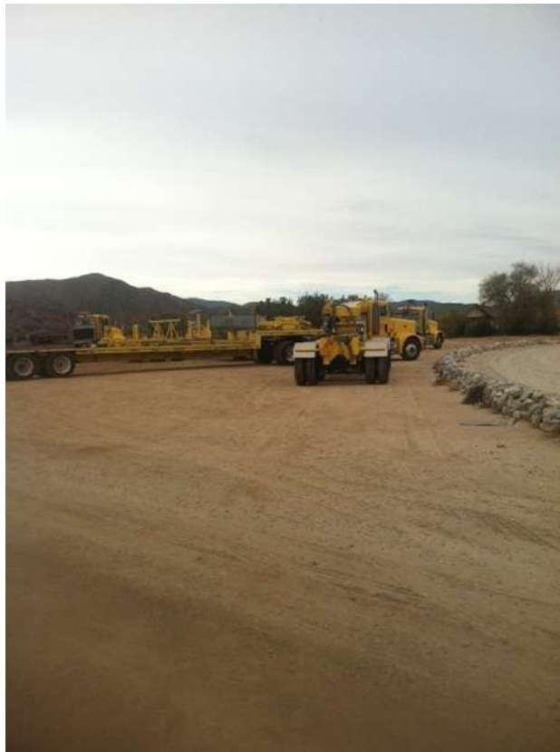
Figure 7: Parking outside of approved disturbance areas in the southwest corner behind the Vincent Substation.