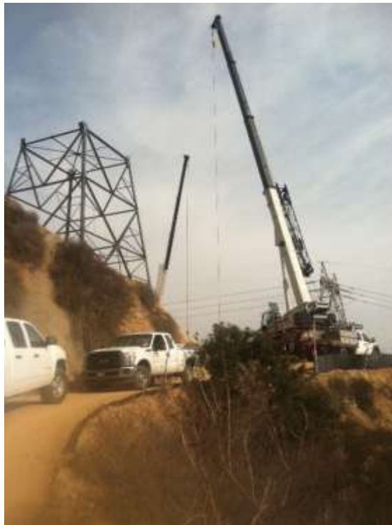
Figure 2: Construct 113 structure assembly, Segment 6.