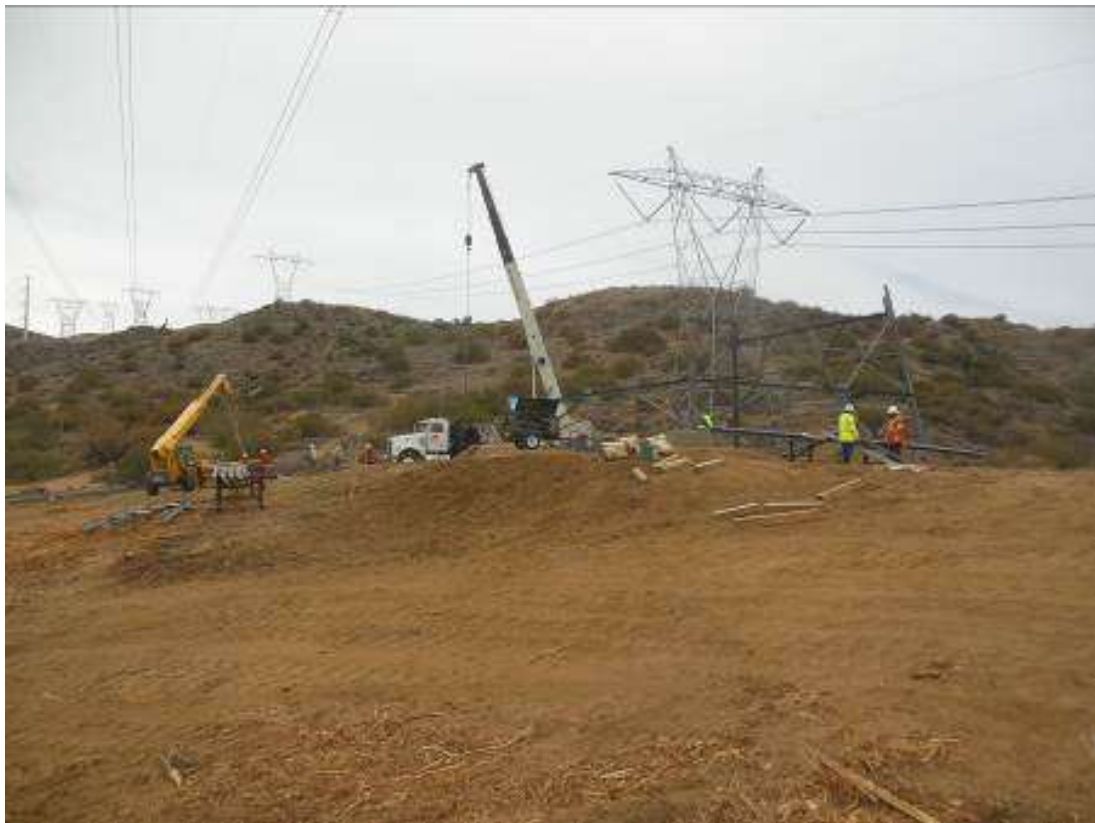
Figure 6: Assembly occurring at Construct 2, Segment 11C.