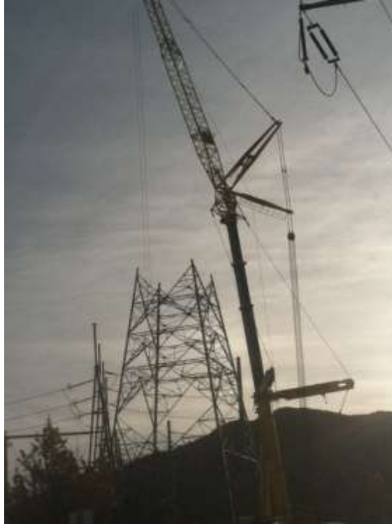
Figure 1: Construct 1 structure assembly, Segment 6.