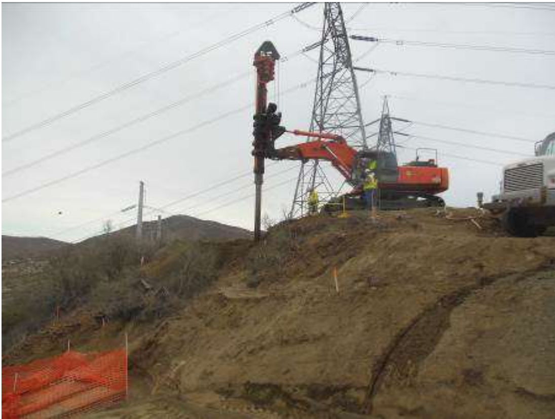
Figure 5: Foundation drilling at Construct 4, Segment 11C.