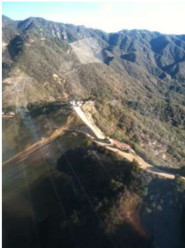
Figure 4: Wire stringing activities between Constructs 72 and 104, Segment 6.