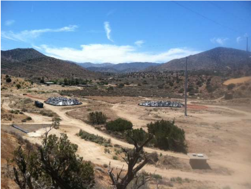
Figure 1: Stockpile covering activities at Construct -01, Segment 11C.