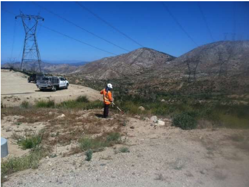
Figure 2: Weed removal activities at Construct 22, Segment 6A.