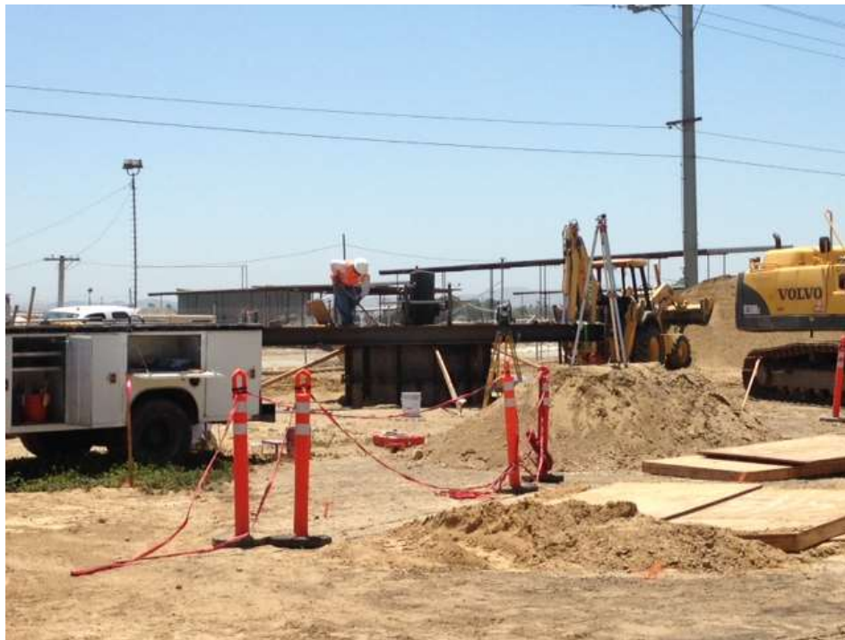
Figure 3: Foundation excavation in the City of Chino, Segment 8, Phase 3.