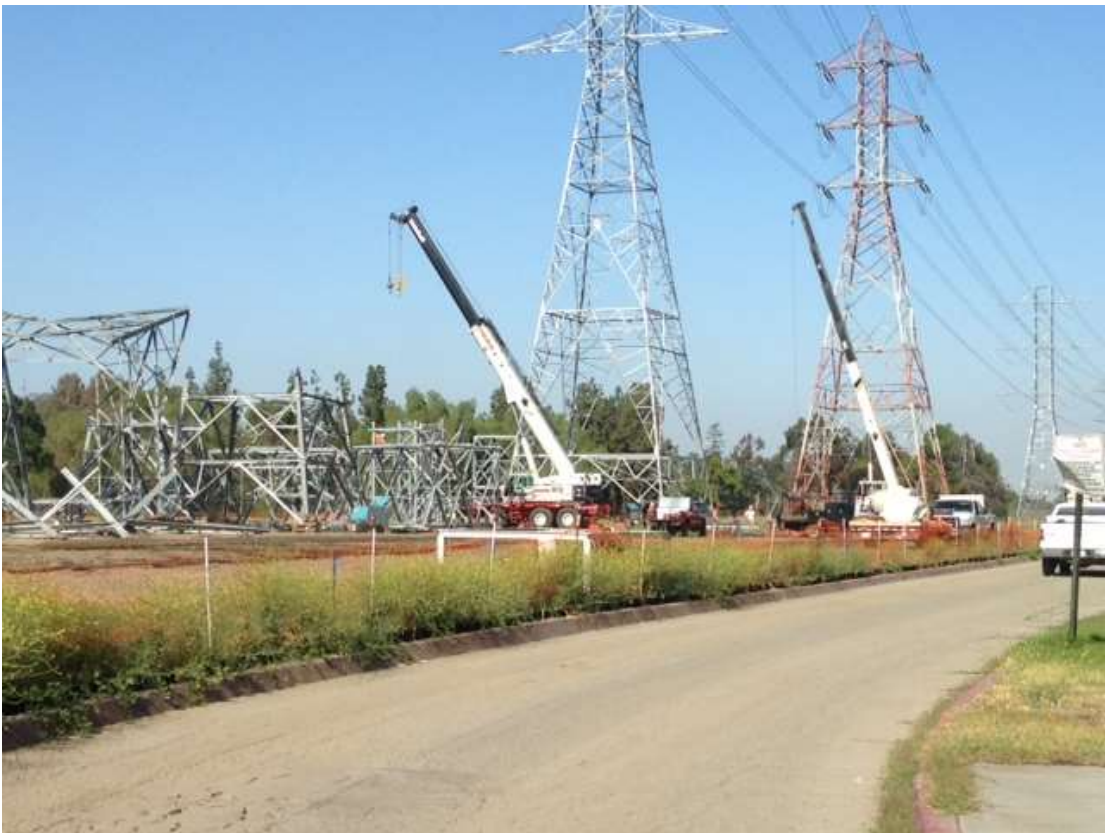
Figure 6: Tower assembly at Tower M42-T5, Segment 8, Phase 4.