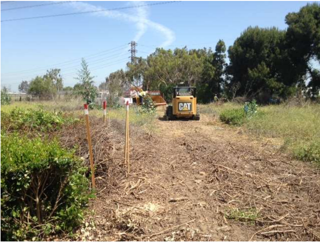
Figure 5: Vegetation clearing at work sites in Segment 8, Phase 4.