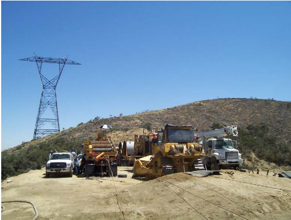
Figure 1: WSS 26 on the ANF.