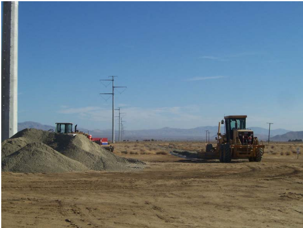
Figure 6: Capping of Environmentally Sensitive Areas on Segment 3A.