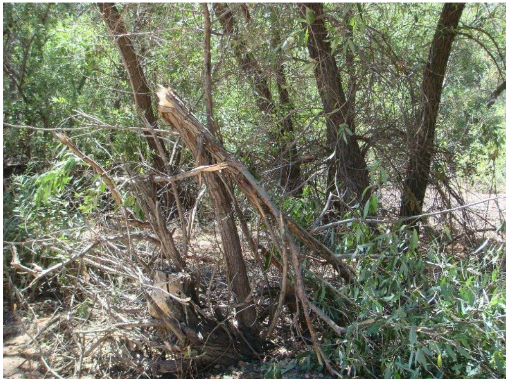
Figure 2: Damaged willow tree during guard pole installation.