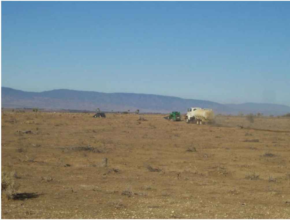
Figure 5: Mowing the access to Tower 43 in Segment 3A.