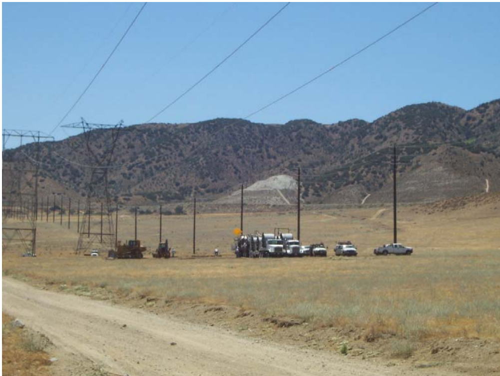
Figure 4: Stringing between Towers 2-22 on Segment 2.