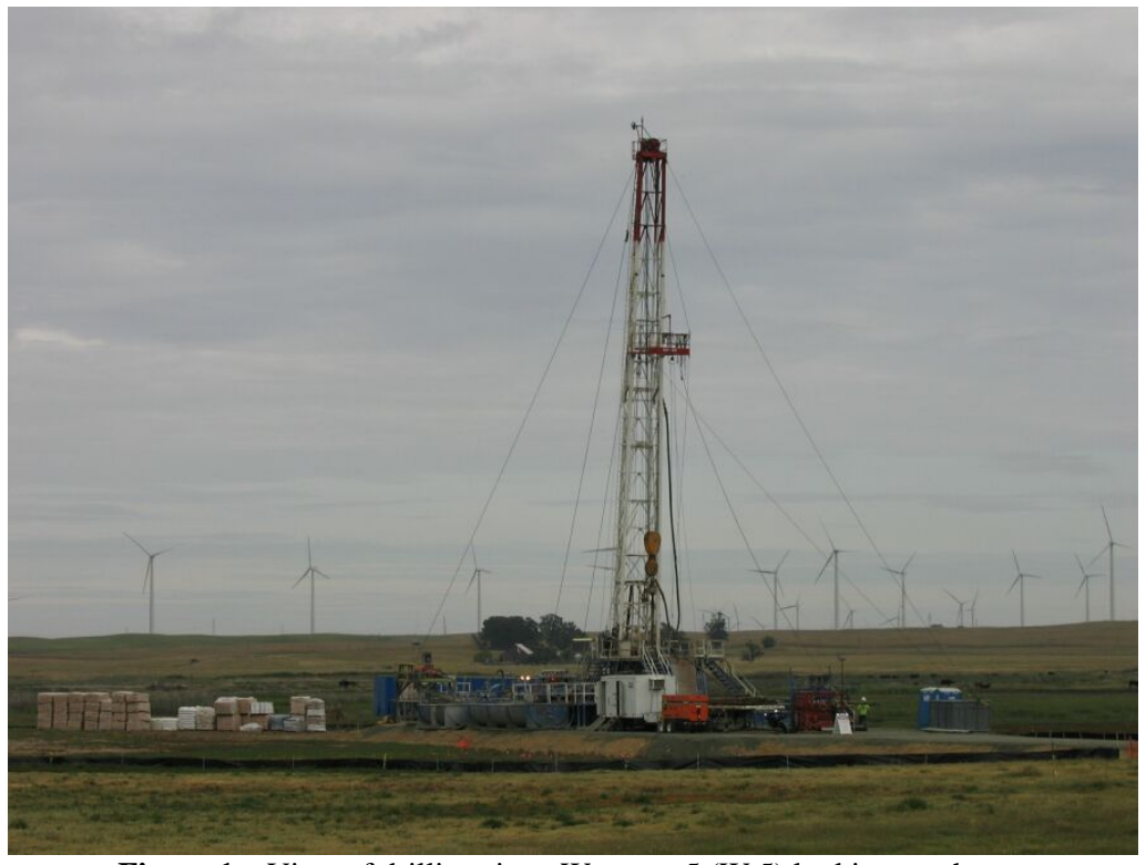
Figure 1 – View of drilling rig at Wagenet 5 (W 5) looking northeast, April 30, 2009.