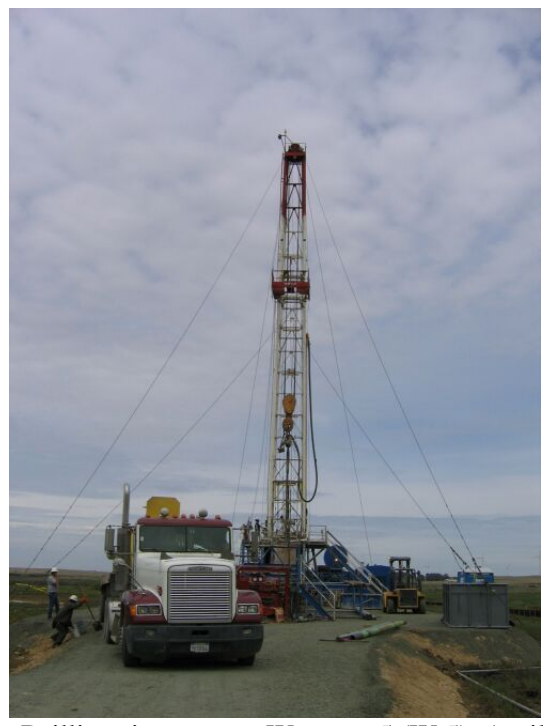
Figure 2 – Drilling rig set up at Wagenet 5 (W 5), April 30, 2009.