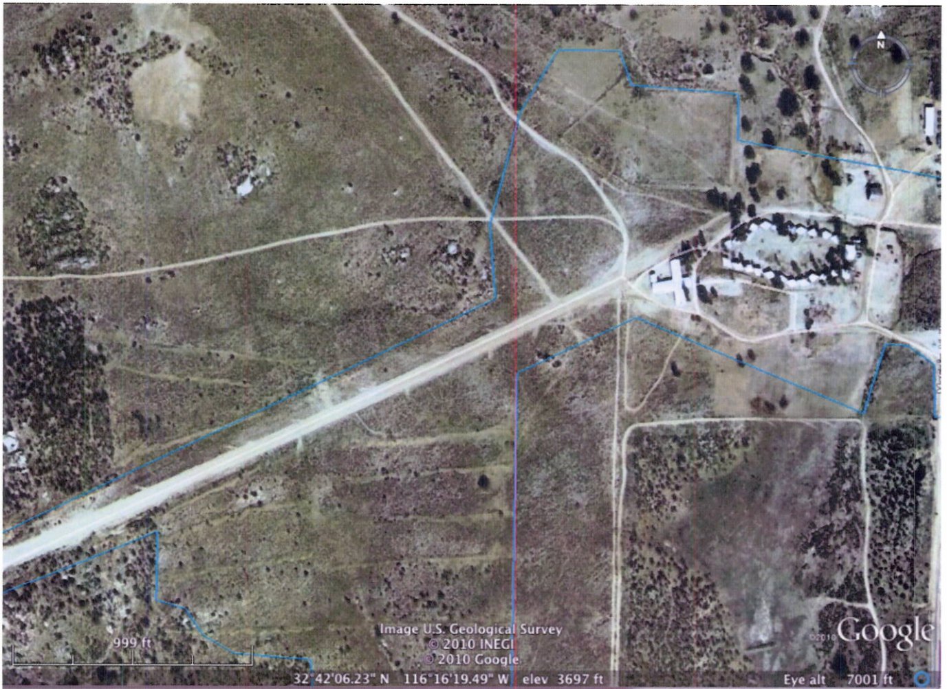
Rough Acres Fly Yard Sterile Area. This area is fenced.

EXAMINED & APPROVED DATE FEB. 11, 2011 BY [Signature] FAA WPFSDO-09 SAN DIEGO, CA