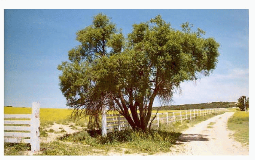
Fig. 13 Specimen of blue elderberry, Morning Star Ranch, Tierra del Sol watershed. 12

Blue elderberry. Under moist conditions, such as near the bottom of ravines or small canyons, the chaparral coexists with the small woody winter-deciduous Sambucus species and the flowering ash (Fraxinus dipetala) (Keeley and Keeley, 1988). One Sambucus species, the blue elderberry (Sambucus mexicana) is present in the flood plains and other mesic locations of the Tierra del Sol watershed (Fig. 13).