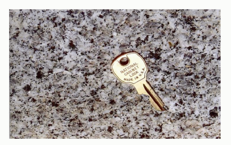
Fig. 12 Closeup of matrix structure in rock outcrop at Tierra del Sol.

Impact of the proposed Campo landfill on the hydrology of the Tierra del Sol watershed Page 14 of 35