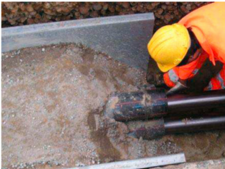
AC high power line raceway design and its installation

The ferromagnetic raceway is composed of different elements: the hull, the cover and the closing clips. The raceway is made of special steel, suitably protected against corrosion. The design of the described open raceway system (specially developed and designed by Prysmian) combines the closed perimeter shielding efficiency with an open shape and the absence of welding. The particular shape allows also the raceways to follow the curves of the trench and lateral and vertical variations of direction. It is important to underline that the