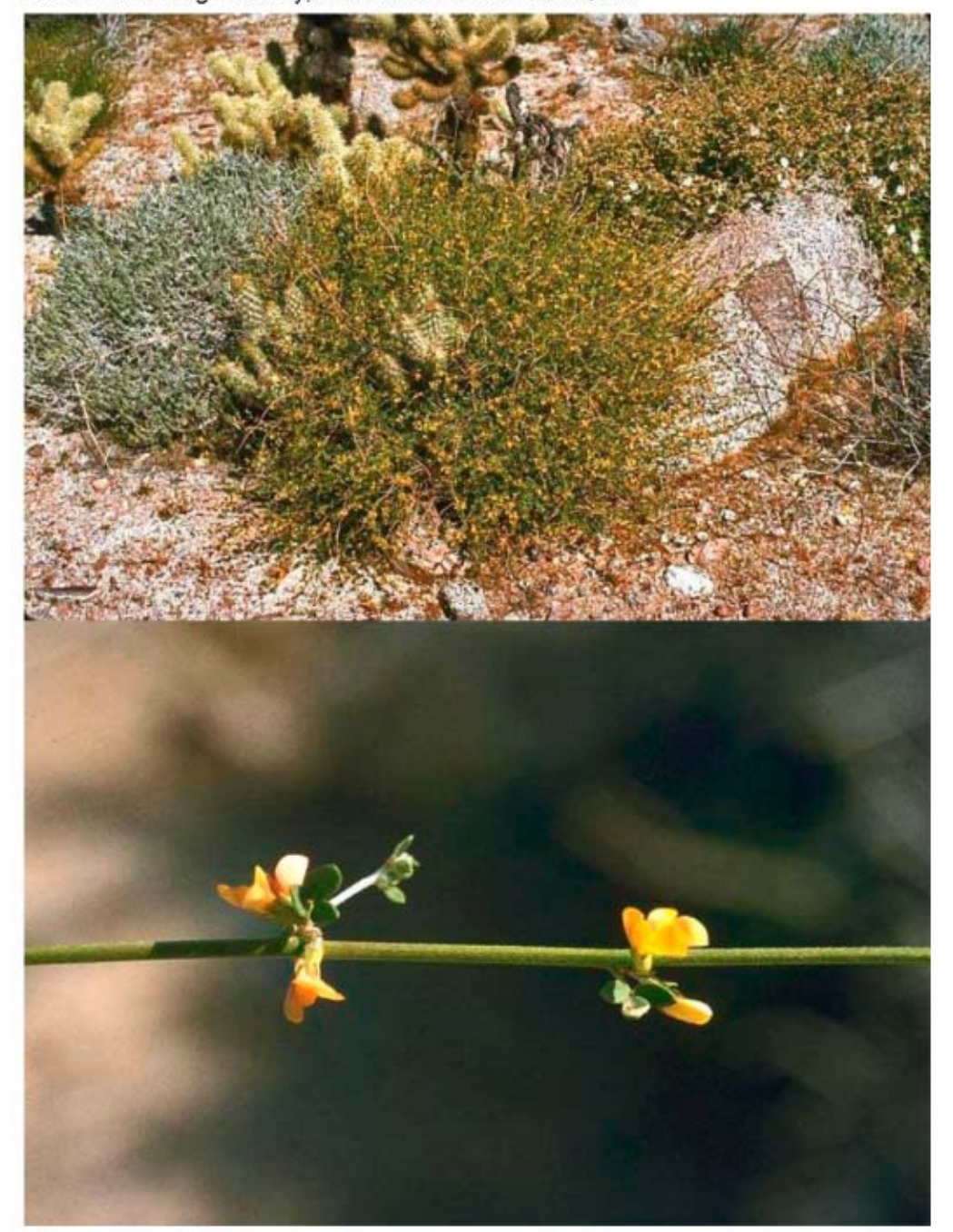
Pigmy lotus , Lotus haydonii, Rare, threatened or endangered perennial herb, in Eastern San Diego County, and within the Jacumba Quad