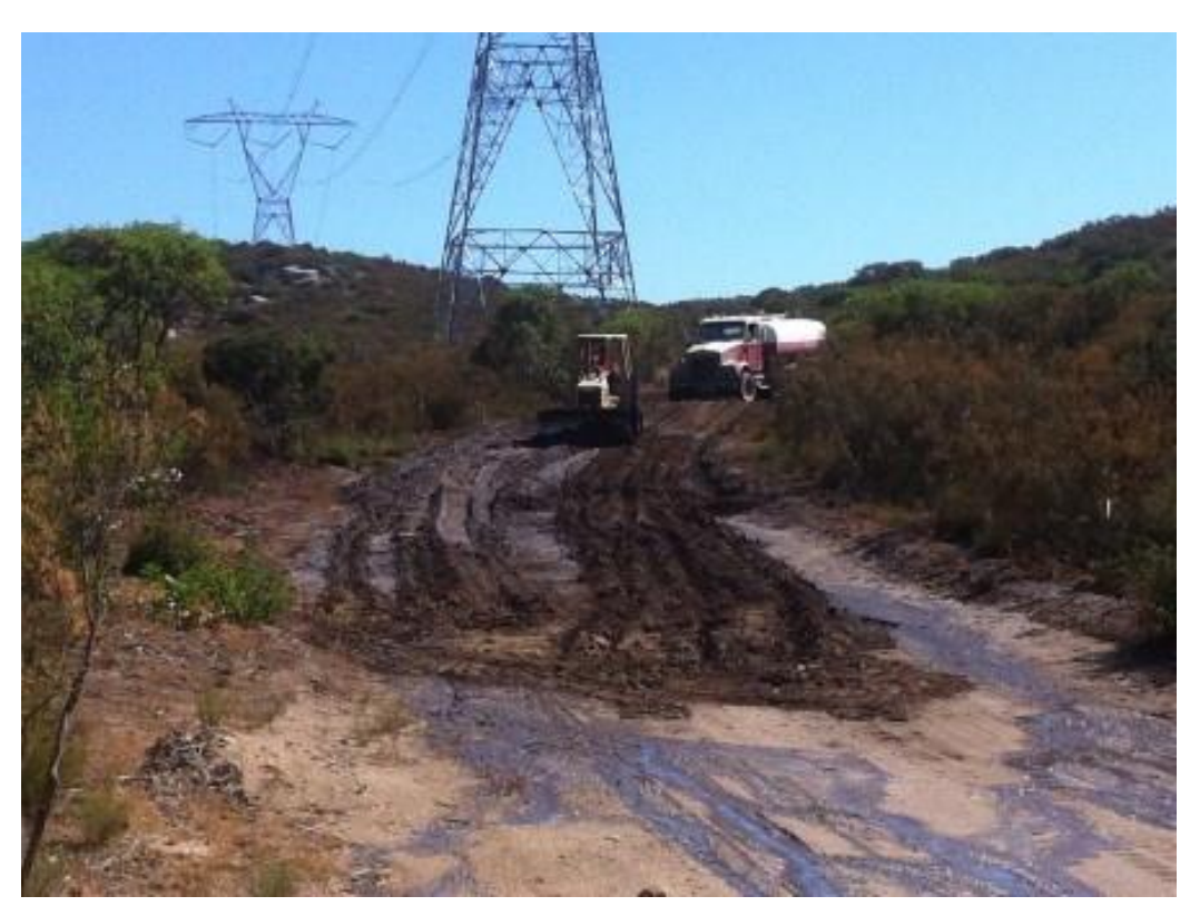
Final road grading near EP96-N-A to EP99-2-N-B. (Link 2)