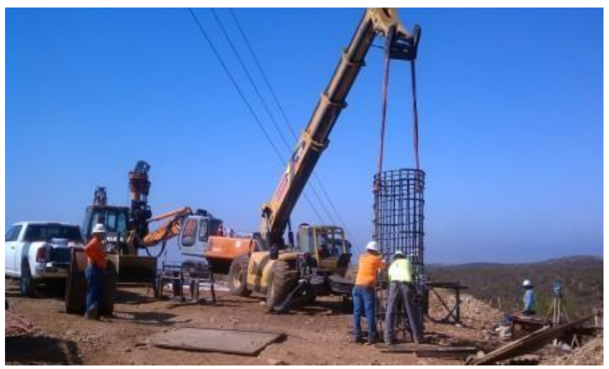
Installation of rebar at CP19-1, Link 5.