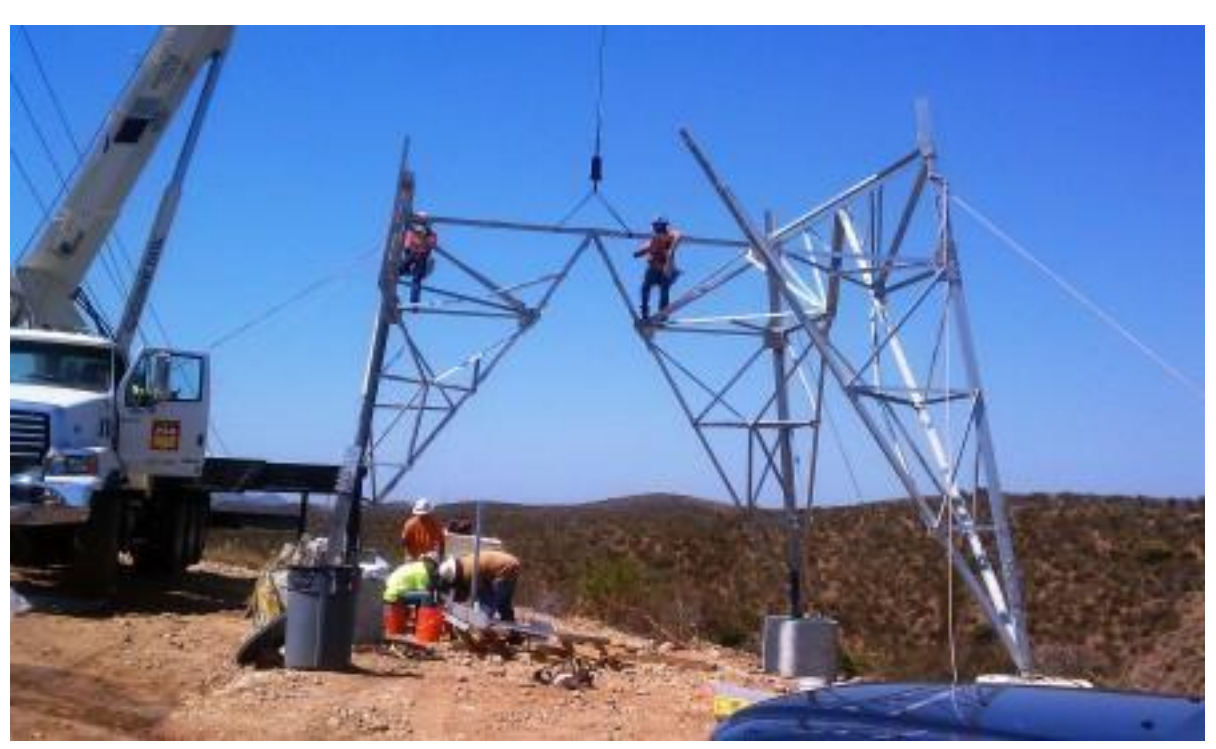
Tower assembly at CP19-1, Link 5.