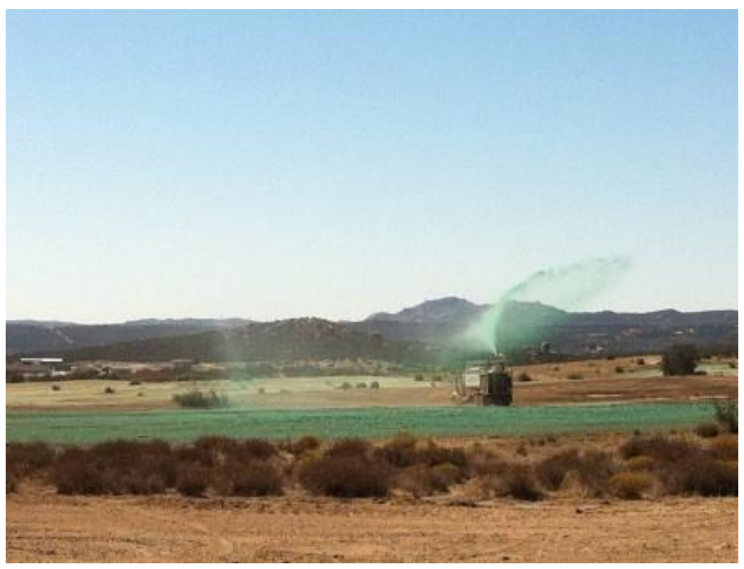
Hydromulching at Rough Acres Yard. (Link 1)