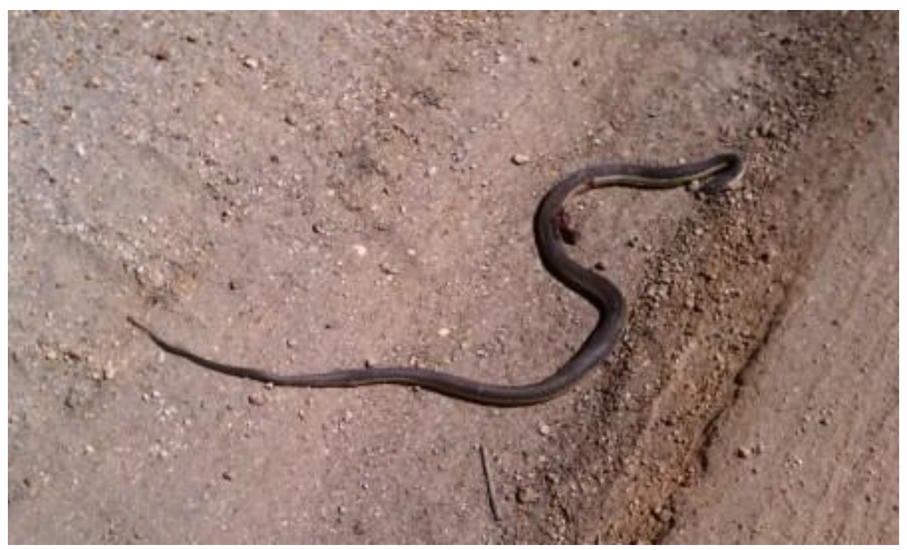
Two-striped garter snake killed on access road to Tower EP50. (Link 2)