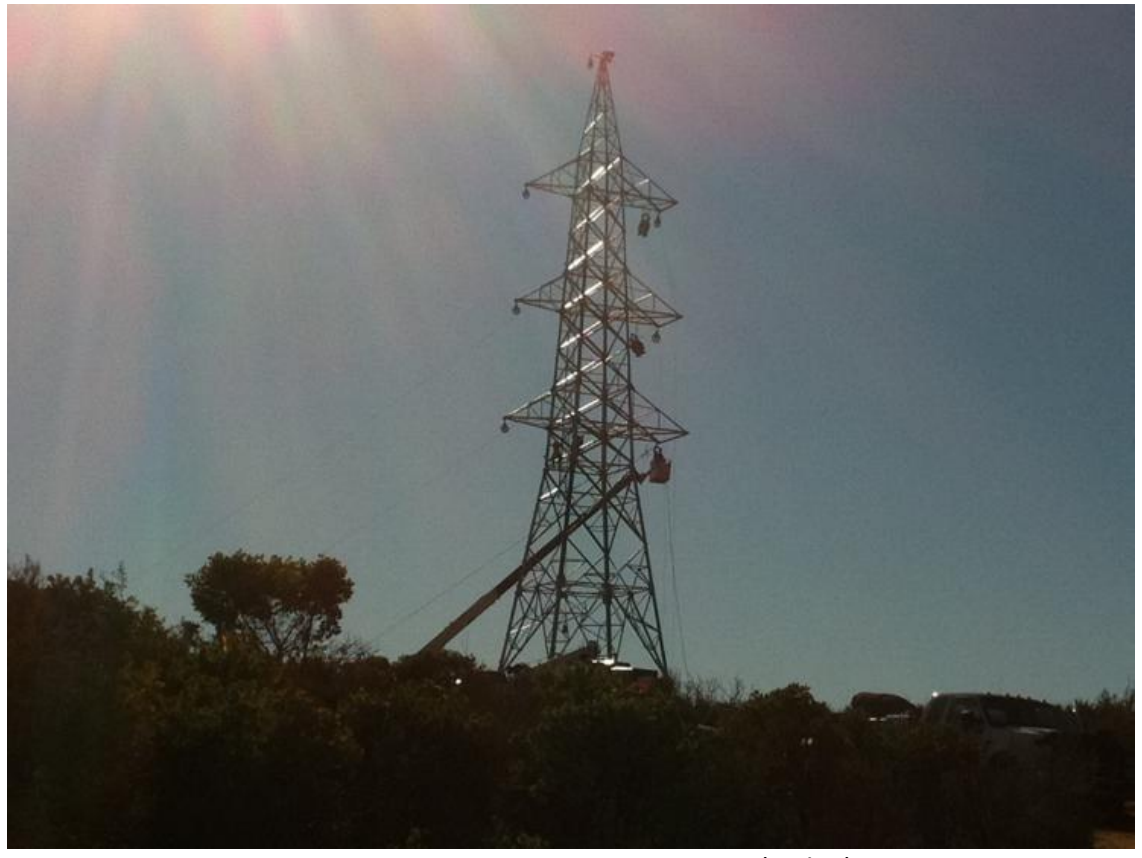
Wire stringing activities at CP100-1. (Link 5)