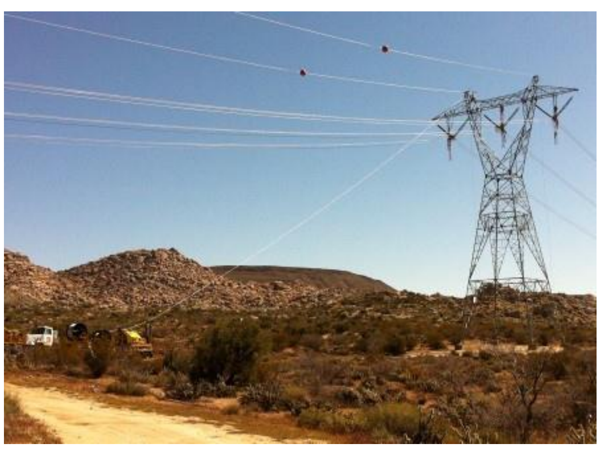
OPGW pulling at Tower EP244, Link 1.