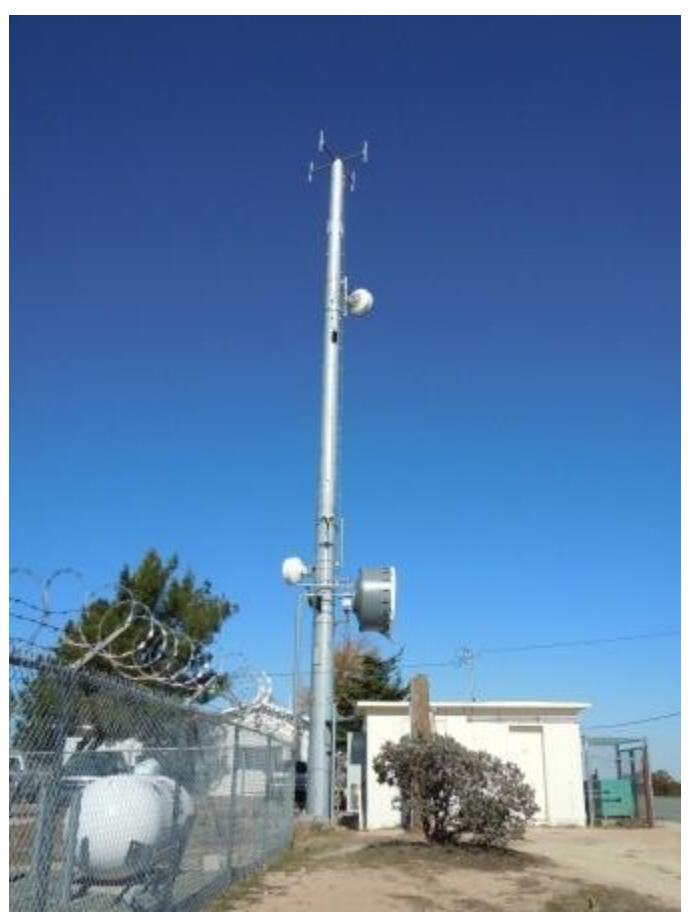
Completed White Star Communication Facility site.