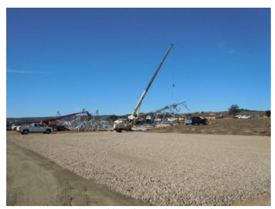
Steel assembly at the Rough Acres Yard.