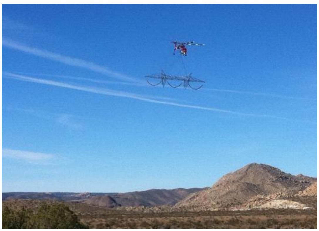
Aircrane flying bridge to EP253-3. (Link 1)