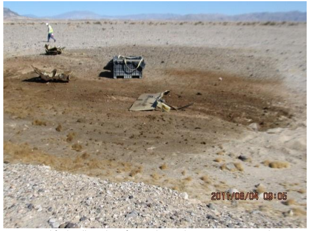
Diesel fuel spill resulting from a dropped compressor unit, Link 1.