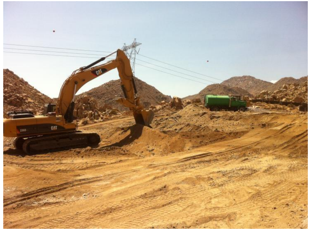
Grading at EP269 pull site, Link 1.