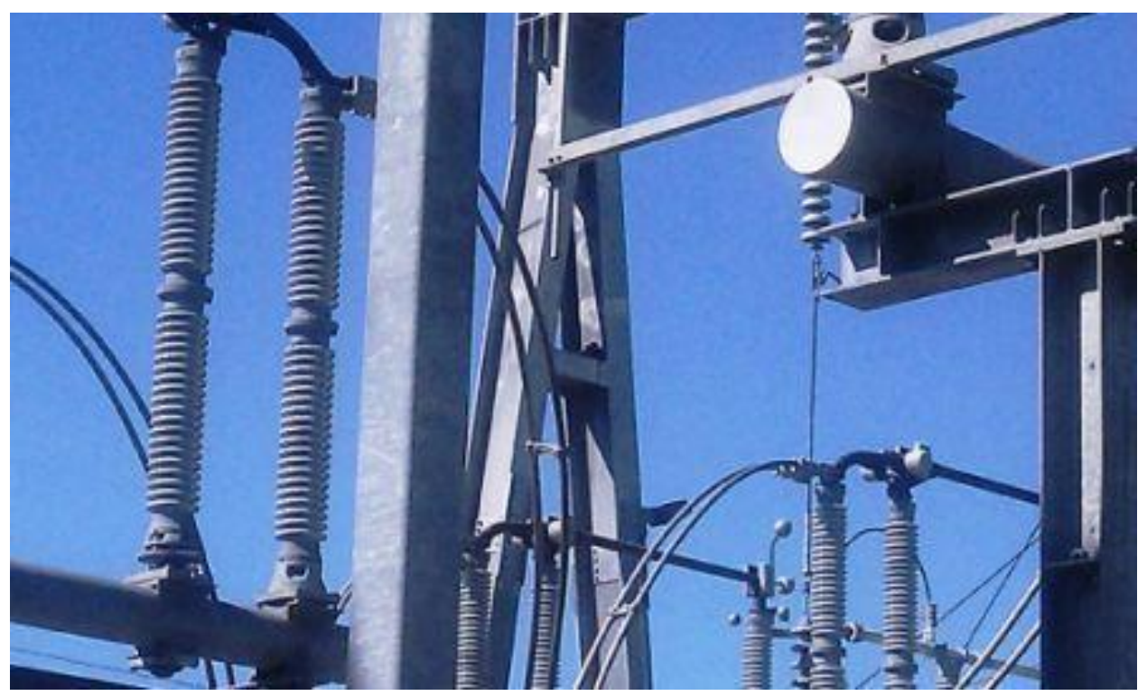
Three owl chicks occupying nest in structure at San Luis Rey Substation.