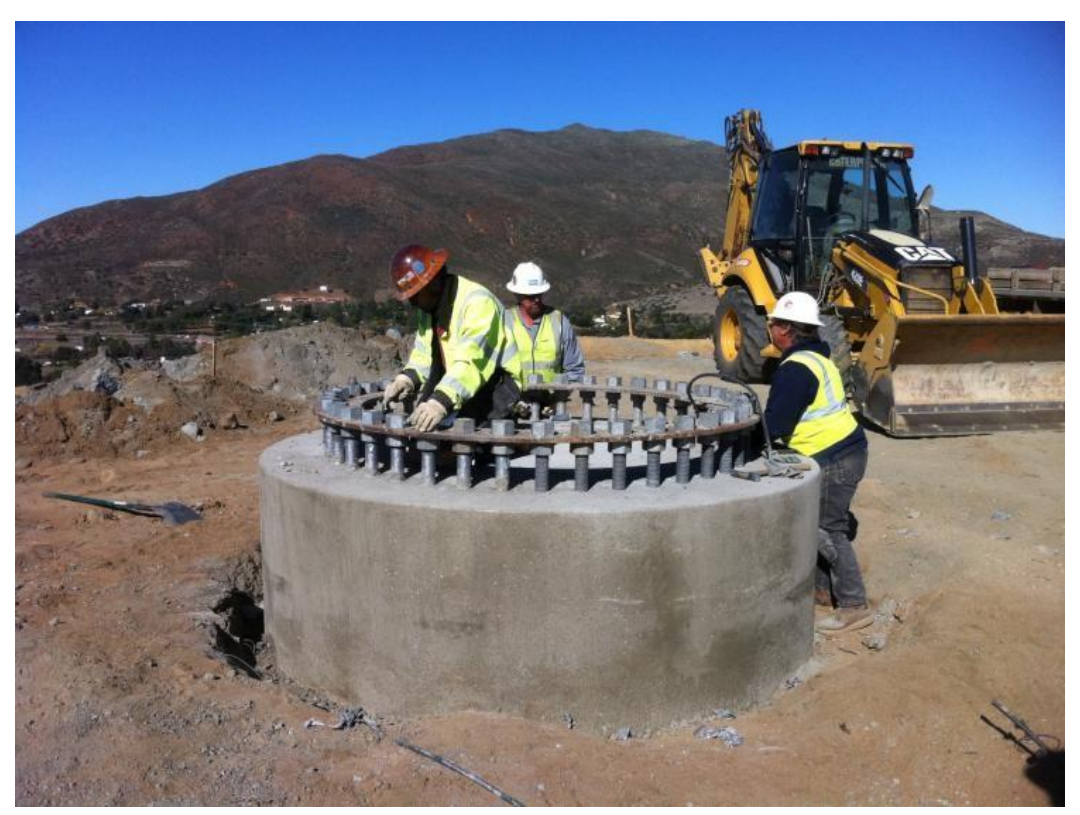
Conventional foundation activities at CP98-1. (Link 5)