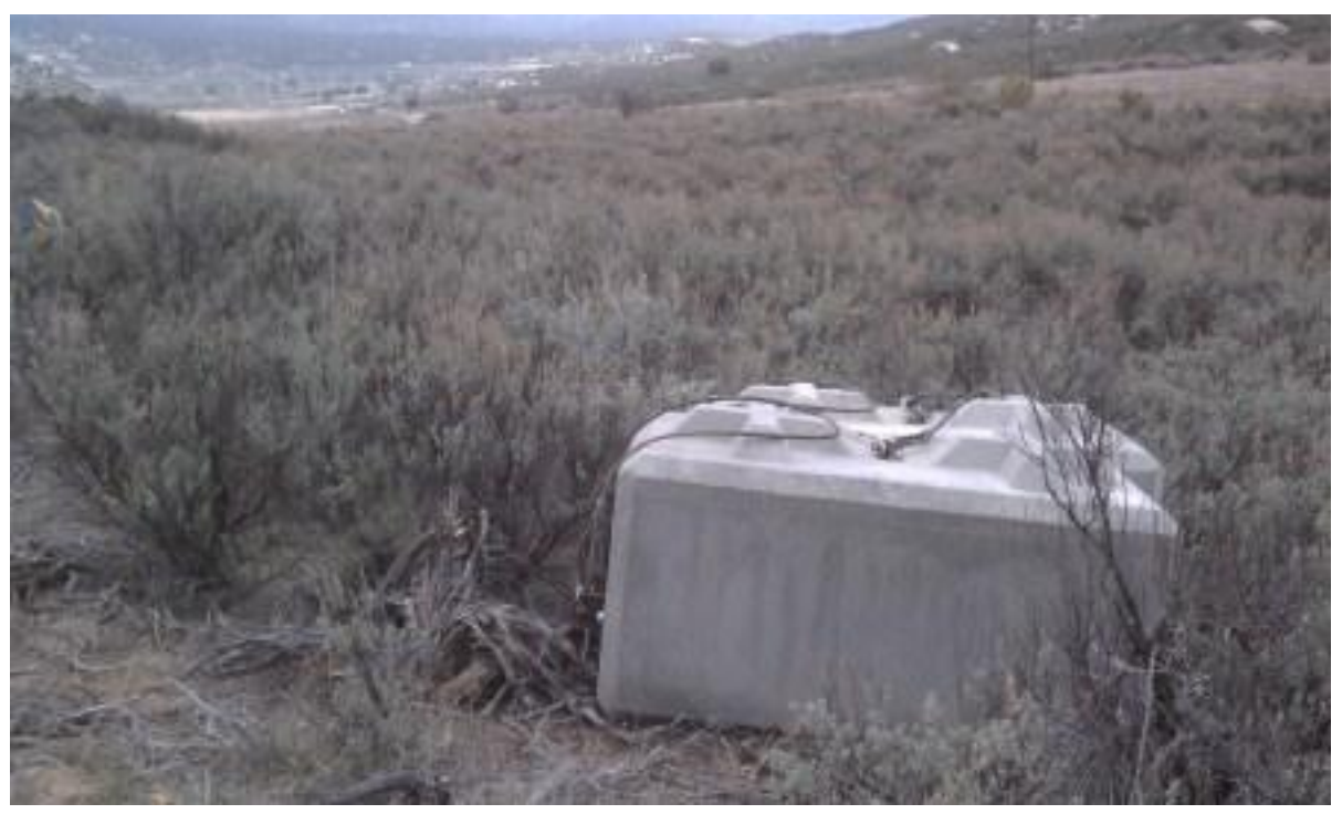
Concrete block set in brush at EP114. (Link 2)