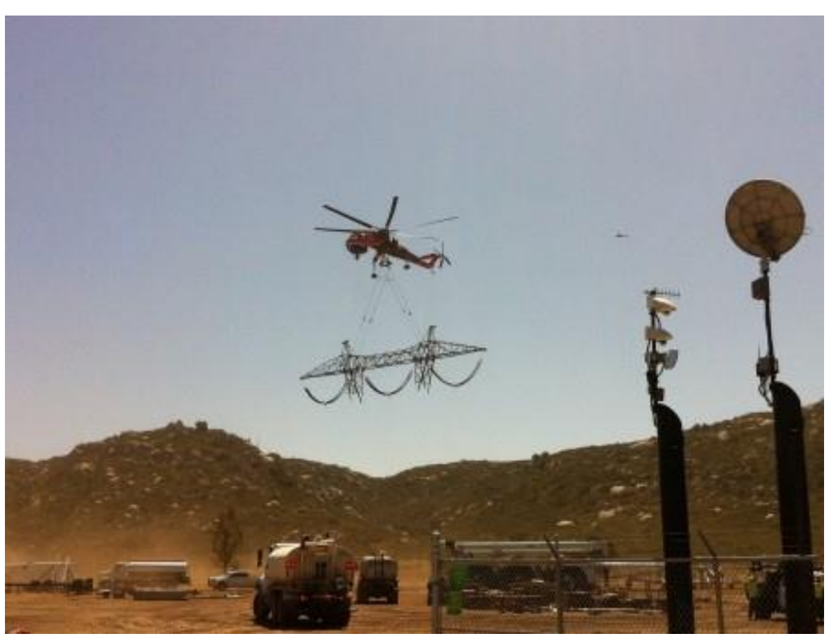
Aircrane flying tower bridge to Tower EP54. (Link 2)