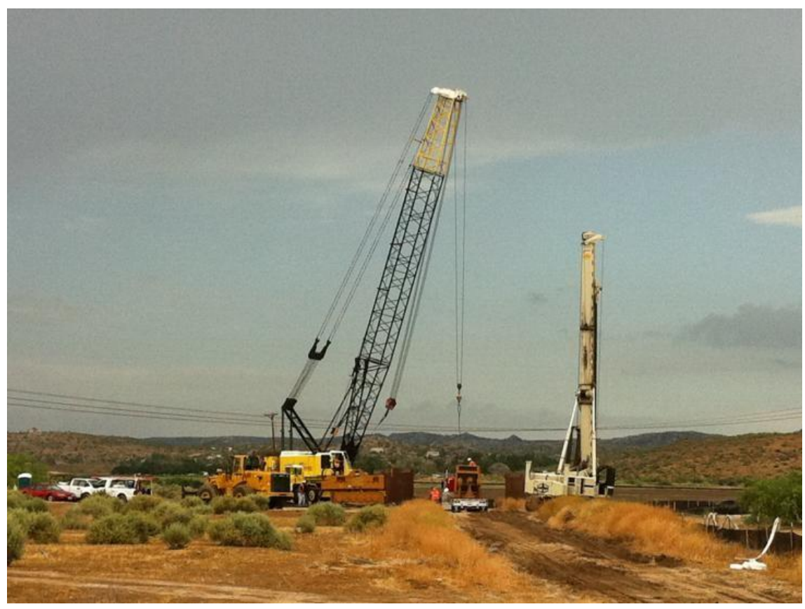
Drilling and caisson hammering at EP240, Link 1.