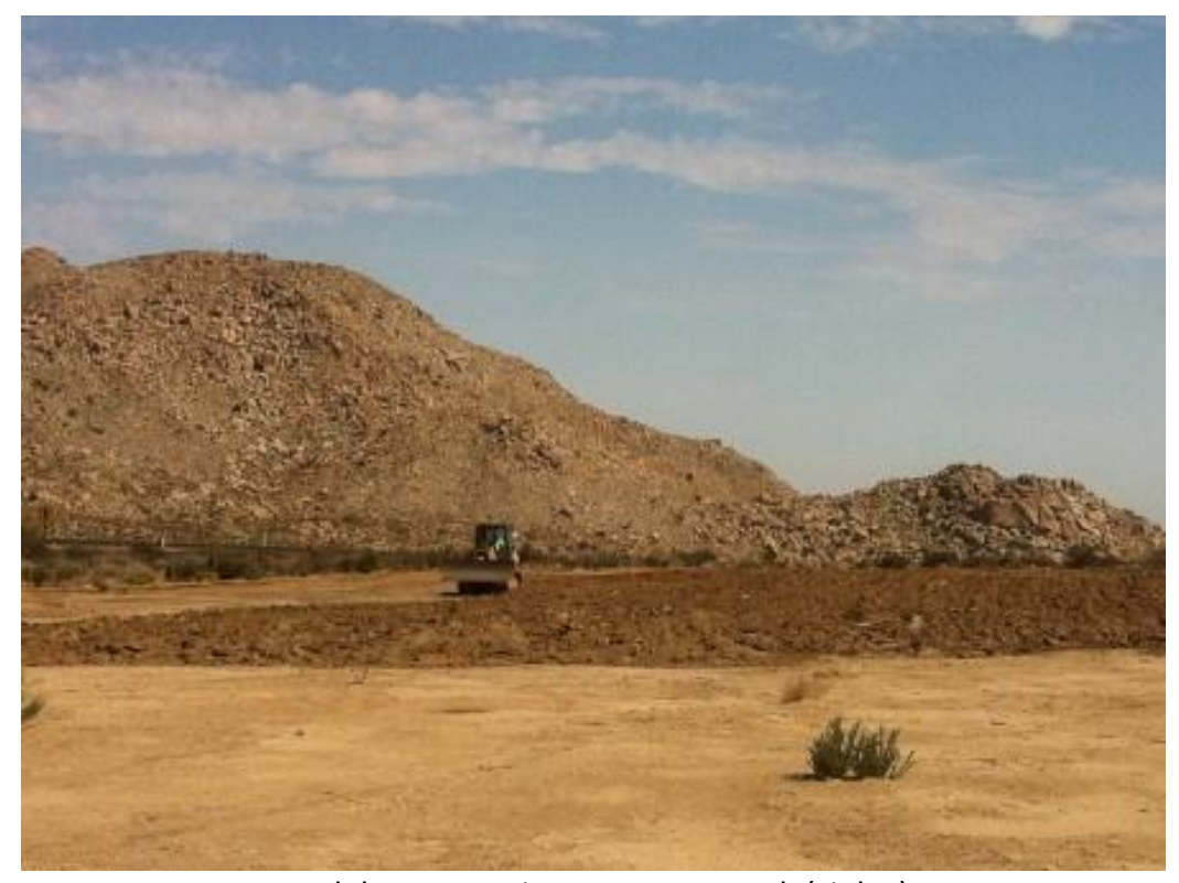
Yard de-compaction at Fromm Yard. (Link 1)