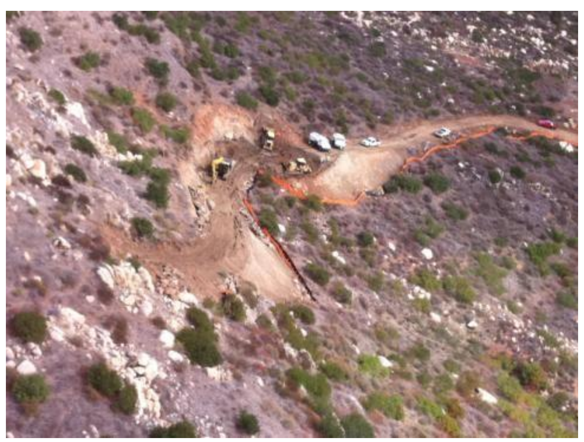
Access road grading to CP49-1 pull site. (Link 5)