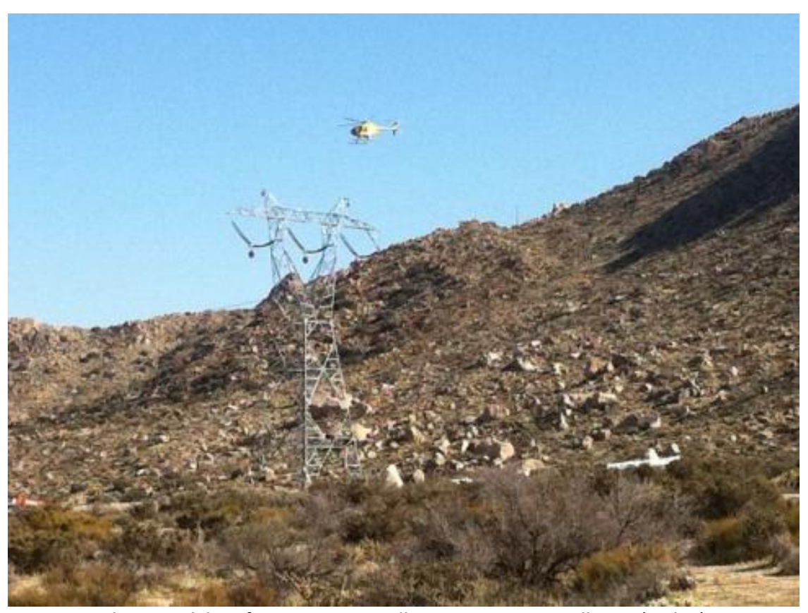
Flying sock line from EP255-2 pull site to EP269-1 pull site. (Link 1)