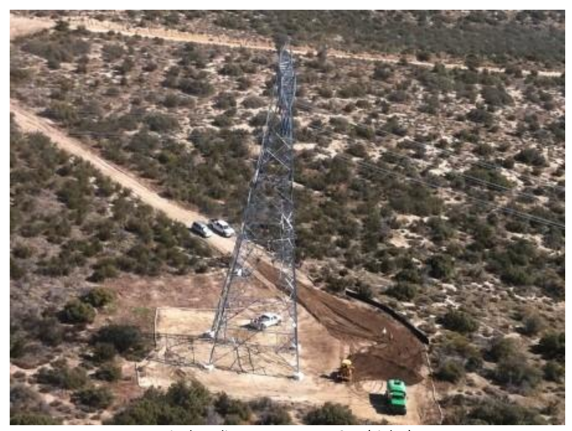
Final grading at Tower EP173-1. (Link 1)