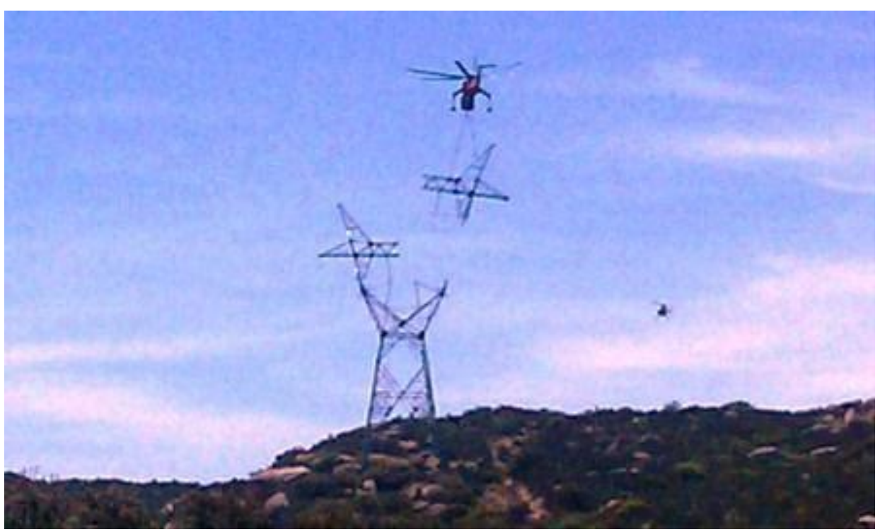
Aircrane delivering pre-assembled tower piece at Tower EP83, Link 2.