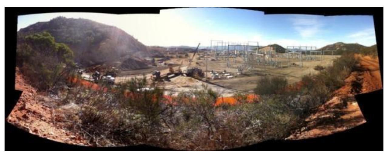
Panoramic view of Suncrest Substation. (Link 3)