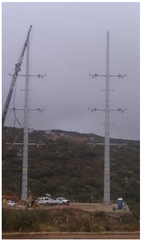
Cable pulling at riser (transition) poles CP95-1 and CP96-1, Link 4.