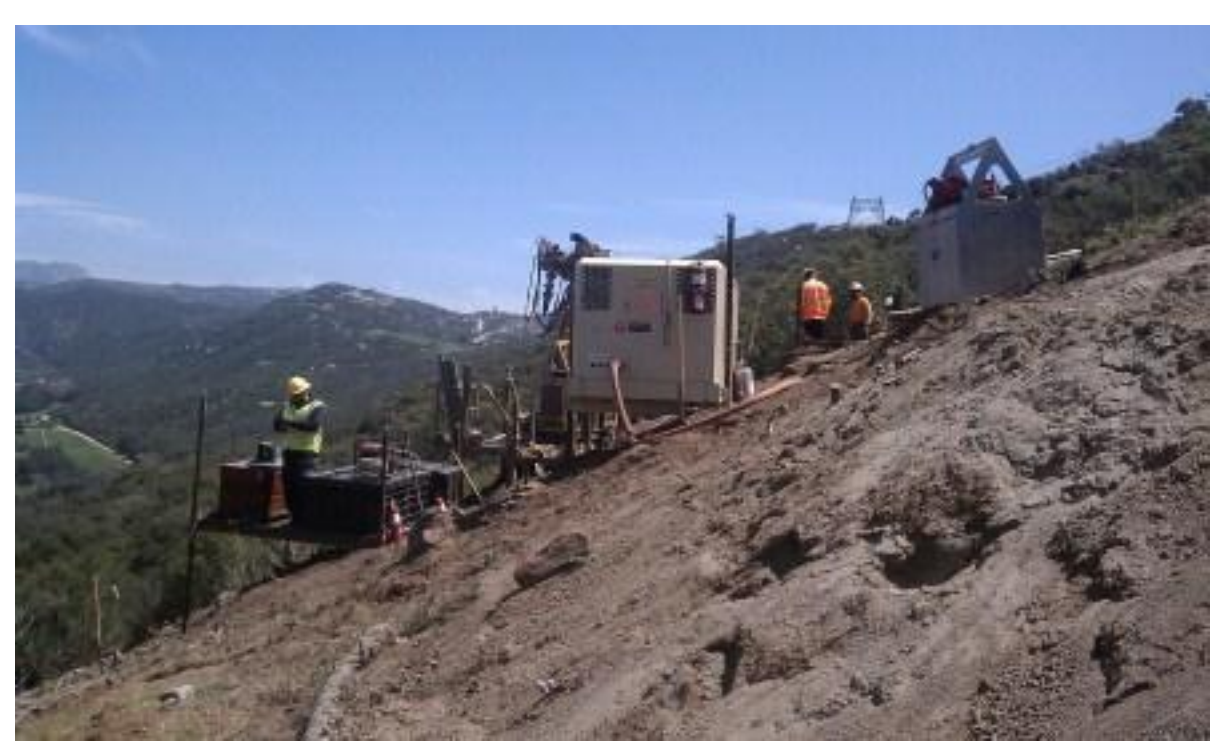
Micropile drilling at EP10-2, Link 2.