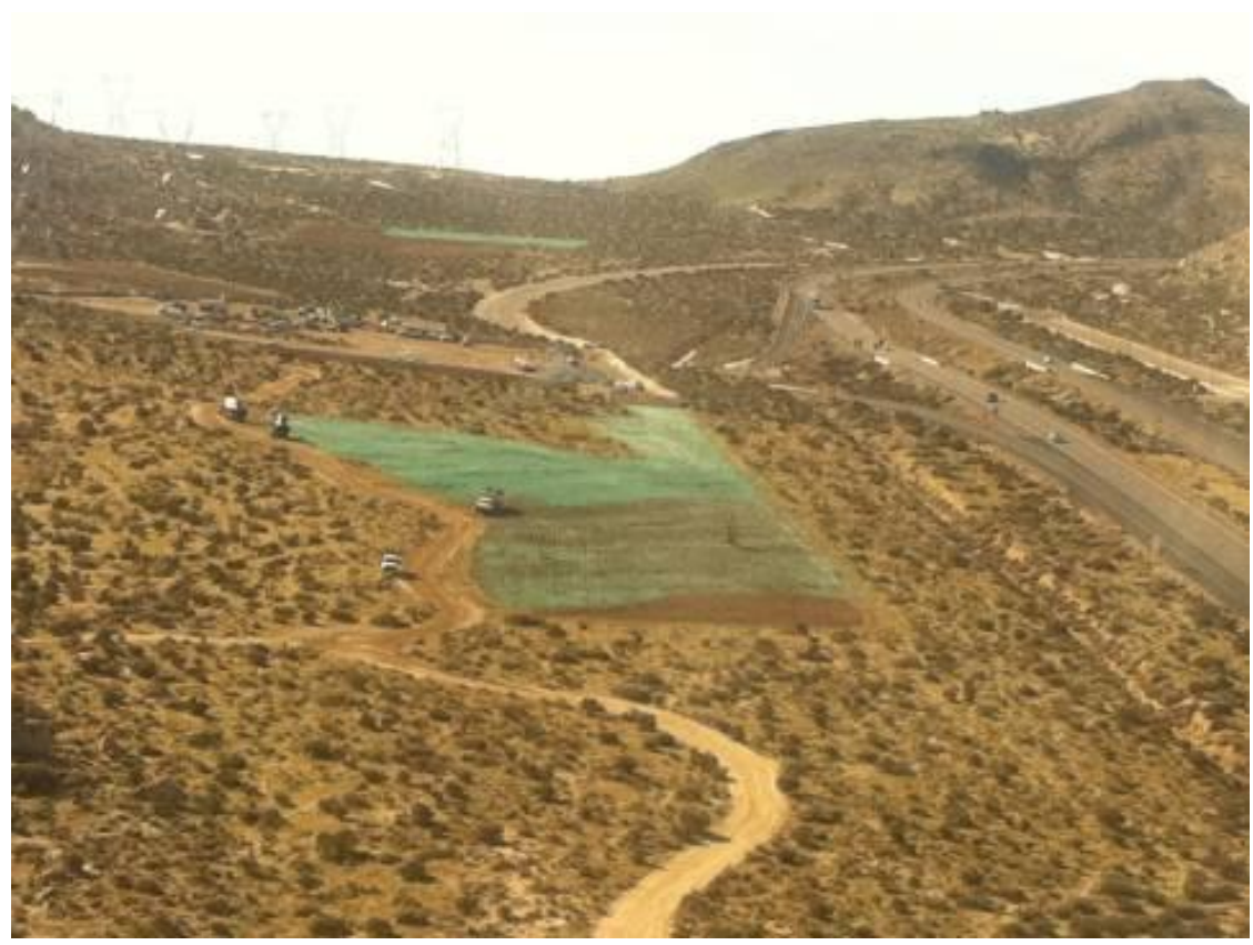
Hydromulch application to the lower section of Fromm Yard.