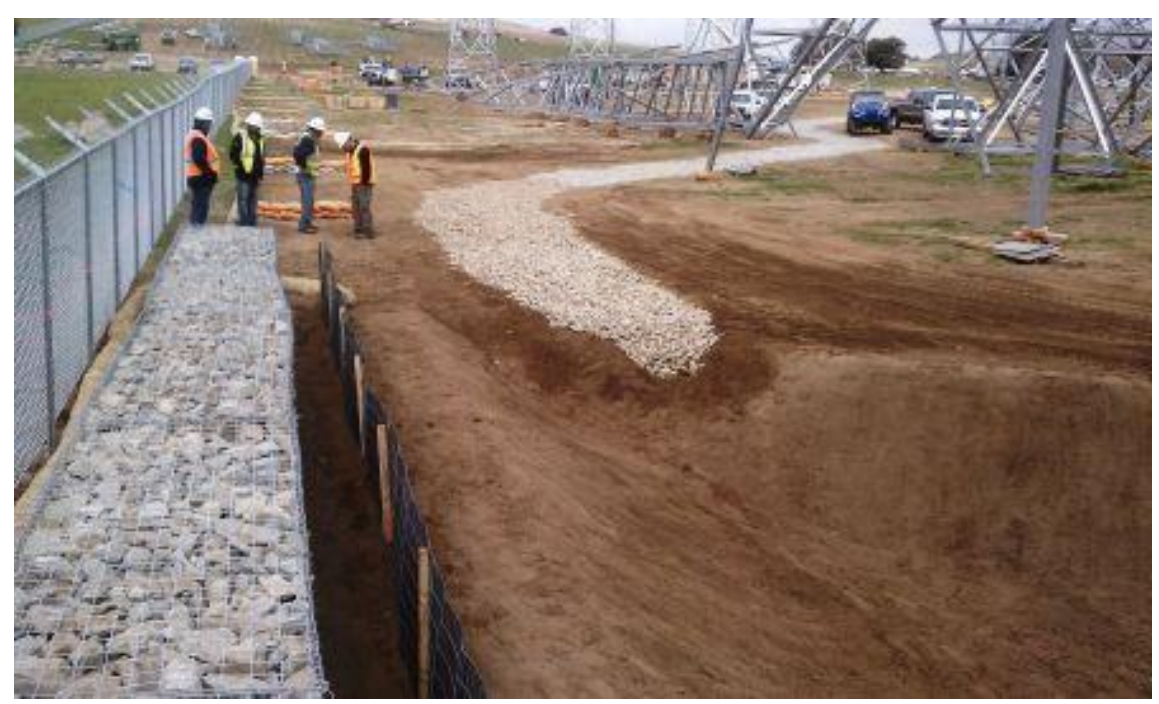
Stormwater BMPs improved at the Bartlett-Hauser Yard, Link 2.