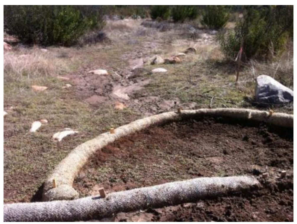
Breached BMPs with sediment going offsite at CP70-3. (Link 5)