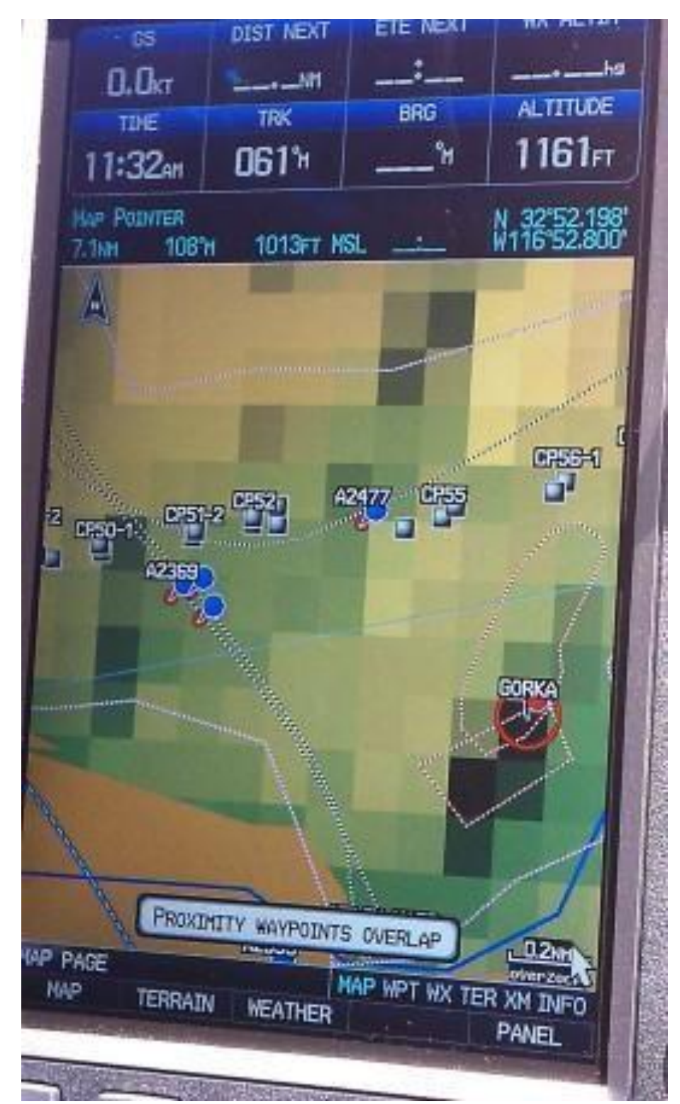
GPS unit display in helicopter showing tracks to Helix Yard and avoidance of sensitive areas.