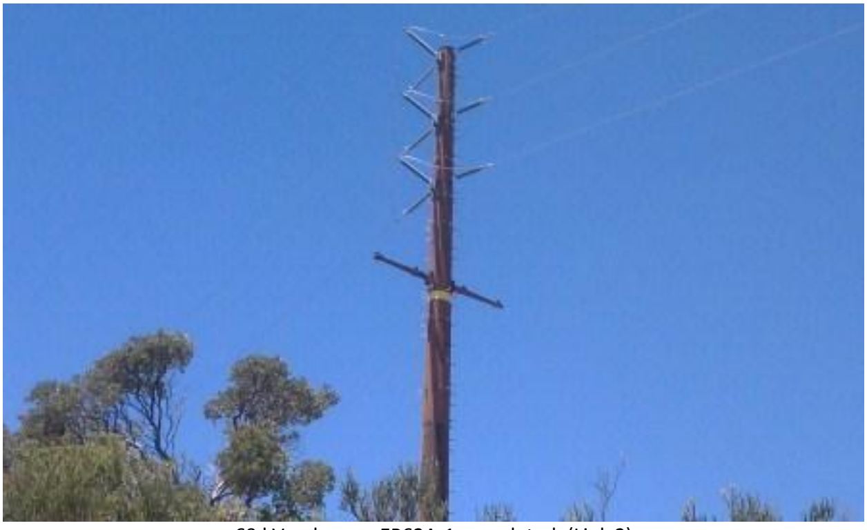
69 kV pole near EP62A-1 completed. (Link 2)