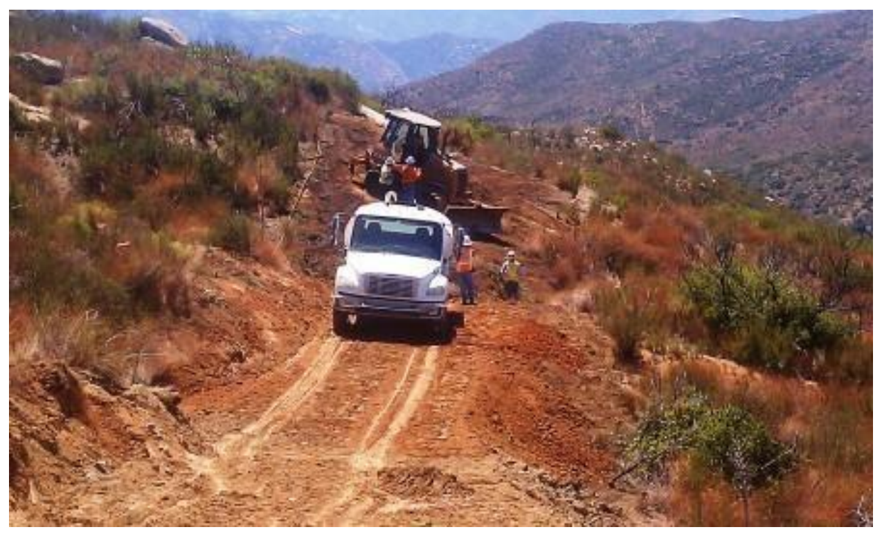
Grading operations on access road to EP40-1. (Link 2)