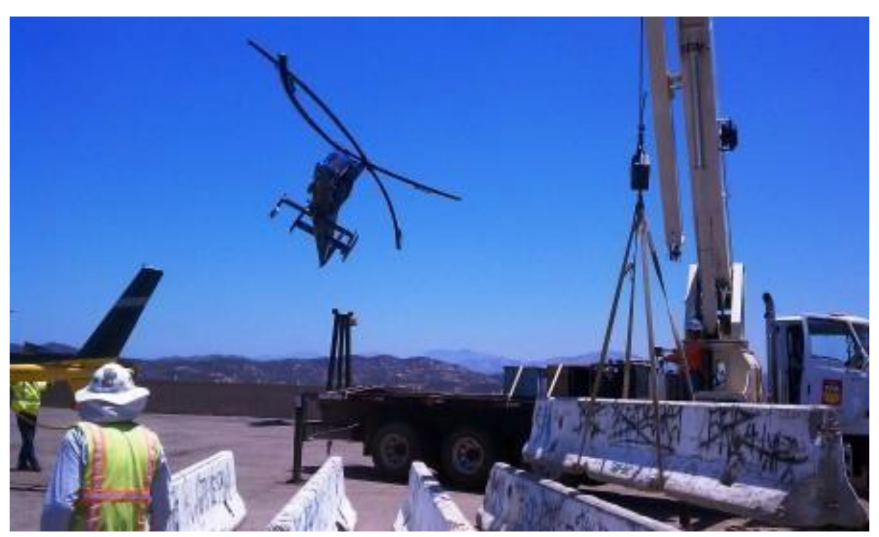
K-Max helicopter leaving Sycamore Estates Yard. (Link 5)