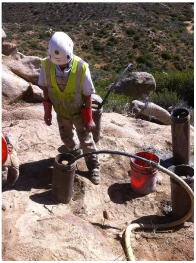
Micropile grouting at EP 225 1, Link 1.