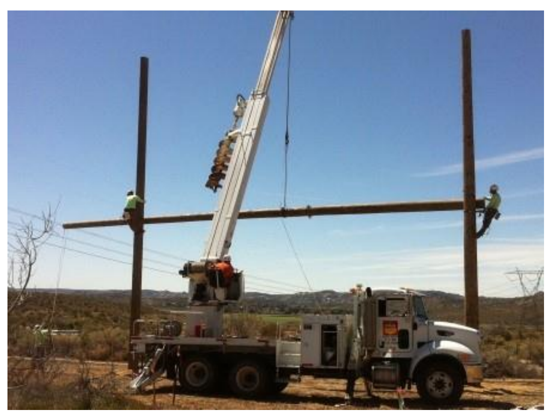
Guard pole installation over Carrizo Gorge Road, near Tower EP243. (Link 1)