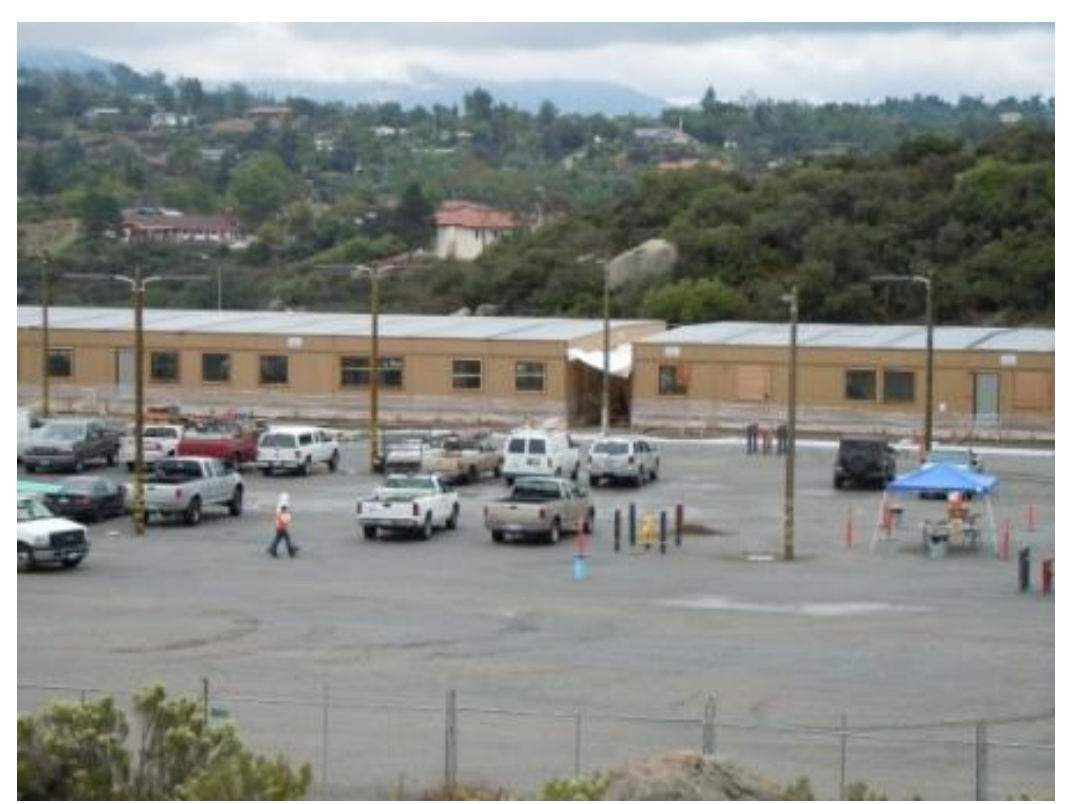
Alpine RFO with Class II base installed and continued installation of modulars.