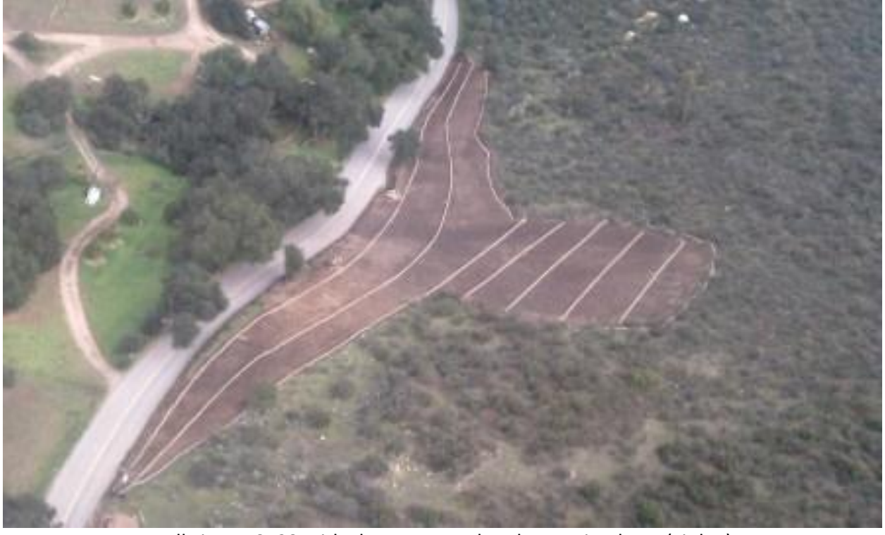
Pull site at CP23 with slope restored and BMPs in place. (Link 5)