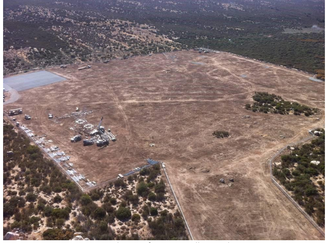
Aerial view of McCain Valley Yard.