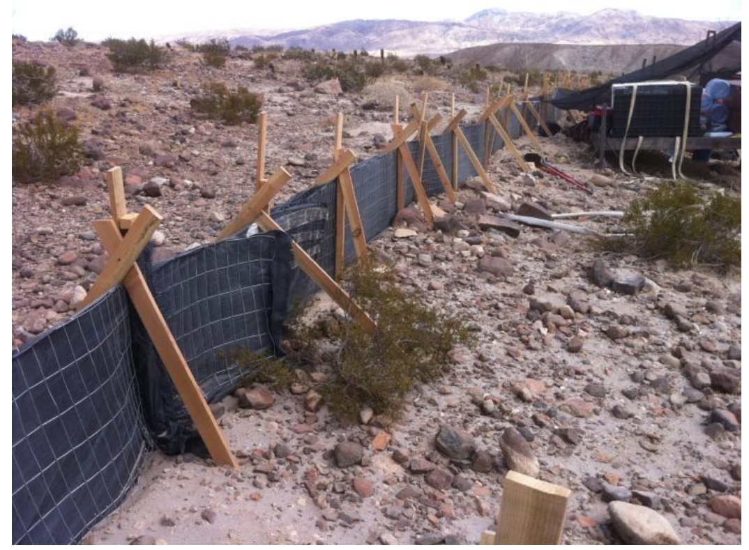
Example of gecko exclusionary fencing (installed at EP280-2). (Link 1)