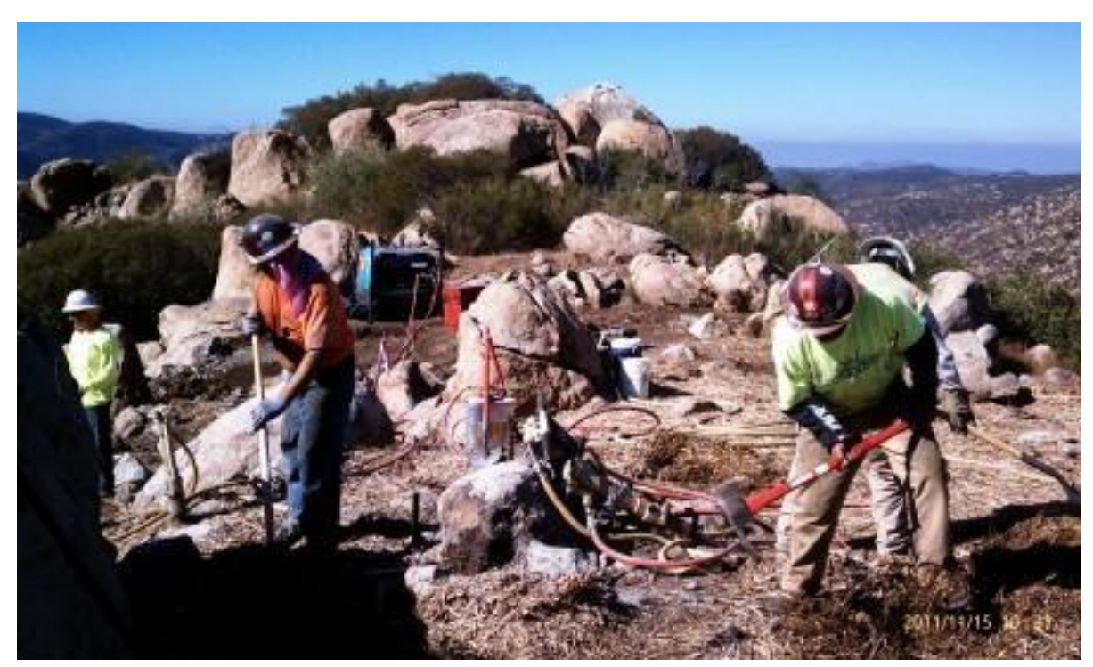
Brush clearing boulder busting crew at EP6-1 TSAP. (Link 2)