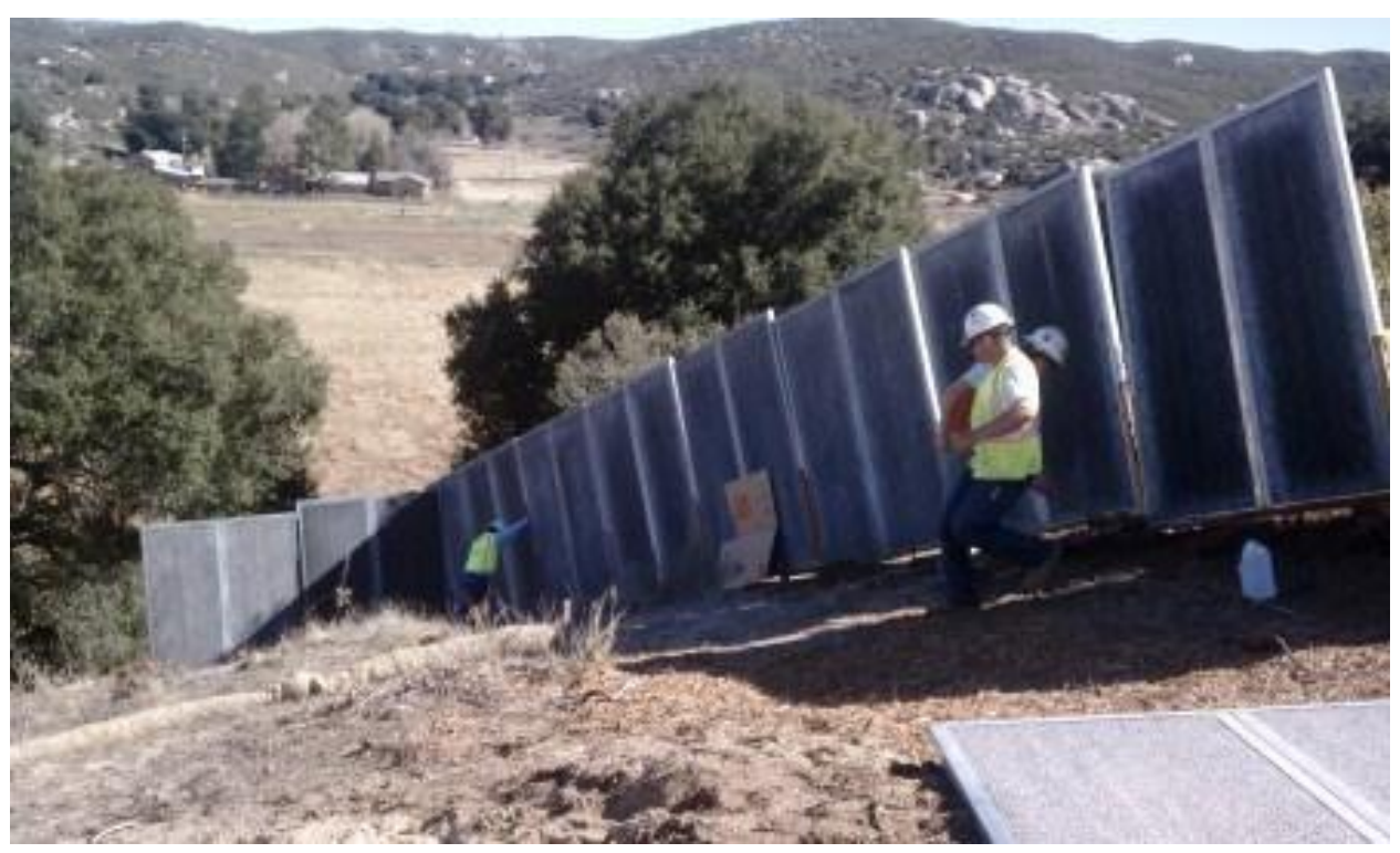
Construction of a sound wall at EP119. (Link 2)