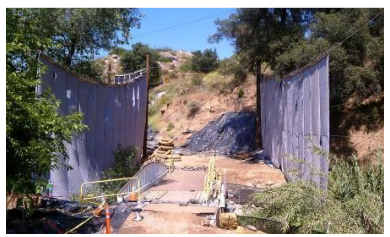
Acoustic blankets installed at Bauer Bridge, Link 4