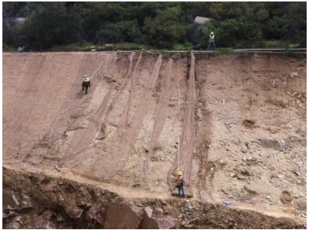
Jute installation along cut slopes at Suncrest Substation. (Link 3)