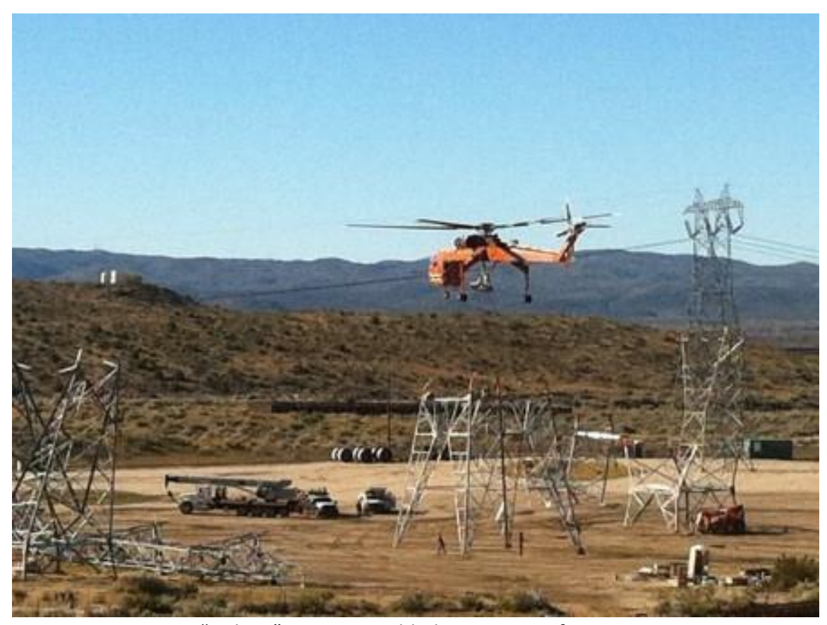
Aircrane "picking" a pre-assembled tower piece for Tower EP228.