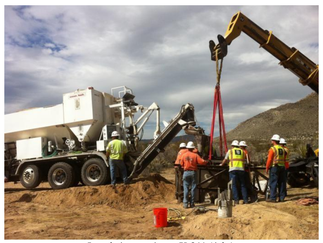
Foundation pouring at EP 244, Link 1.