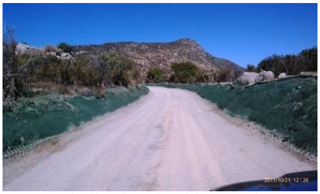
Hydromulching with green indicator ink along La Posta Road.