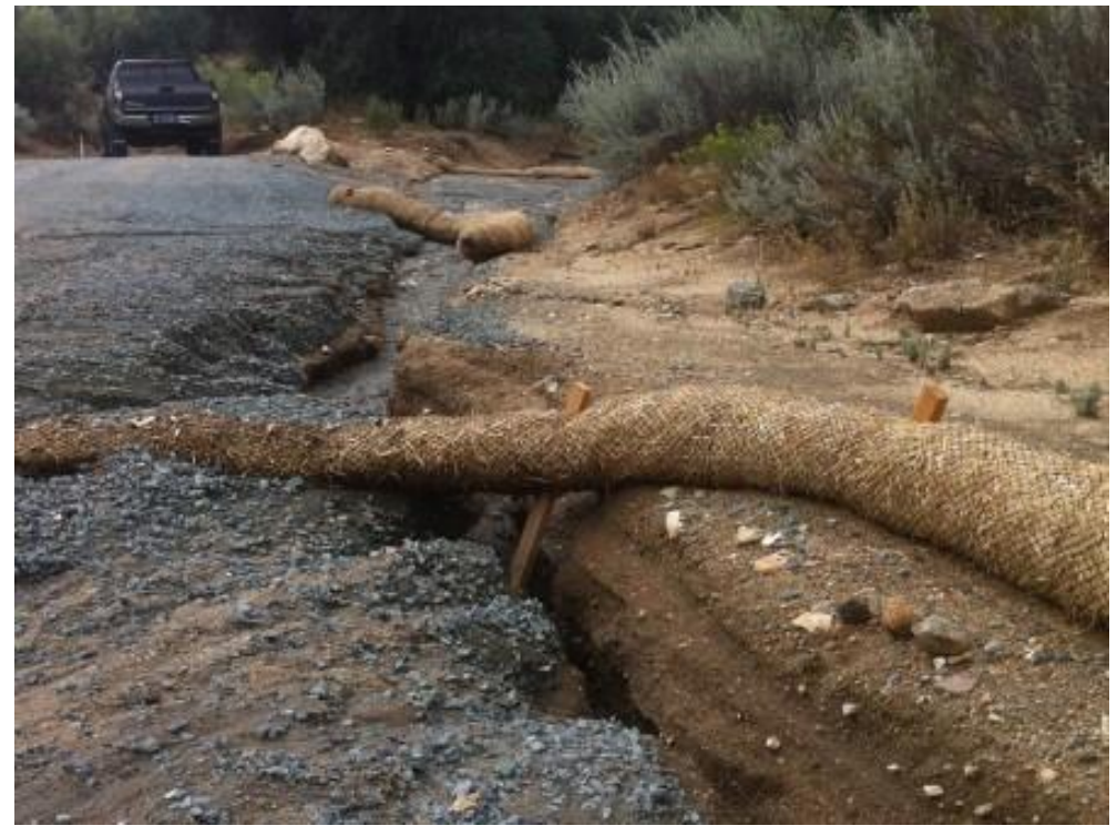
Failed BMP along La Posta Road. (Link 2)