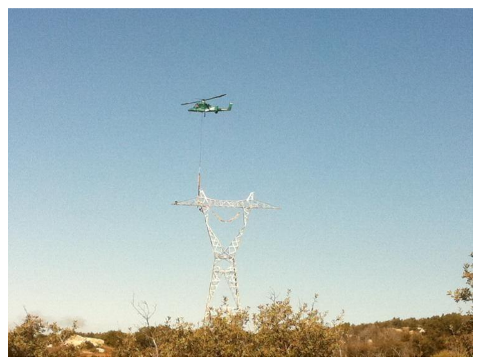
Insulator installation at EP217, Link 1.