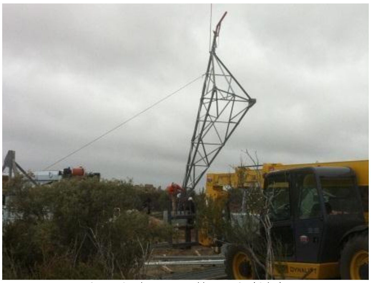
Conventional tower assembly at EP191. (Link 1)