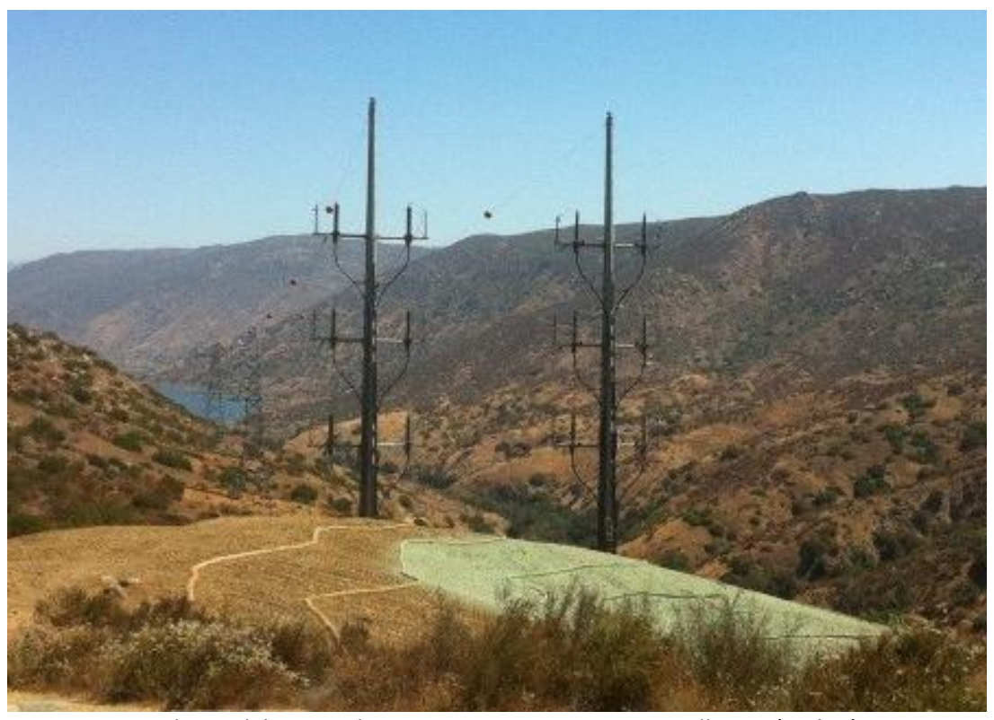
Hydromulching and restoration at CP87 CP88 pull site. (Link 4)