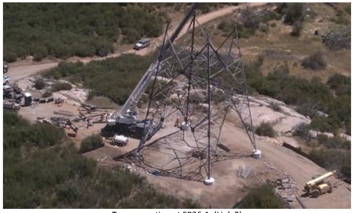
Tower erection at EP36-1. (Link 2)