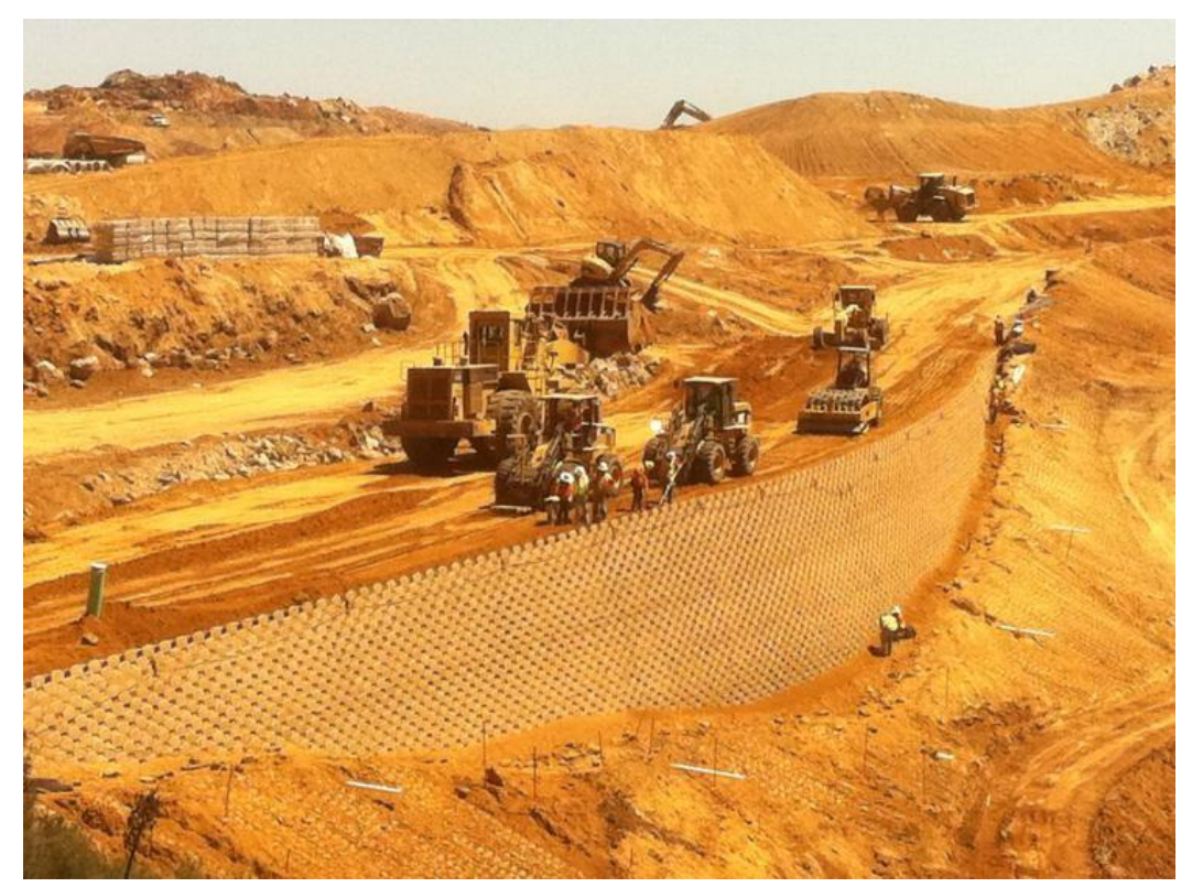
Block retaining wall along northern drainage, Link 3.