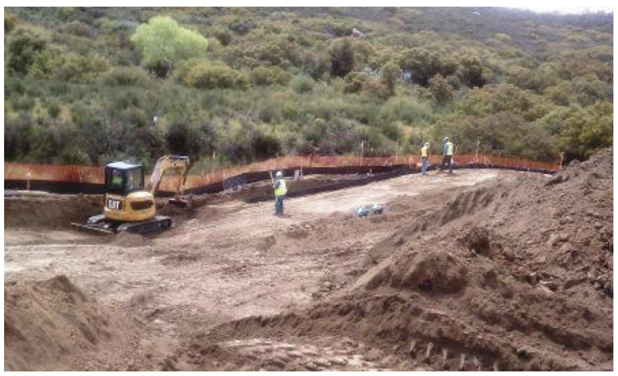
Grading occurring on the Loritz Property, Link 4.