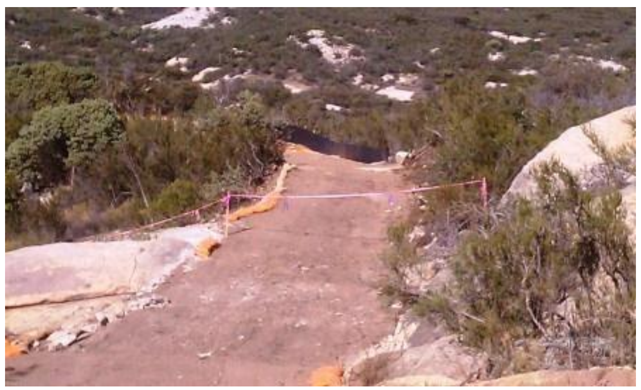
Access road to EP58-2 closed due to USFS-related work shutdown.