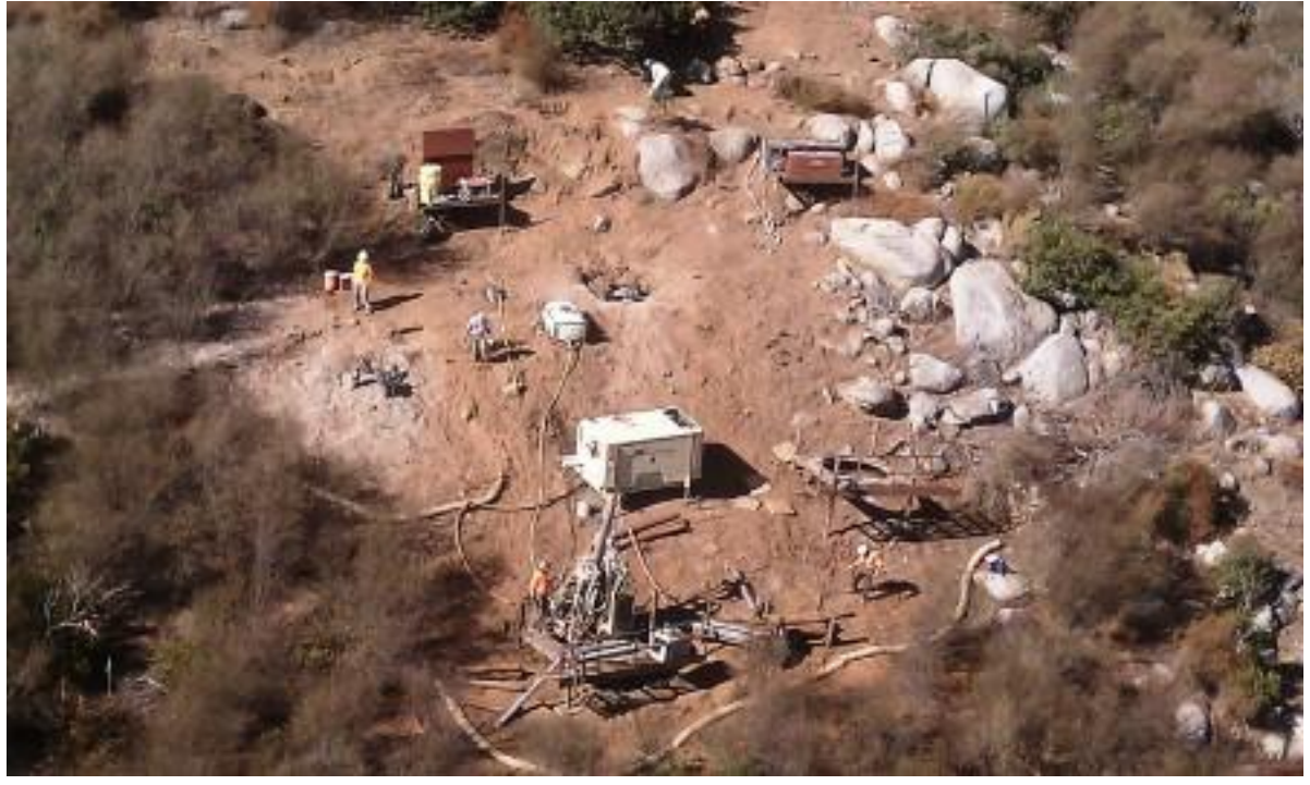
Aerial view of micropile operation at CP72-2. (Link 5)