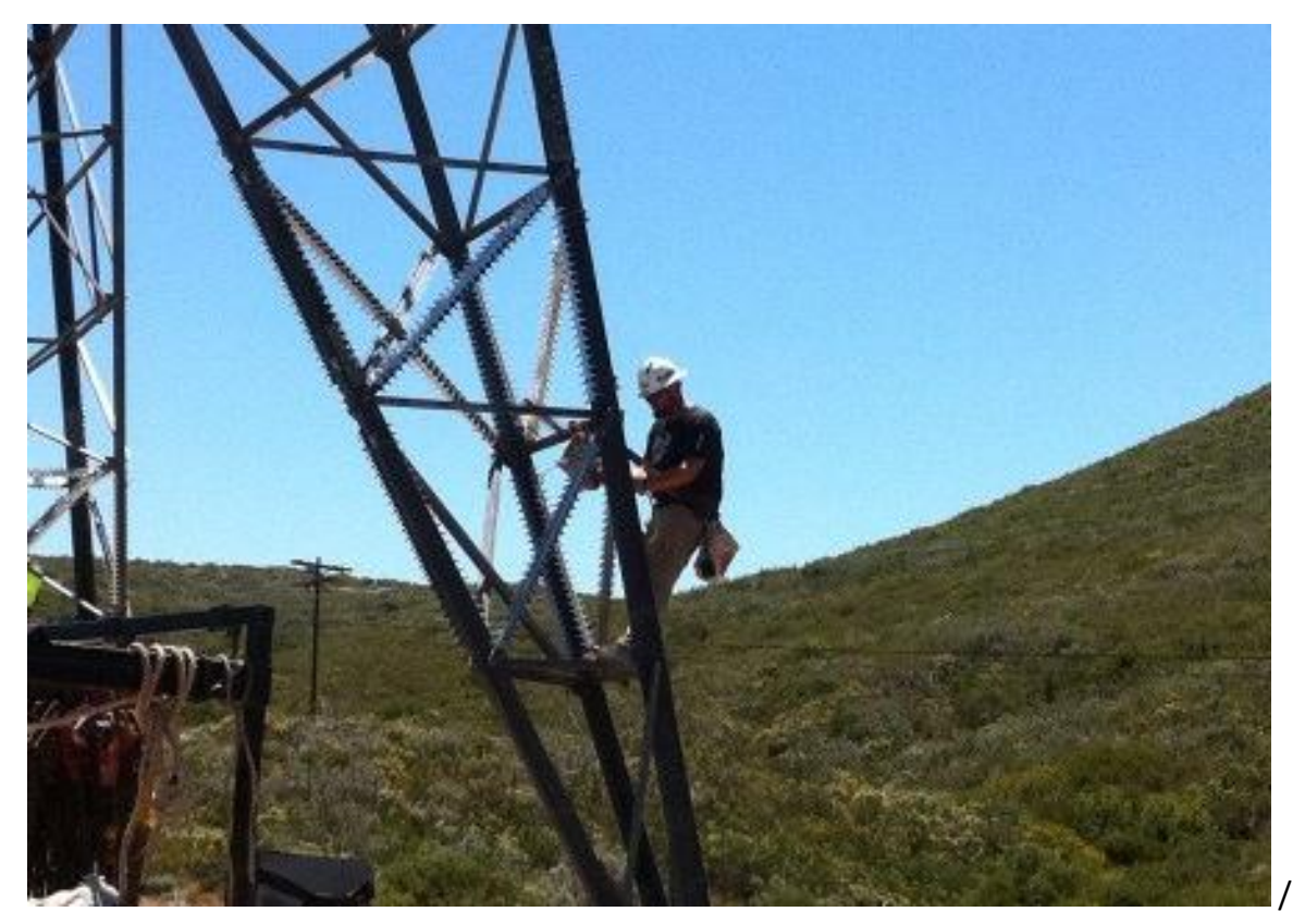
Installing anti-climbing guards at EP27-1. (Link 2)