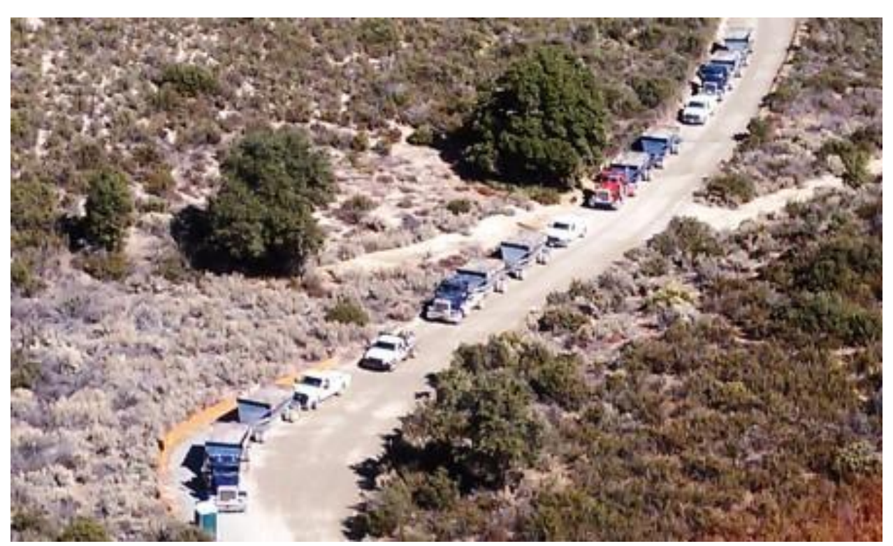
Traffic control on USFS land along La Posta Road. (Link 2)