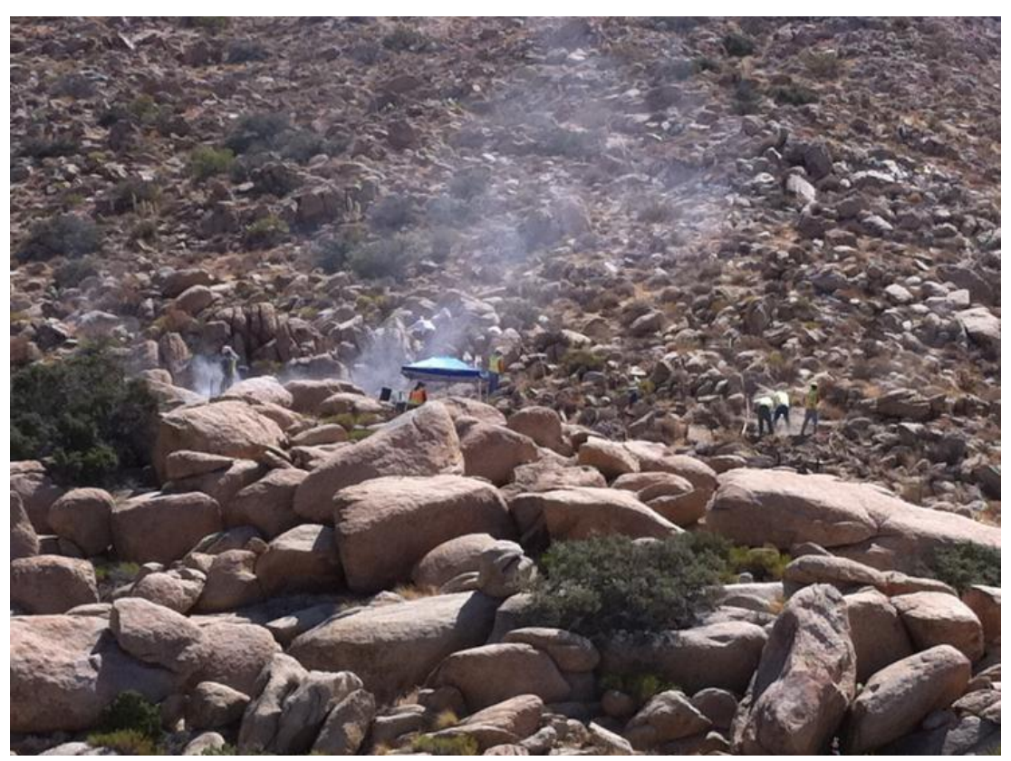
Breaking boulders and site preparation work at EP261-1. (Link 1)