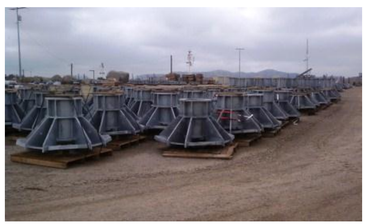
Bird nesting deterrents installed on materials at Alpine Yard.