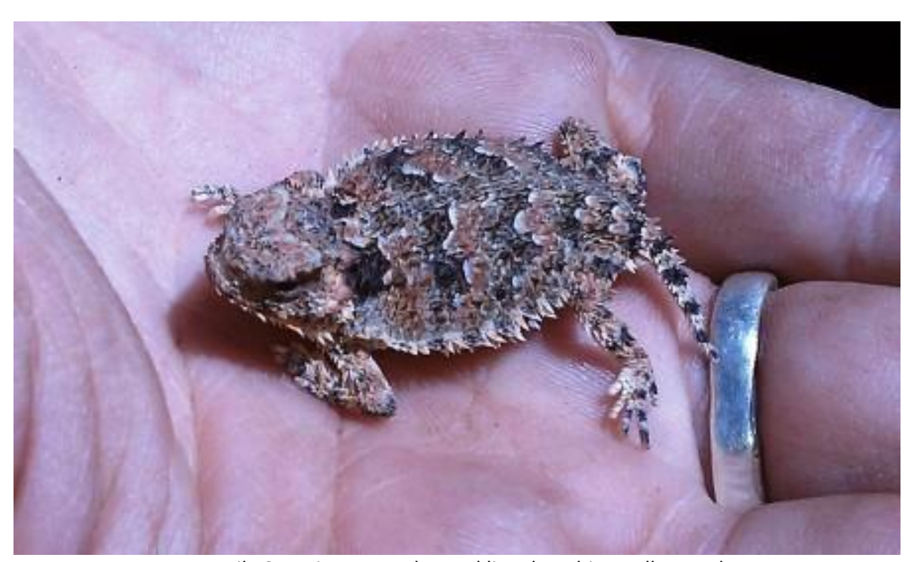
Juvenile San Diego coast horned lizard at Thing Valley Yard.