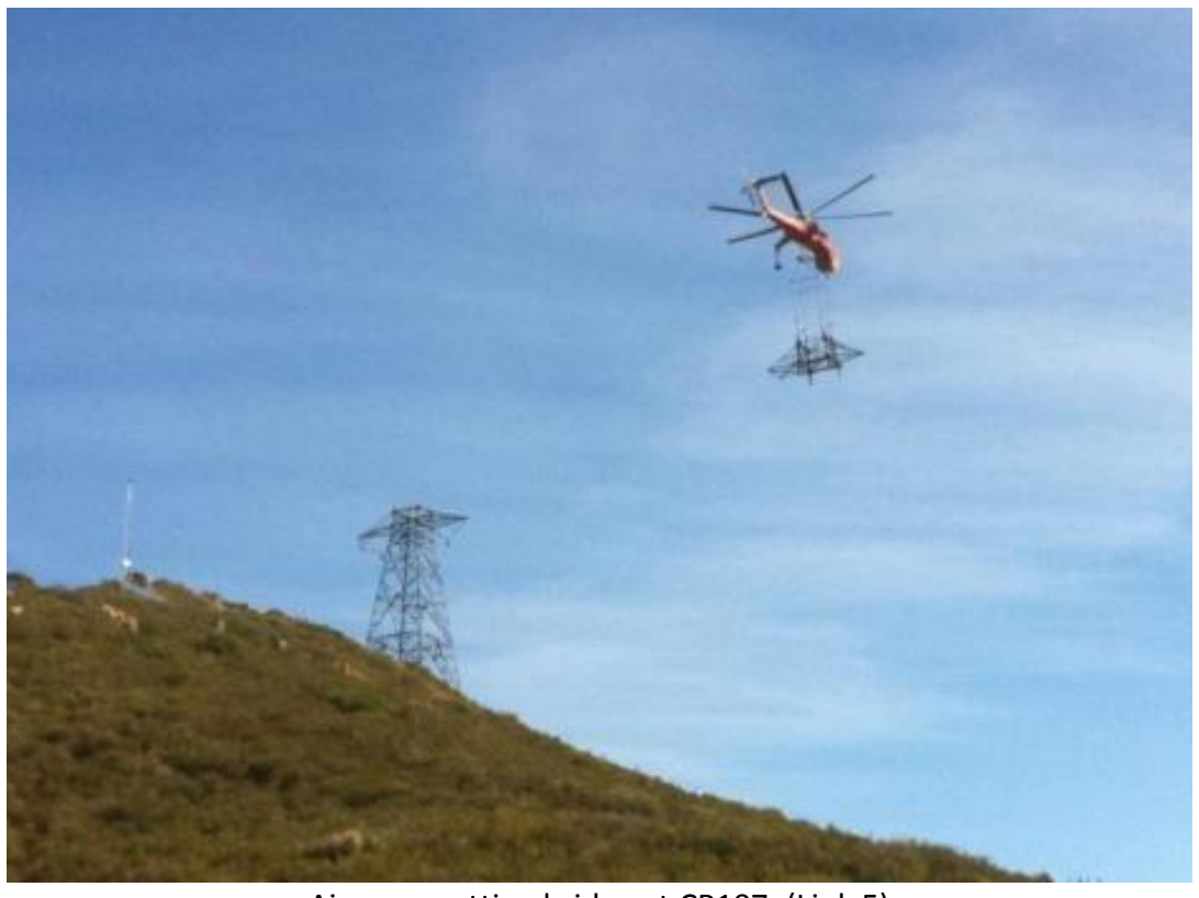
Aircrane setting bridge at CP107. (Link 5)