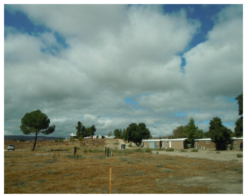
Rough Acres lodge and cabin complex.