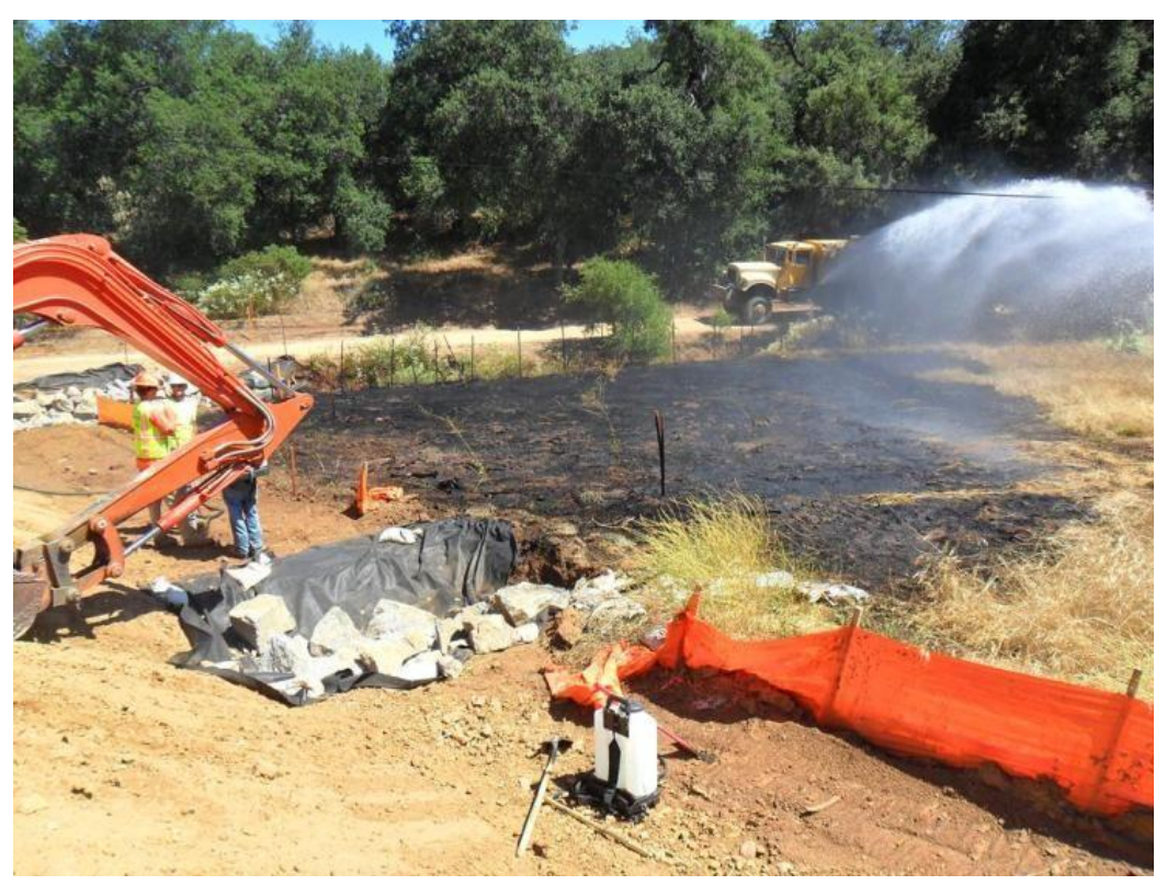
Fire incident at Suncrest Substation, Link 3.