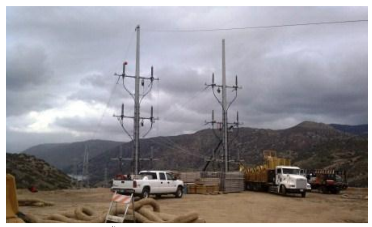
Wire pulling operations at transition structure CP88-1.