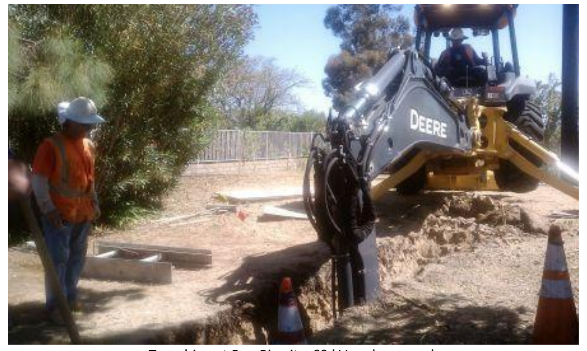
Trenching at Rue Biarritz, 69 kV underground.