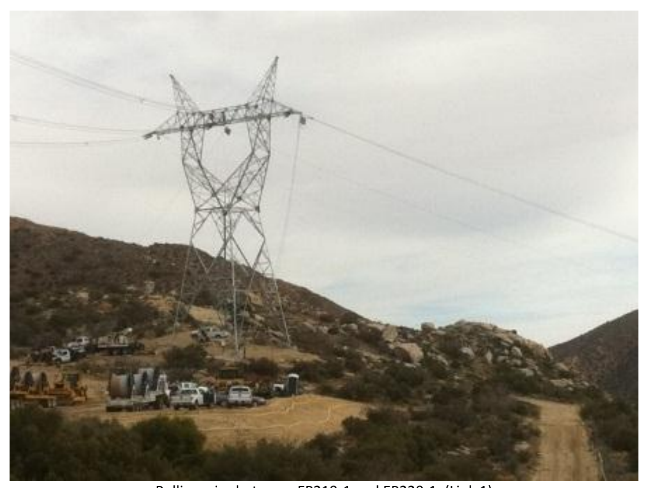
Pulling wire between EP219-1 and EP220-1. (Link 1)