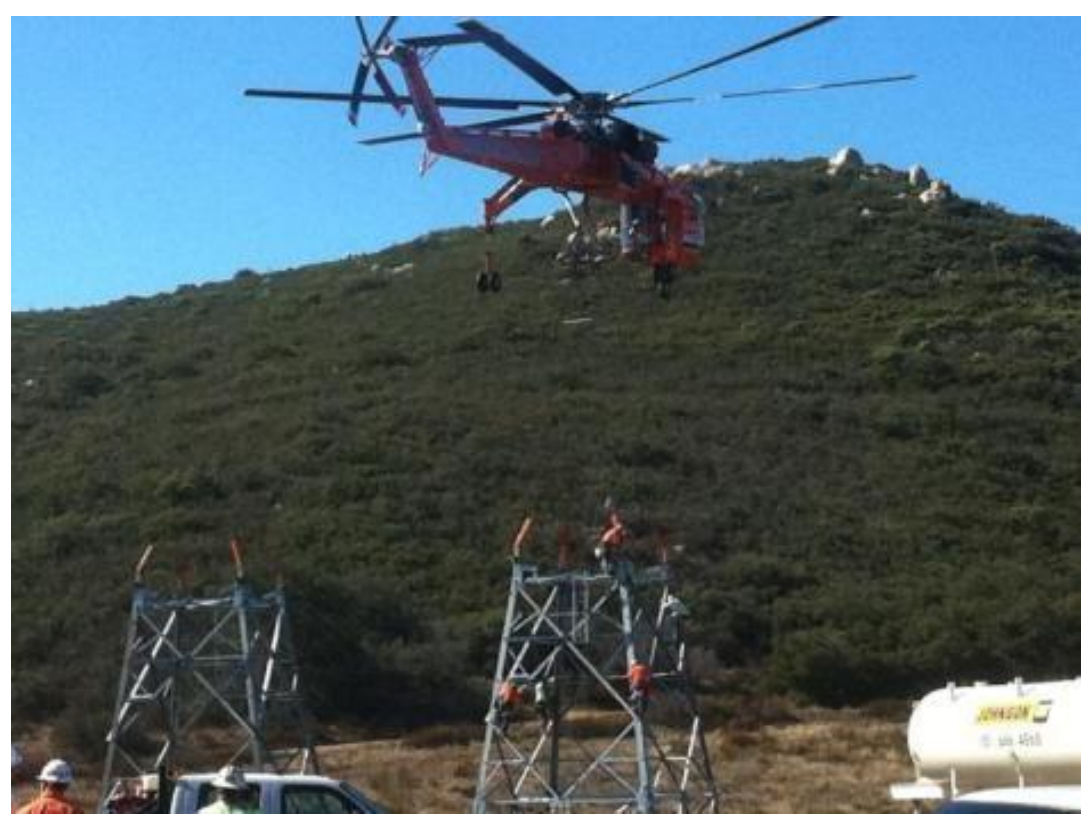
Aircrane getting ready to pick a tower at Wilson Yard.