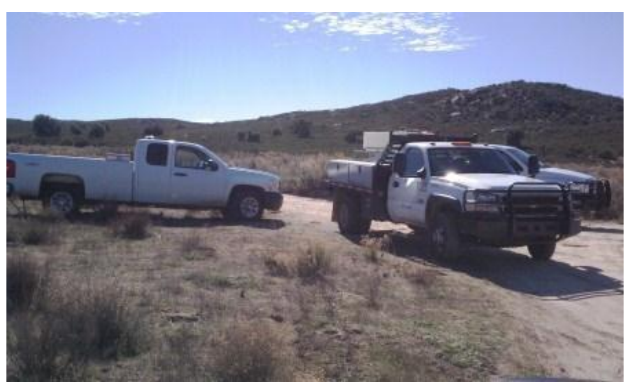
Vehicles parked on brush outside of the right-of-way near EP109. (Link 2)