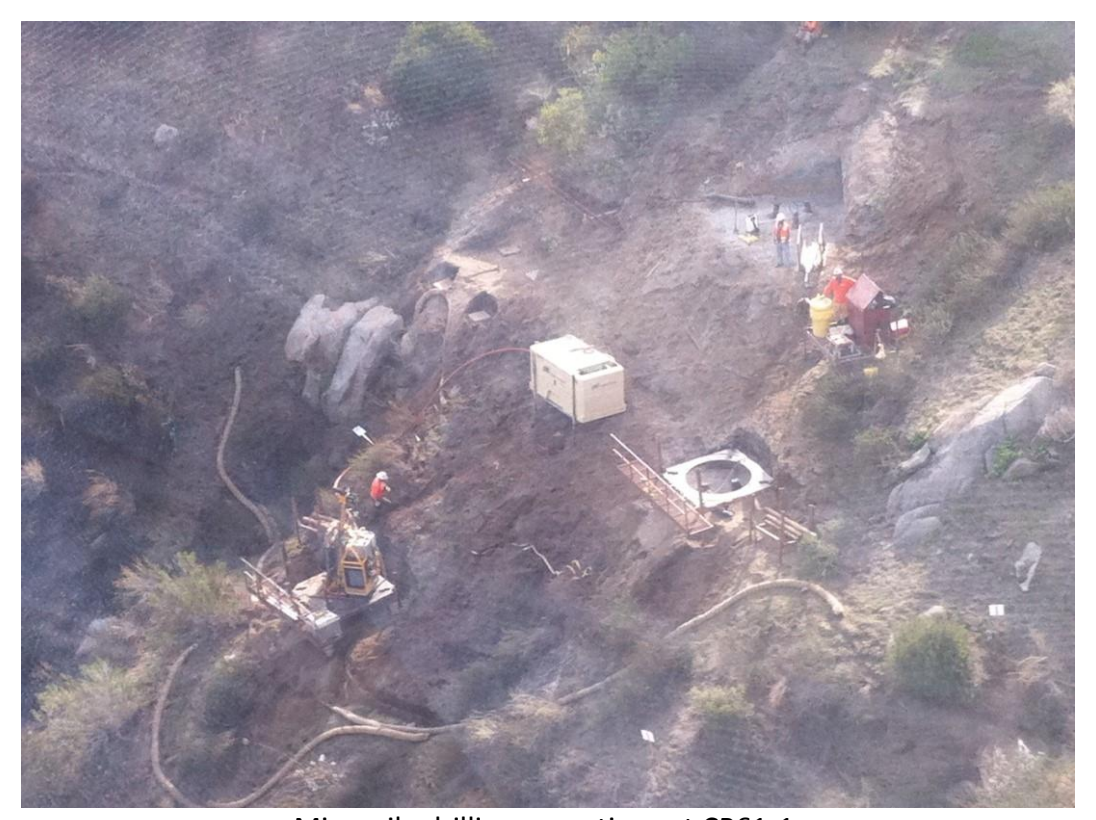
Micropile drilling operations at CP61-1.