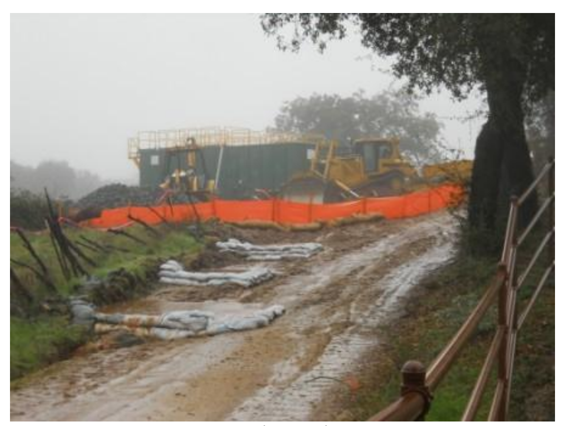
BMPs at Suncrest Substation during rain event.