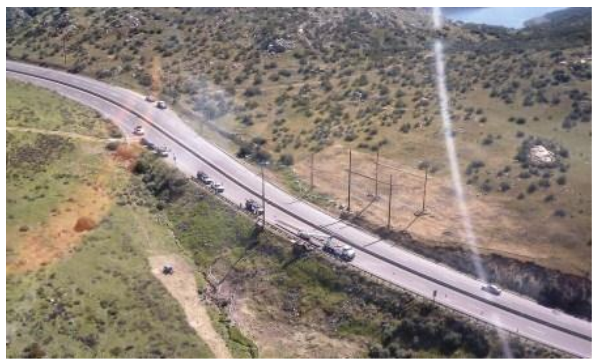
Installation of guard structures across Highway 67 near EP36. (Link 5)