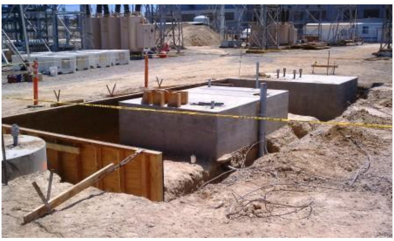
Wood work for pouring concrete foundation at Encina Substation.