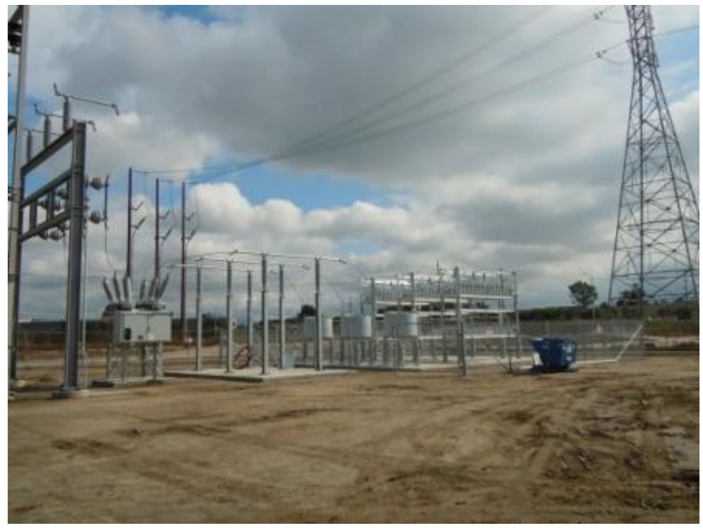
69 kV capacitor bank at South Bay Substation.