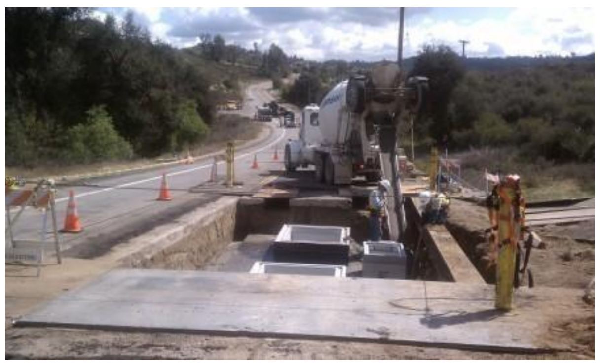
Concrete being poured at Vault 2L, Link 4.