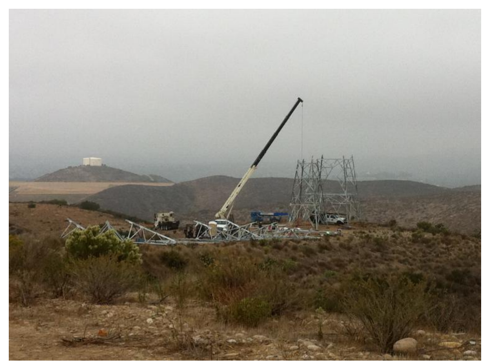
Tower assembly at Sycamore Estates Yard. (Link 5)