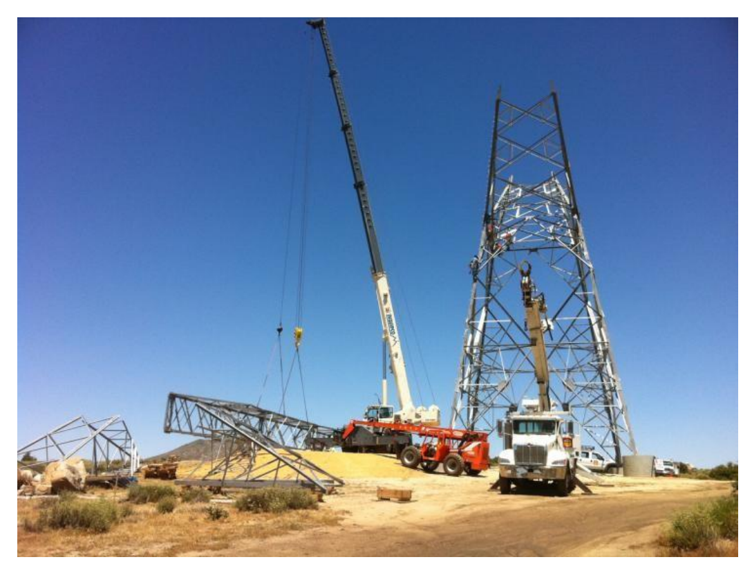
Conventional tower assembly at EP211, Link 1.