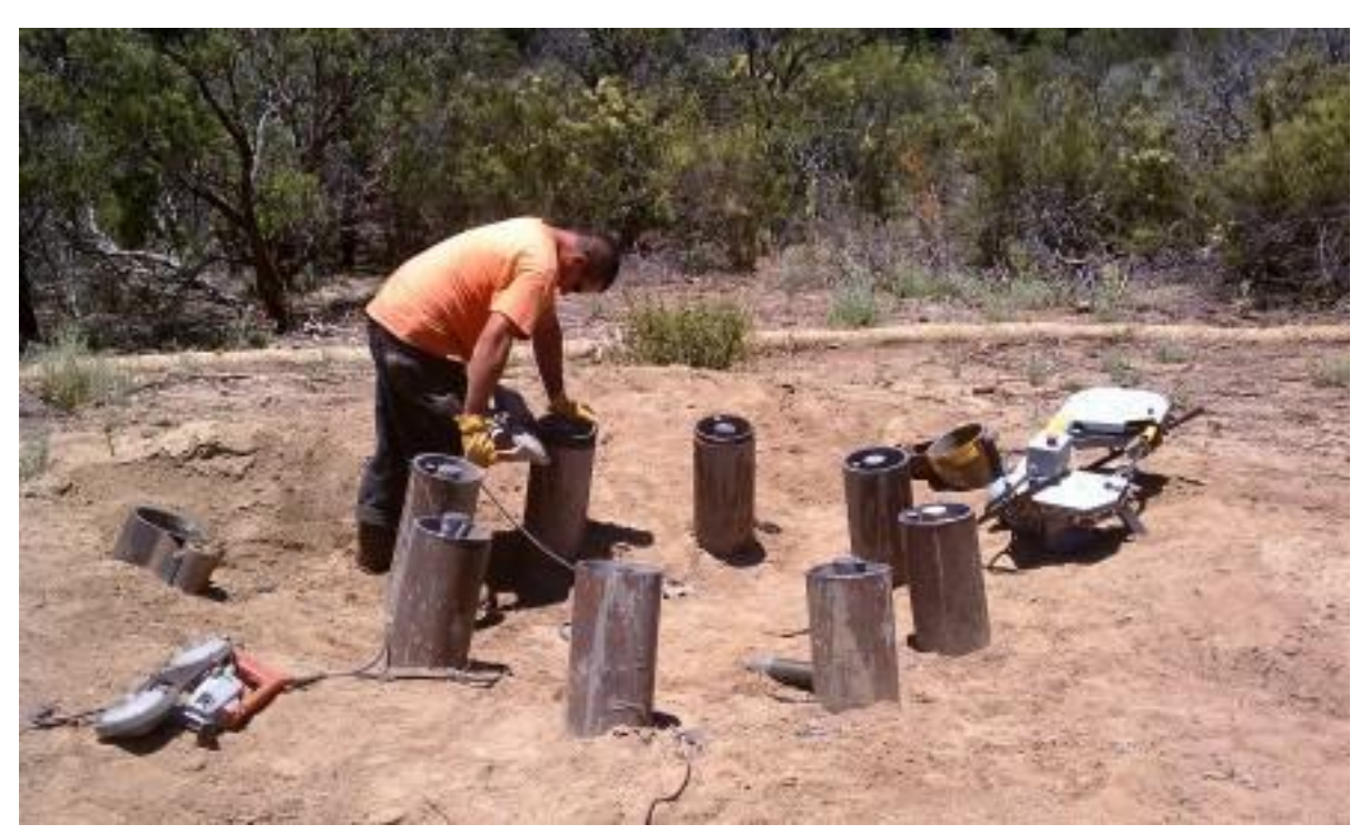
Trimming micropiles at EP 85-2, Link 2.