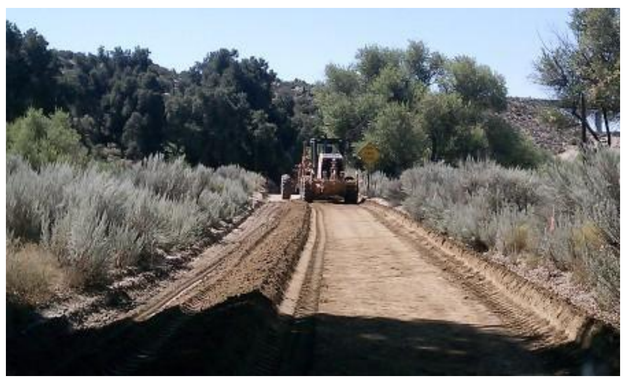
Grading of La Posta Road on USFS land. (Link 2)