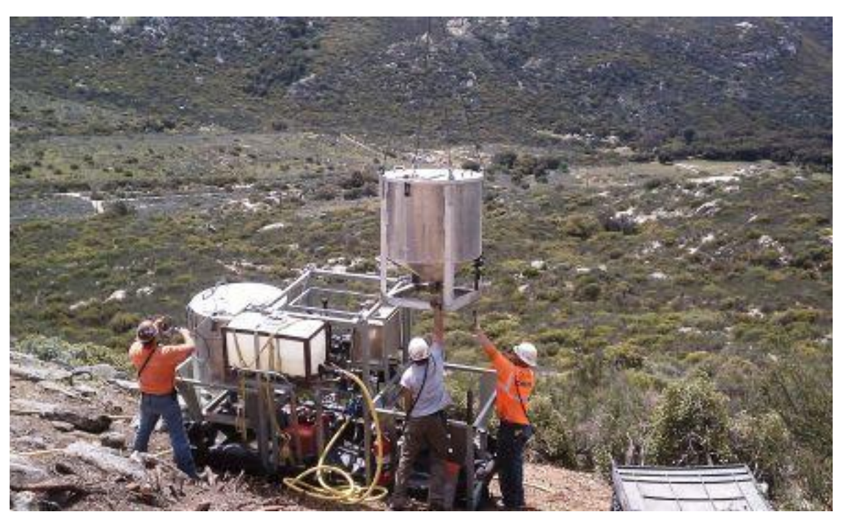
Crew securing new container of grout during helicopter delivery, Tower EP 81, Link 2.