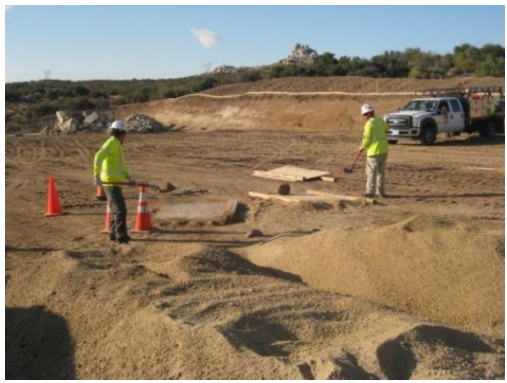
Crews covering foundations holes per the Mitigation Measures at EP219 pull site. (Link 1)