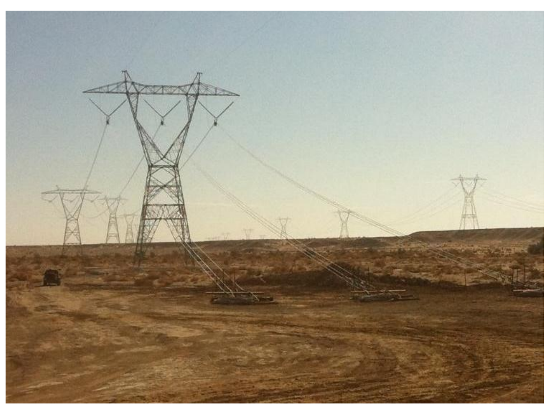
Wire and snubs at EP322 EP323 pull site. Temporary mats have been removed. (Link 1)