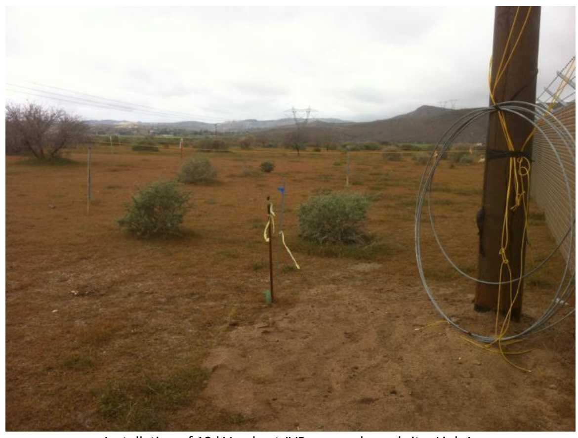
Installation of 12 kV pole at JVR on unreleased site, Link 1.