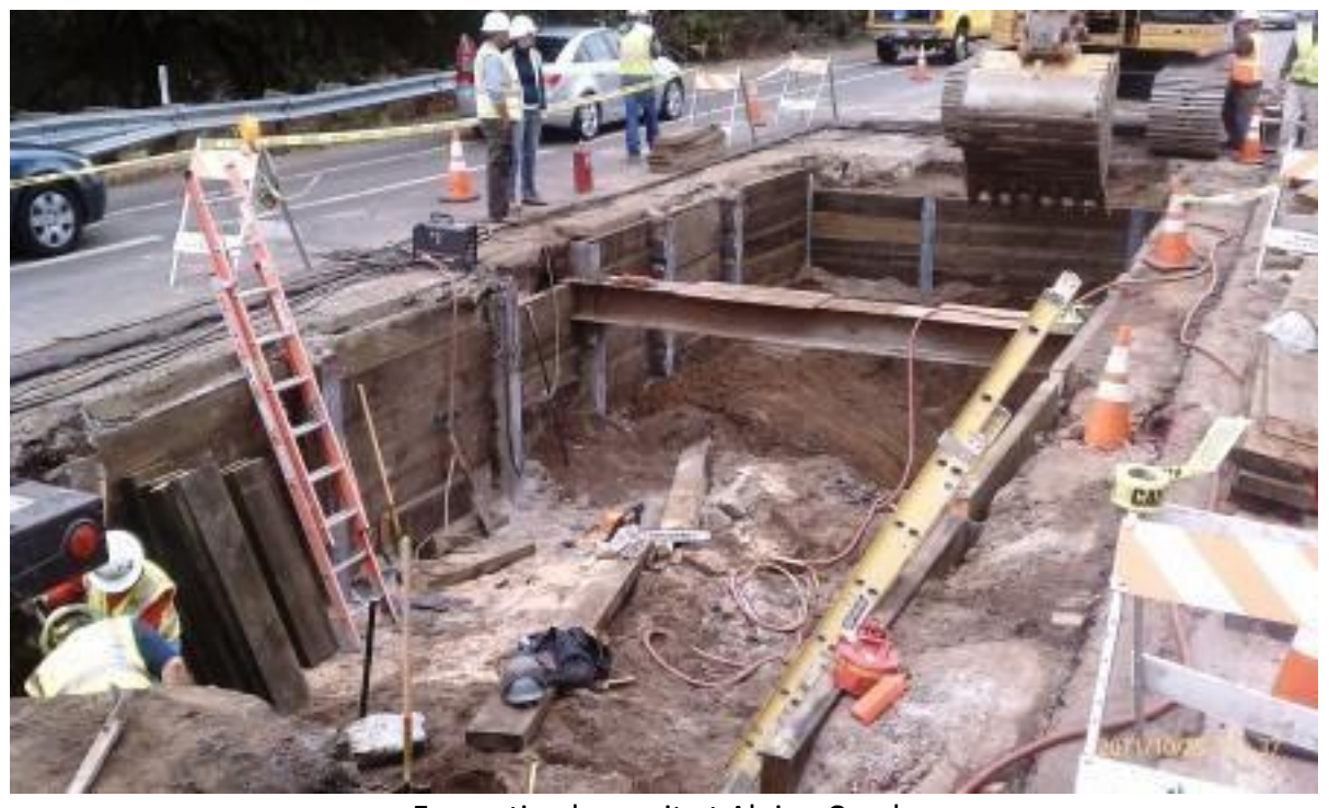
Excavating bore pit at Alpine Creek.