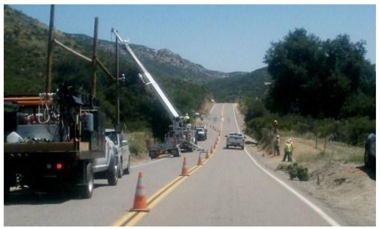
Guard structure installation on Lyons Valley Road near Tower EP24. (Link 2)