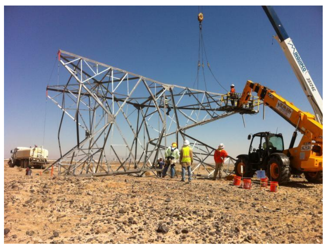
Tower section that fell on June 10, 2011, Link 1.