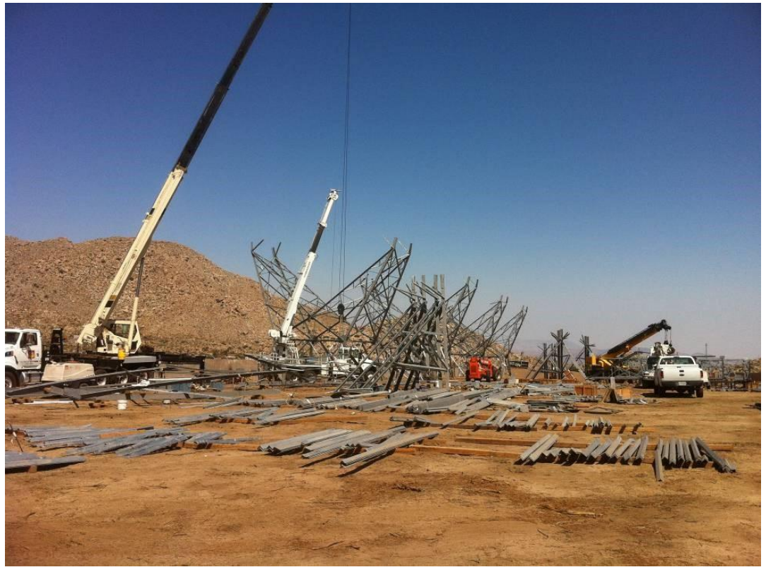
Steel assembly at Fromm Yard, Link 1.