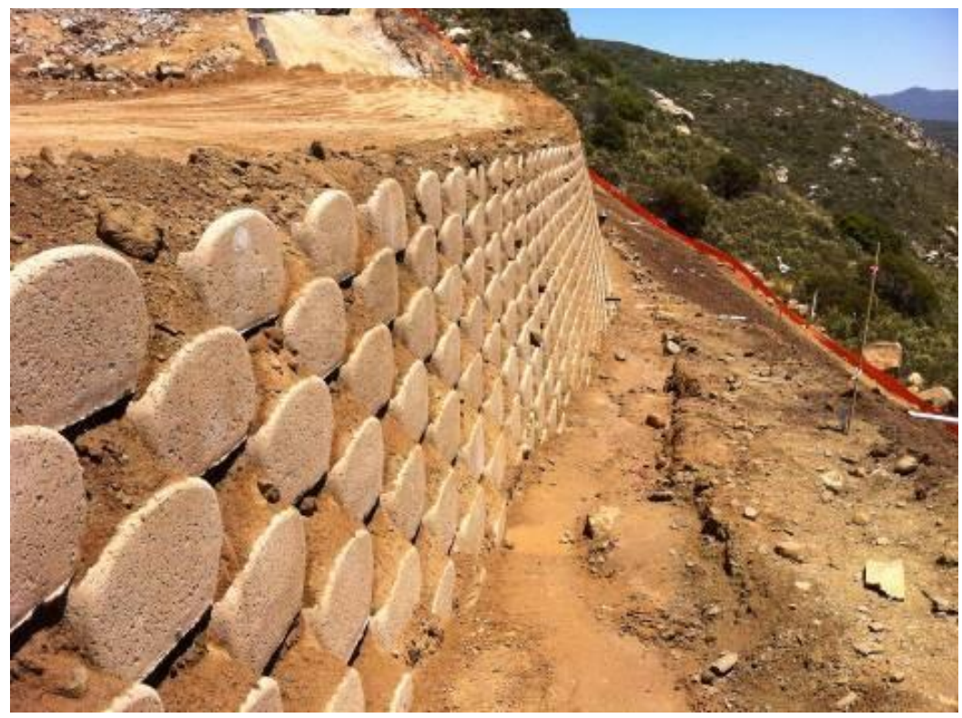
Soil retention wall in the southern portion of the pad, Suncrest Substation, Link 3.