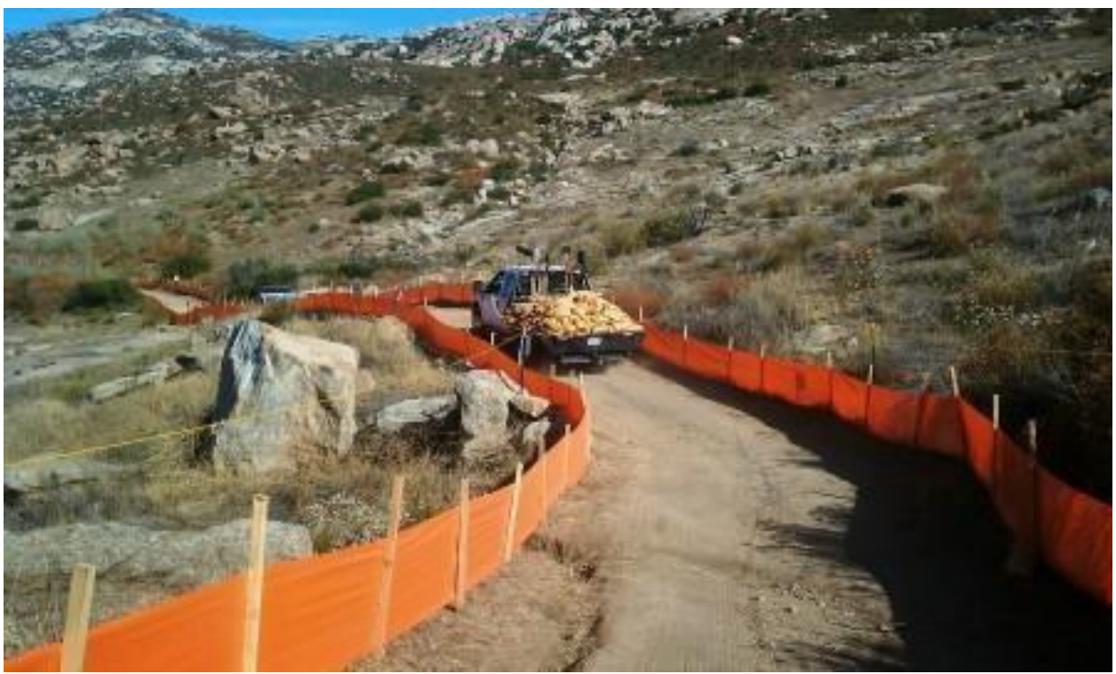
Installation of Arroyo Toad exclusionary fencing with gravel bags to prevent digging in ecologically sensitive areas. (Link 2)