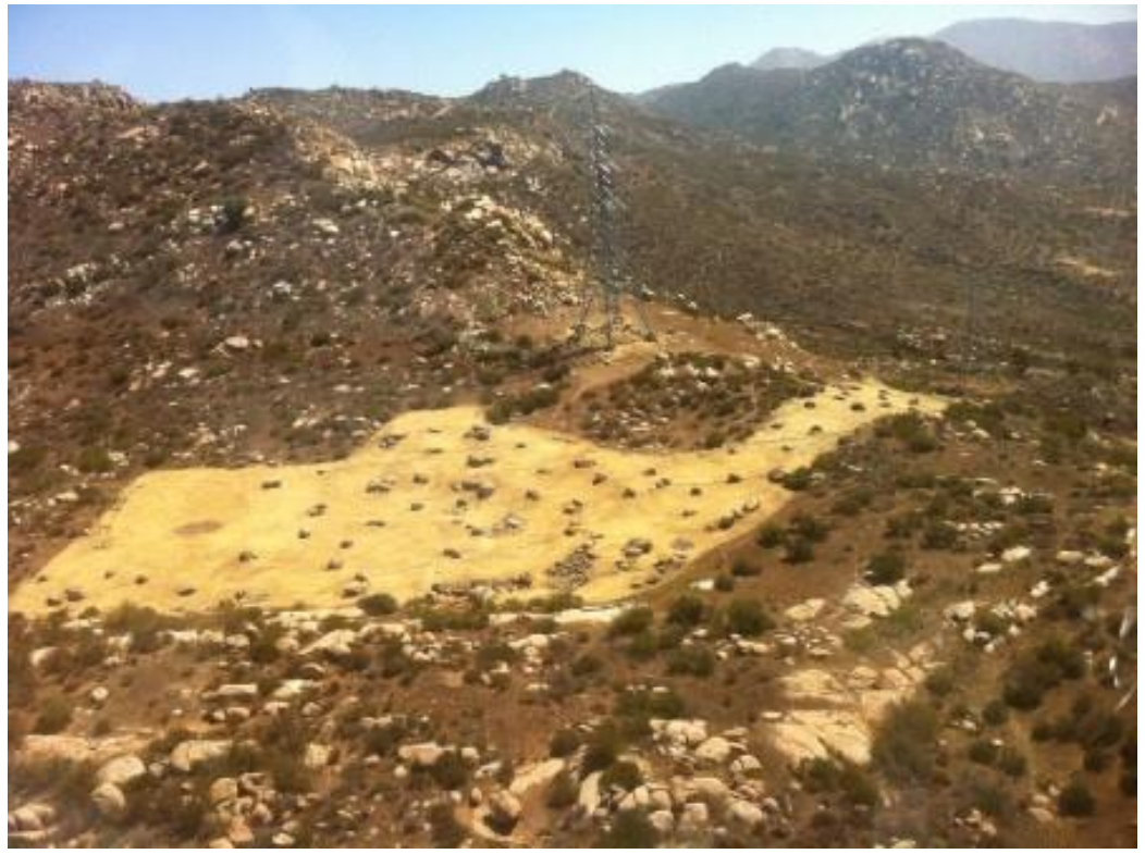
Restored area at CP49-1 pull site. (Link 5)