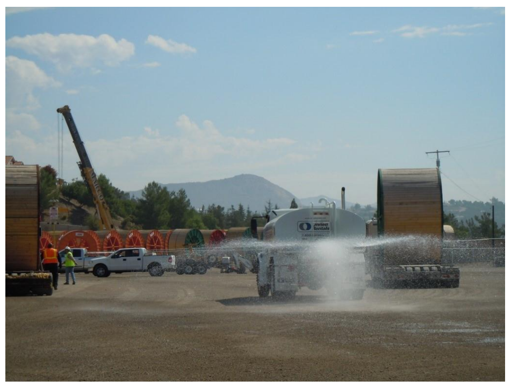
Wire delivery and environmental compliance at the Alpine Construction Yard.