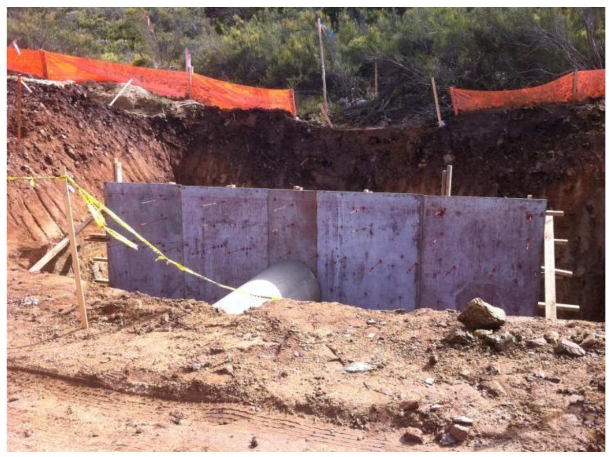
Culvert installation along BBTT, Suncrest Substation, Link 3.