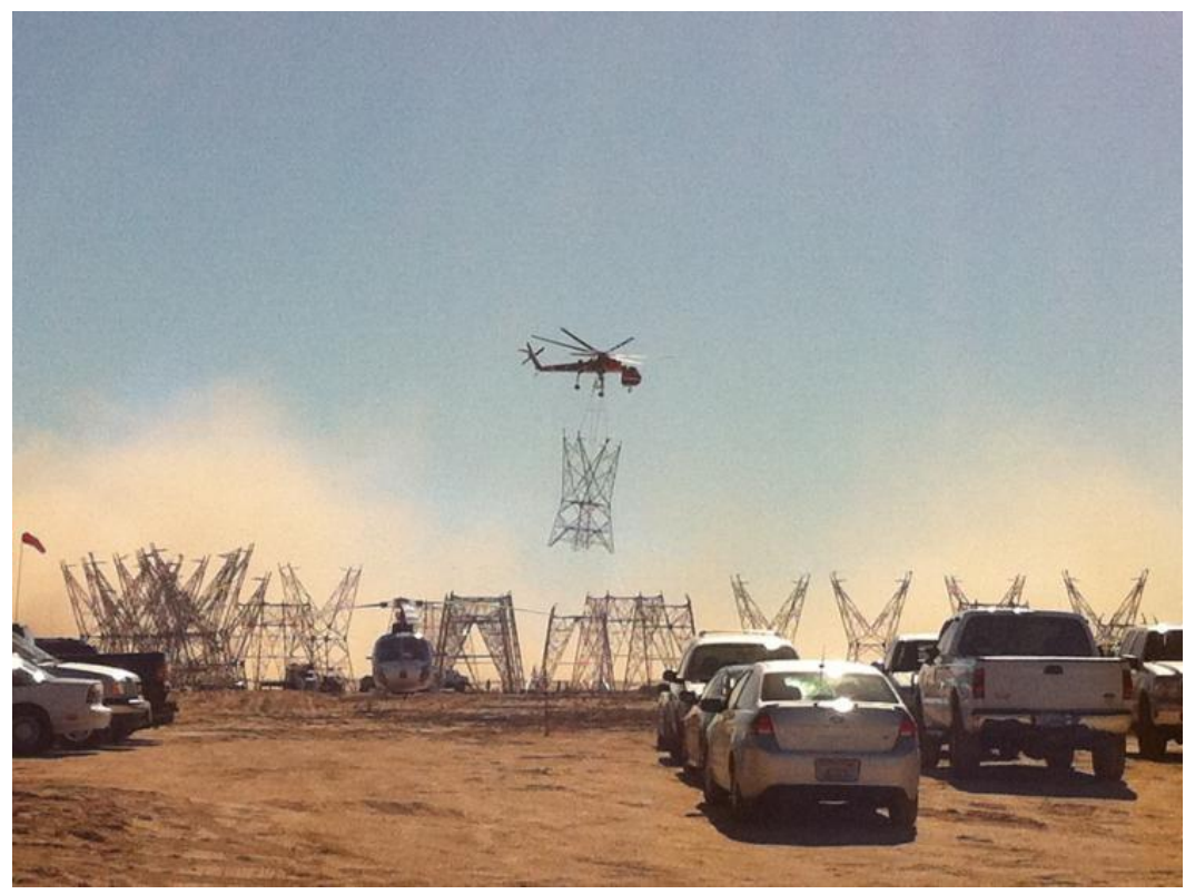
Tower lift from Plaster City Yard, Link 1.