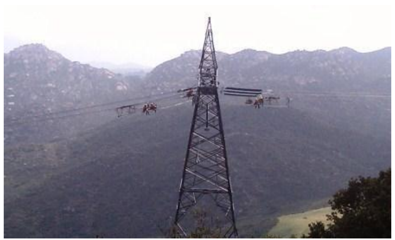
Clipping at Tower EP10. (Link 2)