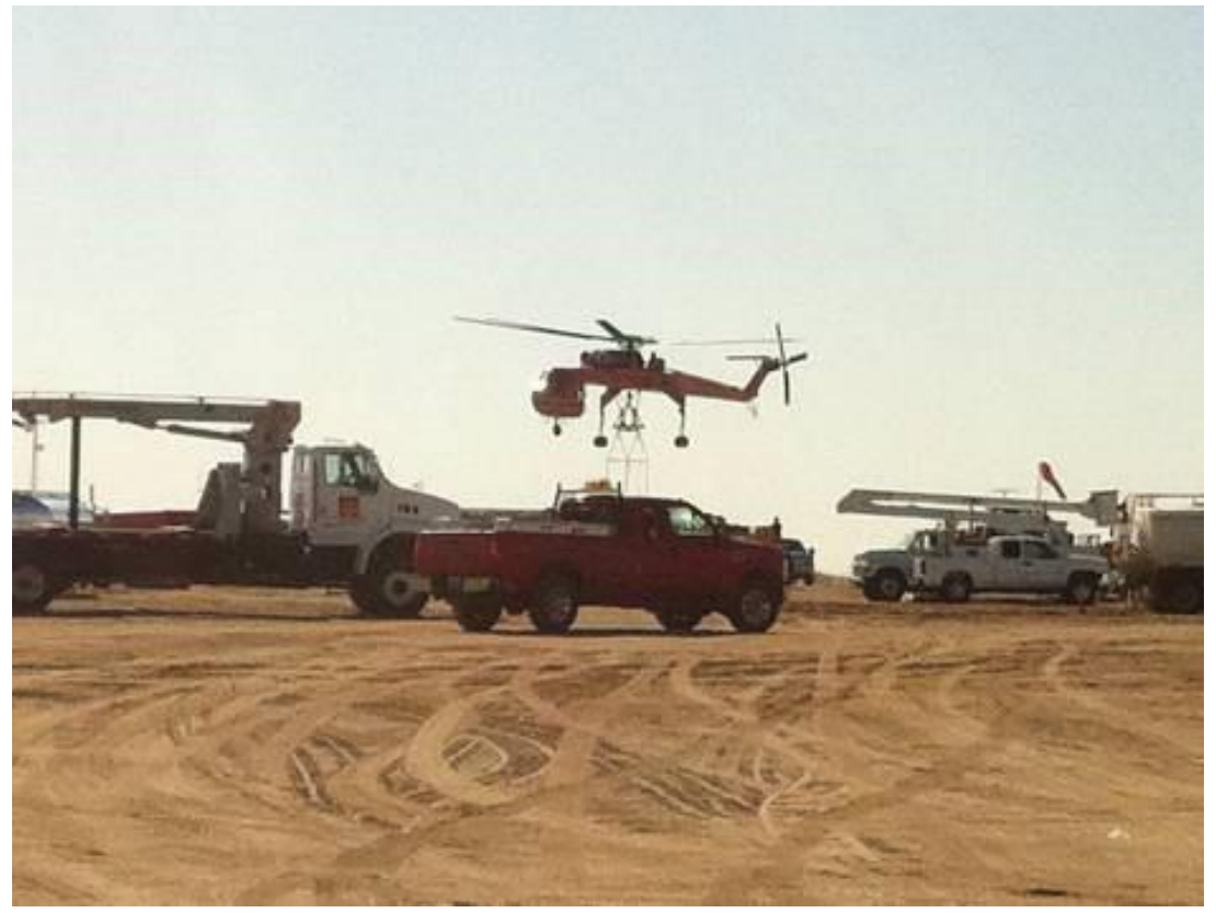
Erickson Sky Crane test flights at Plaster City Yard, Link 1.