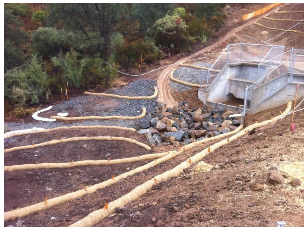
BMPs at northern dissipater, post-rain event. (Link 3)