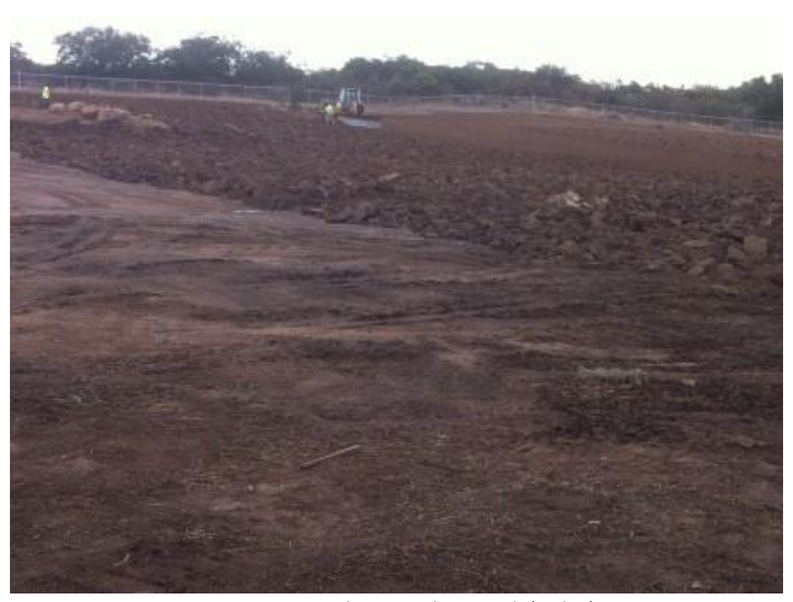
Restoration grading at Wilson Yard. (Link 3)