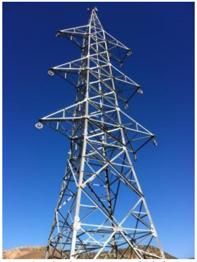
Completed tower at CP75-1. (Link 5)