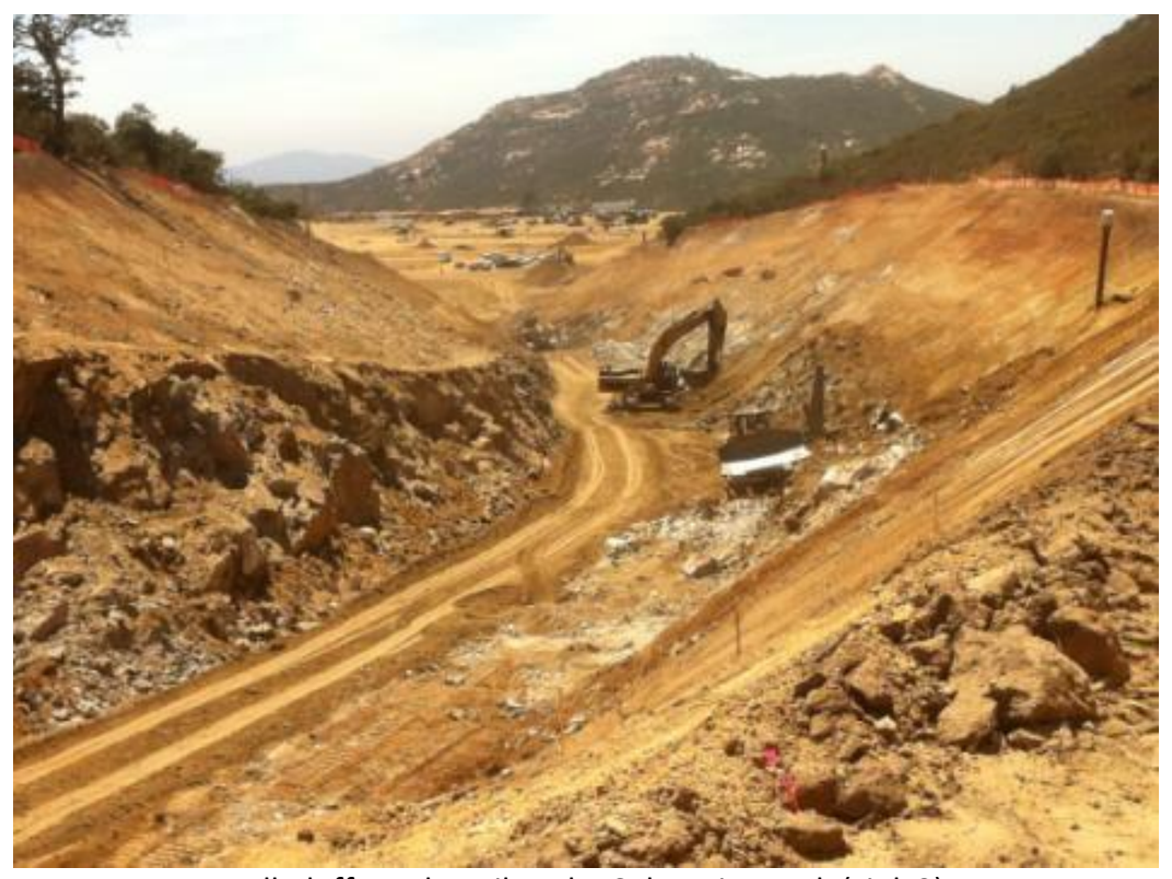
Bell Bluff Truck Trail to the Substation Pad. (Link 3)