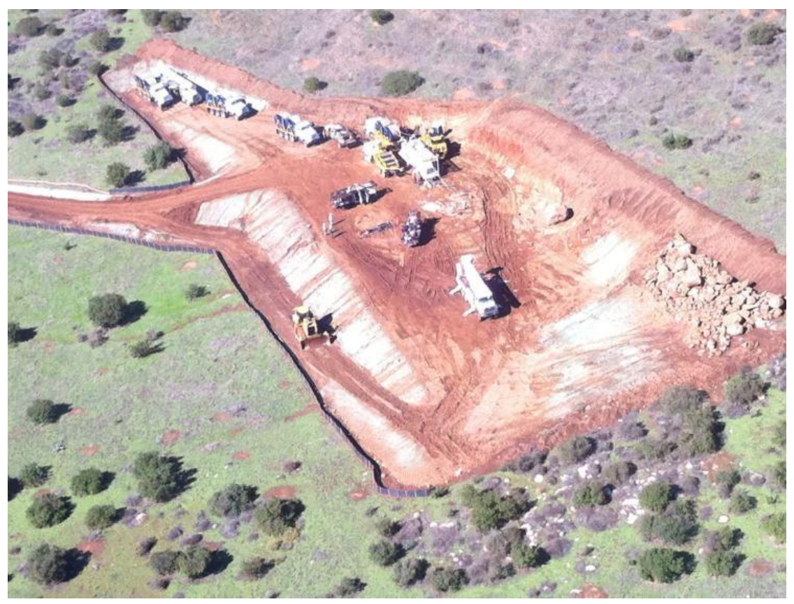
CP55 CP56-1 pull site grading activities. (Link 5)