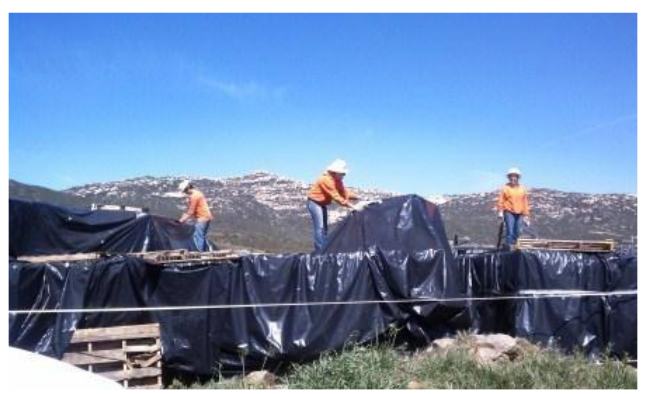
Covering of equipment to deter bird nesting at SWAT Yard.