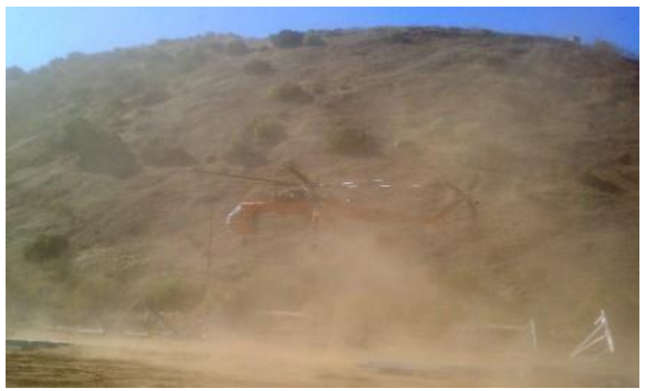
Skycrane kicking up dust while landing at Helix Construction Yard. (Link 5)