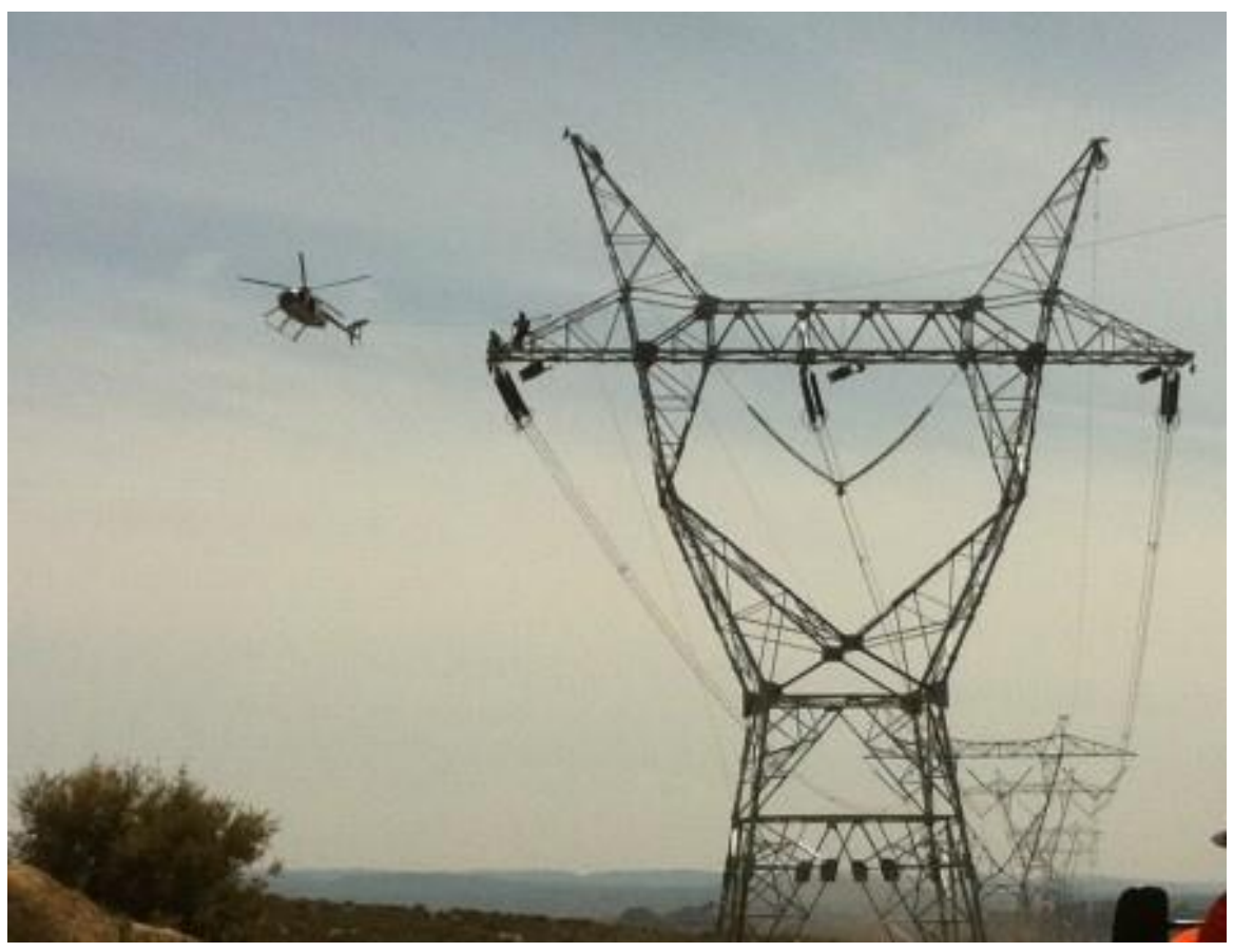
Flying sock line at Tower EP200-3. (Link 1)