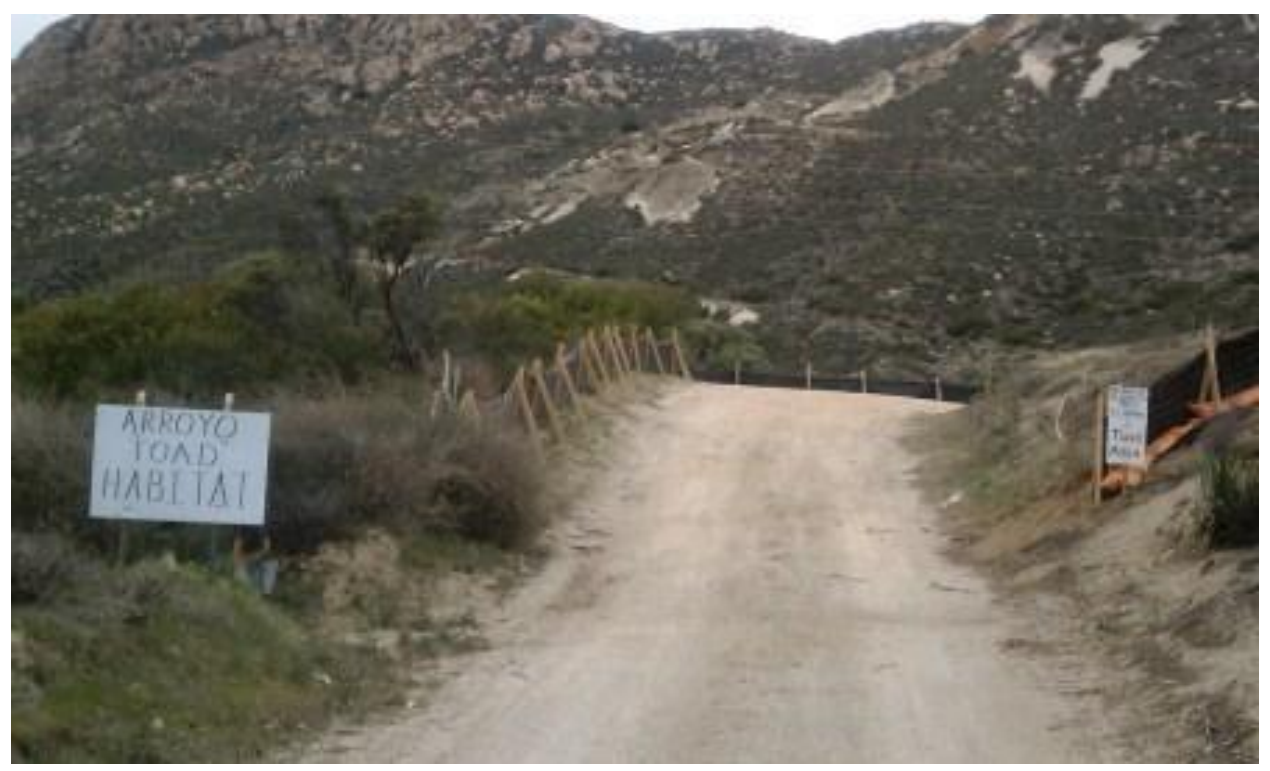
Signs marking the beginning of arroyo toad habitat, Link 2.