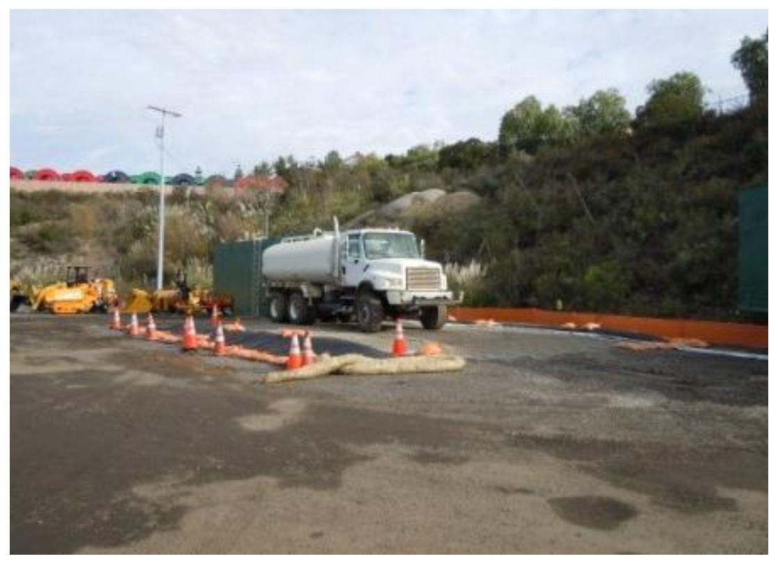
Construction yard wash station installation.