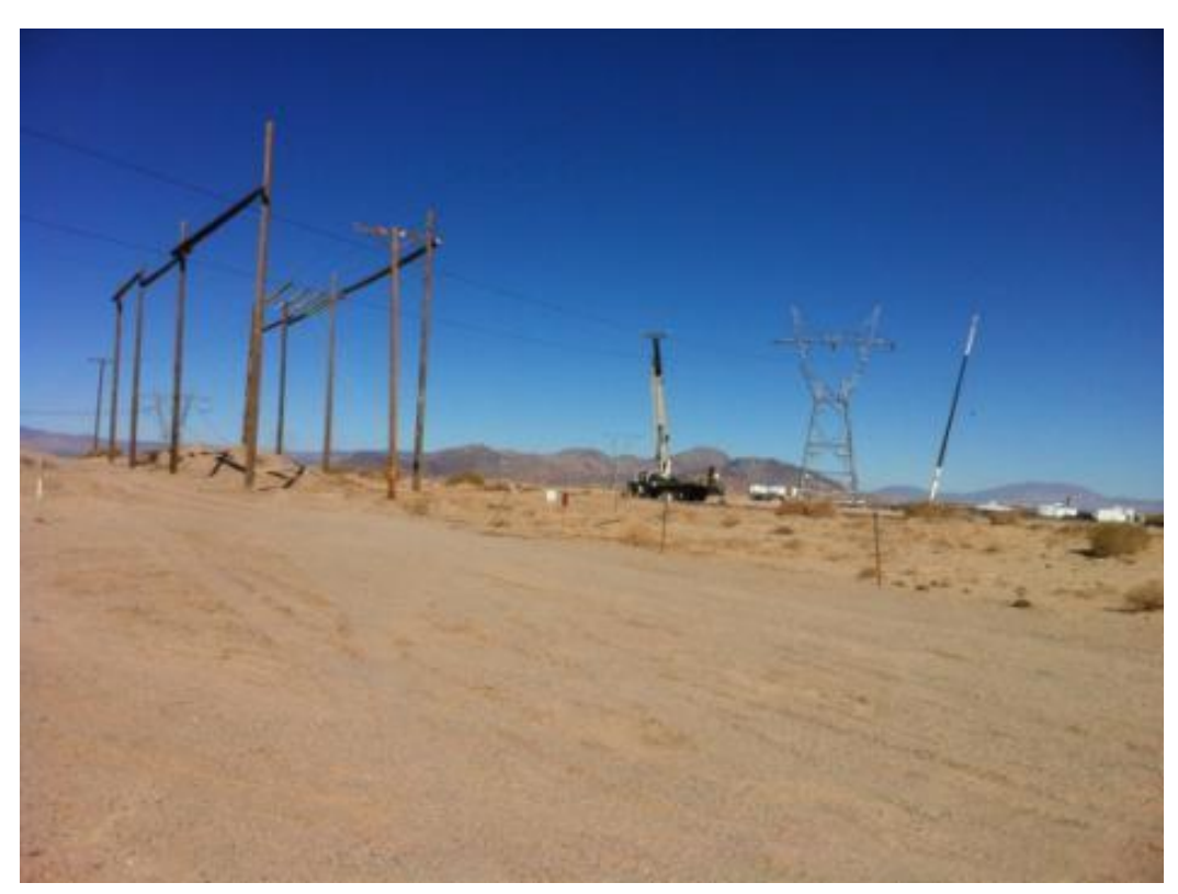
Guard structures near Evan Hewes Highway, Link 1.