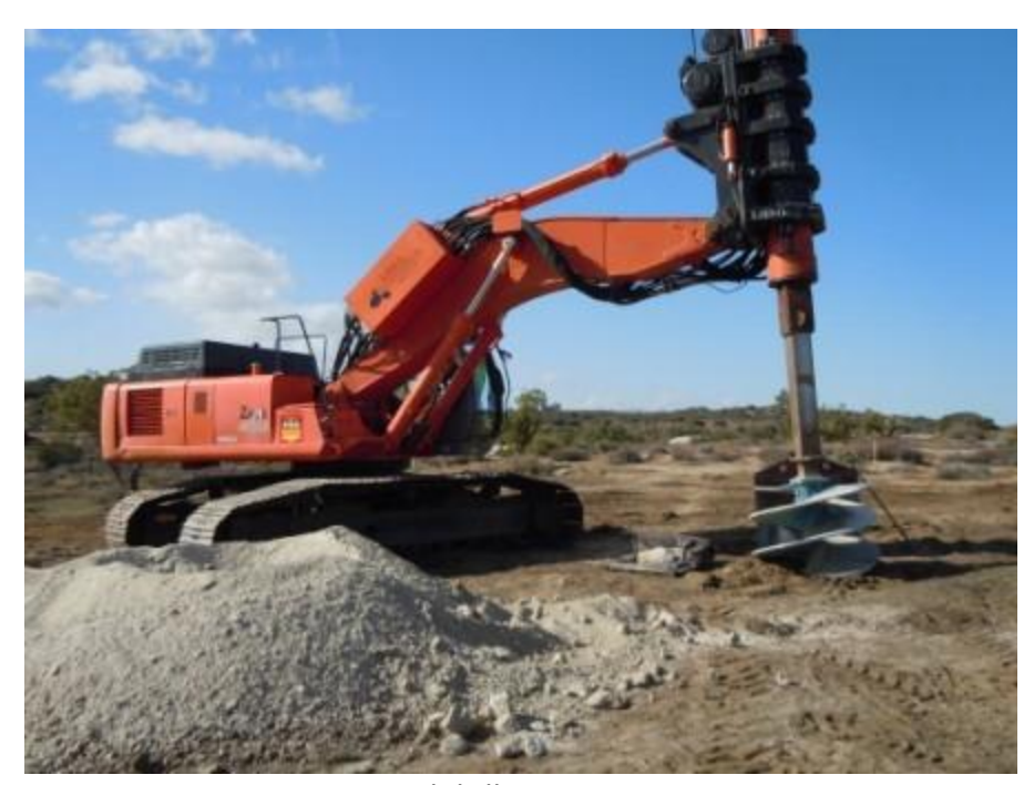
Conventional drilling at Tower EP 210.