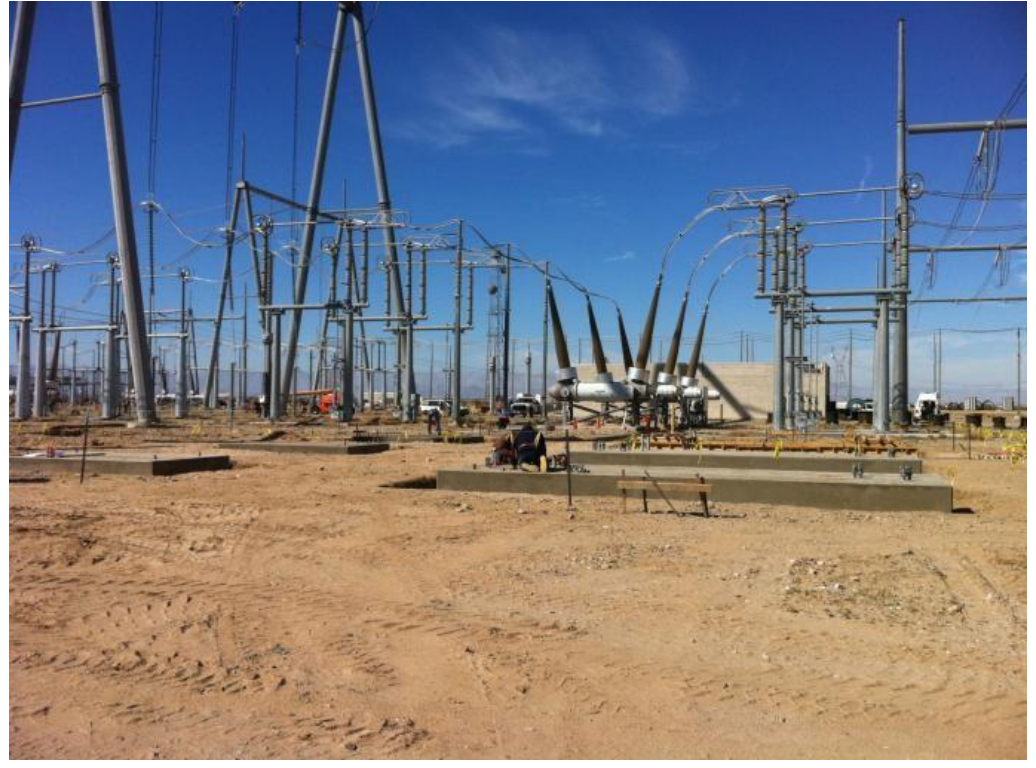
Foundation work at Imperial Valley Substation