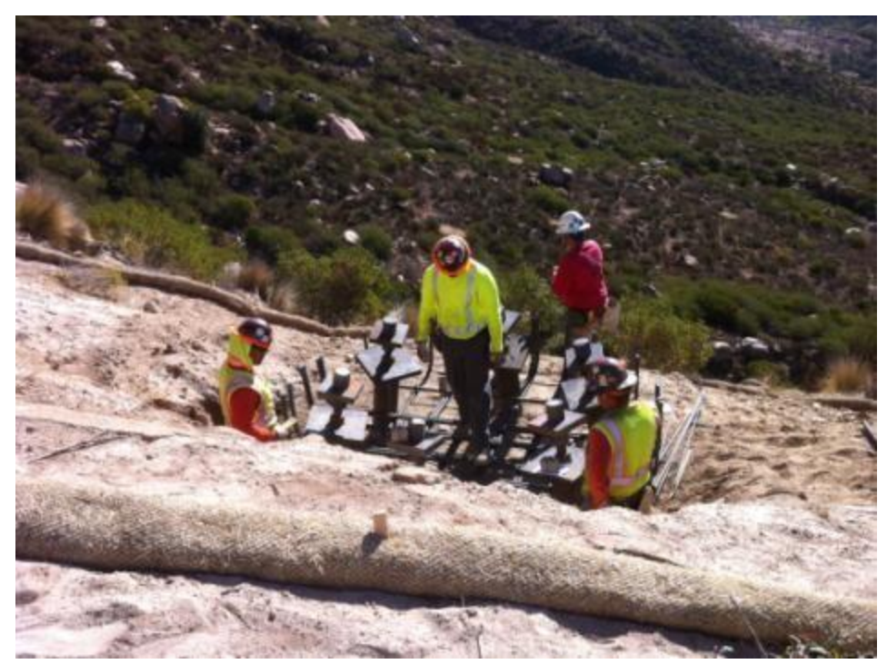
Micropile cap work at CP67-3. (Link 5)