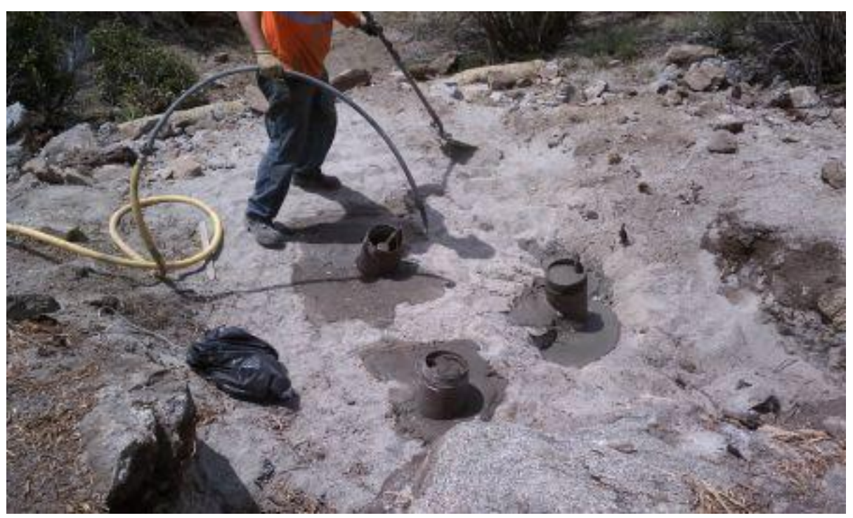
Micropile grouting at Tower EP 81, Link 2.