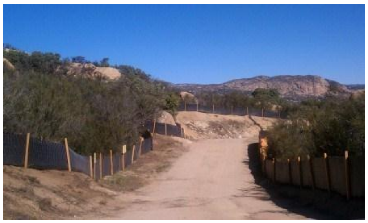
Arroyo toad fencing installed along access road near EP65.