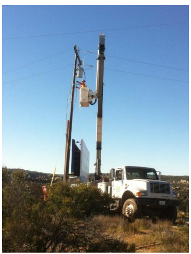
12 kV relocation along McCain Valley Road, Link 1.