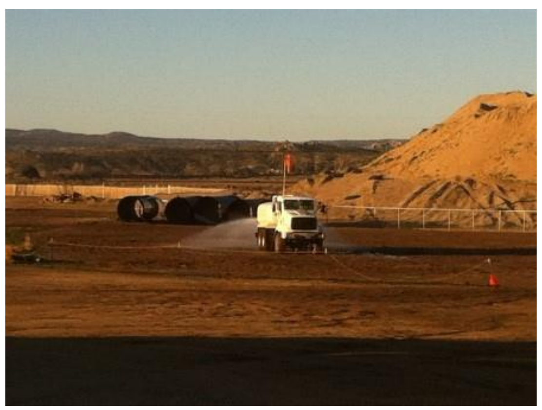
Dust suppression at JVR Yard.