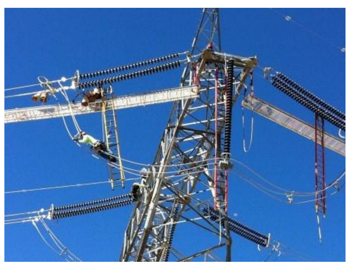
Installing jumpers at Tower EP200-3. (Link 1)