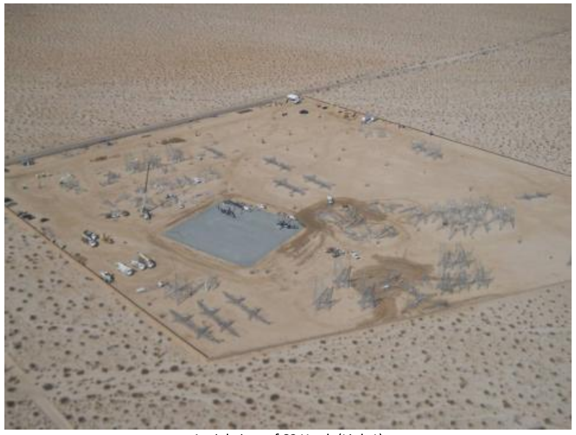
Aerial view of S2 Yard. (Link 1)