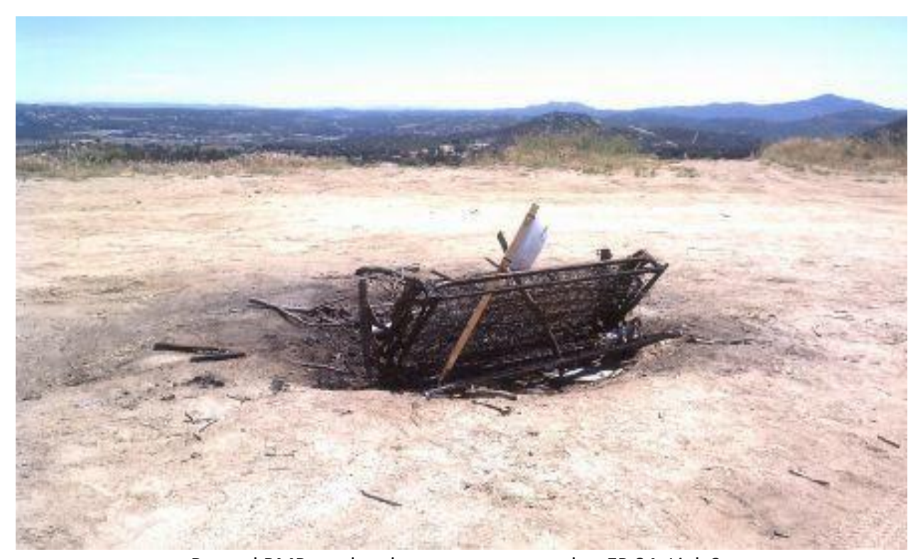
Burned BMPs and garbage on access road to EP 84, Link 2.