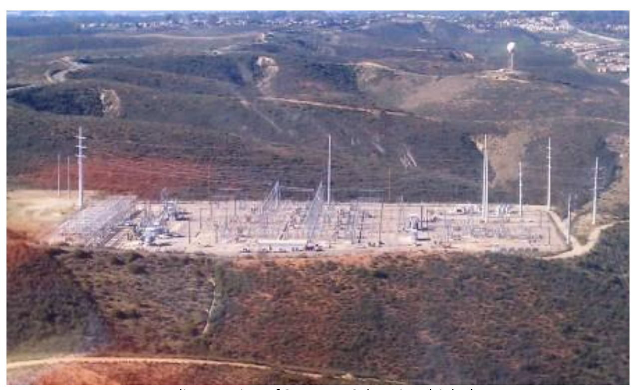
Helicopter view of Sycamore Substation. (Link 5)