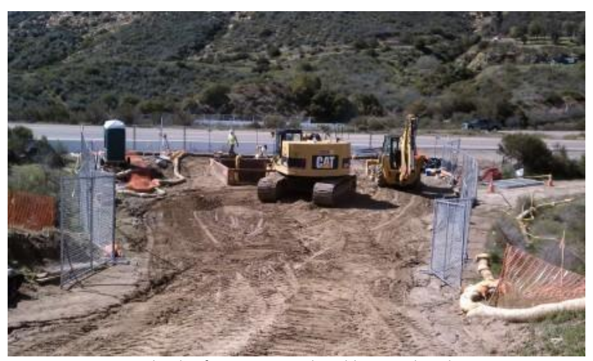
North side of Interstate 8 jack-and-bore work, Link 4.