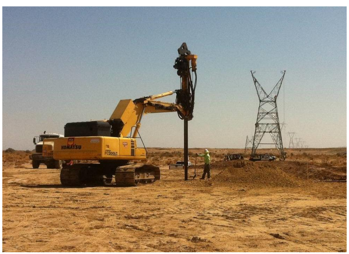
Drilling snubs at the EP322 323 pull site.