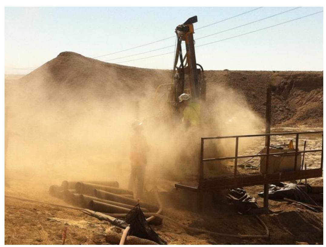
Dust from micropile drilling at EP312, Link 1.