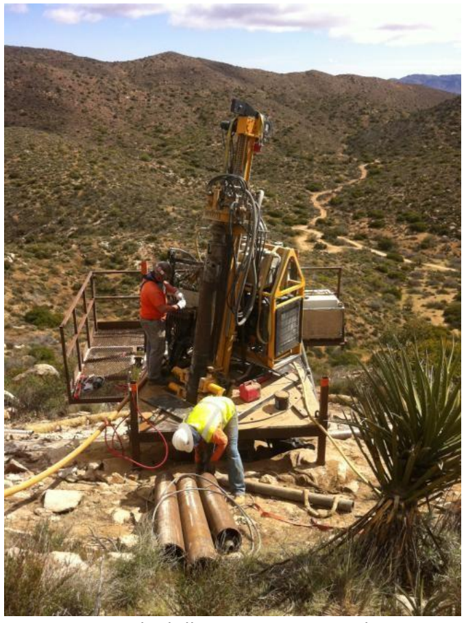
Micropile drilling at EP 225-1, Link 1.