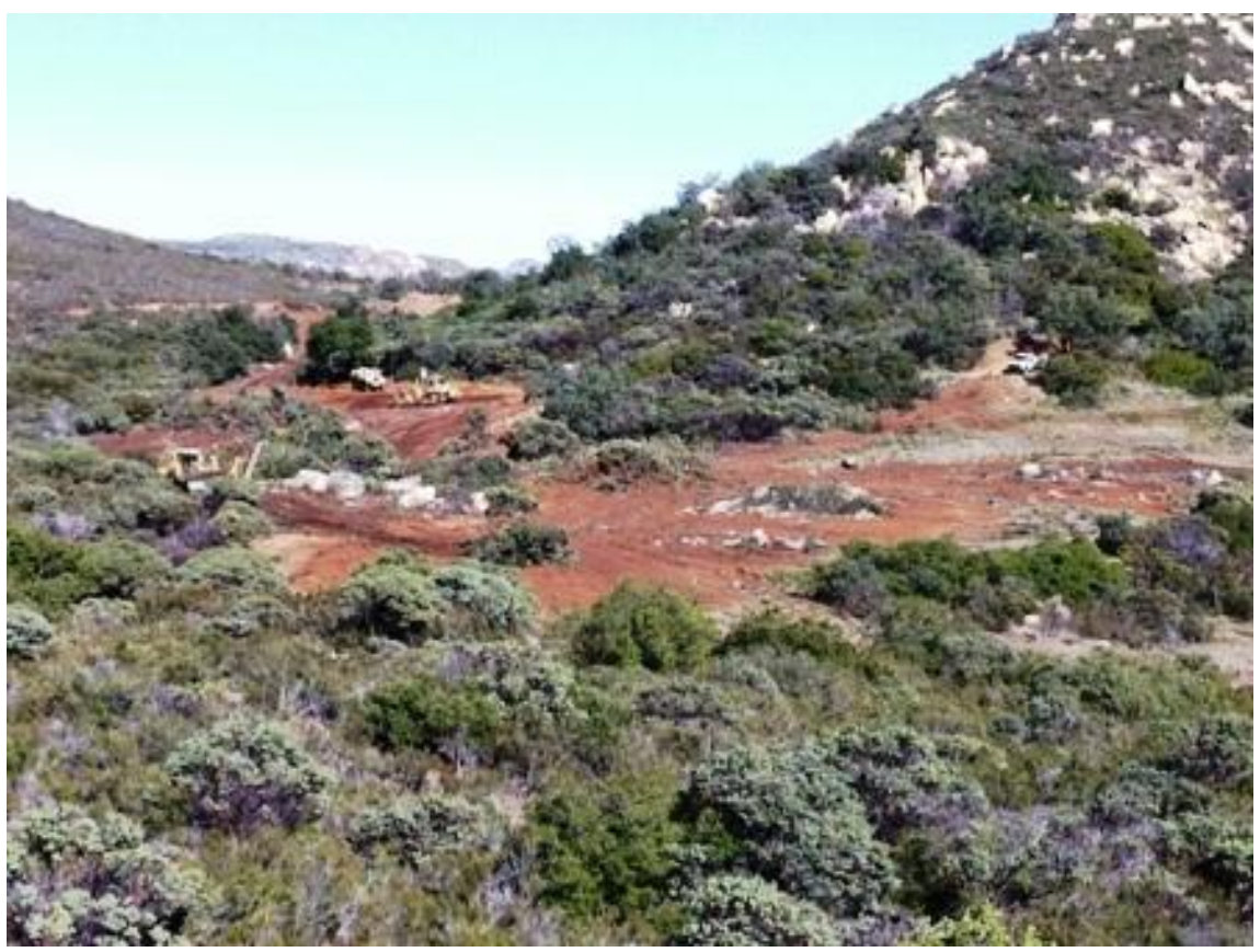
Vegetation clearing at Suncrest Substation Pad.