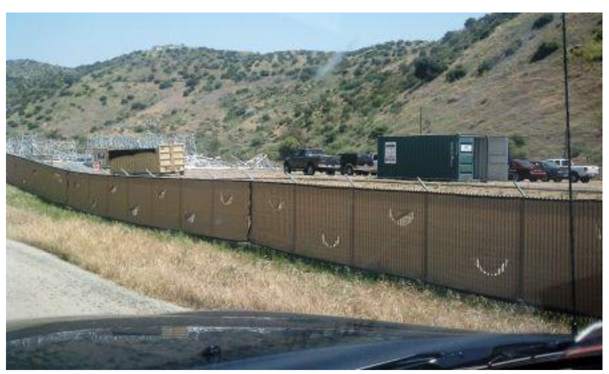
Visual screening fence installed at Helix Yard under Variance #14.