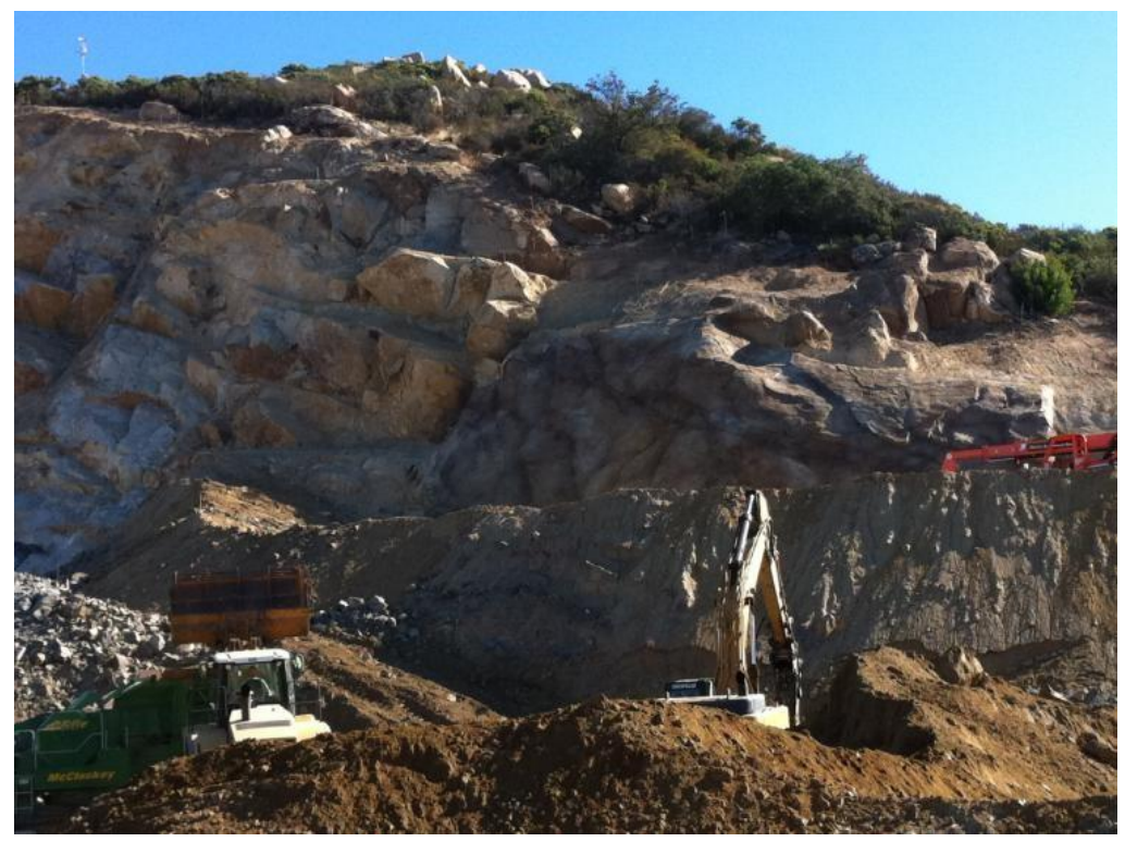
Acid wash application to soil nail wall. (Link 3)