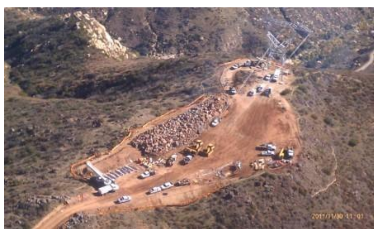
Wire stringing activities (through GE buffer) at EP42 and Barrett Construction Yard. (Link 2)