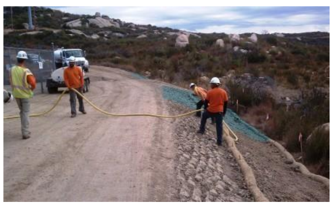
Hydromulching slopes on access road to Barrett Canyon Yard.