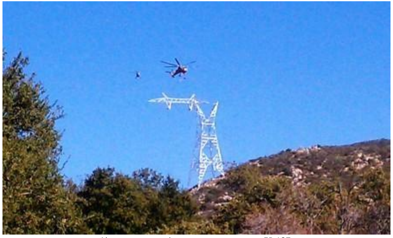
Aircrane attempting to set top on tower EP 137.