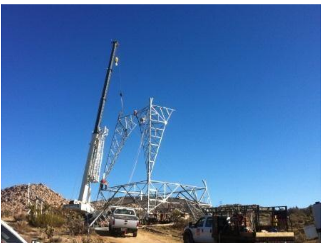
Conventional tower assembly at EP245-1. (Link 1)