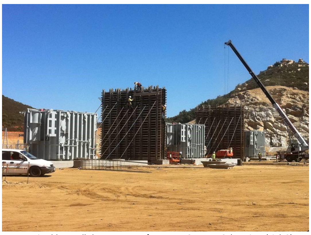
Forming blast walls between transformers at Suncrest Substation. (Link 3)