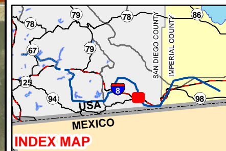
Figure 12 STRUCTURES EP219-1 TO EP206-1