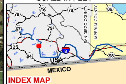
Figure 27 STRUCTURES EP12-3 TO EP9-1