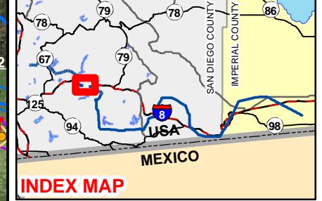
Figure 33 STRUCTURES CP96-1 / CP95-1 TO CP88-1 / CP87-1 (230-kV UNDERGROUND)