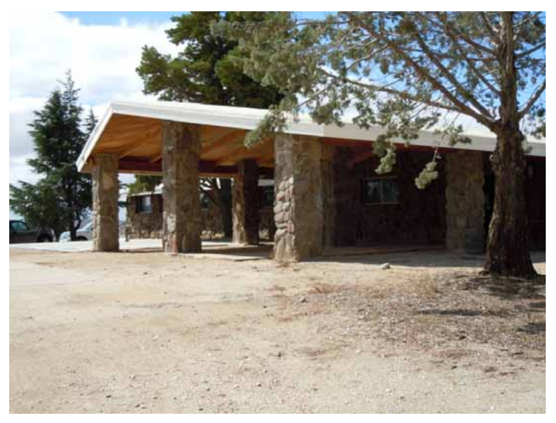
Figure 2: Rough Acres lodge.