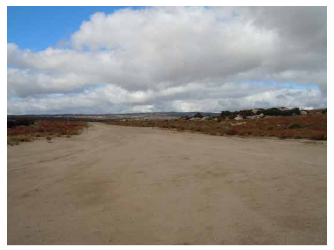
Figure 4: Rough Acres runway from the lodge.