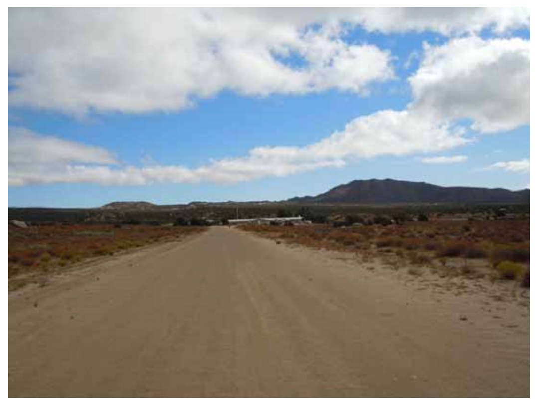
Figure 5: View of Rough Acres from the runway.