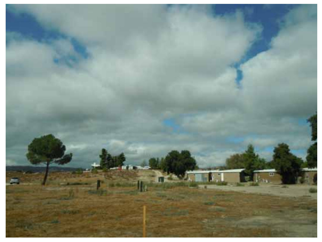
Figure 1: Rough Acres lodge and cabin complex.