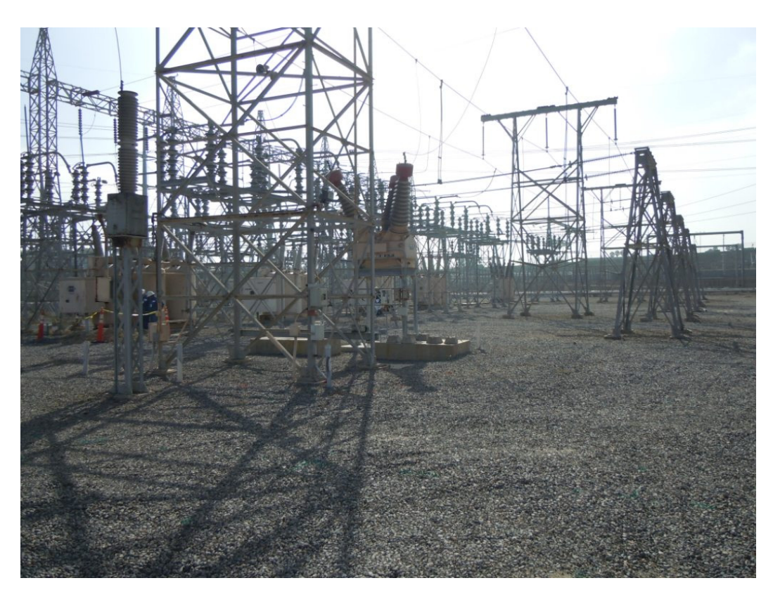
Figure 2: Encina Switchyard.