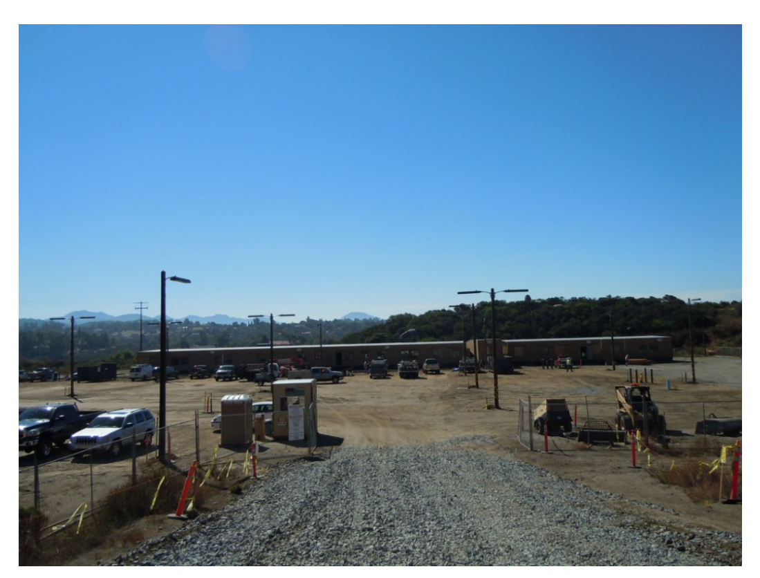
Figure 4: Mobile unit installation at the Alpine Regional Field Office.