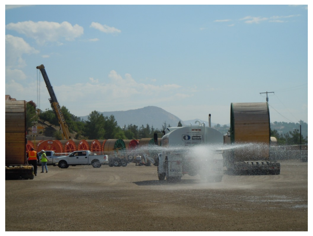
Figure 3: Wire delivery and environmental compliance at the Alpine Construction Yard.