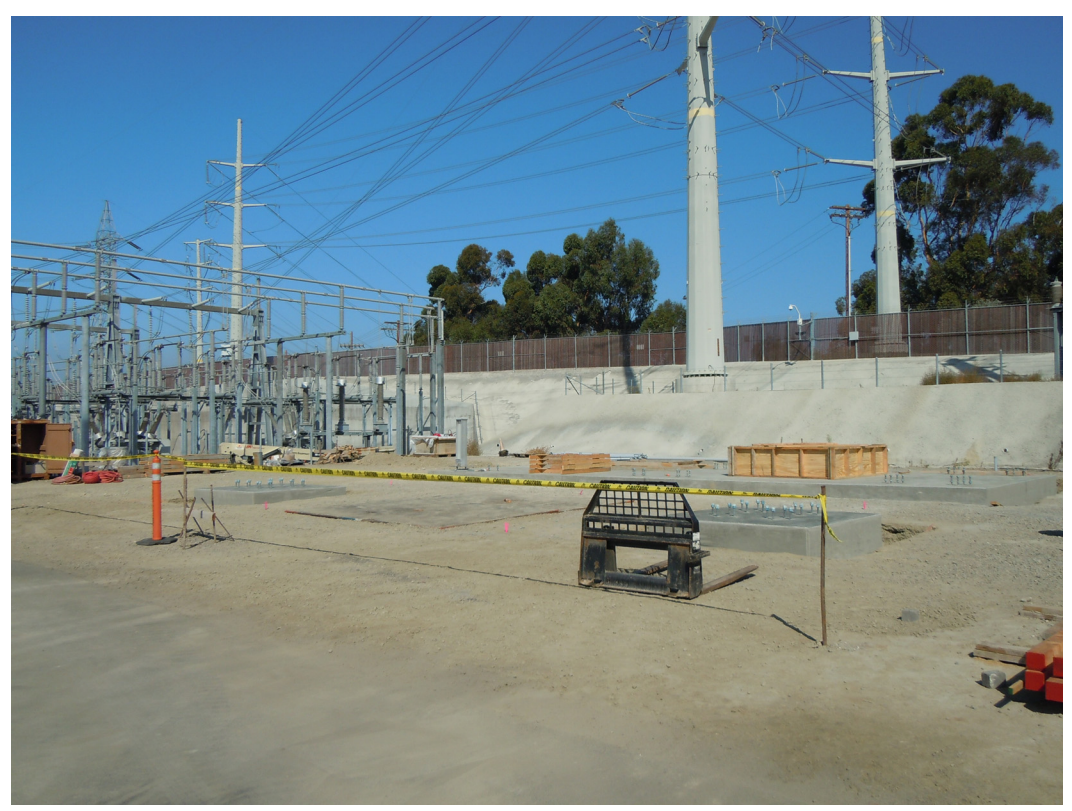
Figure 1: San Luis Substation equipment pad.