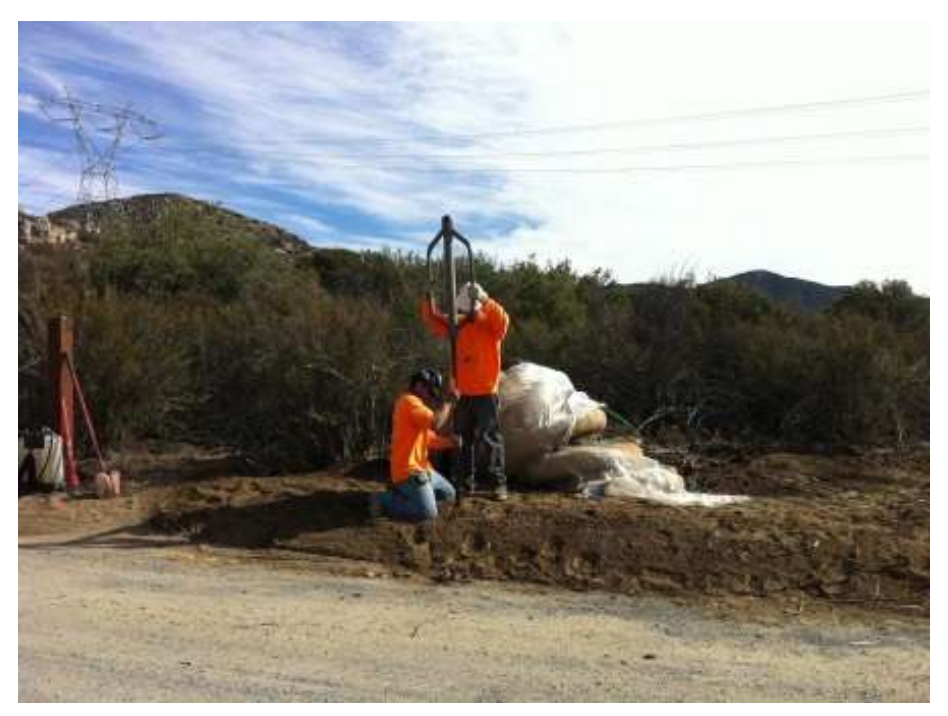
Figure 1: Gate installation at Thing Valley Yard. (Link 2)