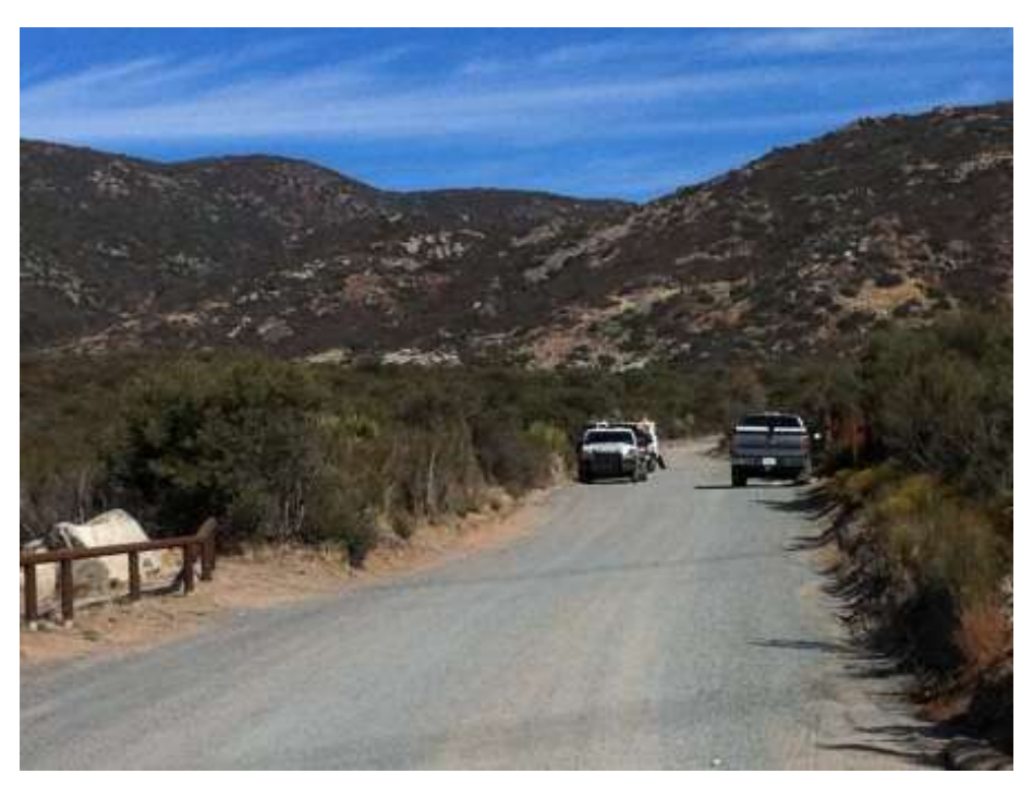
Figure 2: Parking in unapproved work areas. (Link 2)