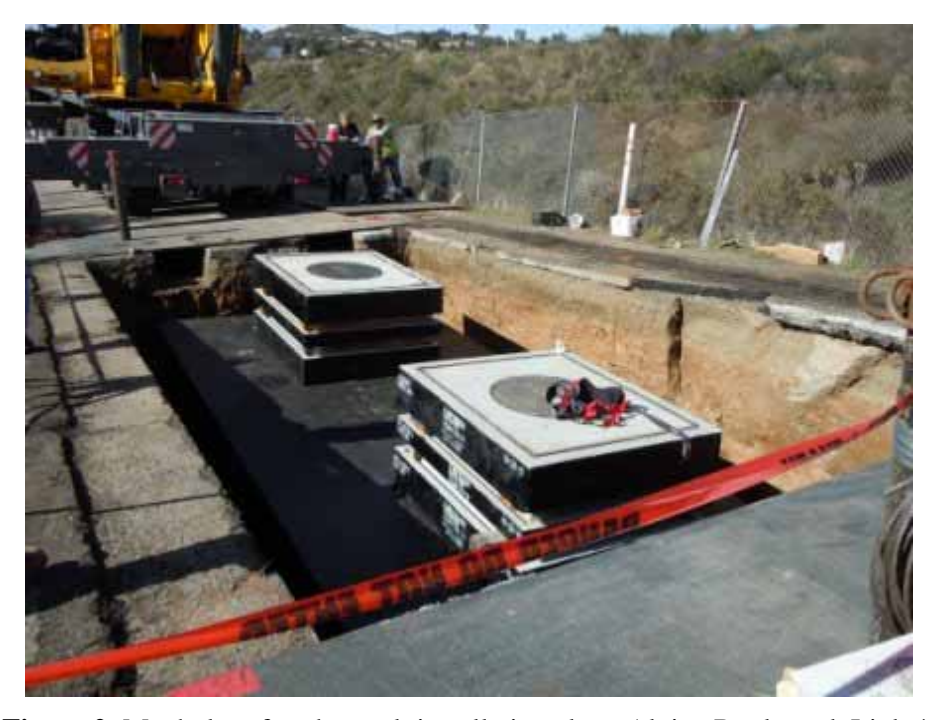
Figure 2: Manholes after the vault installation along Alpine Boulevard, Link 4.