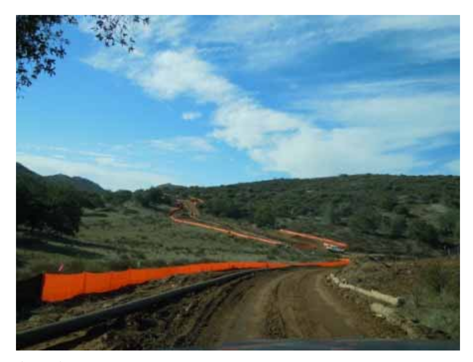
Figure 3 : Vegetation clearing, rough grading and waterline installation at the Suncrest Substation.