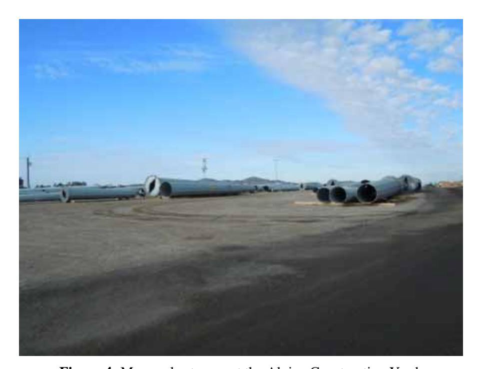
Figure 4: Monopole storage at the Alpine Construction Yard.