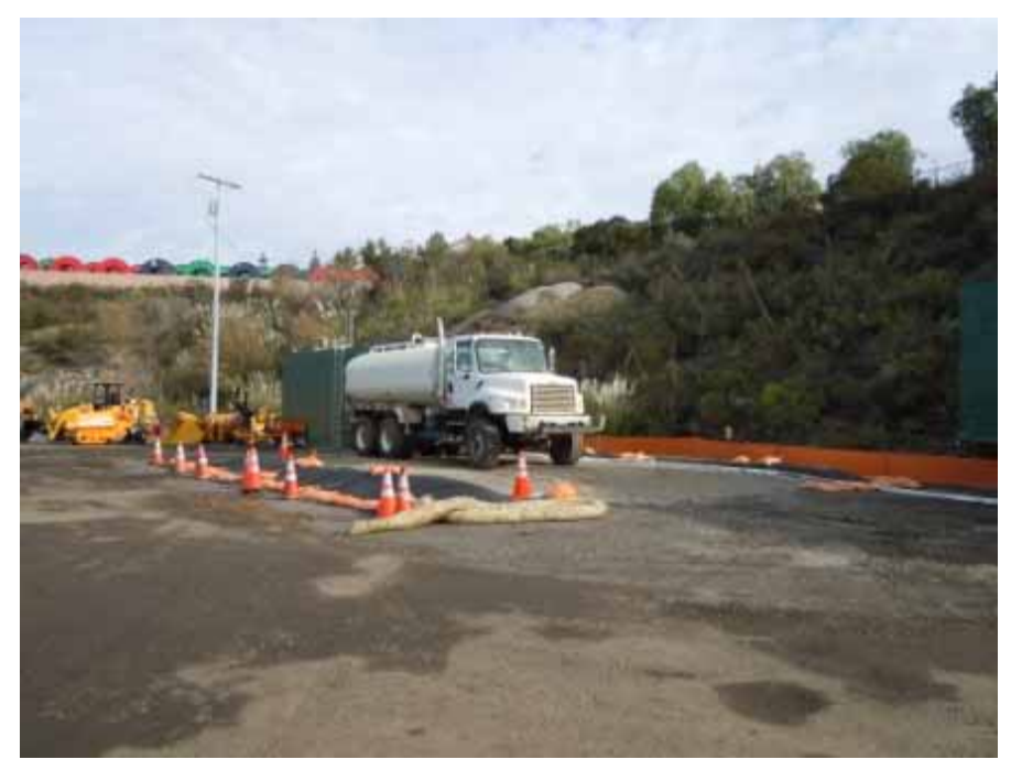
Figure 5: Wash station installed within the contractor's construction yard.