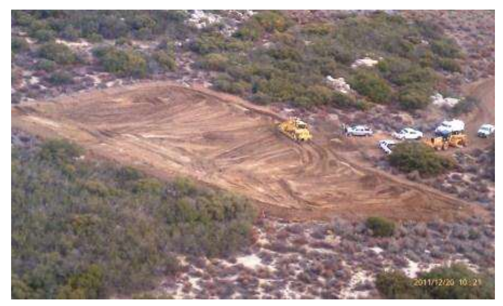
Figure 3: Grading at EP83 Pull Site. (Link 2)