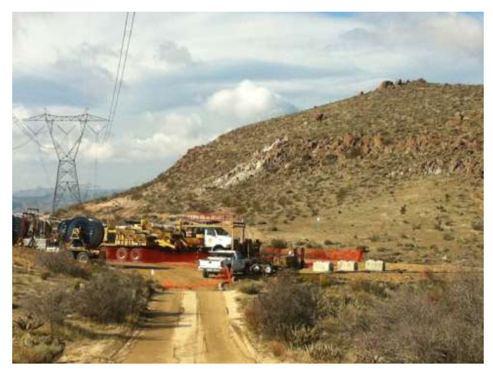
Figure 1: Wire stringing activities at EP255-2 pull site. (Link 1)