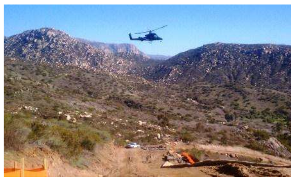
Figure 7: Equipment delivery at CP50-1. (Link 5)