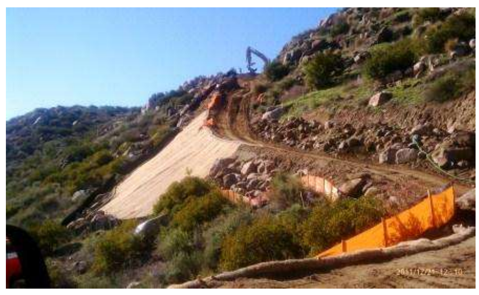
Figure 5: Grading and boulder removal on access road to CP49-1 pull site. (Link 5)