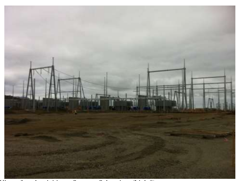
Figure 8: View of steel activities at Suncrest Substation. (Link 8)