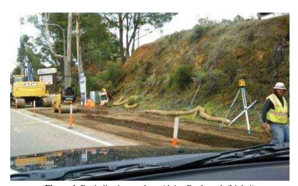
Figure 4: Revitalization work on Alpine Boulevard. (Link 4)