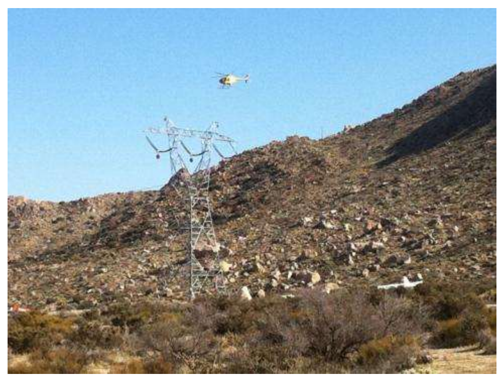
Figure 2: Flying sock line from EP255-2 pull site to EP269-1 pull site. (Link 1)