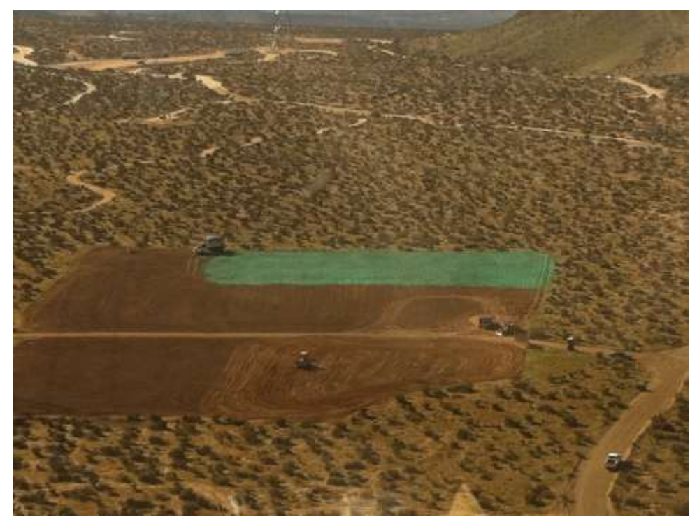
Figure 3: Hydromulch application at AER yard. (Link 1)