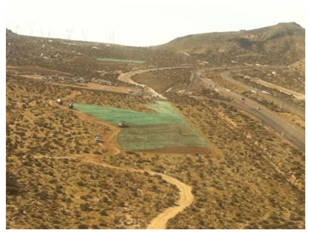
Figure 4: Hydromulch application to the lower section of Fromm Yard. The fenced area will remain. (Link 1)