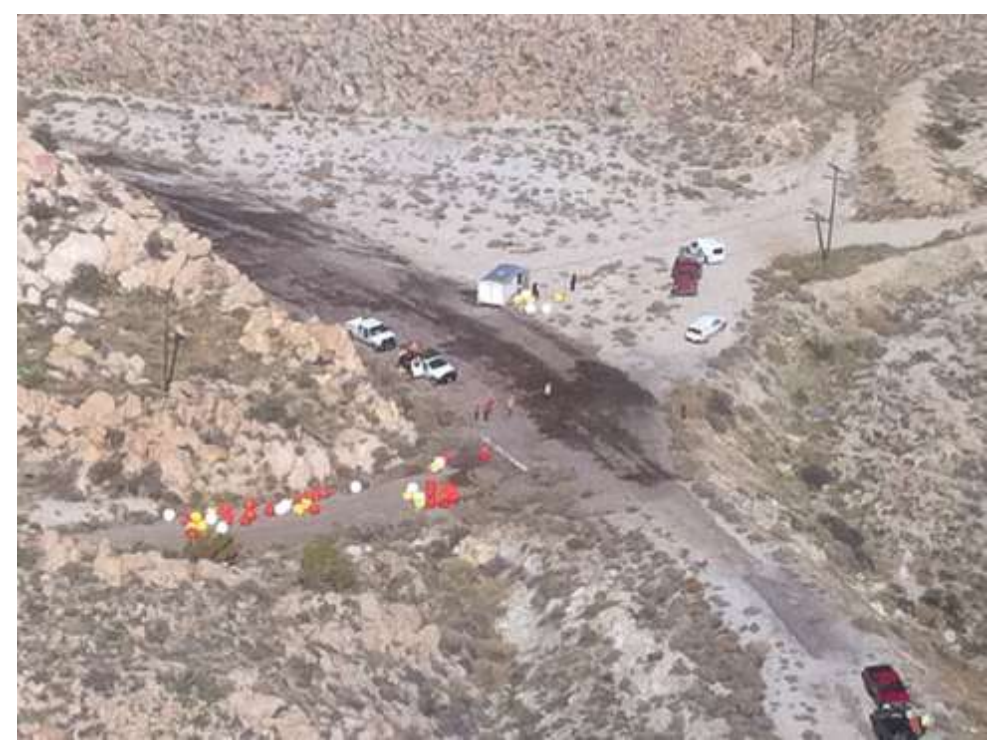
Figure 2: Construction activities being conducted off right-of-way. (Link 1)