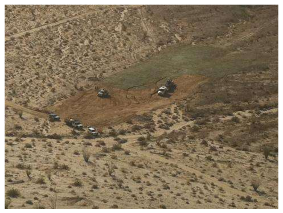
Figure 1: Applying hydromulch at EP292-1 pull site. (Link 1)