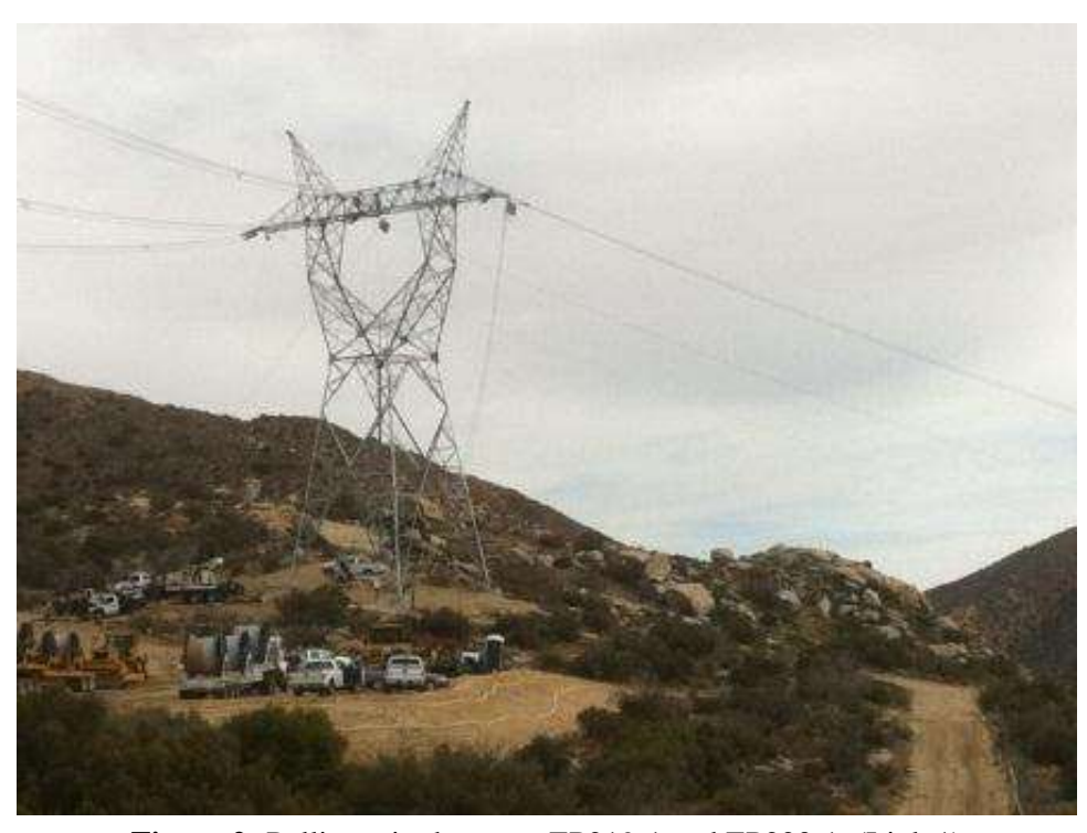
Figure 2: Pulling wire between EP219-1 and EP220-1. (Link 1)