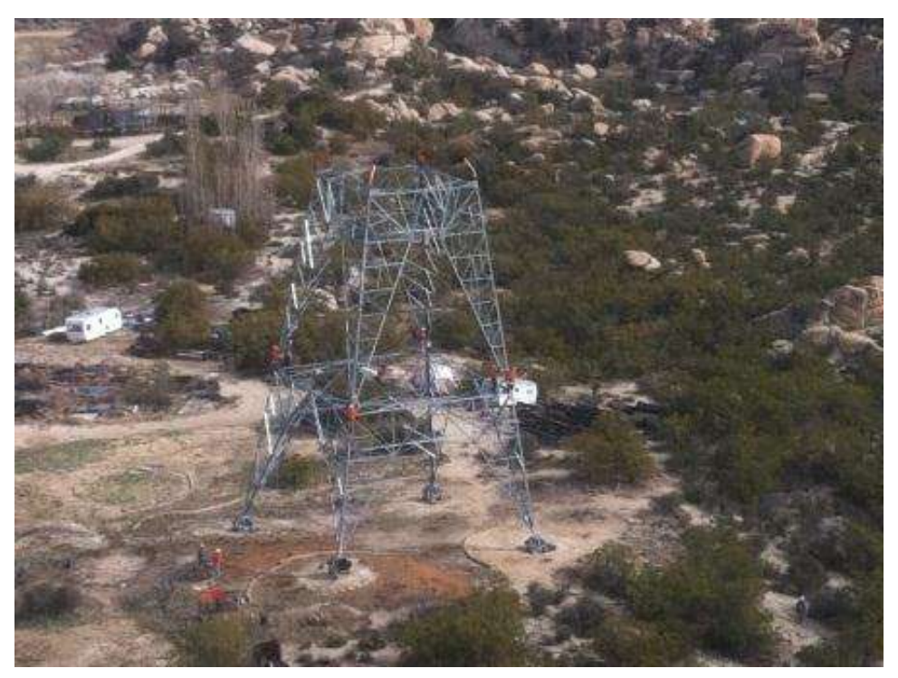
Figure 1: Tower assembly at EP221A. (Link 1)