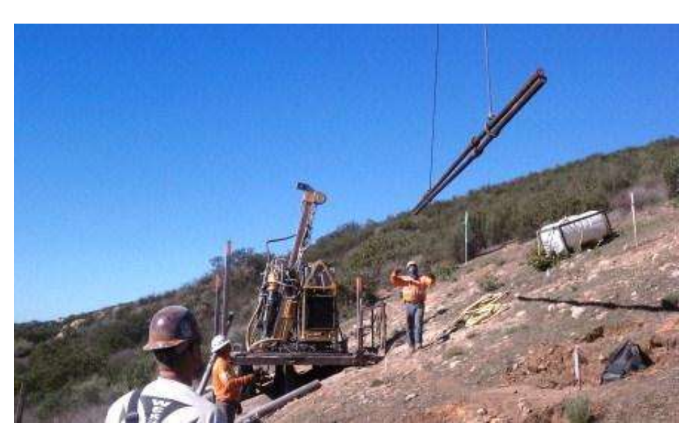
Figure 8: Helicopter delivery at CP36-1. (Link 5)