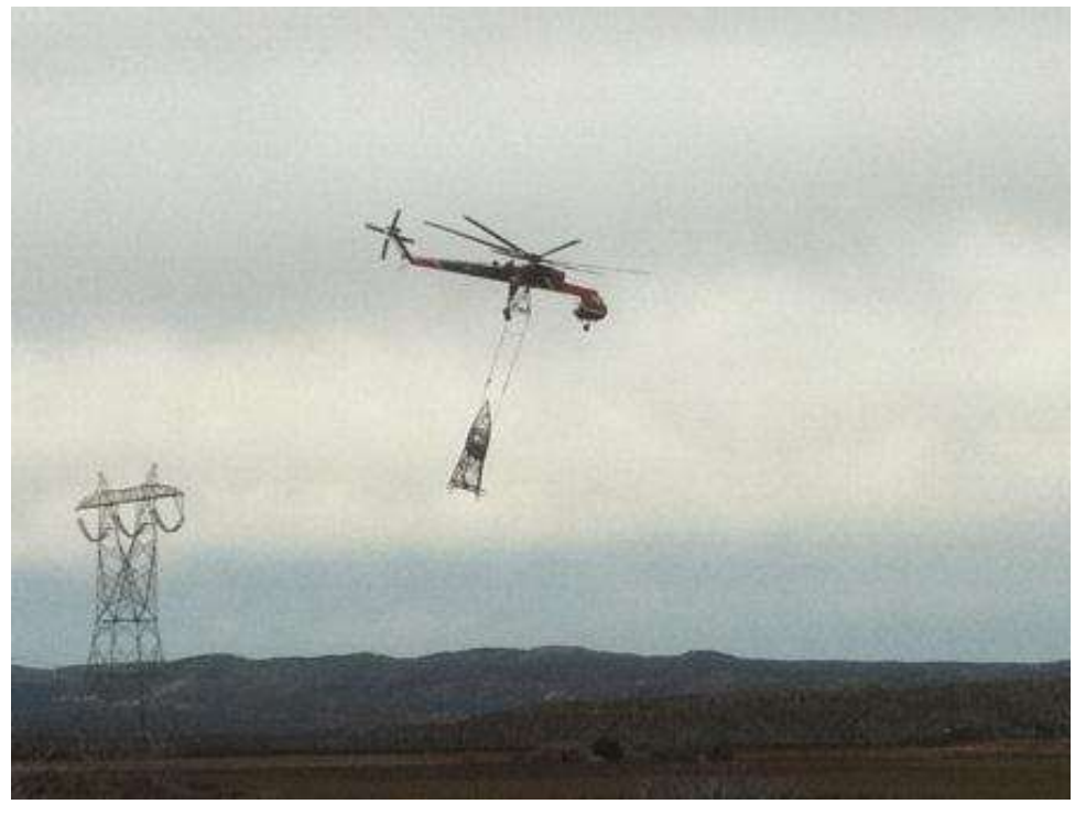
Figure 12: Air crane flying tower structures out of JVR Yard. (Link 1)