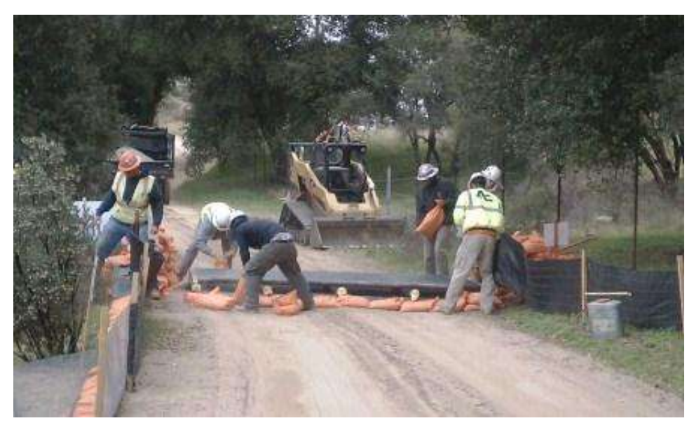
Figure 4: Crews assembling a cattle guard and arroyo toad exclusion device on access road to EP78. (Link 2)