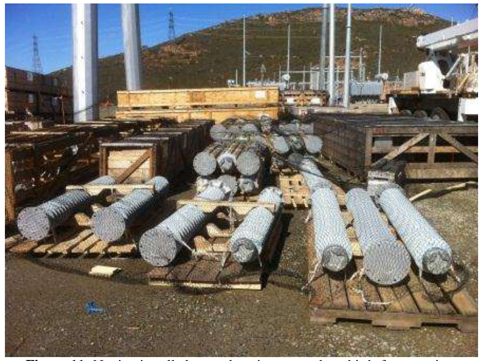
Figure 11: Netting installed around equipment to deter birds from nesting. (Link 3)