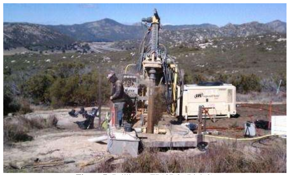
Figure 7: Drilling at EP107-3. (Link 2)