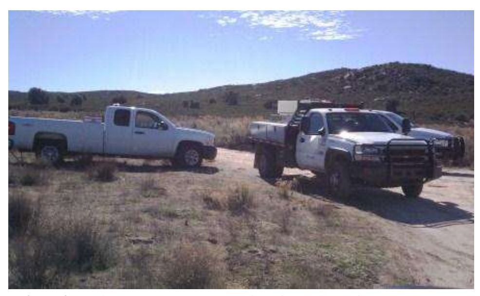
Figure 9: Vehicles parked on brush outside of the Right-Of-Way near EP109. (Link 2)