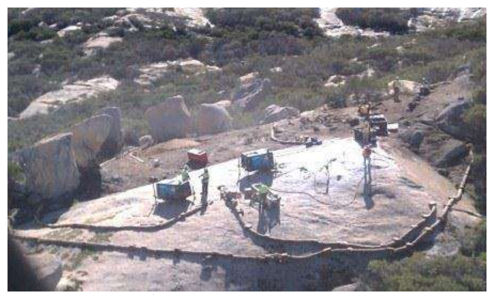
Figure 6: Boulder busting at EP17.