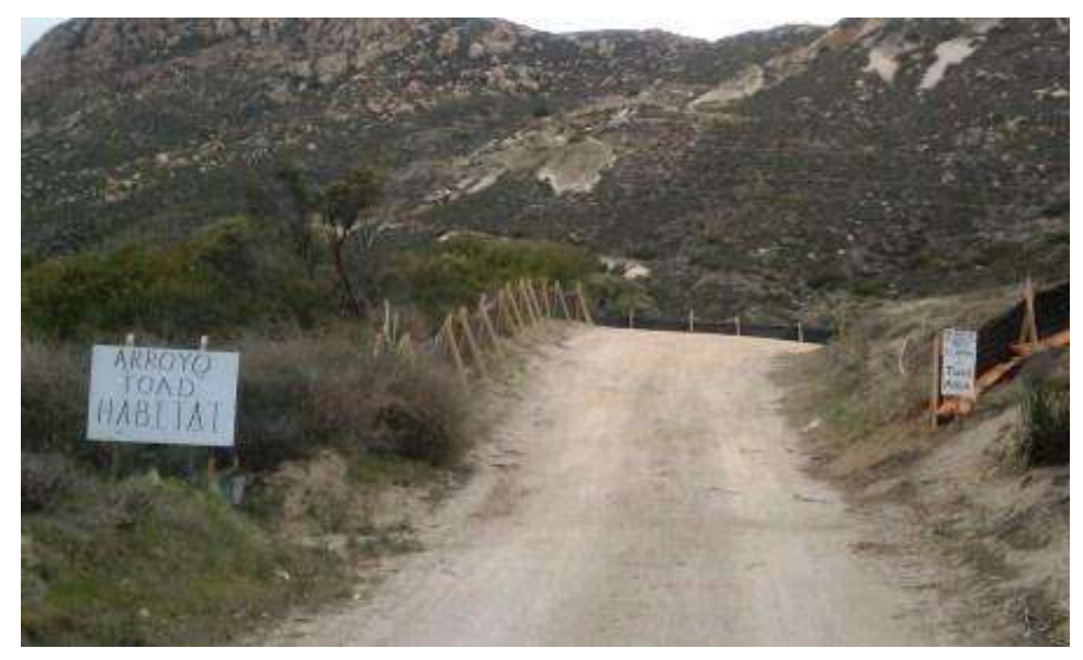
Figure 5: Signs marking the beginning of Arroyo Toad habitat. (Link 2)