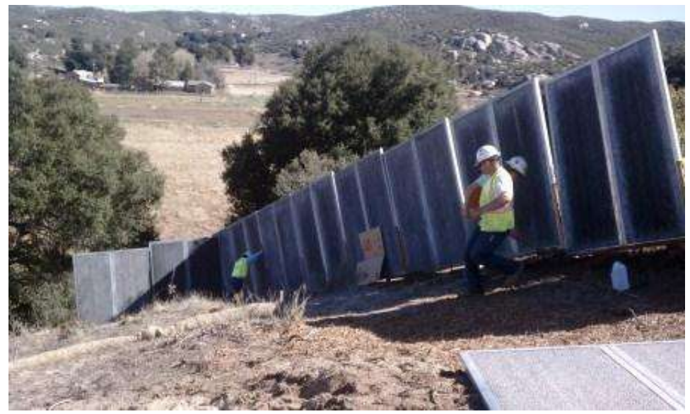
Figure 3: Construction of a sound wall at EP119. (Link 2)