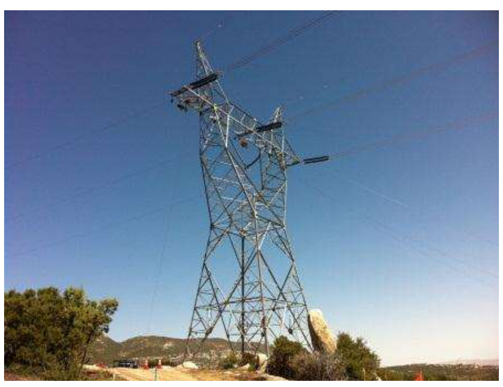
Figure 2: Wire work at Tower EP170. (Link 1)