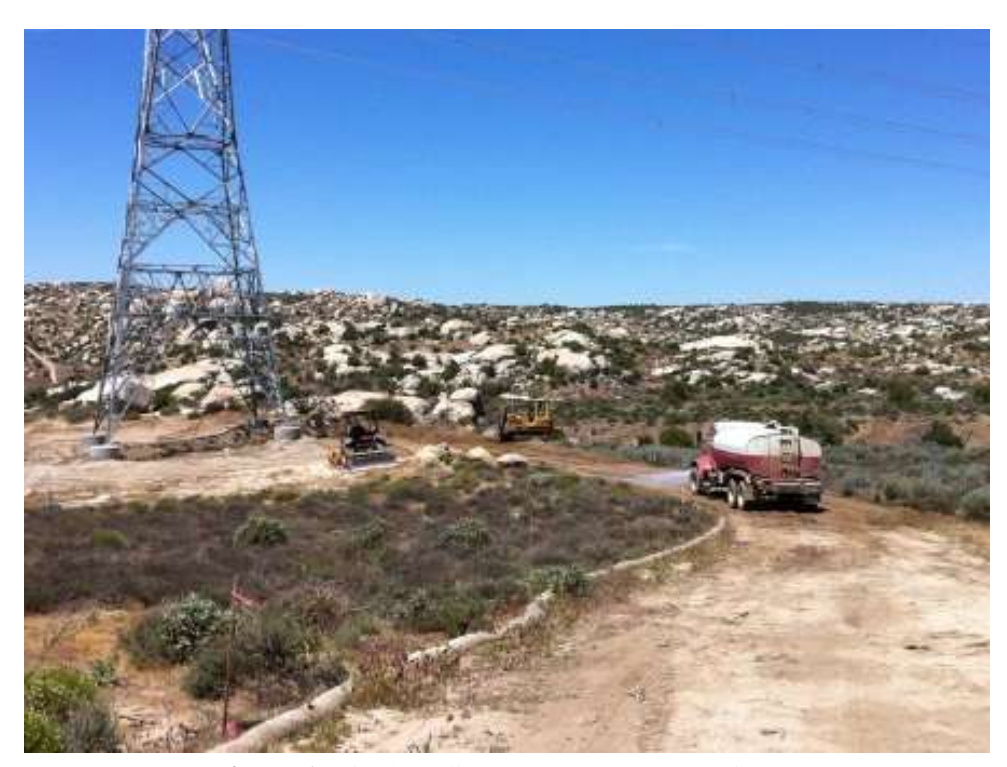
Figure 1: Final grading at Tower EP199. (Link 1)