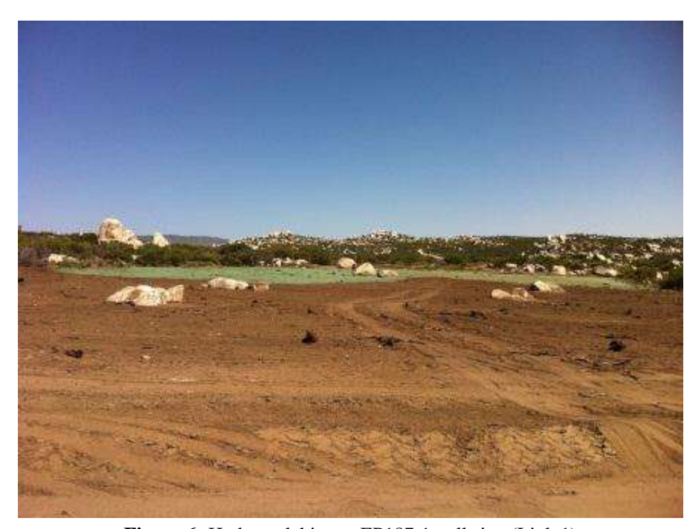
Figure 6: Hydromulching at EP187-1 pull site. (Link 1)