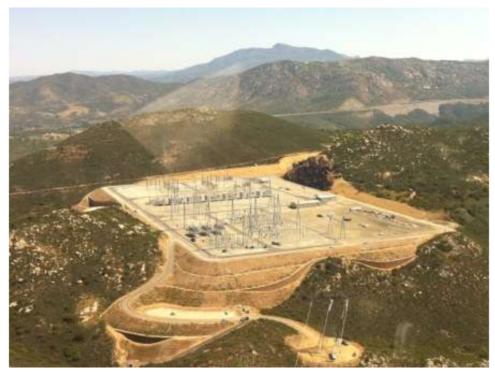
Figure 7: Aerial view of Suncrest Substation and Tower EP1. (Link 3)