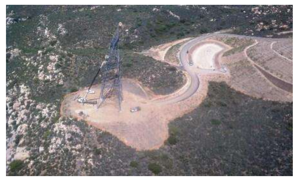
Figure 5: Wire pulling activities at Tower EP1, adjacent to Suncrest Substation. (Link 2)