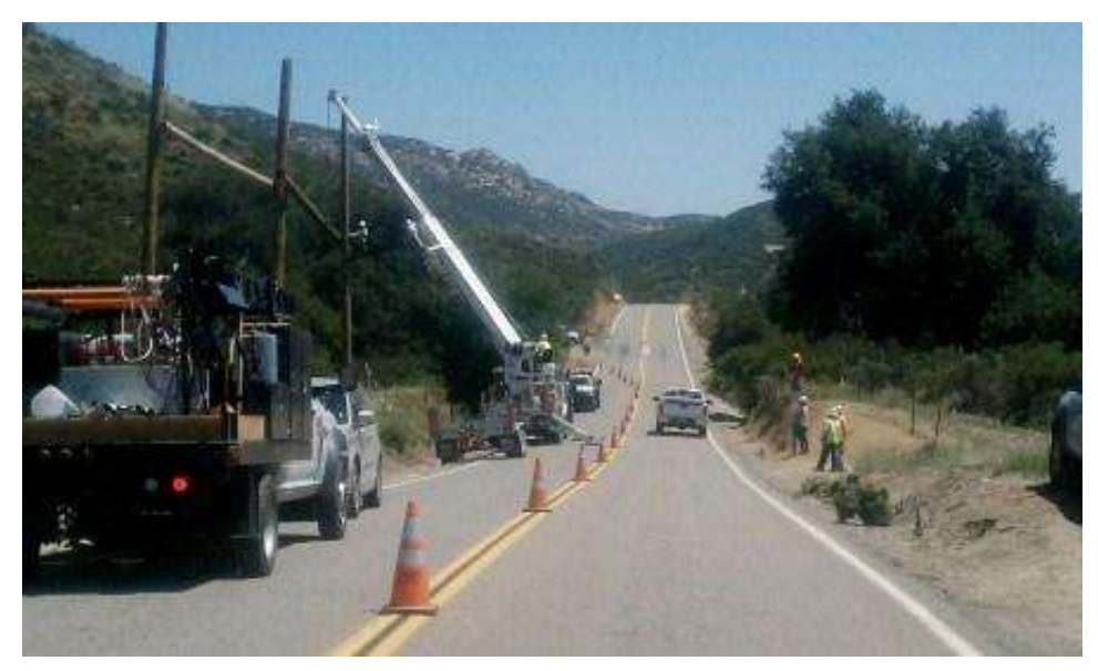
Figure 3: Guard structure installation on Lyons Valley Road near Tower EP24. (Link 2)