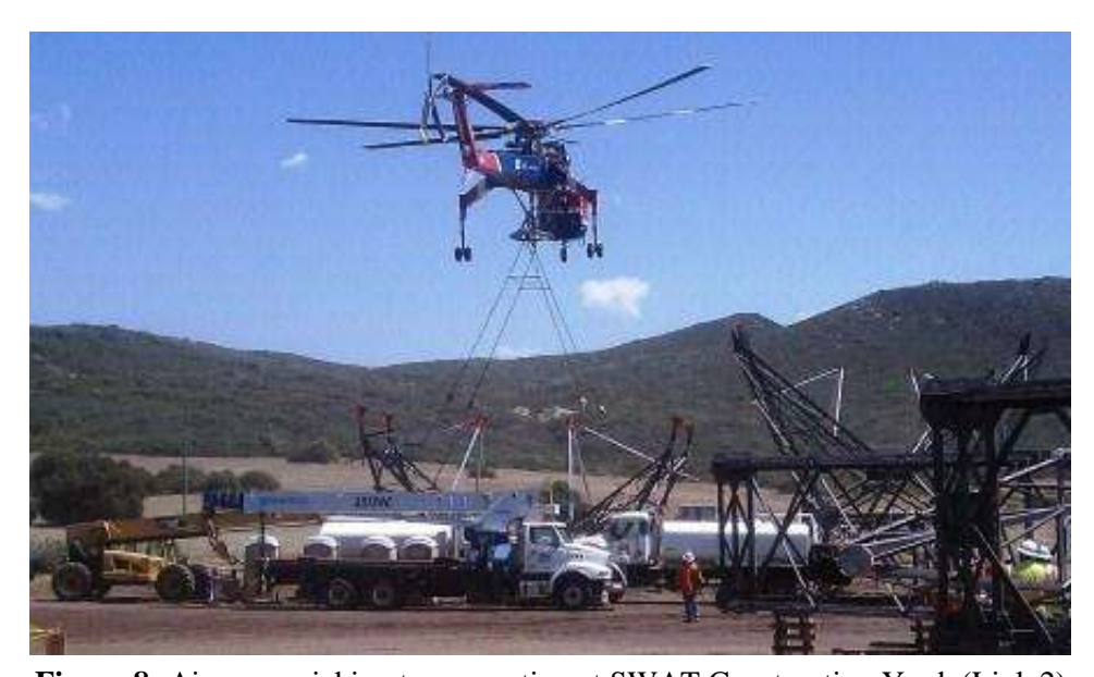
Figure 8: Air crane picking tower section at SWAT Construction Yard. (Link 2)