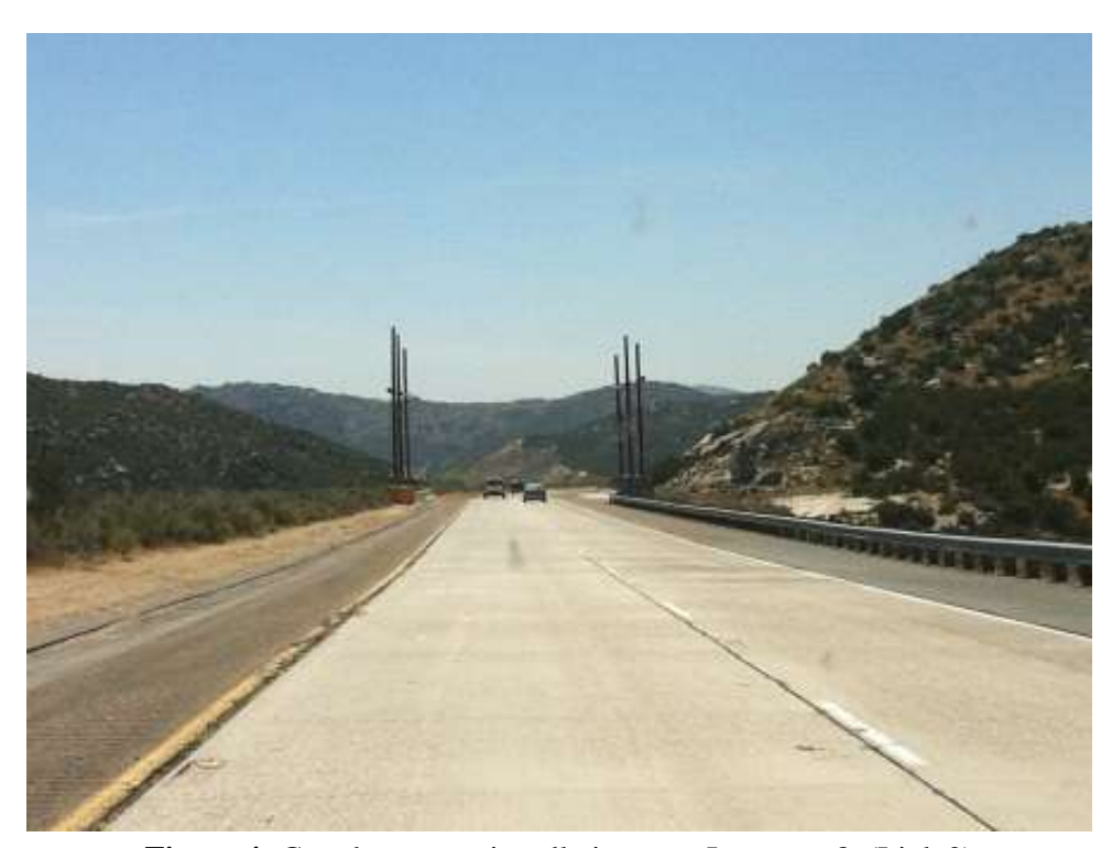
Figure 4: Guard structure installation over Interstate 8. (Link 2)