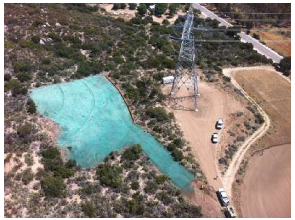
Figure 2: Hydromulching at EP89-1 pull sites. (Link 2)