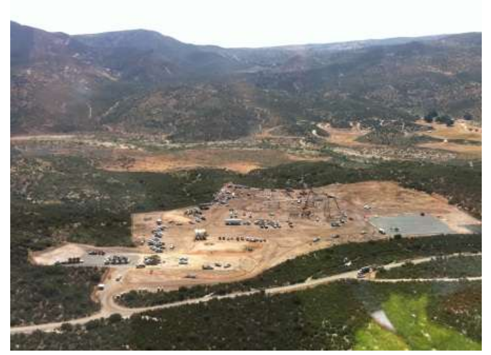
Figure 4: Aerial view of Thing Valley Yard. (Link 2)