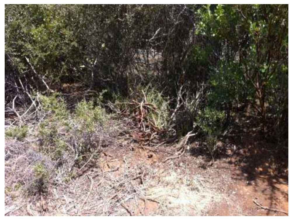
Figure 3: Damaged vegetation from guard structure removal near EP27-1. (Link 2)