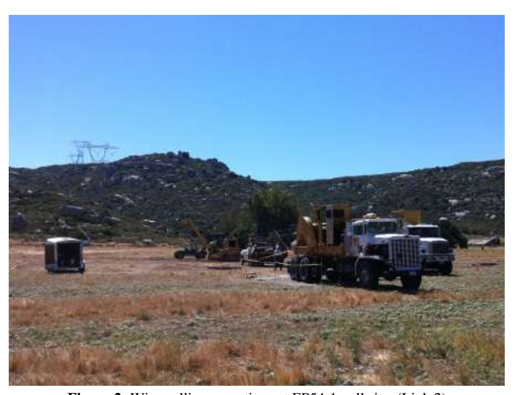
Figure 2: Wire pulling operations at EP54-1 pull site. (Link 2)