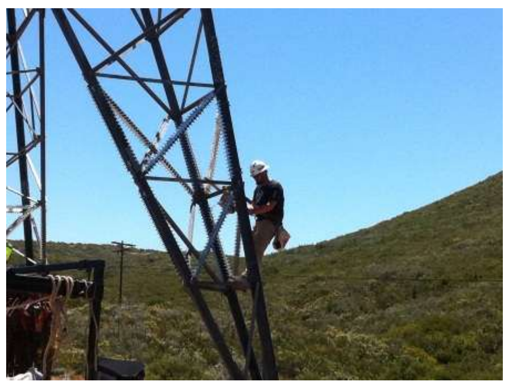
Figure 1: Installing anti-climbing guards at EP27-1. (Link 2)