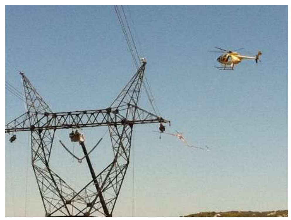
Figure 3: Flying sock line at EP12-3. (Link 2)