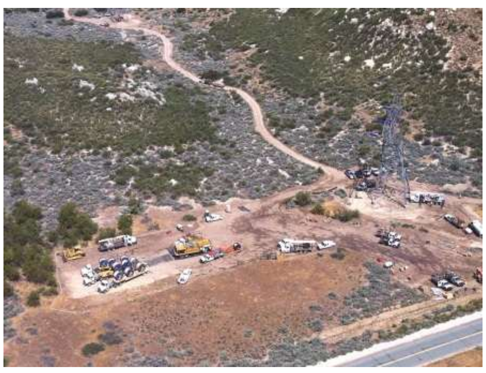
Figure 4: Aerial view of pulling operations at EP113-5 pull site. (Link 2)