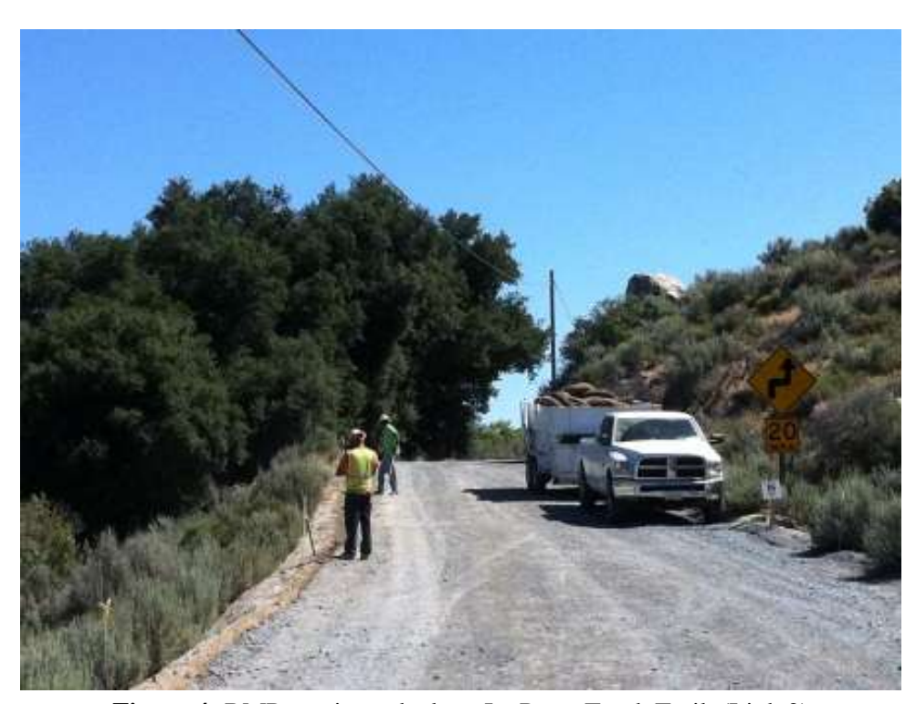
Figure 4: BMP repair work along La Posta Truck Trail. (Link 2)