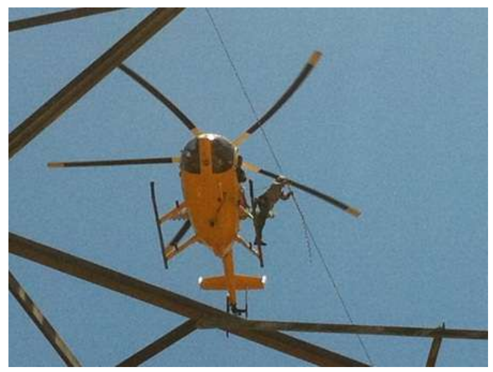
Figure 3: Installing marker balls at EP12-3. (Link 2)