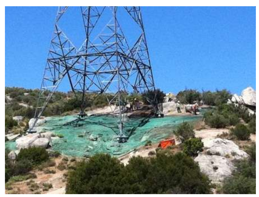
Figure 5: Hydromulching at EP116-3. (Link 2)