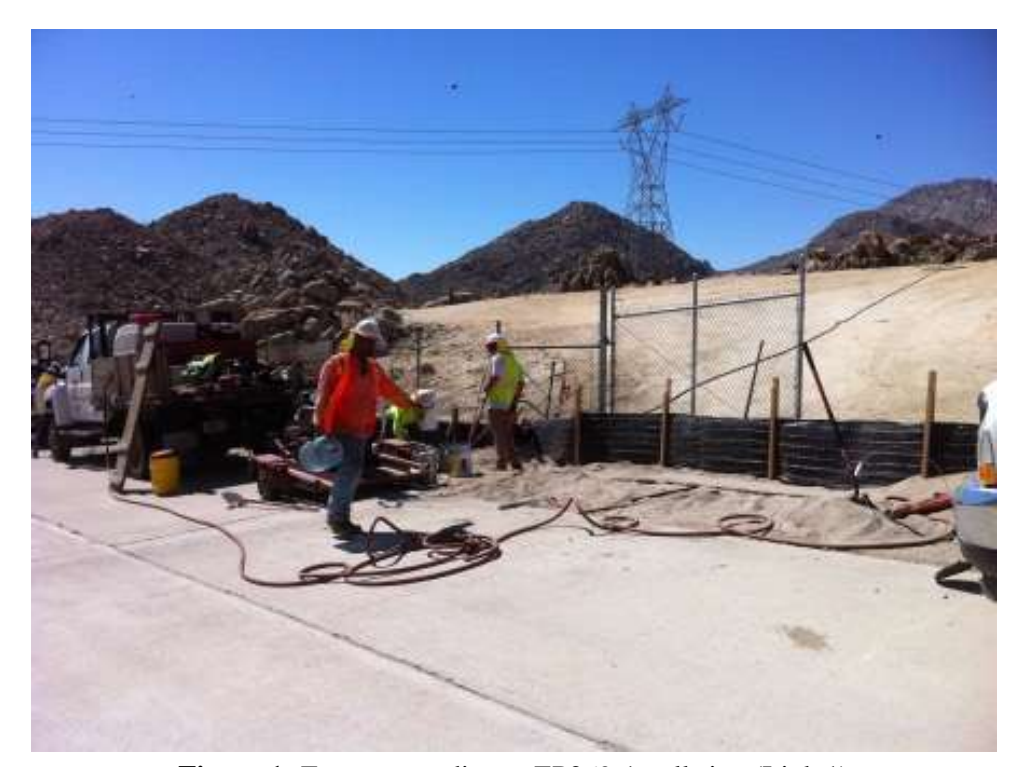
Figure 1: Fence grounding at EP269-1 pull site. (Link 1)