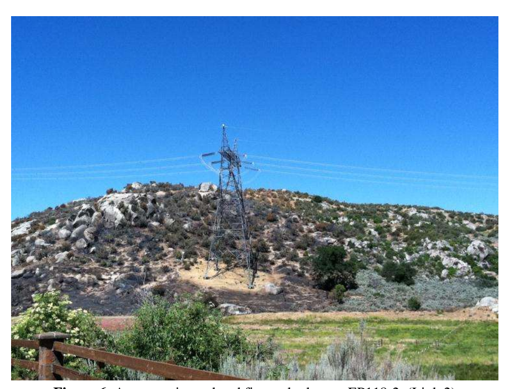
Figure 6 : A non-project related fire took place at EP118-2. (Link 2)