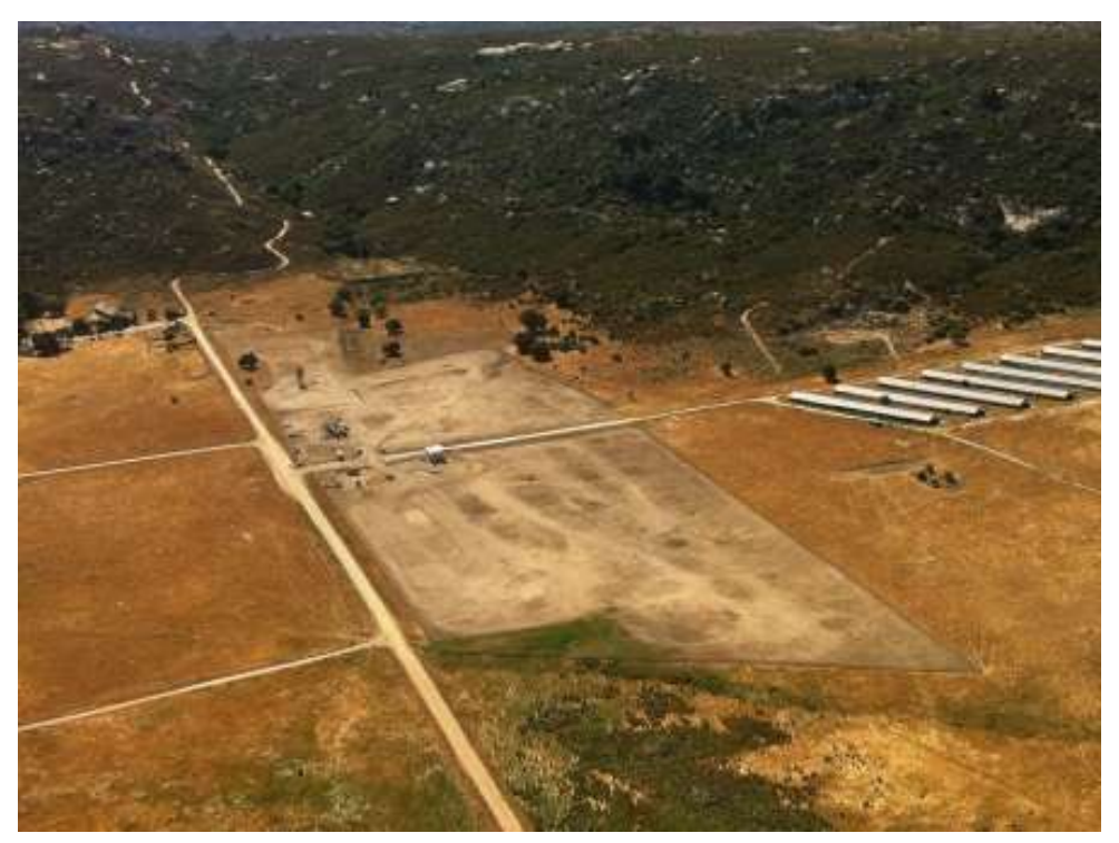
Figure 3: Aerial view of Kreutzkamp Yard. (Link 2)