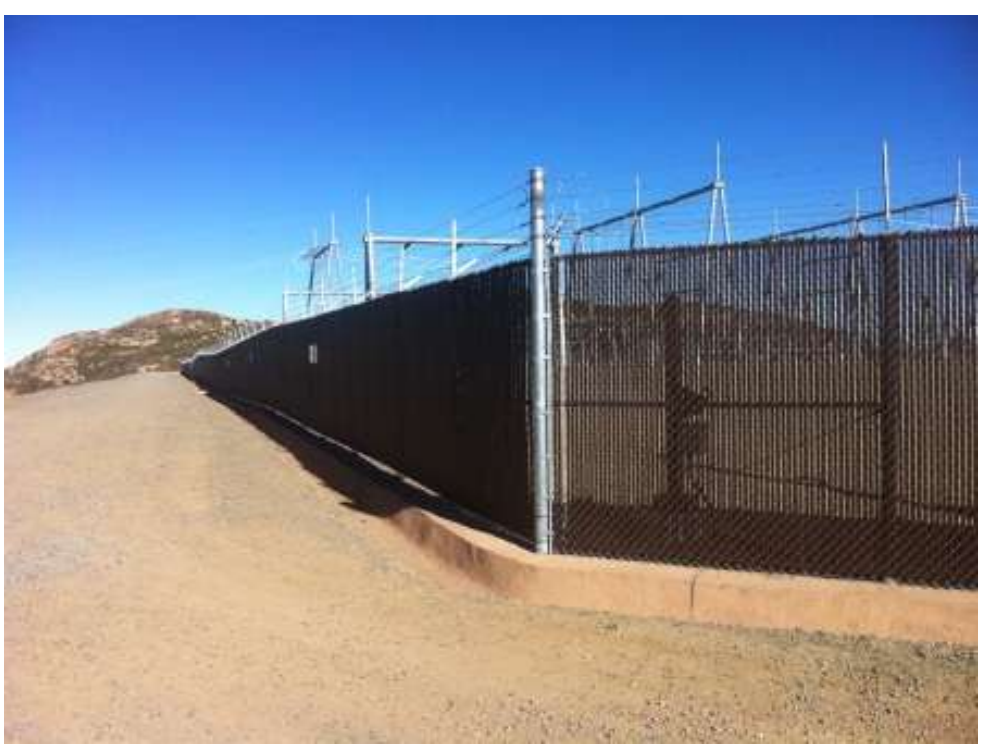
Figure 2: Fence slats installed along the southern side at Suncrest Substation. (Link 3)