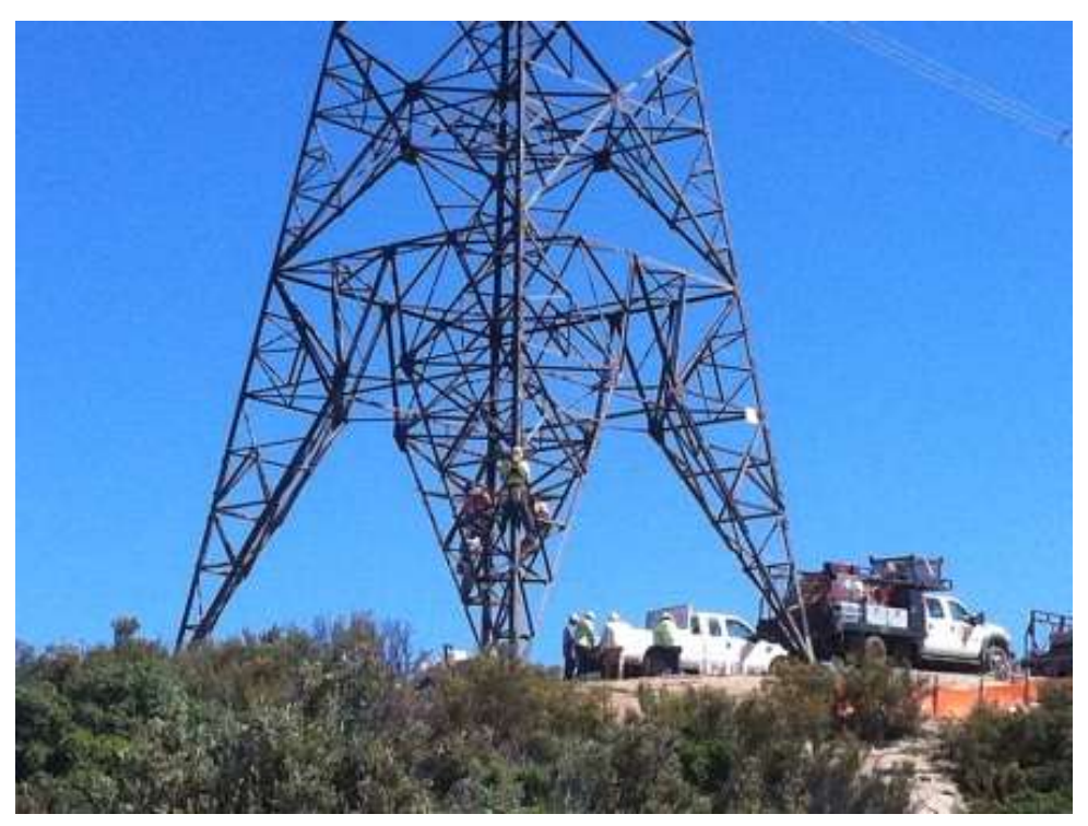
Figure 1: Installing anti-climbing guards at EP126-1. (Link 2)