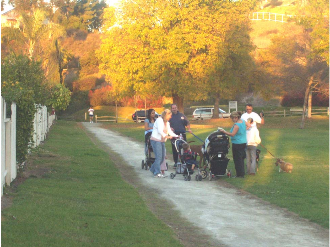
This photo was taken at around 5:00 p.m. Families gather on a daily basis to walk their dogs and babies, and let their children play in the park, our greenbelt.