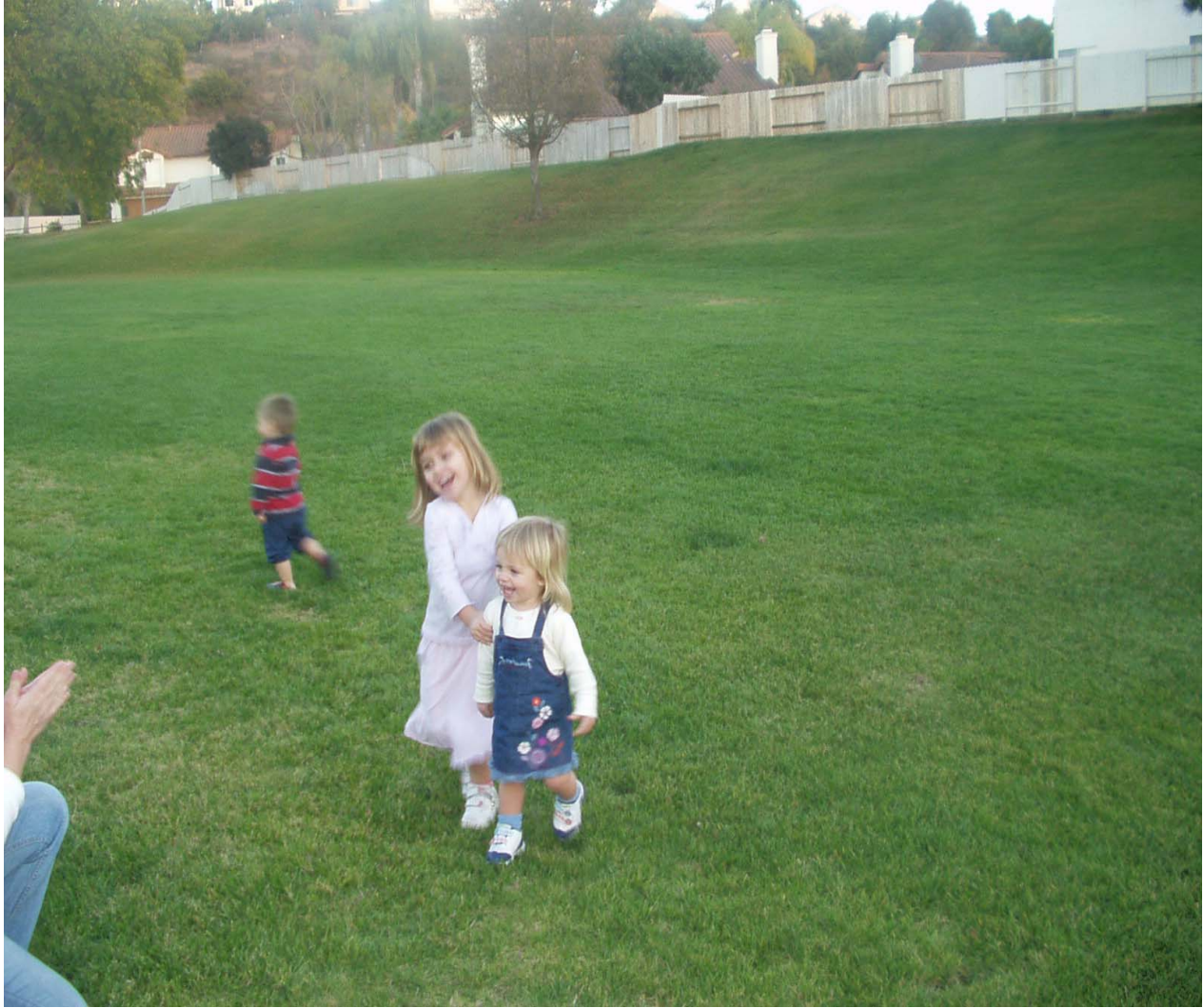
Early afternoon where our families play.