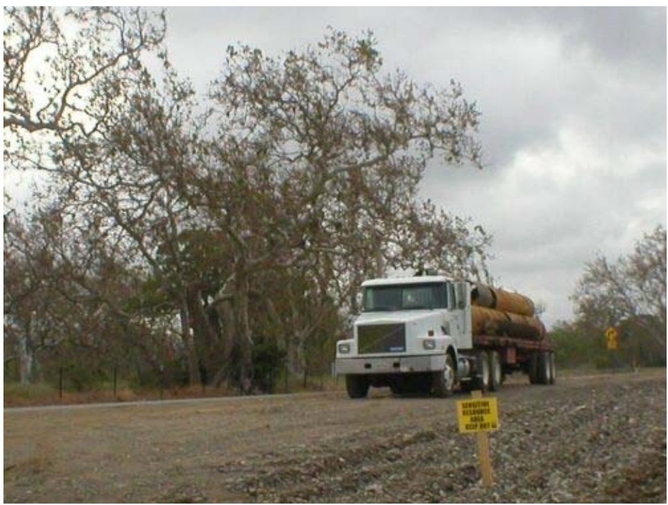
Figure 5 - Project subcontractor truck parked within the Red Tail Hawk exclusion zone. Note the sensitive resource exclusion area sign in the foreground.