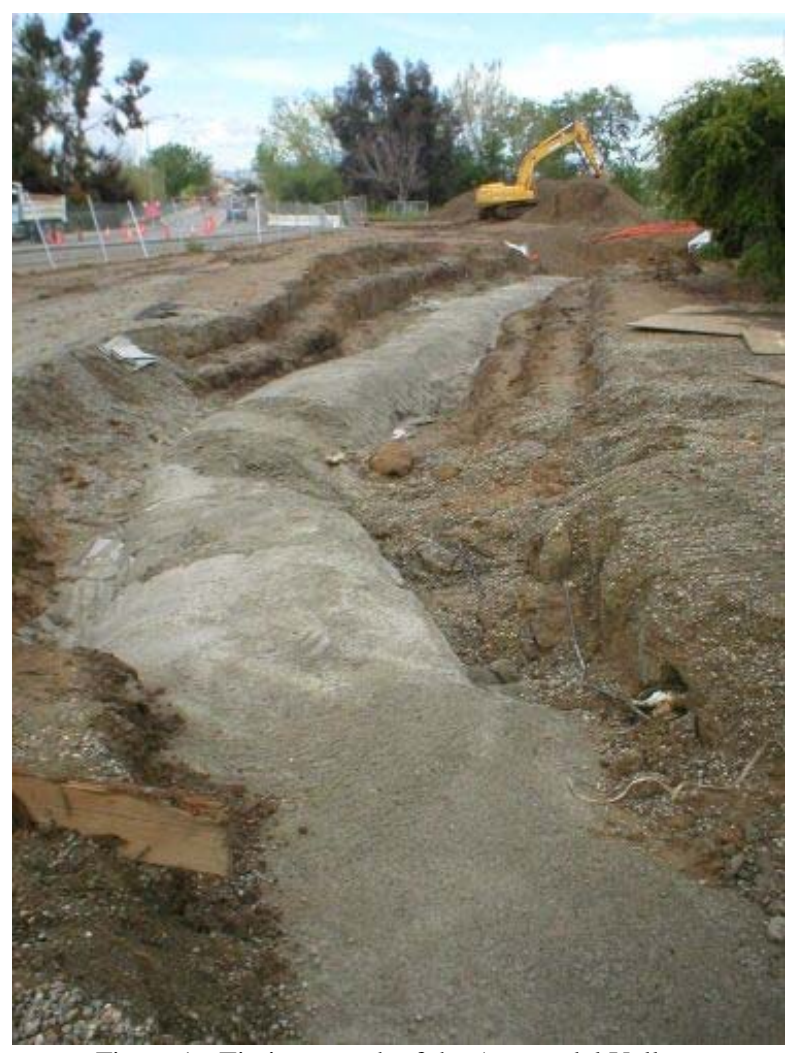
Figure 1 - Tie-in to south of the Arroyo del Valle. Concrete was poured over the conduit.