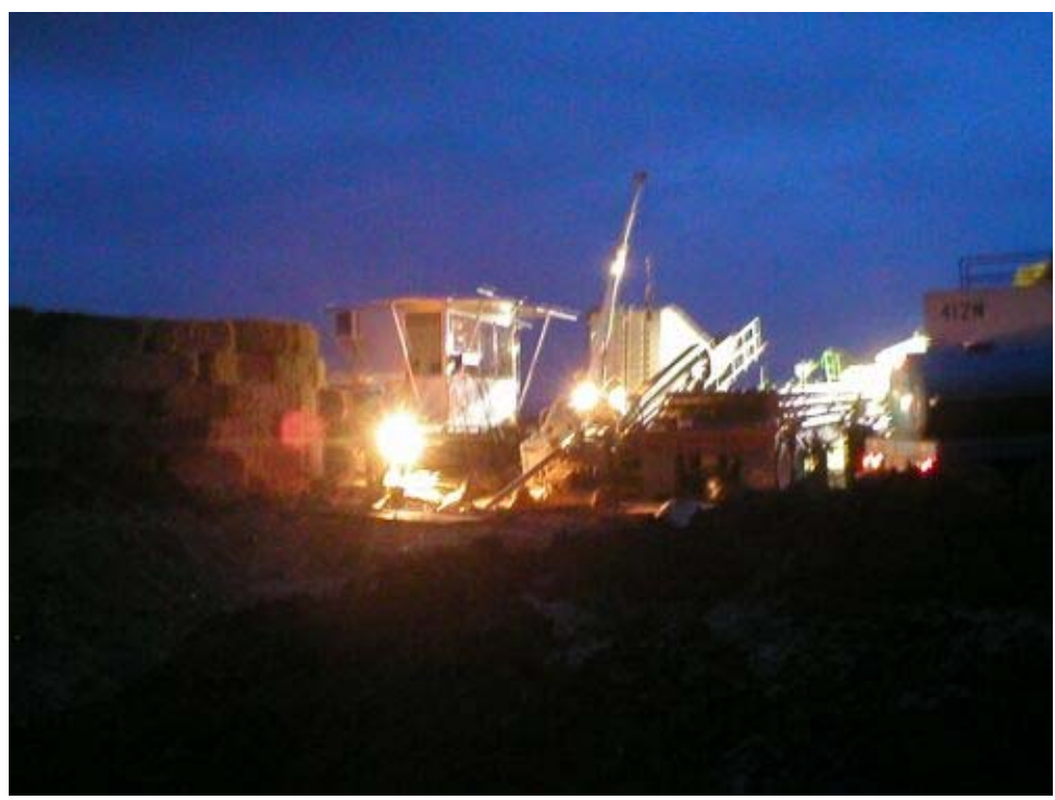
Figure 2 - New Vineyard Road Tributary Bore Rig Lighting