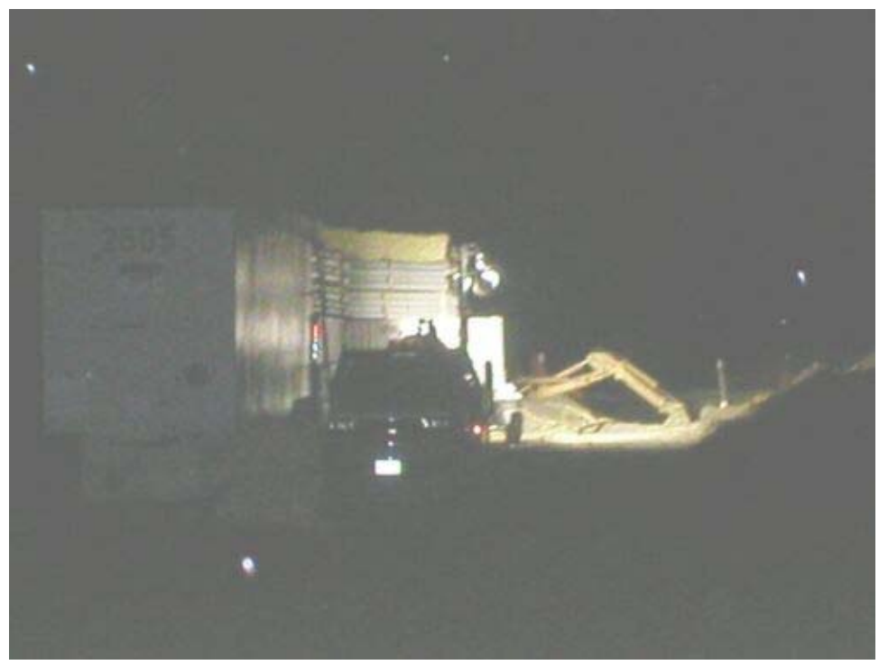
Figure 3 - New Vineyard Road Tributary Bore Exit Pit Lighting.