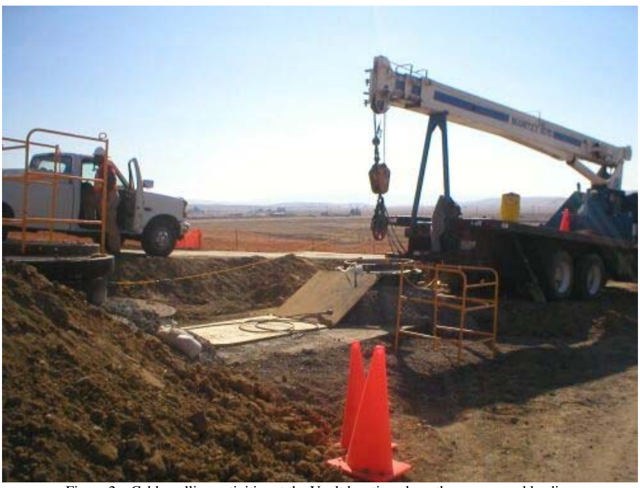
Figure 2 – Cable pulling activities at the Vault location along the access road leading to the Transition Station, Phase Two.