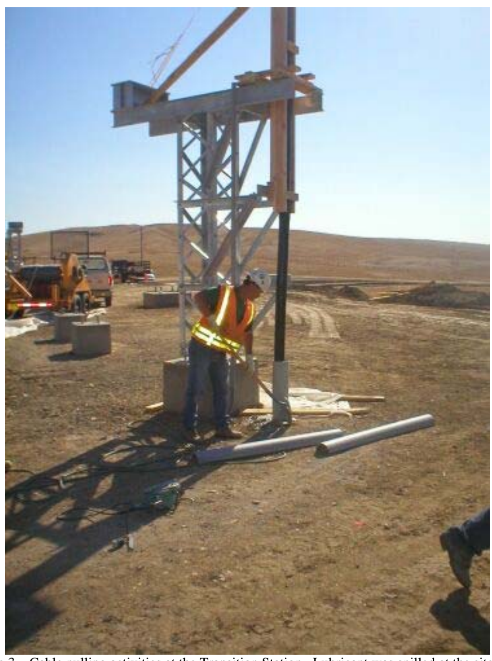
Figure 3 – Cable pulling activities at the Transition Station. Lubricant was spilled at the site and a crewmember promptly cleaned it up, Phase Two.