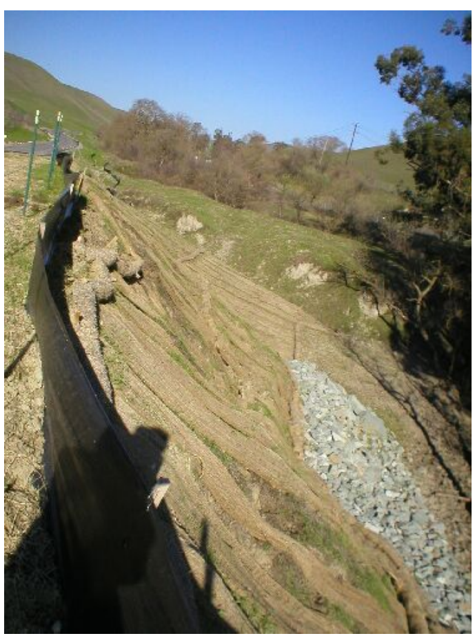
Figure 3 – Tassajara Creek bank stabilization area – February 9, 2006. Note the poor grass growth.