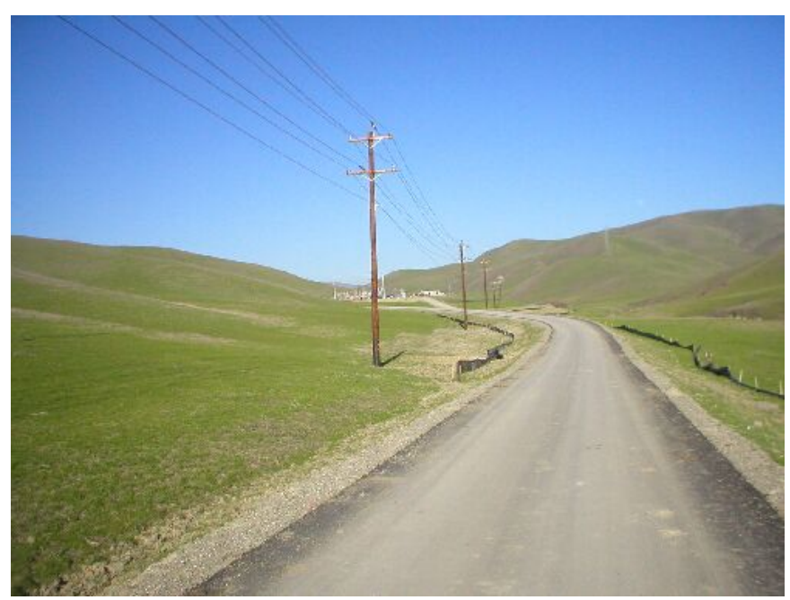
Figure 2 – Moller Road - February 9, 2006. Note the brown areas where grass growth is poor.