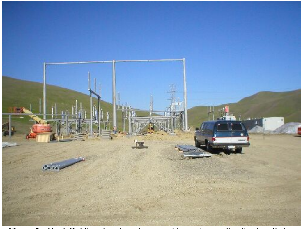
Figure 5 – North Dublin substation where trenching and grounding line installation is occurring - February 9, 2006.