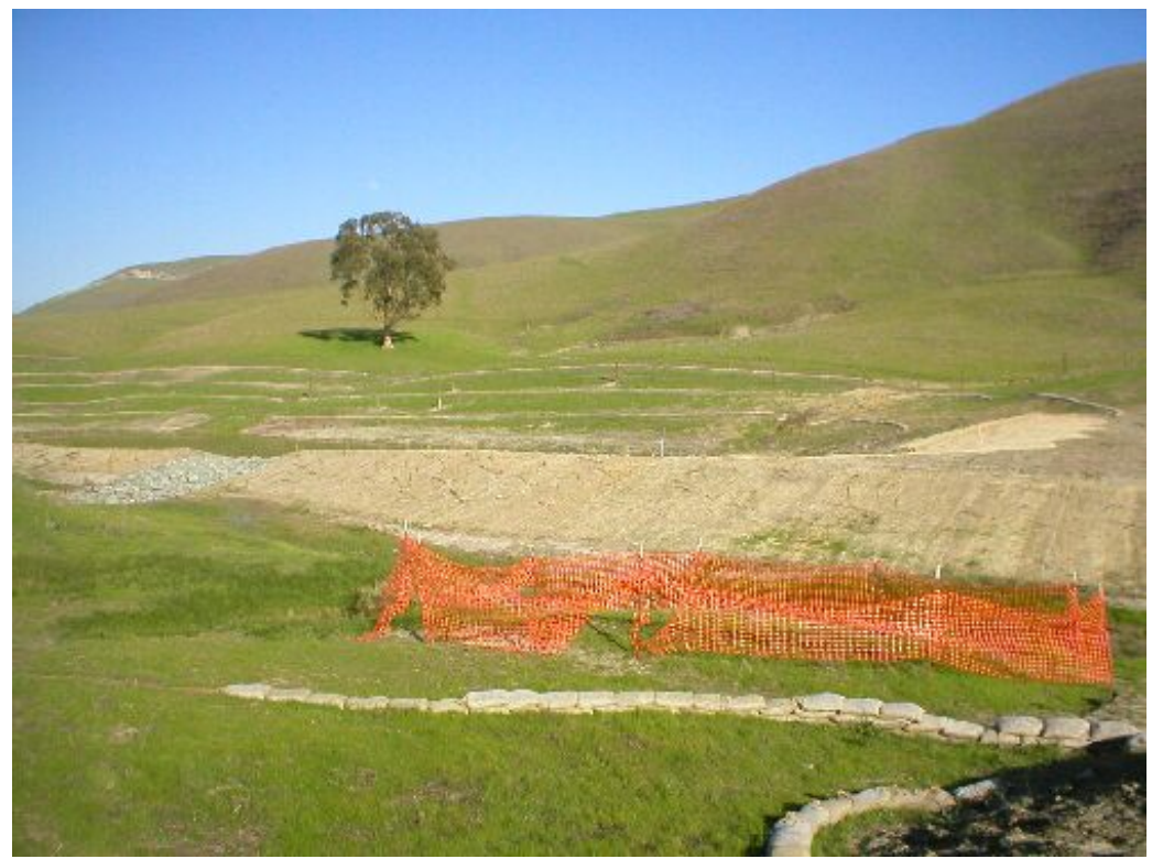
Figure 4 – Mitigation area – February 9, 2006. The pond is now holding water, but is not visible in the photo.