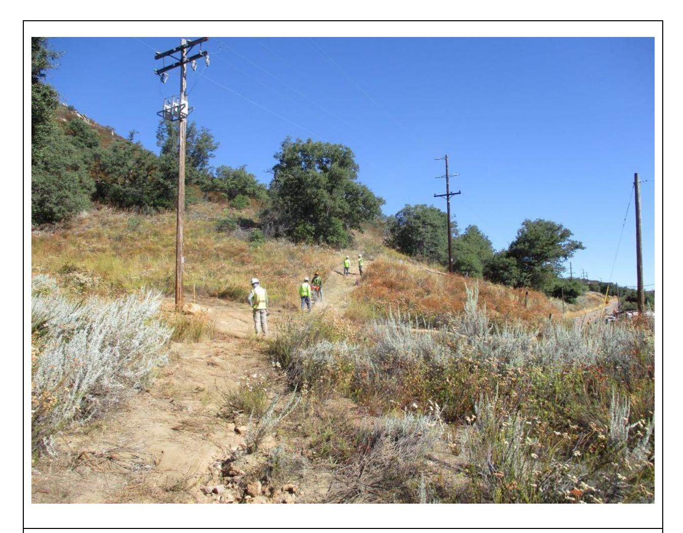
Photo 2: During mowing the construction only access to Pole Z272982 (TL 625C), a crew was observed mowing only within the approved and delineated road in accordance with MM BIO-1, and a biological monitor was observed present on site for vegetation clearing work in accordance with MM BIO-3.