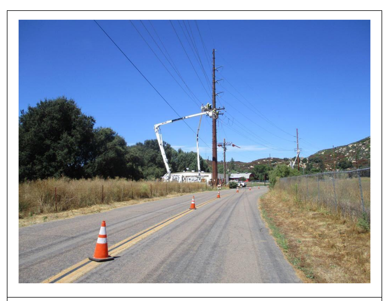
Photo 6: Construction crews observed dead-ending 12 kV lines at Pole Z872453 and Pole Z872452 (TL 629A). A Pro Traffic crew directed one-way traffic around staged equipment on River Drive in accordance with APM TRANS-02.