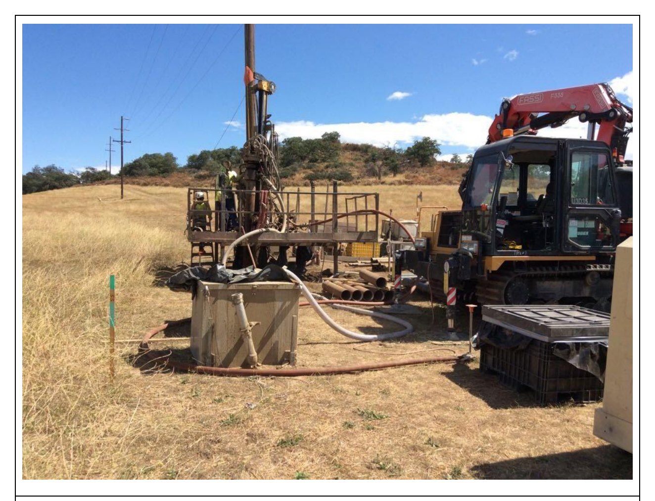
Photo 1: During drilling for a micropile foundation at Pole Z272950 (TL 625C), a crew was observed using a containment box to trap drill cuttings and reduce dust emissions from drilling in accordance with APM AIR-05.