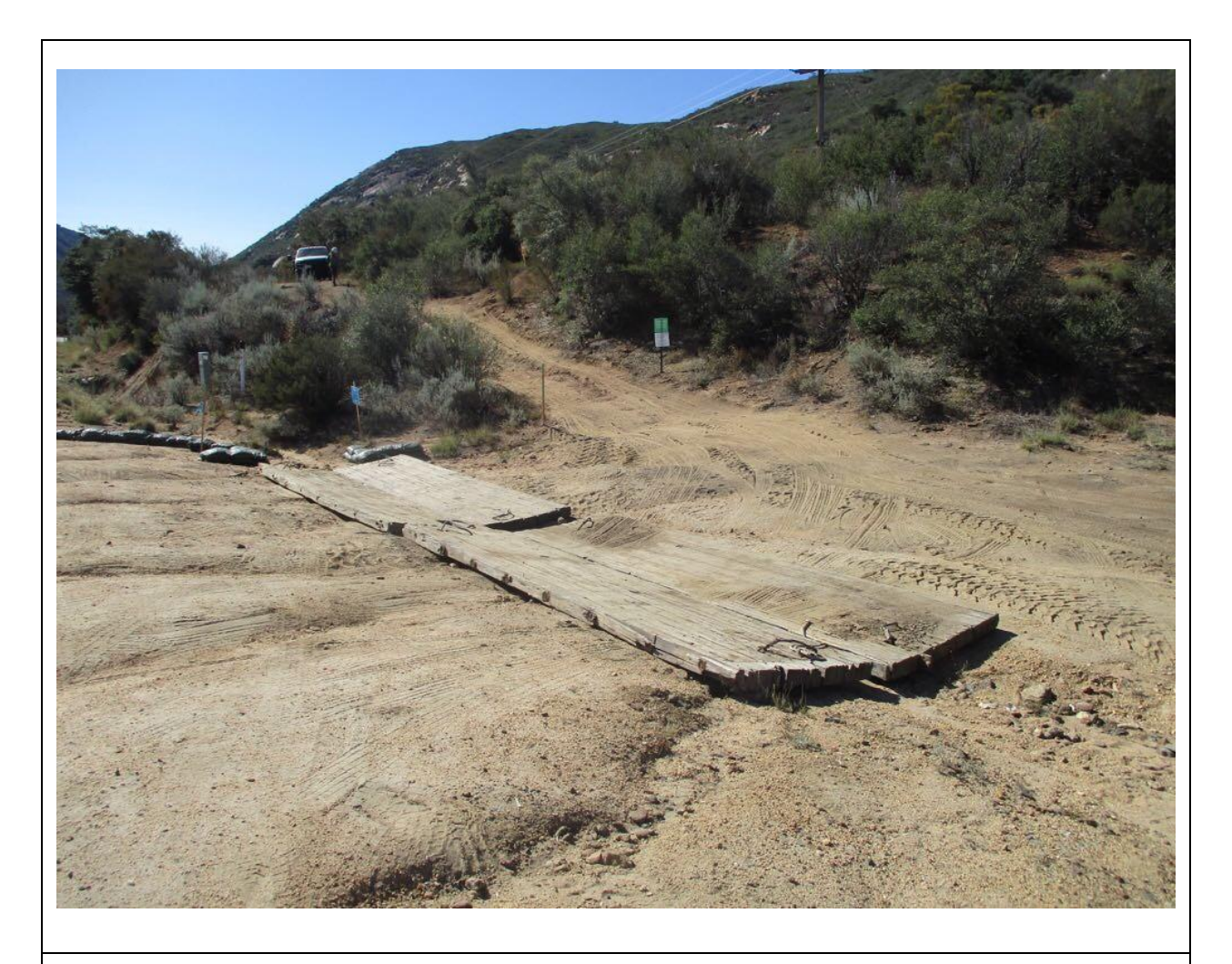
Photo 5: During micropile drilling at Pole Z40255 (TL 629A), a jurisdictional drainage crossing along the site access road was flagged, gravel bags were installed, and timber mats were used to prevent impacts to the stream channel in accordance with APM HYD-06.