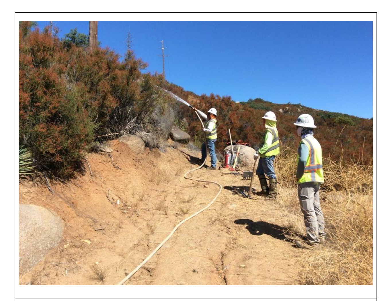
Photo 4: In preparation for vegetation clearing and chipping at Pole Z272992 (TL 625C), the area was wet down in accordance with the CFPPP Fire Matrix (MM FF-1) for chipping work on private land with a FPI of Elevated.