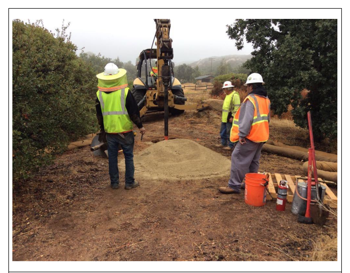
Photo 3: During pole anchor excavation on TL 625C, archaeological and cultural monitors were observed inspecting the excavation in accordance with the HPMP (MM CUL-1) and APM CUL-04.