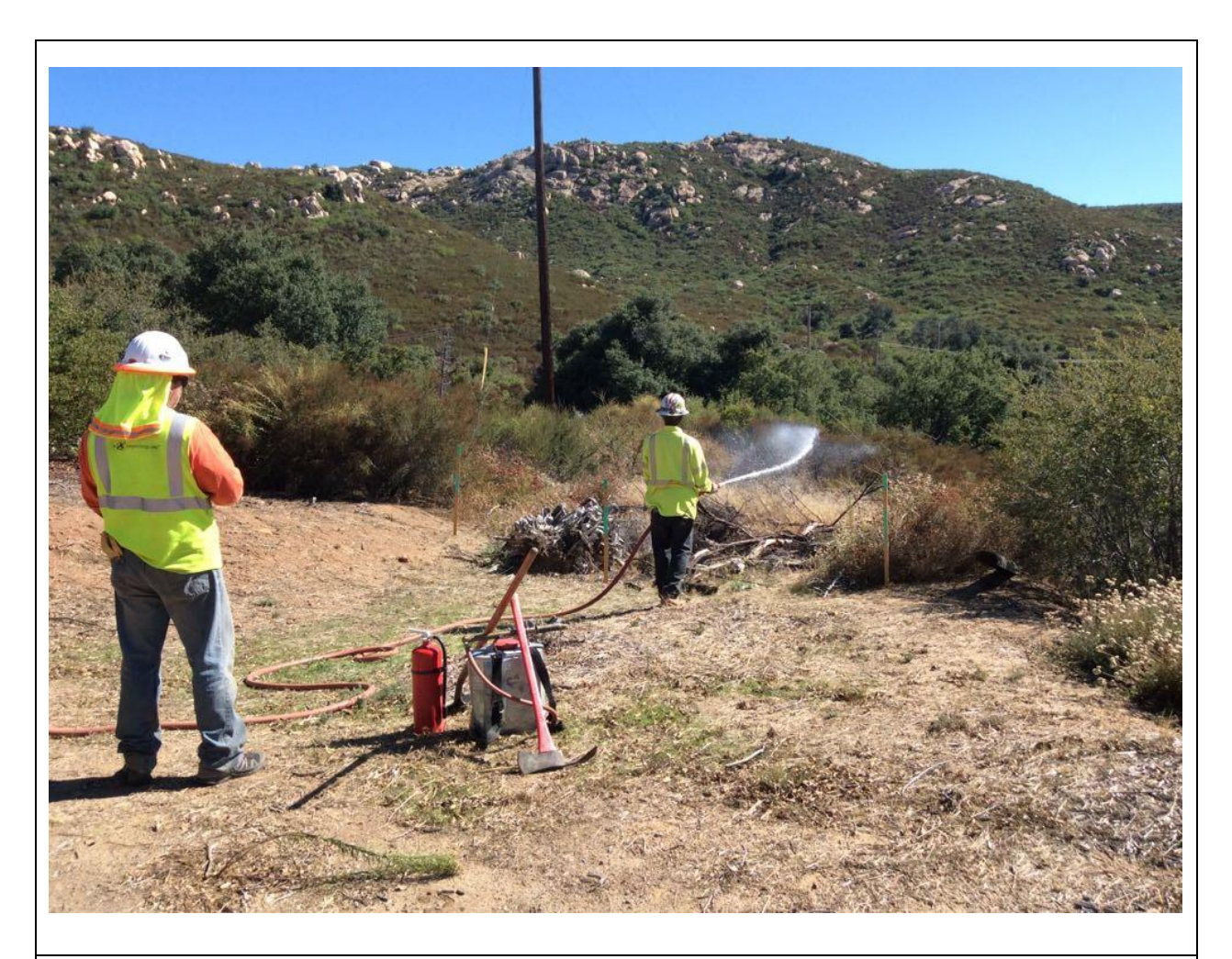
Photo 4: In preparation for vegetation clearing and chipping on the access road to Pole P119857 (TL 625C), the area was wet down in accordance with the CFPPP Fire Matrix (MM FF-1) for chipping work on private land with a FPI of Elevated.