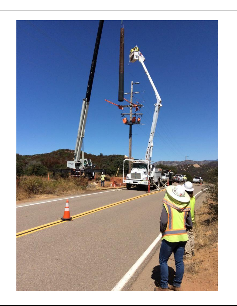
Photo 2: During pole base setting at Pole Z272930 (TL 625C), a Biological Monitor was observed monitoring the activity to ensure compliance with mitigation measures, applicant proposed measures, and permit conditions in accordance with MM BIO-22.