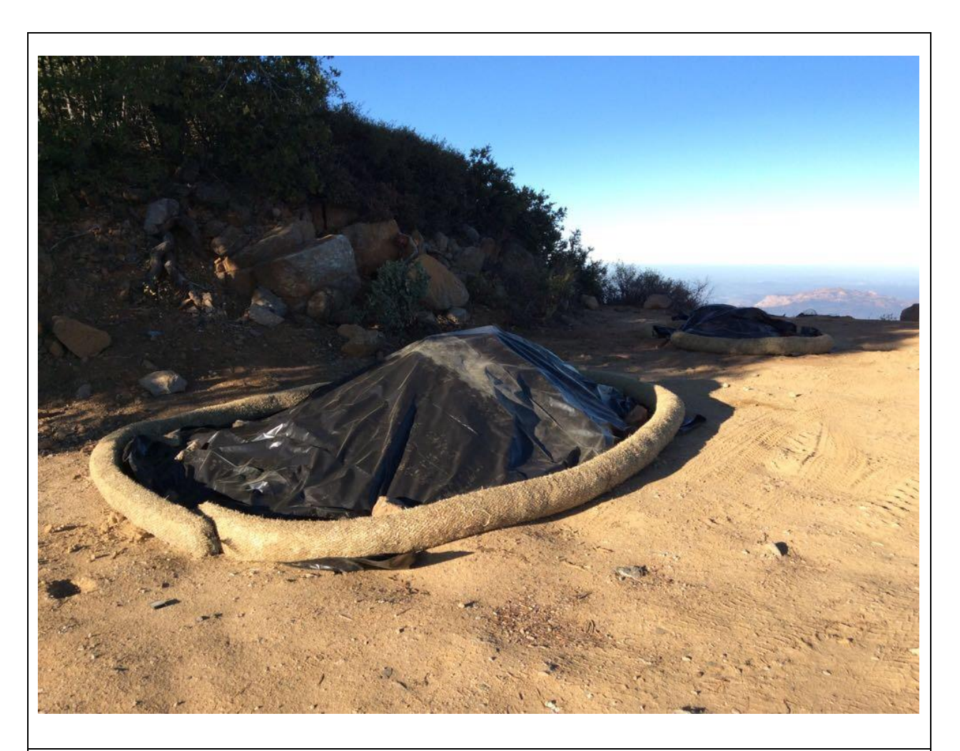
Photo 5: Dirt stockpiles staged within a stringing site on Lookout Road (C 79A) were covered with plastic sheeting and surrounded by fiber rolls in accordance with the Erosion Control Plan and Storm Water Pollution Prevention Plan (MM HYD-01, MM BIO-7), and APM HYD-09.