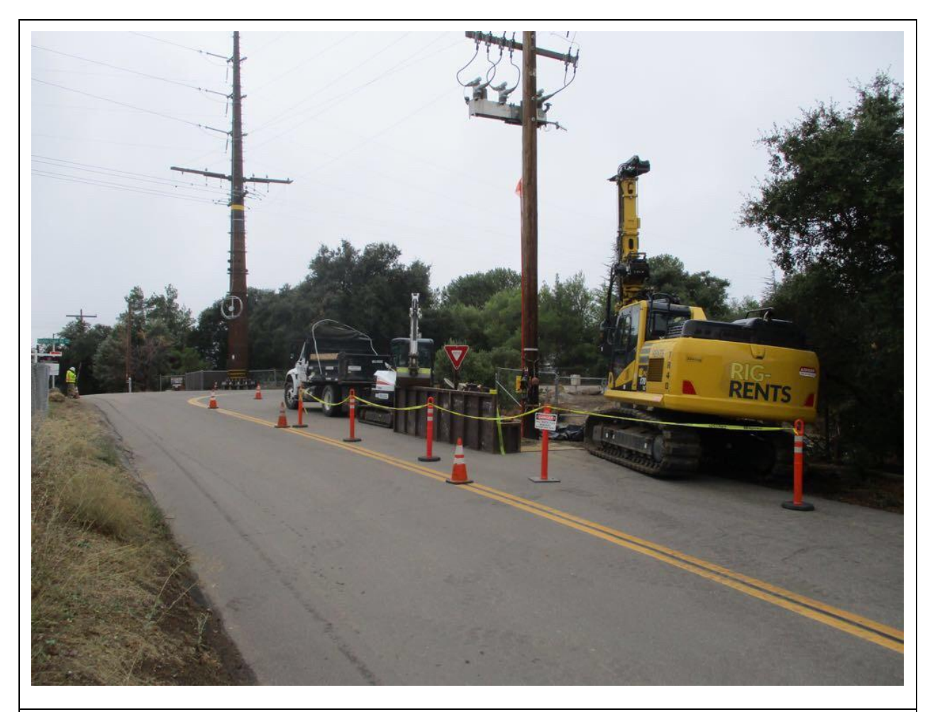
Photo 1: During direct bury pole hole drilling at Pole Z172738 (TL 629A), the crew was observed exporting spoils using a haul truck with a load cover in accordance with APM AIR-02.