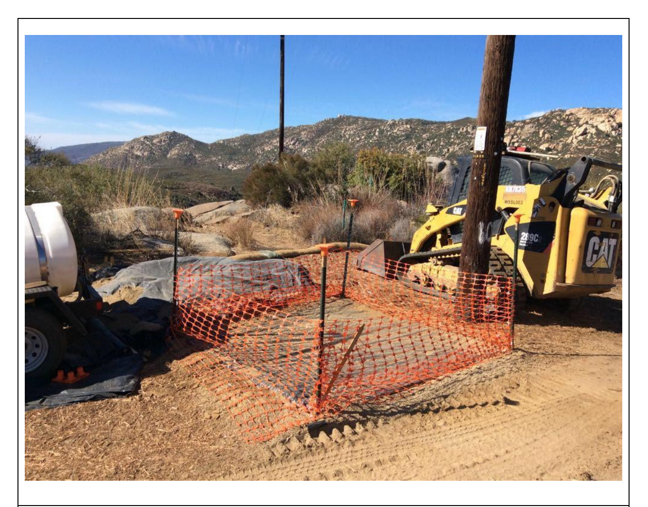
Photo 2: The pole hole at Pole Z273006 (TL 625C) was observed to be securely covered to prevent wildlife entrapment in accordance with MM BIO-23.