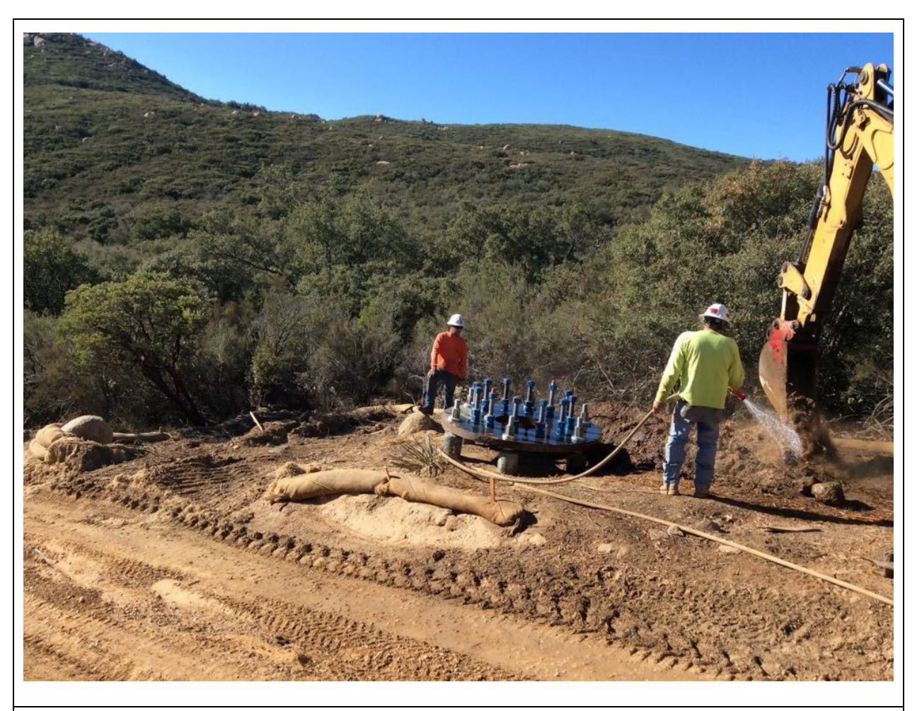
Photo 1: A crew at Pole Z293927 (TL 625C) was observed using water to minimize dust emissions during ground rod trenching in accordance with APM AIR-05.