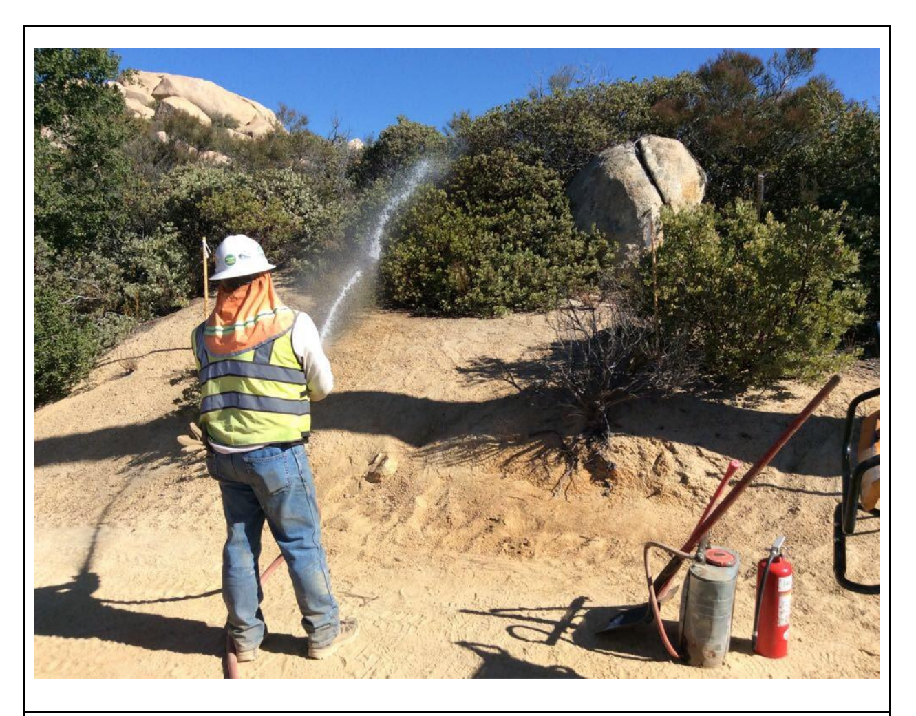
Photo 4: A crew member was observed wetting down vegetation prior to removal and chipping at Pole Z273018 (TL 625C) in accordance with the CFPPP Fire Prevention Matrix for the activity on NFS land with a Project Activity Level (PAL) D. In addition, a complete set of fire tools was observed on site.