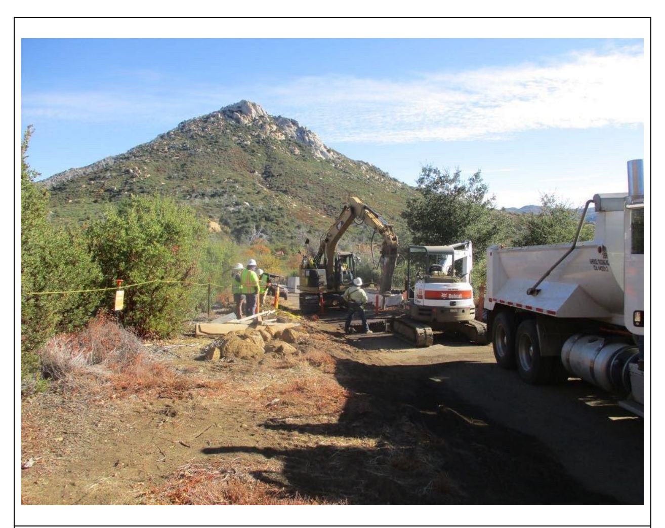
Photo 3: Along C 79A, project personnel were observed avoiding a clearly delineated cultural ESA in an area with cultural and/or historical resources in accordance with APM CUL-03, the HPMP, and MM CUL-1. Additionally, Archaeological and Cultural Monitors were present to monitor excavations in accordance with the HPMP, MM CUL-1, MM CUL-3, and APM CUL-04.