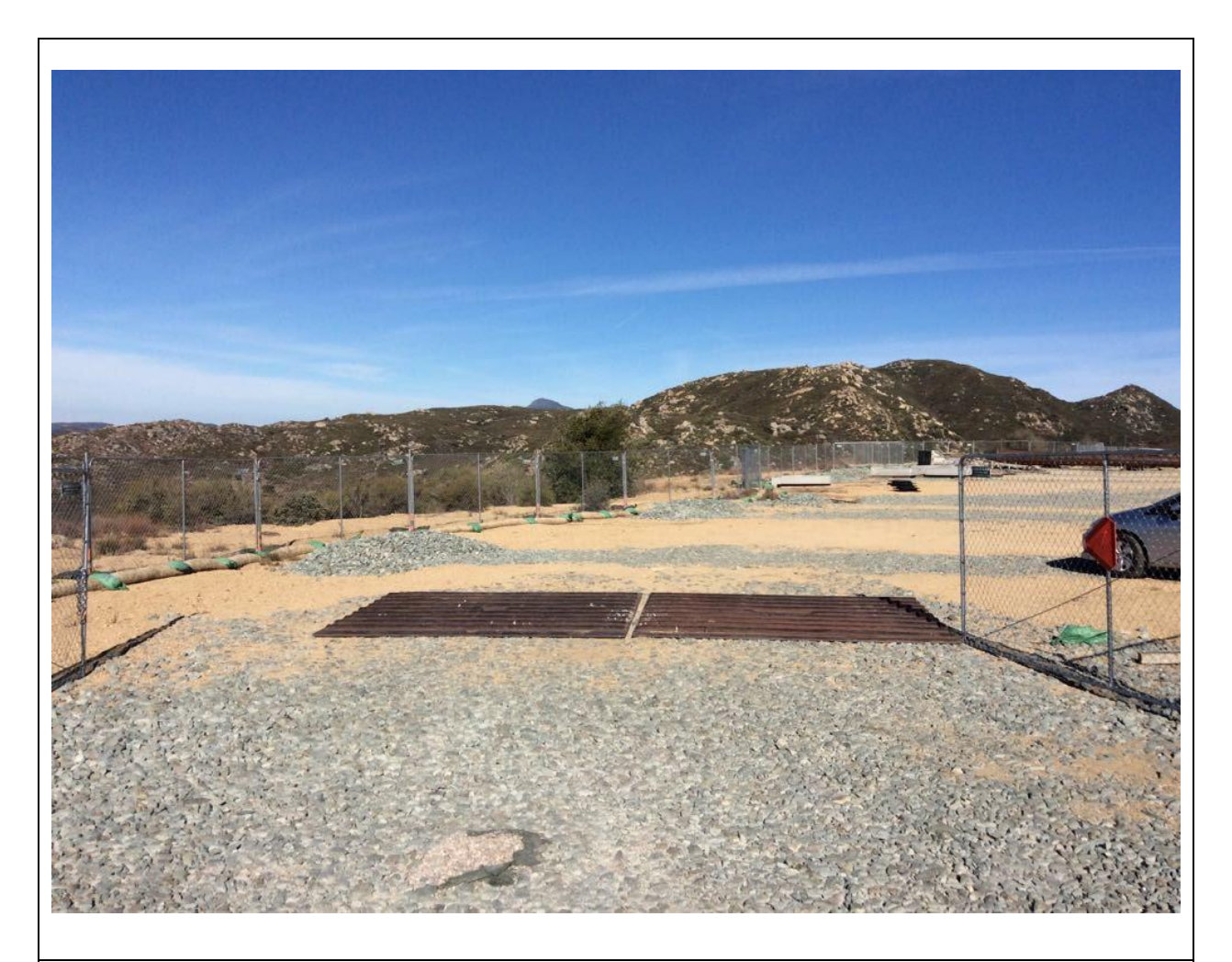
Photo 5: The entrance to Staging Yard 2A (C 440) was observed to be stabilized with rattle plates and rock aprons in accordance with project Erosion Control Plan (ECP), SWPPP (MM HYD-01, MM BIO-7), and APM HYD-09.