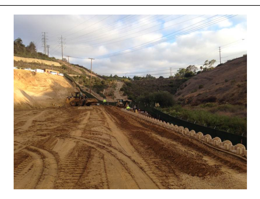
Photo 3: Construction activities associated with erecting the retaining wall along the eastern project limits continued during this reporting period.