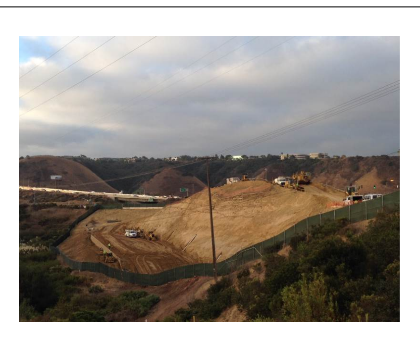
Photo 1: Overview of the Mira Sorrento Substation looking southwest from Mira Sorrento Place.