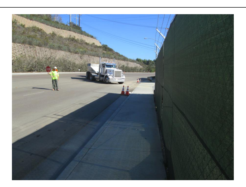
Photo 4: In accordance with MM-TT-1, a flagger was observed along Mira Sorrento Place directing construction traffic during deliveries of fill material to the project site

Photo 3: A street sweeper is being utilized along Mira Sorrento Place to minimize trac-out along paved roadway surfaces.