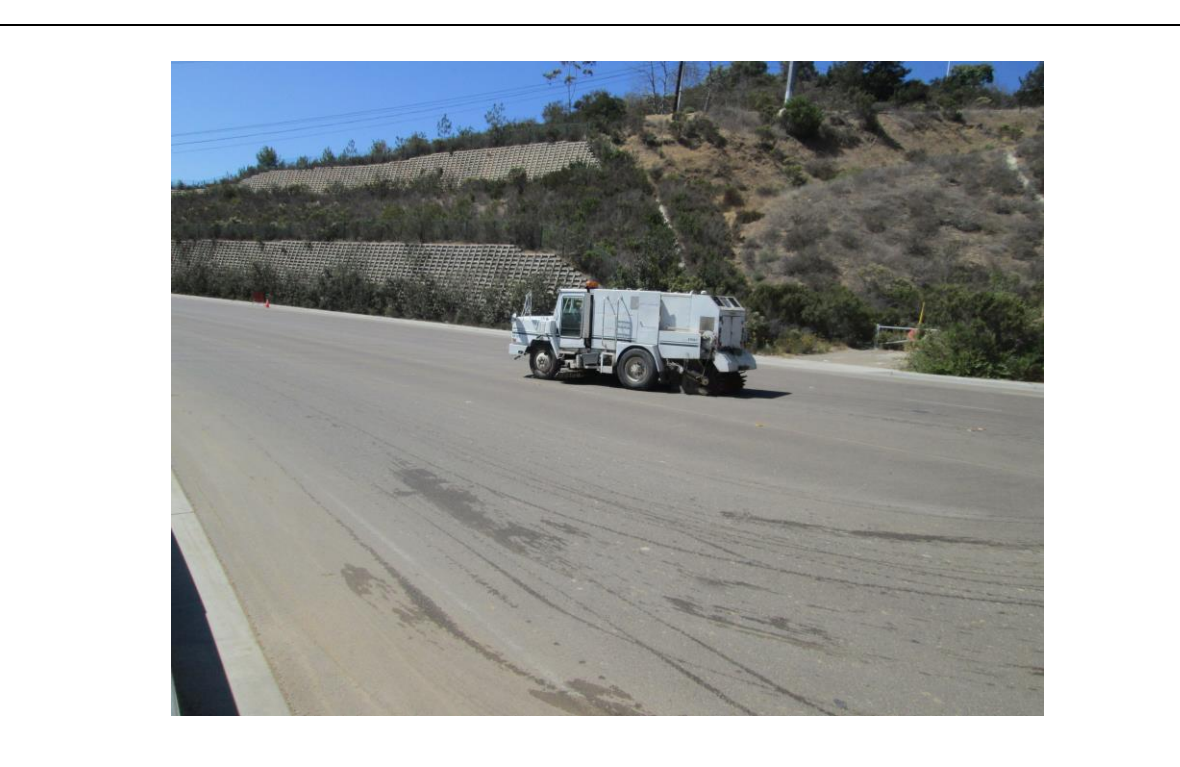
Photo 3: A street sweeper is being utilized along Mira Sorrento Place to minimize trac-out along paved roadway surfaces.