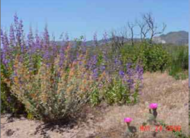
Variation in plant species and structure provides visual contrast; seasonal color of flowers is appealing. Rich color combinations are common.