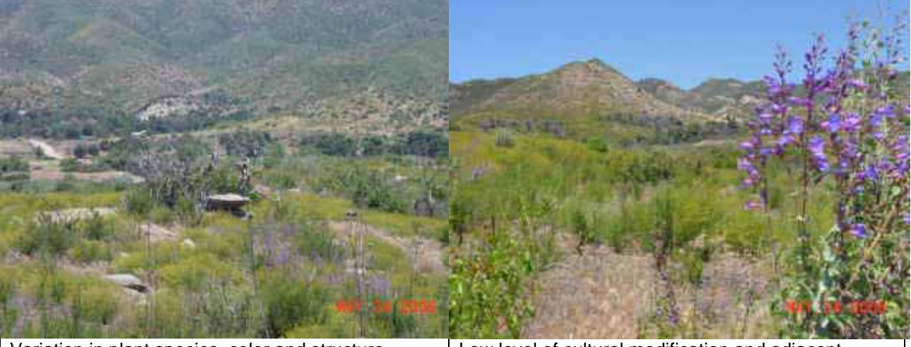
Variation in plant species, color and structure provides visual contrast. Dirt road cuts contrasts moderately with adjacent non-disturbed areas in color and texture.

High variety of forms, line, color, pattern, and texture; seasonal color adds to visual interest.