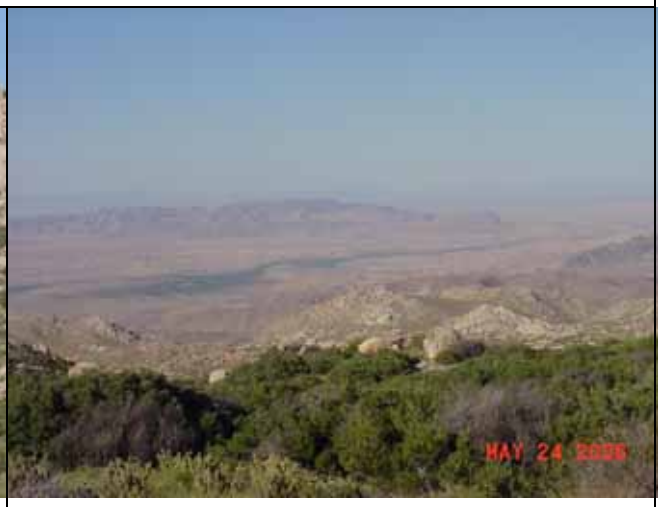
Drier, more rugged terrain in transition zone to Carrizo Gorge Wilderness area.