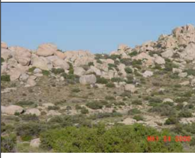
Rugged terrain of boulders and rock outcrops, and contrasting colors and texture of vegetation patterns.