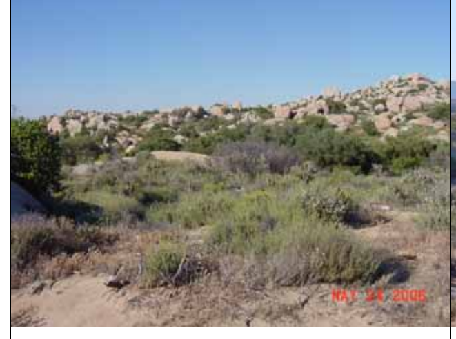
Boulders and relatively dense vegetation near Sacatone overlook area. Patches of less dense vegetation and lighter colors provide visual contrast.