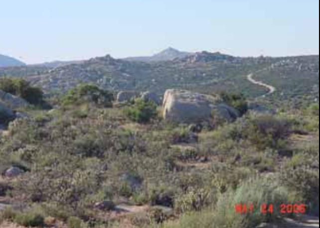
Distant road cut contrasts with adjacent nondisturbed areas in color and texture (view north).