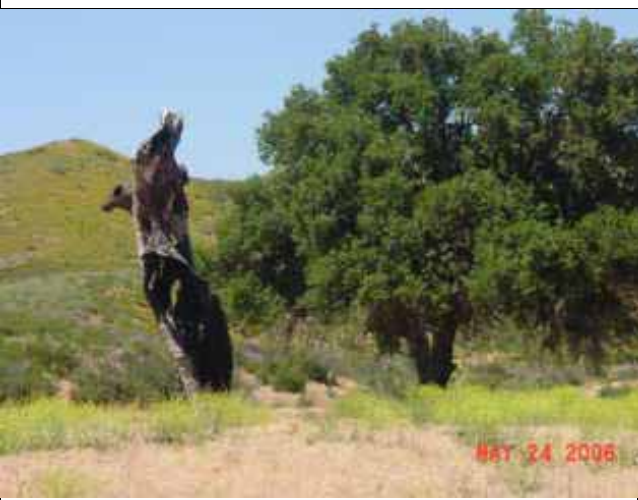
Large oaks and snags, particularly in the Grapevine Canyon / east side, provide visual interest, raptor nesting areas, and contribute to overall scenic quality.