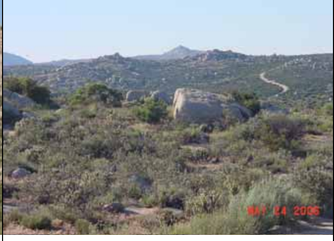
Views east of steep slopes, rugged terrain, and texture of vegetation patterns.