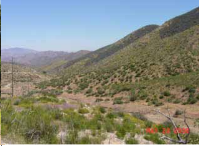
Area appears to receive relatively light use and vegetative cover is mostly intact. Overhead lines and poles are visible but do not dominate. Most of the area is highly visible in the foreground view from County Route S2, and from the unpaved roadway that follows Grapevine Canyon.