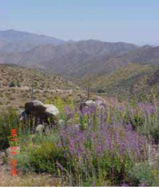
Dirt road cuts contrasts with adjacent non-disturbed areas in color and texture but do not dominate. Openness of landscape allows views of distant remote mountains.