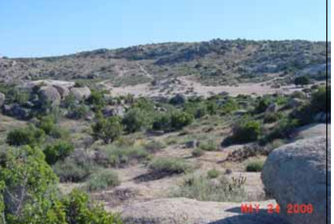
Boulders and relatively dense vegetation near Sacatone overlook area. Patches of less dense vegetation and lighter colors provide visual contrast.