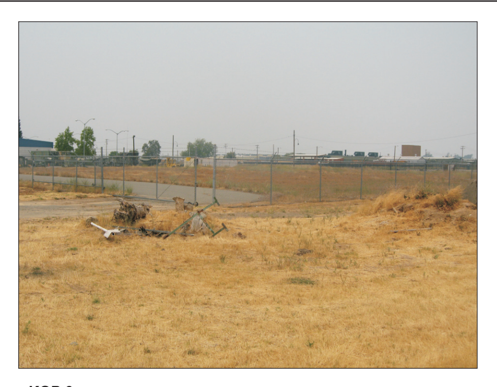
KOP 6: View of compressor station site looking northwest from Army Depot Park baseball fields.