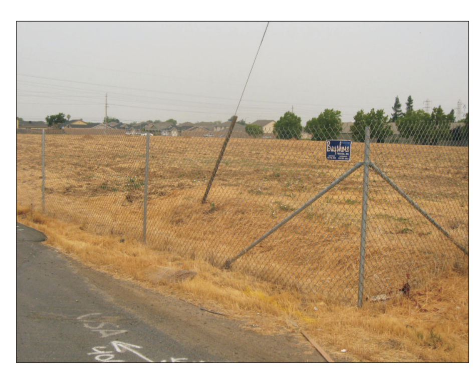
KOP 5: View looking northwest from east end of Junipero Street toward Glen Elder neighborhood.