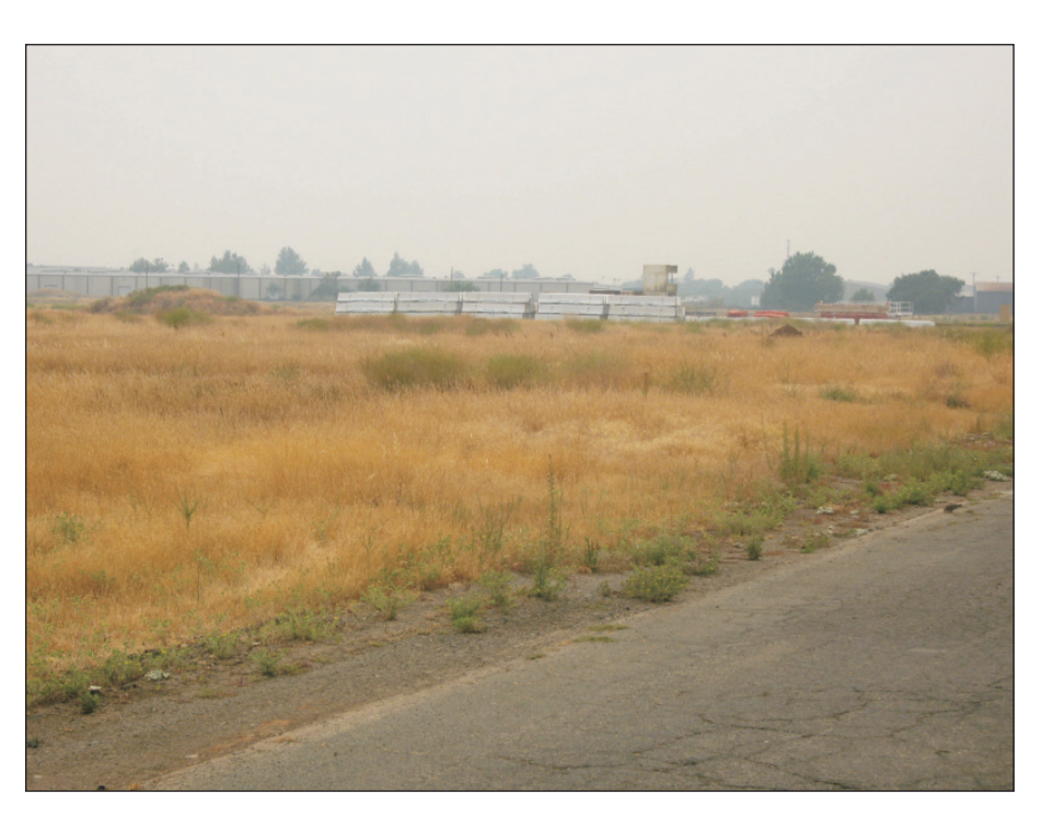
KOP 8: View looking southwest from road north of Site.