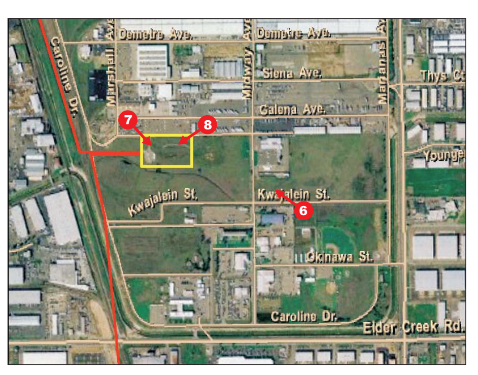
Compressor Station Site KOP Key Map