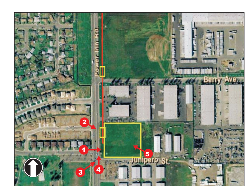
Wellhead Site KOP Key Map