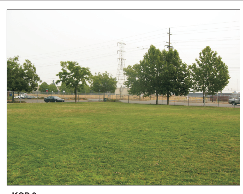
KOP 3: View toward wellhead site from Danny Nunn Park looking northeast.