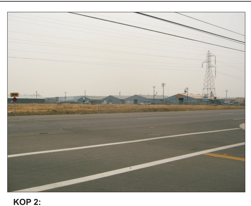
View toward wellhead site from front yard of residences on Othel Court looking southeast.