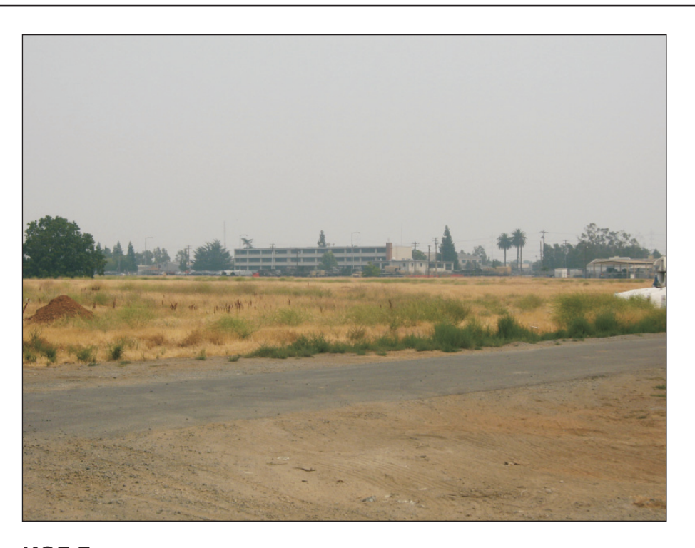
KOP 7: View looking southeast from road north of Site.