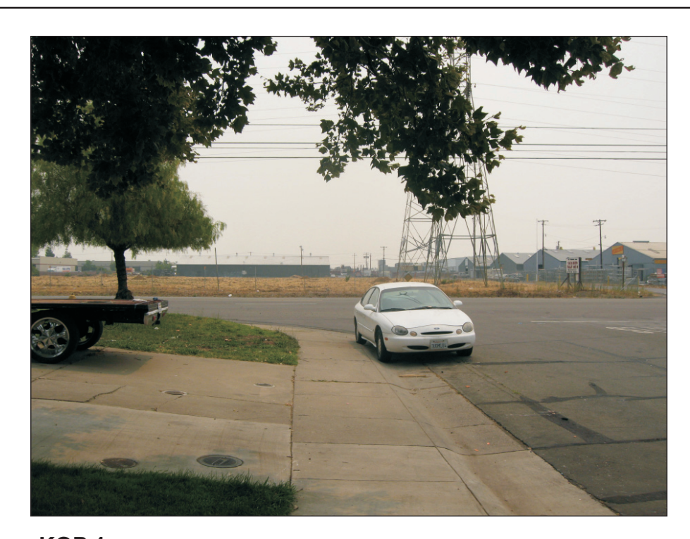
KOP 1 : View of wellhead site from front yard of residences on 53rd Avenue looking east.