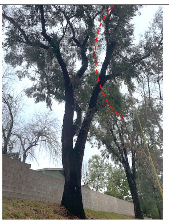
B. Eucalyptus between TC-02 and TC-03