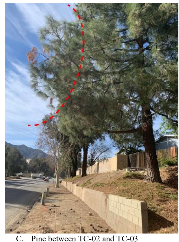
Pine between TC-02 and TC-03