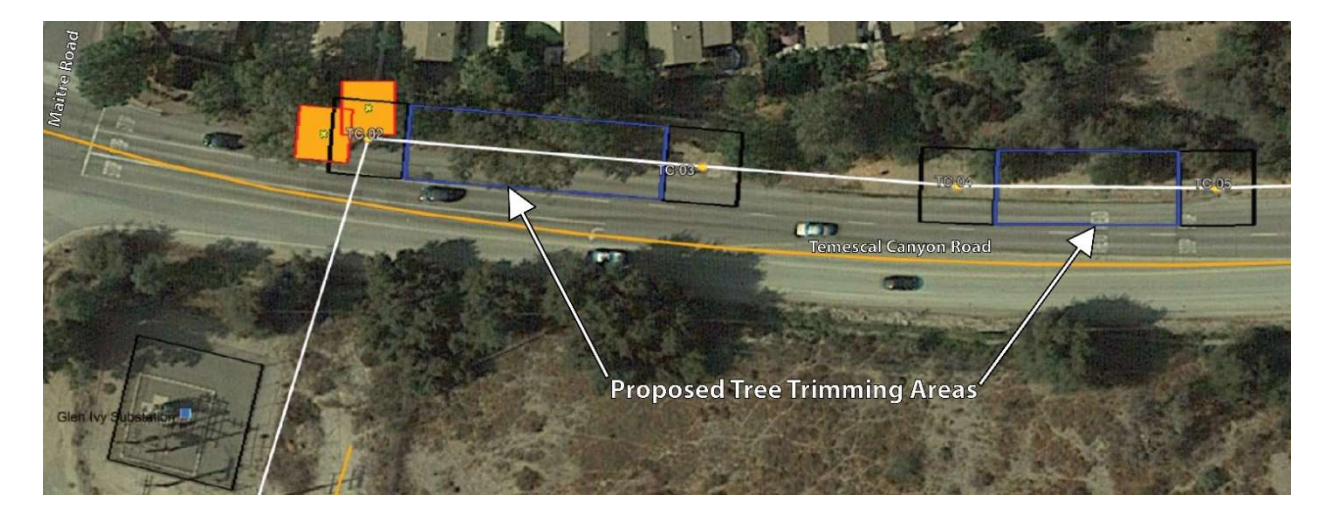
Figure 1. Proposed Work Areas Associated with MPR No. 10.