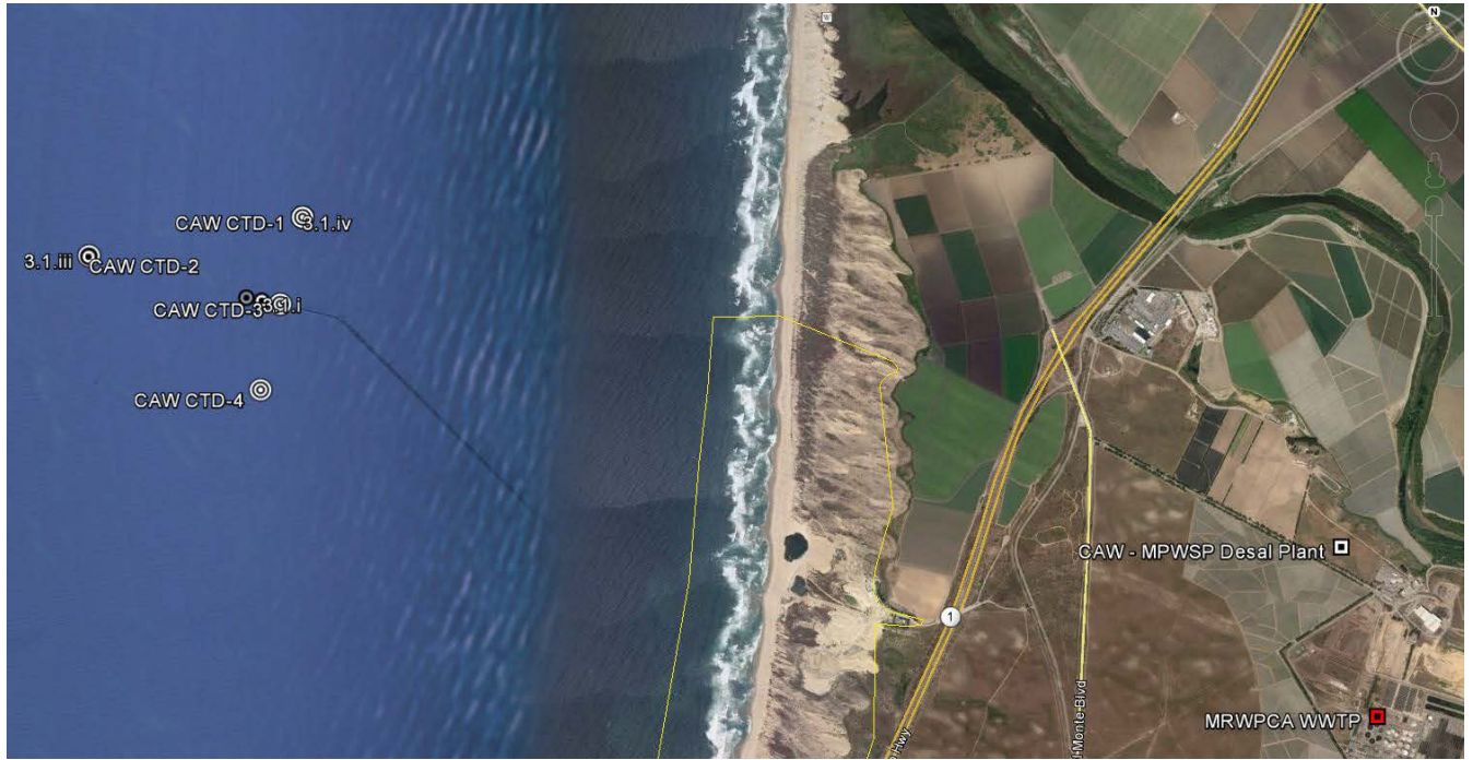
Figure 1 – Overall View